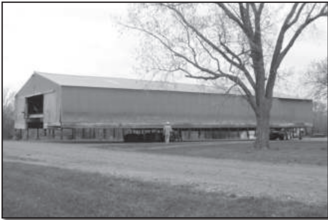
Moving old shed to make room for new facility.