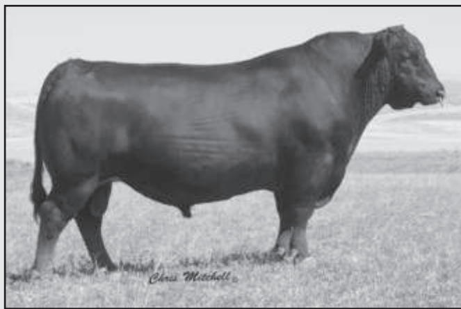
Nichols Extra K205