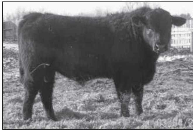
S A W Neutron Traveler 9113 - Lot 46

We are well pleased with the calves from our own SAW Resolution Traveler 6067 bull, a Traveler 004 son. They are performing well with the rest of the group, posting good ADGs and adjusted weaning and yearling weights.