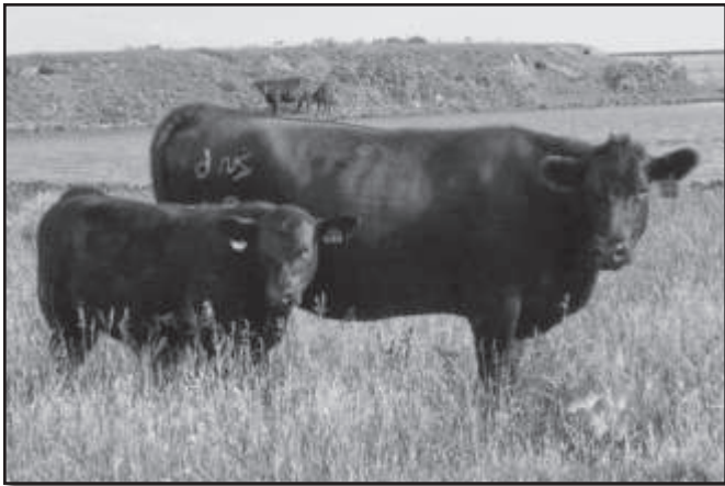
S A W Net Present Value 9088 - Lot 24 with his dam.