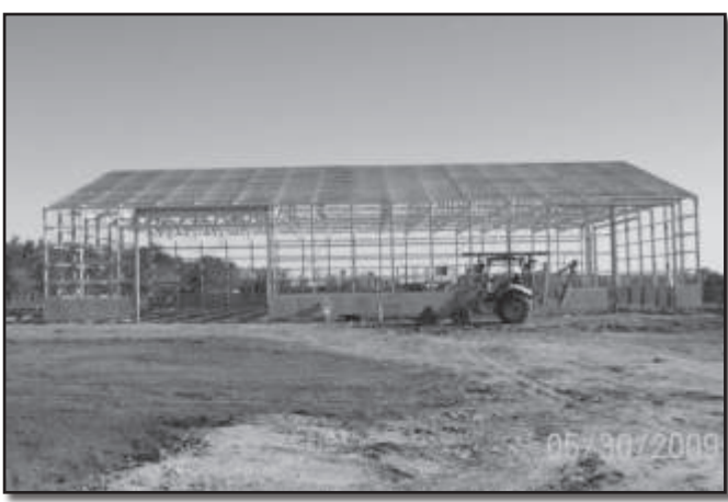
Construction of new sale barn/shop/cattle facility.

ADG 3.8. Dam's eighth calf. A bull with a lot of length, strong maternal and great carcass numbers, especially IMF.