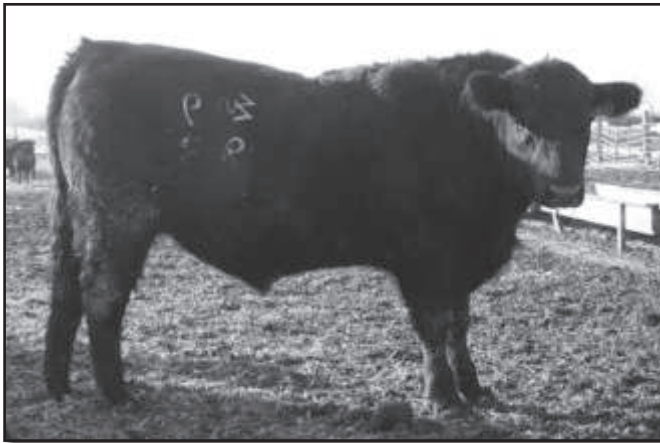
S A W Retail Fame 9093 - Lot 41