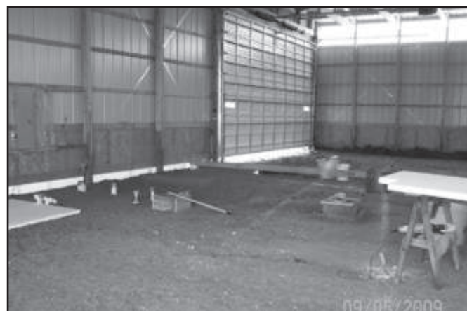
Beginning interior work on the shop...initial plumbing.

ADG 3.44. Dam's seventh calf. Borderline heifer bull. I'd recommend him for second calvers and older cows.