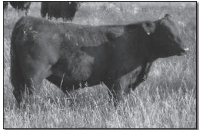
S A W Extra Value 9139 - Lot 7