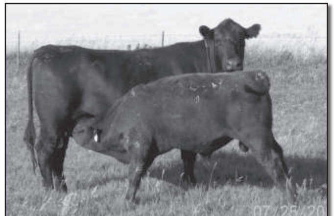
S A W Lead On 9163 - Lot 32 with his dam.

ADG 3.58. Dam's first calf. Recommended heifer bull. Here's a favorite of mine with the combination of Lead On on top and Final Answer on the bottom. This is one all-around great heifer bull. He is out of a first calver who was one of the first to calve this year.