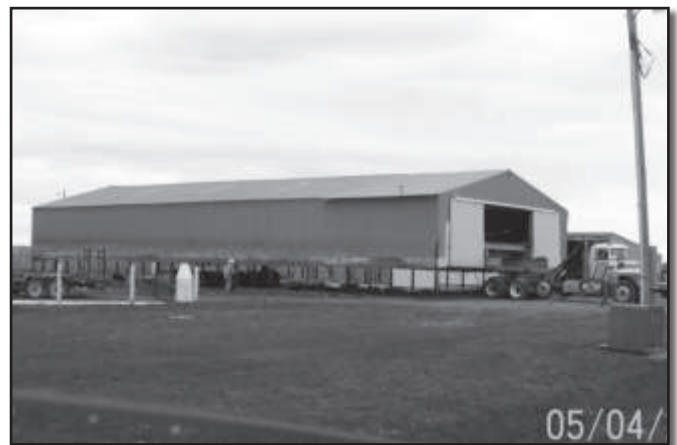
Moving old shed to make room for new facility.

This is one of the thickest Extra K205 bulls we have to offer. He'll make a great cow bull.