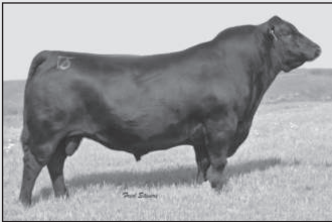
Sinclair Net Present Value