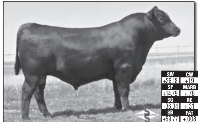
Connealy Lead On