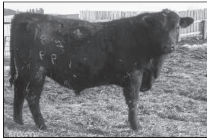
S A W Final Answer 9099 - Lot 29

ADG 3.92. Dam's fifth calf. Borderline heifer bull. This bull offers a very good growth curve from 1+1.2 Birth Weight EPD to 1+95 Yearling Weight EPD.