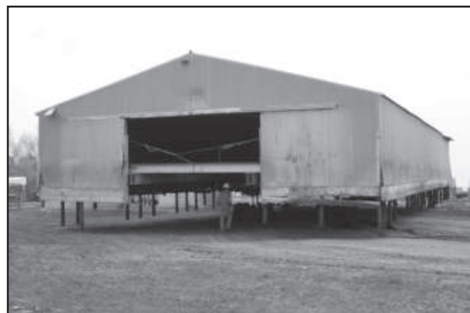
Moving old shed to make room for new facility.

This bull is out of one of our older cows. She has great maternal traits and is a perfect uddered cow. He will be a great bull to keep heifers out of.