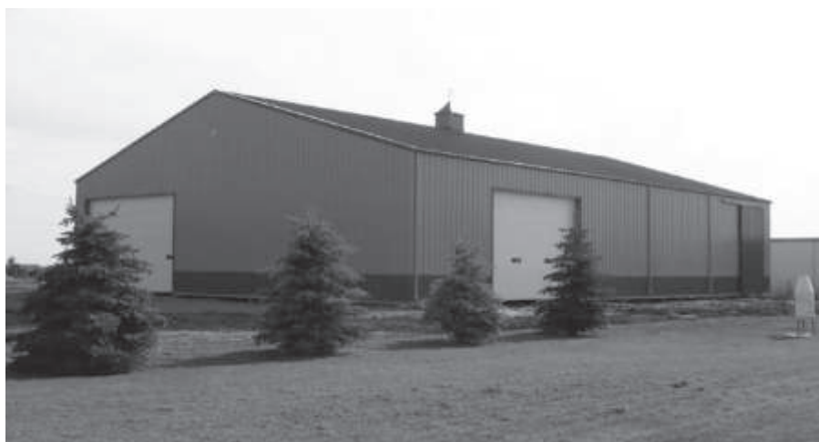
New Sale Facility

PLEASE BRING THIS SALE BOOK ALONG WITH YOU ON SALE DAY