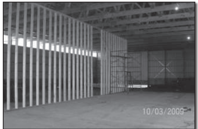
Building the shop walls.

ADG 3.29. Dam's first calf. Recommended heifer bull. Out of a first calf heifer, this calf has great growth with a lot of length.