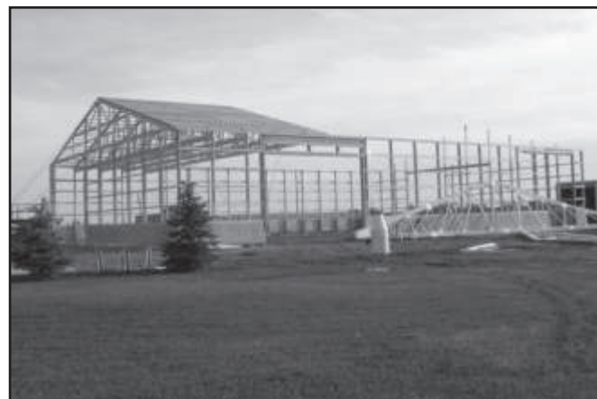
Construction of new sale barn/shop/cattle facility.

We really like our Objective calves, and this is no exception. He offers super growth and ratios very well on his ultrasound data.