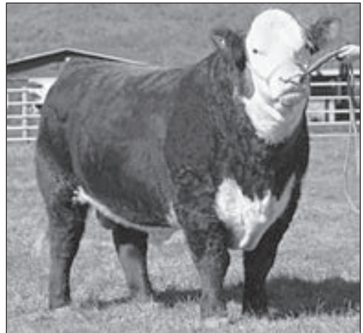
WRB Harfst 2296 Louie 5317 ET - Sire of Lot 504.