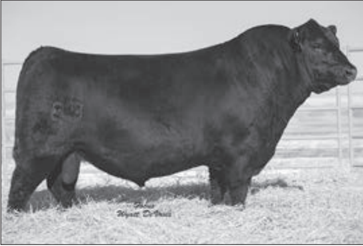
BUBS Southern Charm AA31 - Sire of Lots 463 & 465.