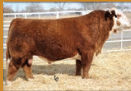
HEREFORD: CHURCHILL SENSATION 028X