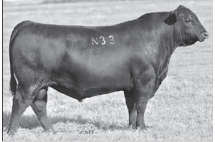
Casino Bomber N33 - Sire of Lot 424.