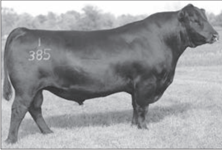
Connealy Comrade 1385 - Sire of Lots 454, 455, 459, 470 & 474.