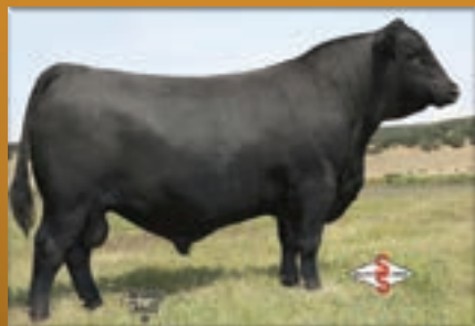
ANGUS: TEX PLAYBOOK 5437