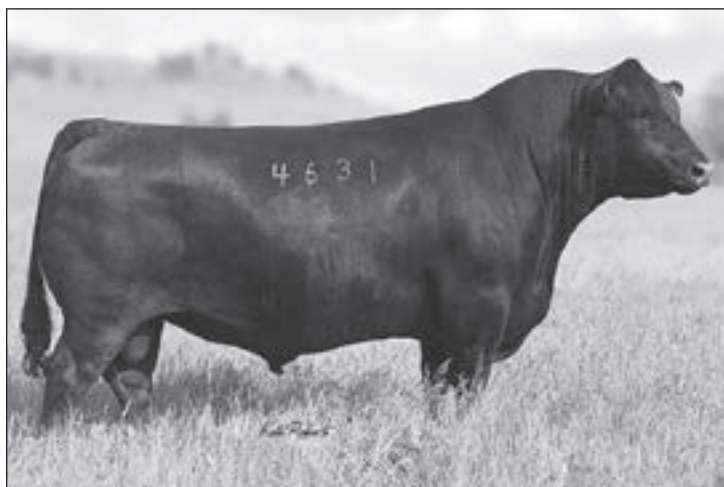
3F Epic 4631 - Sire of Lots 410, 414 & 416.

Consigned by Slash M Angus Sired by longtime maternal and calving ease great, Basin Excitement out of a very productive (WR 3@110) Sitz Upward dam.