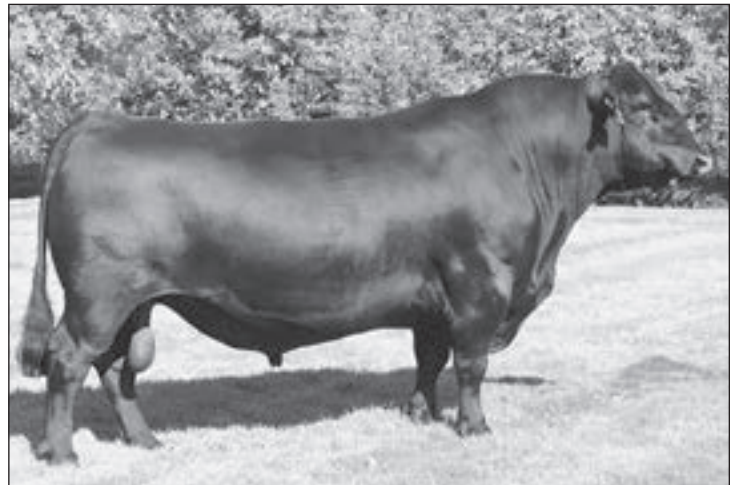
KCF Bennett TheRock A473 - Sire of Lot 453.