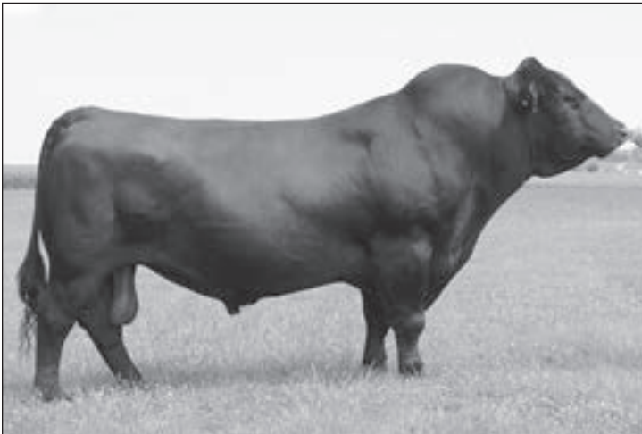
Quaker Hill Rampage OA36 - Sire of Lot 415.

Consigned by Double G Ranch Big Spread and high performance genetics in a low birth package.