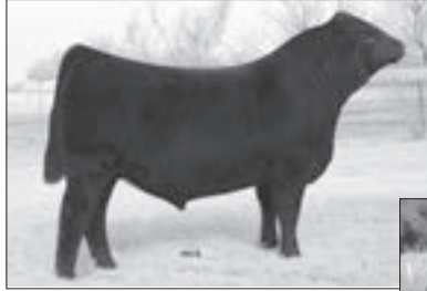
PF Counsel 643T 3514 - Sire of Lot 420.