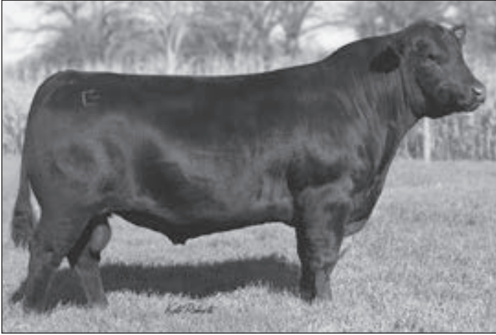
Baldrige Bronc - Sire of Lots 460 & 462.