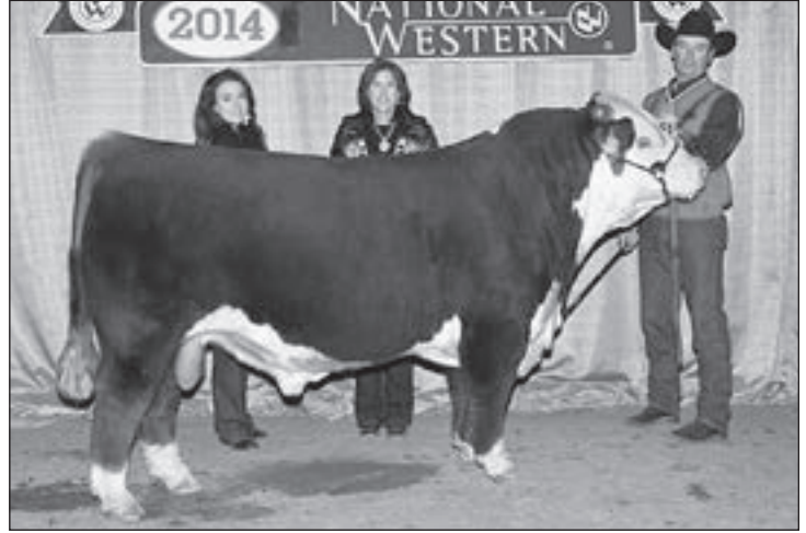
UPS Sensation 2296 ET - Sire of Lot 498.