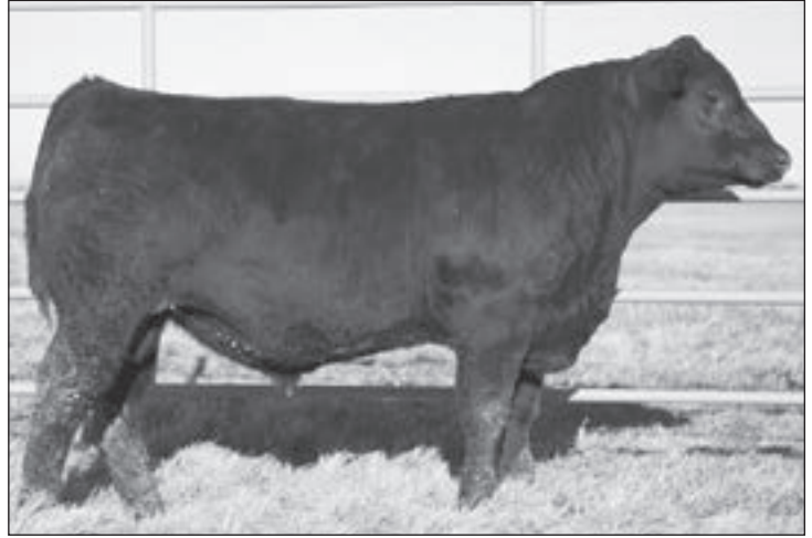
Kesslers Whitlock 7587 - Sire of Lots 429 & 430.