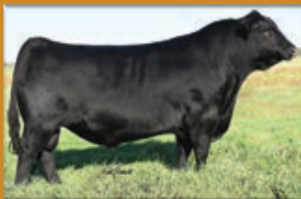
ANGUS: MGR TREASURE