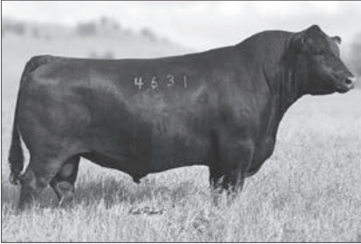
3F Epic 4631 - Sire of Lots 410, 414 & 416.