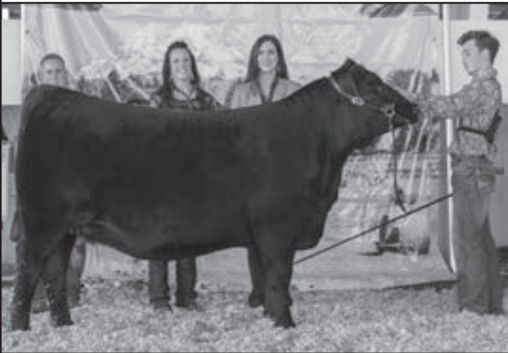
2019 Reserve Grand Champion Female Washington State Fair ROV Angus Show.

C4 Claim To Fame 2819 - Excellent heifer Bull here. HD50k tested posting Top 4% BW and CED. WITH -2.0 BW. Top 2% Milk. He is excellent footed with top 2% Claw. He is a 3/4 sib to Lot 413. His dam is a moderate made attractive female descending from the Countess family. She has excellent feet, legs and udder.