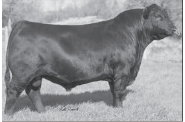
Werner Flat Top 4136 - Sire of Lots 456, 458 & 461.