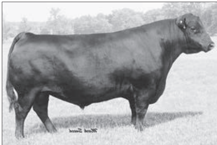
Basin Excitement - Sire of Lot 409.