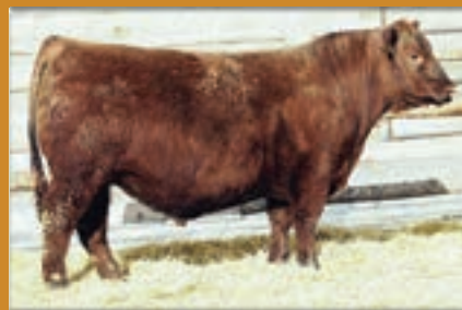
RED ANGUS: C-T DOMINATE 7067