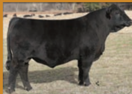
SIMMENTAL: ETR BOTTOM LINE E124