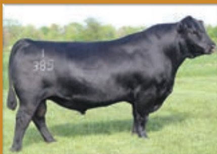
ANGUS: CONNEALY COMRADE 1385