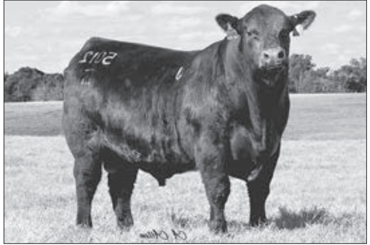
GAR Drive - Sire of Lot 466.