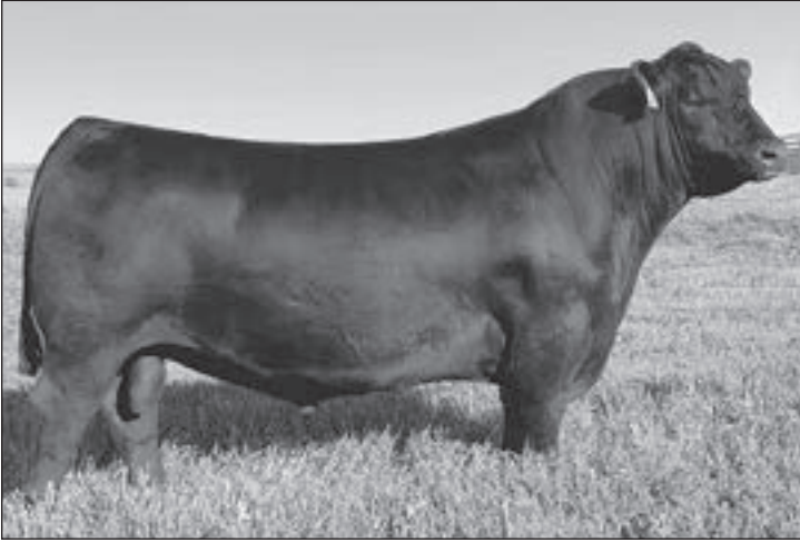
SAV Raindance 6848 - Sire of Lot 426.