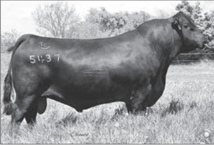
TEX Playbook 5437 - Sire of Lots 422, 423 & 469.