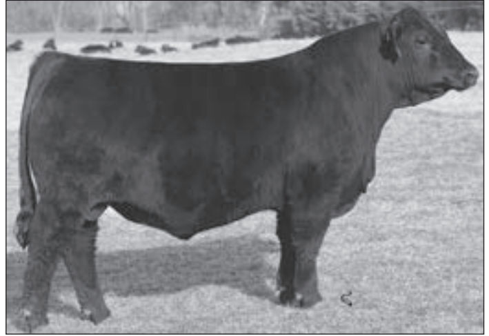
ETR Bottom Line E124 - Sire of Lots 507-511.