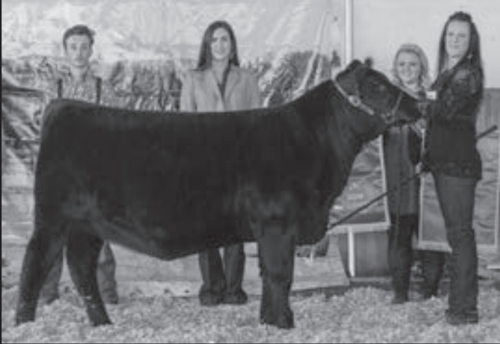
2019 Grand Champion Female Washington State Fair ROV Angus Show