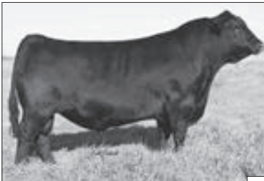
MGR Treasure - Sire of Lots 402, 403, 405 & 440.