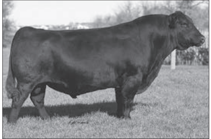
KCF Bennett Fortress - Sire of Lots 407 & 408.

Consigned by Wright Cattle Co. DNA/HD50K parent verified. This bull's sire, Jindra Acclaim is at the top of the Angus breed for $Beef. He is an elite growth sire. This Acclaim son is a soggy, easy moving bull. He was raised on steep shrub steppe rangeland with no grain and really covered the ground. He's in the top 11% for Birth Weight. The top 4% for Residual Average Daily Gain. The top 10% for Feedlot Value. The top 20% for $B. Actual weaning weight 846 lbs. He was a standout from day one. A tremendous individual with a 75 lb. birth weight and explosive growth, he's been a bull test standout. He will add pounds to your program. He just missed the calving ease division by one on his CED. He met all other criteria.