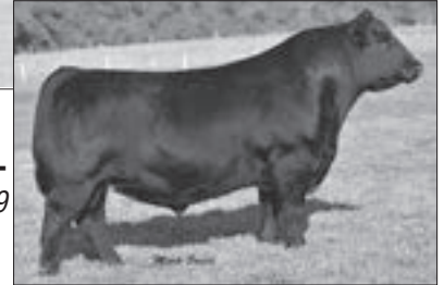
PVF Insight 0129 - Sire of Lot 419