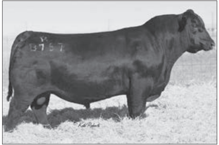
Tehama Tahoe B767 - Sire of Lot 472.