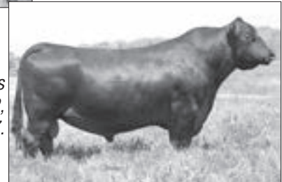
Jindra Acclaim - Sire of Lots 404, 412, 413, 436, 438, 442, 444, 452, 464 & 467.