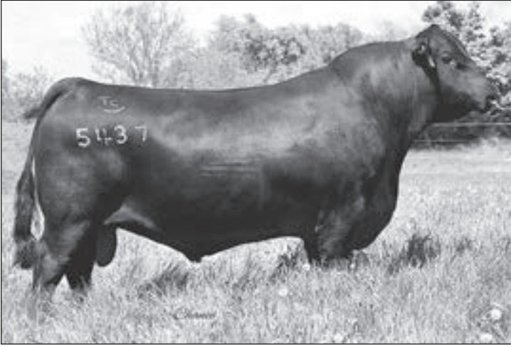
Tex Playbook 5437 - Sire of Lots 422, 423 & 469.