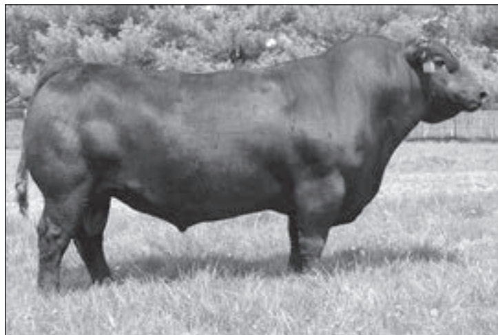
LD Capitalist 316 - Sire of Lot 447.