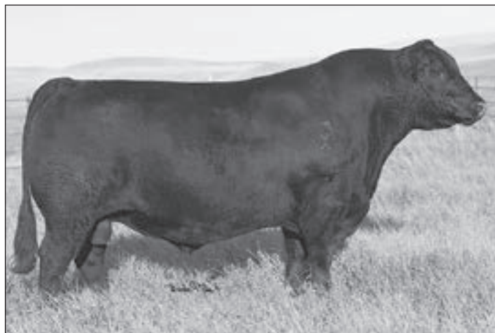
EXAR Monumental 6056B - Sire of Lot 448.

Consigned by Center Valley Angus 74# BW, GS genomic testing placing this bull in the top 4% for BW among NP Angus bulls. EXAR Monumental is a bull making his mark across the Angus world. Our top two indexing heifers were Monumental's and we bred back to him again this year.