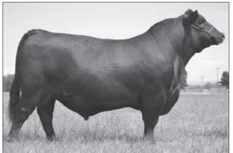
SAV Blue Ribbon 9157 - Sire of Lots 417, 418 & 421.