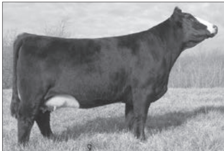
AJE/HS/MBCC Higher Hope- Dam of Lot 514.