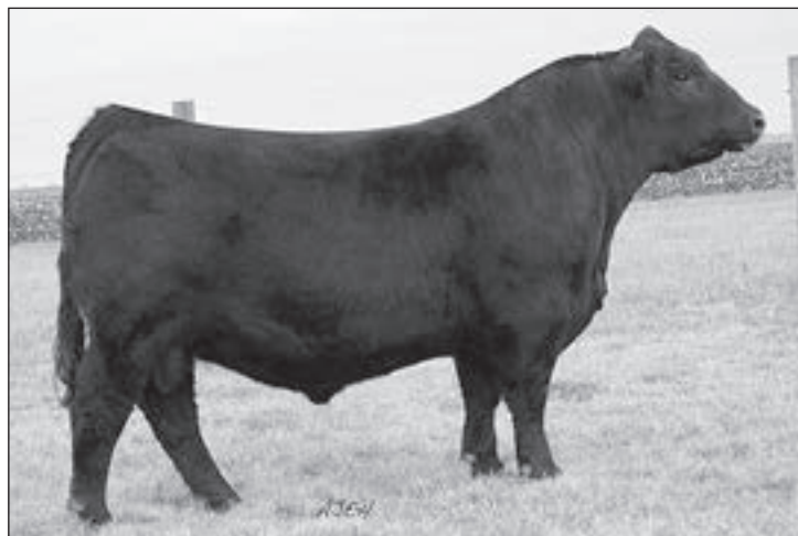
W/C Executive Order 8543B - Sire of Lot 514.

Another bull that has the matriarch of our herd in his pedigree. This bull's sire is a direct son of a top selling Simmental female we purchased in Denver at the NWSS, who went on to win Grand Champion Female at the Western Regionals in Utah. As if that were not enough, this bull's sire has the ever popular Select Sires stud HPF Optimizer on the top side. Top 15% for Calving Ease and Birth Weight EPDS, this young bull has all the right parts and EPD profile to change any progressive program for the positive.