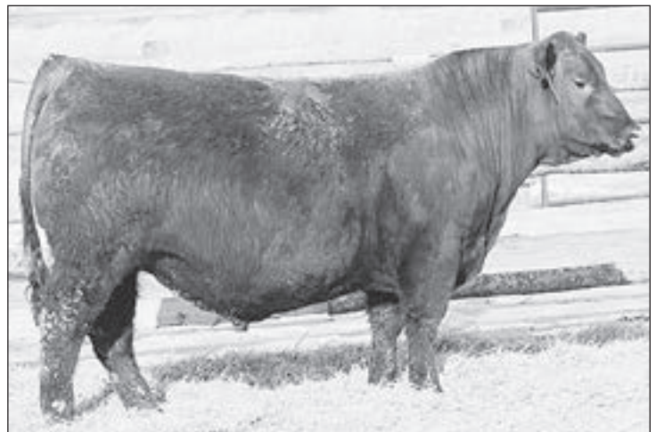
C-T Dominate 7067 - Sire of Lot 479.

This guy has herd bull written all over him and has been a standout since birth. Sired by C-T Dominate, the high-selling bull in the 2018 Feddes/C-T Sale. Phenotypically, one of the better bulls we have raised. Added length, muscle, and bone all in an attractive package. Lots of performance in this bull with a WR of 109.