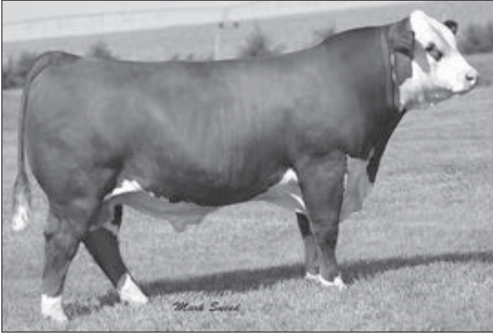
R Leader 6964 - Sire of Lots 489 & 491.