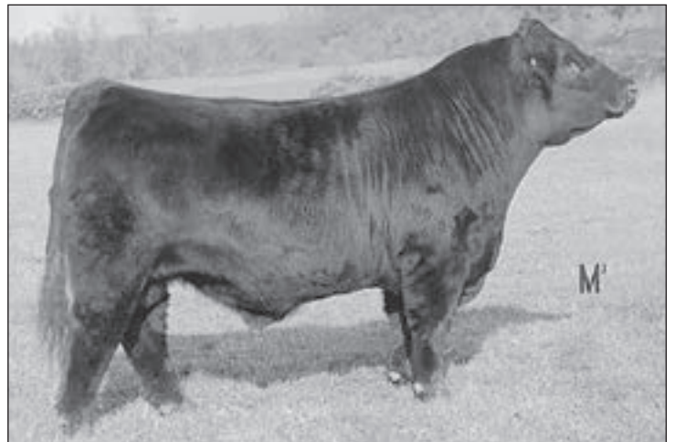
Schooley's URA Believer - Sire of Lots 525 & 526.

This bull's dam stems from the matriarch of our cow herd. We purchased this bull's sire, Damar Duration, from Wisconsin. Check out his picture and EPD profile on Cattle Visions and elsewhere. Duration is a maternal grandson of a Denver NWSS Grand Champion Female and also stems from the ever popular W/C United, with the prolific Angus bull, Northern Improvement, on the maternal side. We successfully showed this calf last fall at the Washington State Fair, so he comes with the bonus of being halter broken. Buy this stud with confidence.