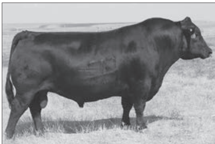
Stevenson Rockmount RX933 - Sire of Lot 411.

Consigned by Cambra Livestock GS tested. A true Milestone from a genomic standpoint taking growth to new limits with top 1% for WW and YW. Lot 410 ranks in the top 15% of the breed for 11 EPD categories.