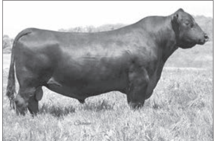
Jindra Acclaim - Sire of Lots 404, 412, 413, 436, 438, 442, 444, 452, 464 & 467.