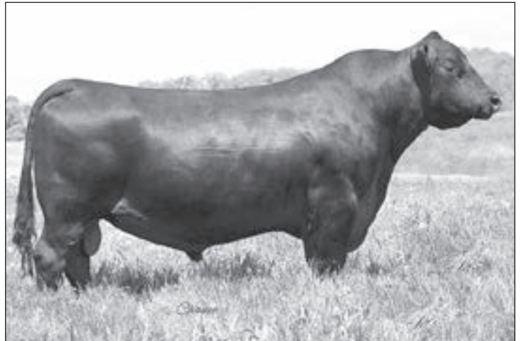
Jindra Acclaim - Sire of Lots 404, 412, 413, 436, 438, 442, 444, 452, 464 & 467.

This is a must see bull at the sale. He has the look and pedigree that is hard to match. Incredible HD50k numbers. Top 1% RADG, CW, $F and huge 207 $B. Top 2% YW. He is big boned, great footed, long bodied and level topped. His dam has an excellent udder stemming from the famous Countess cow family.