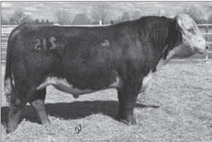
C L1 Domino 215Z - Sire of Lots 500 and 501.

Top 5% of the breed for REA, top 10% for CW. His sire, 215Z offers true genetic excellence with 10 EPDs and indexes ranking in the top 25% of the breed and seven of those within the top 5% of the breed. With 100% eye pigmentation and a 78# birth weight, he should work in most all commercial herds.