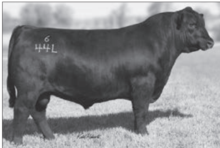
Connealy Legendary 644L - Sire of Lot 446.