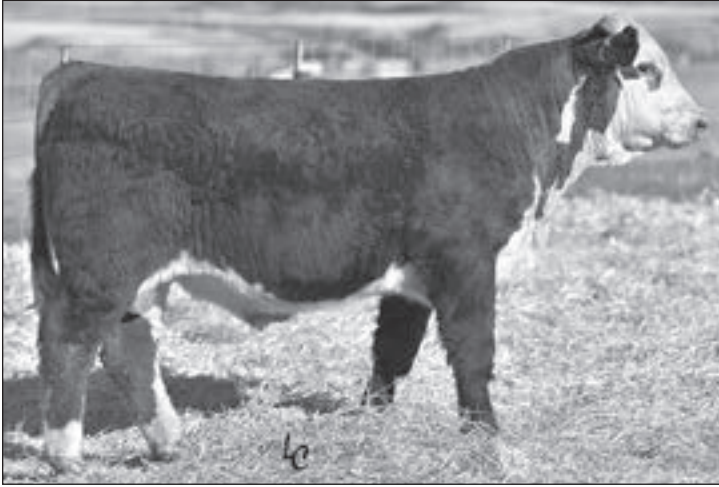
Churchill Sensation 4193B - Sire of Lots 492, 493 & 494.