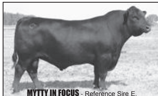
MYTTY IN FOCUS - Reference Sire E.