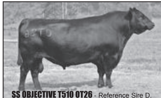
SS OBJECTIVE T510 OT26 - Reference Sire D.