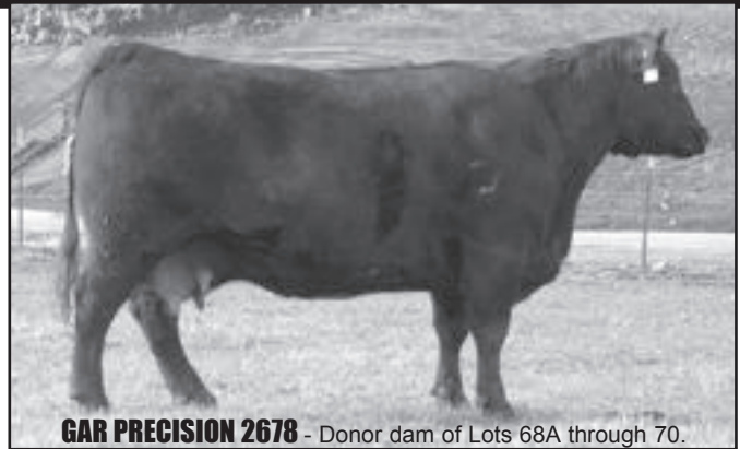
GAR PRECISION 2678 - Donor dam of Lots 68A through 70.