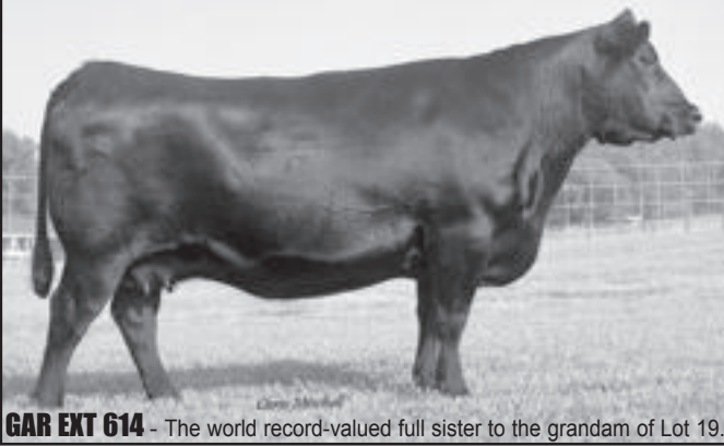
GAR EXT 614 - The world record-valued full sister to the grandam of Lot 19.