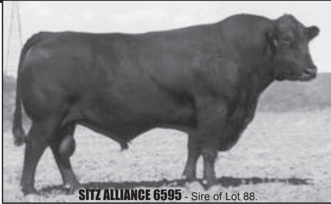
SITZ ALLIANCE 6595 - Sire of Lot 88.