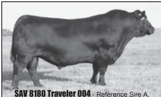
SAV 8180 Traveler 004 - Reference Sire A.