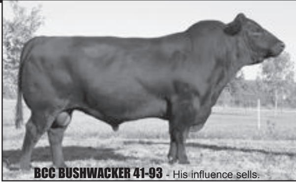
BCC BUSHWACKER 41-93 - His influence sells.