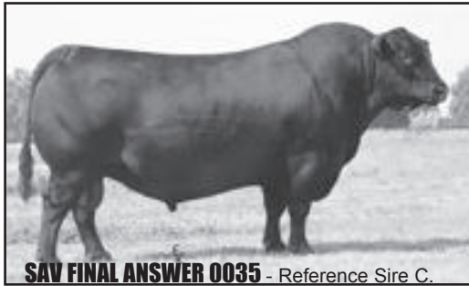
SAV FINAL ANSWER 0035 - Reference Sire C.