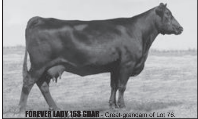
FOREVER LADY 163 GDAR - Great-grandam of Lot 76.