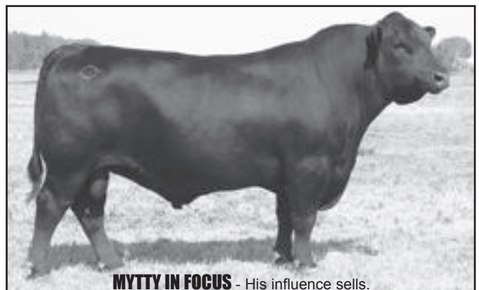
MYTTY IN FOCUS - His influence sells.