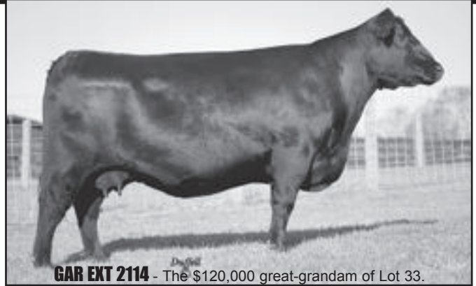
GAR EXT 2114 - The $120,000 great-grandam of Lot 33.