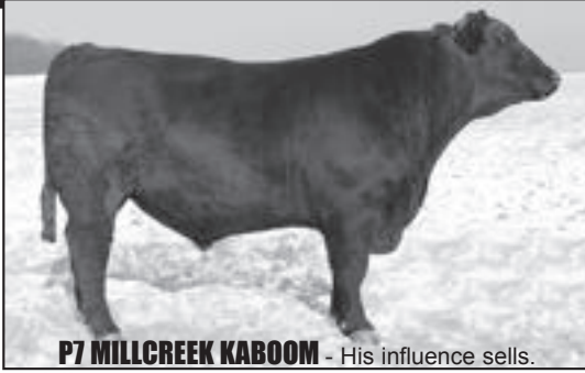
P7 MILLCREEK KABOOM - His influence sells.