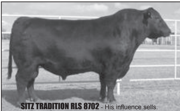
SITZ TRADITION RLS 8702 - His influence sells.

★ Individual Records: WR 110. ★ Dam Records: WR 1@110.