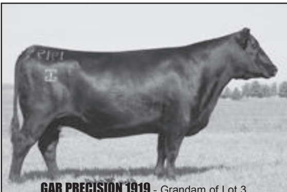
GAR PRECISION 1919 - Grandam of Lot 3.

★ Individual Records: BR 95, YR 100, U%IMF 100, UREA 100. ★ Dam Records: BR 2@92, WR 2@104, U%IMF 1@100, UREA 1@100.