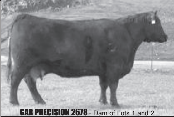
GAR PRECISION 2678 - Dam of Lots 1 and 2.