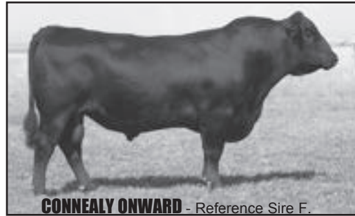
CONNELY ONWARD - Reference Sire F.