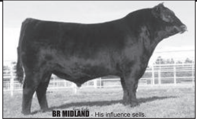
BR MIDLAND - His influence sells.