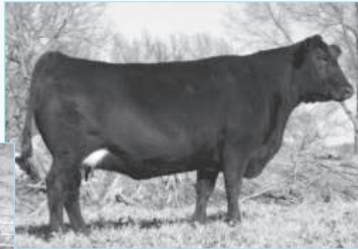
Lot 1 - WR 878 Sabrina 116