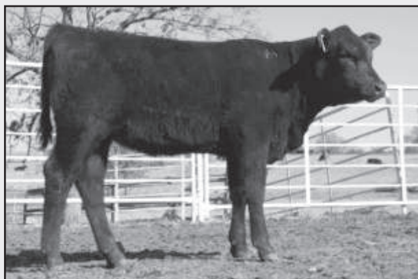
WR Miss DB 957 of 305 - Lot 7A