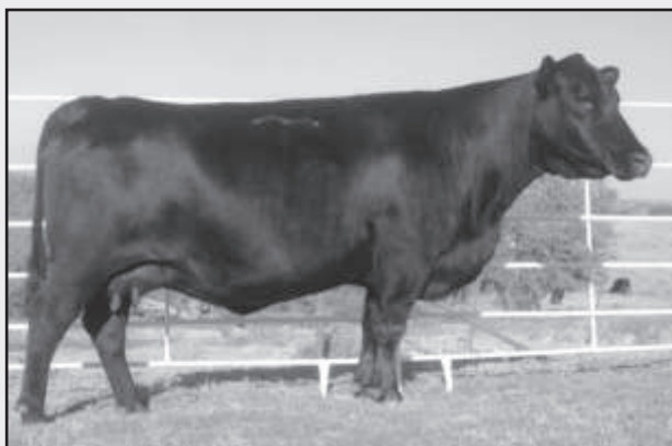
Thomas Miss Lucy 4624 - Great-grandam of Lot 5.