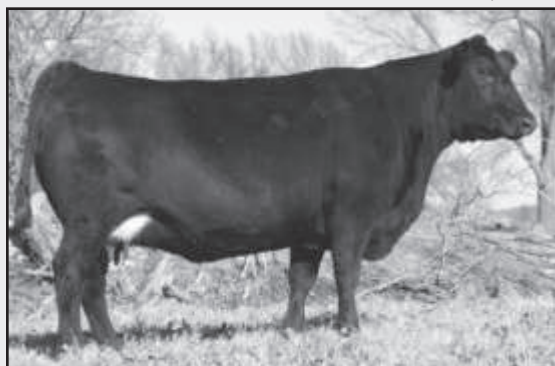
WR 878 Sabrina 116