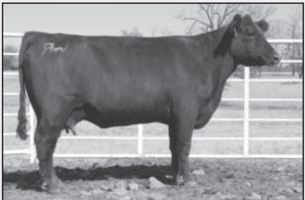
WR Miss Power Line 507 - Lot 27

#GT Maximum [AMF-NHF] #Scotch Cap [AMF-NHF] FR Miss Burgess N7 #GT Miss Traveler 58 14375219 KCR Miss Burgess 9084 Sar Traveler 63 KCR Miss Burgess 3040