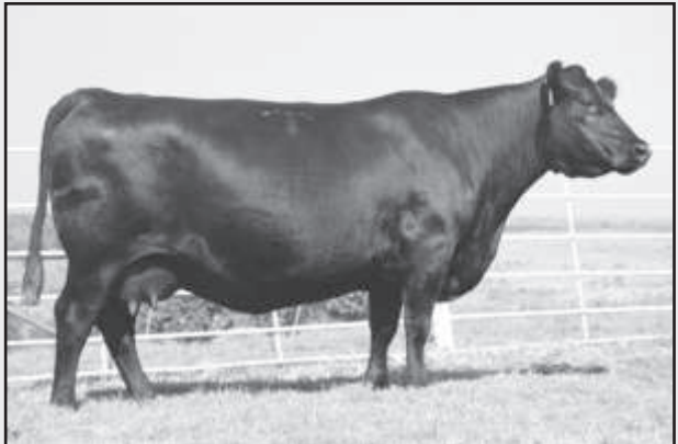
Thomas Juana 2002 - Dam of Lot 33.

35 W R PD GEORGIA 325 Birth Date: 9-12-2003 Cow 14707659 Tattoo: 325