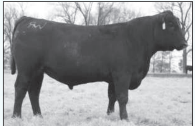
Lot 63 - WR IF R809