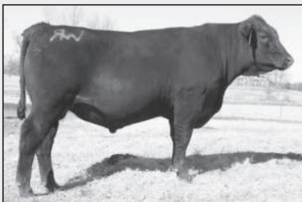
WR IF R812 - Lot 64

This calf's grandmother is a full sister to the ABS sire Dalebanks Extender. You will like him.