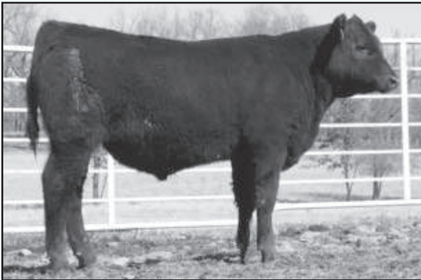
Lot 10A - WR IF D935

1 p.m., Friday • April 9, 2010 • at the ranch near Poteau, OK