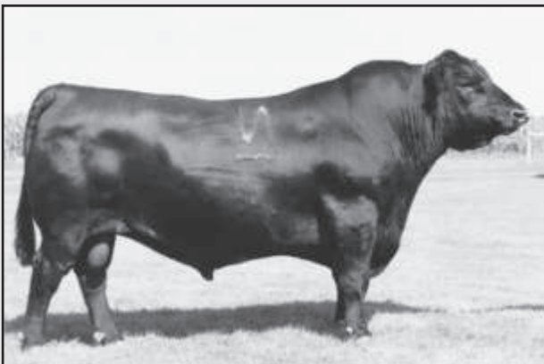
N Bar Emulation EXT - This breed-leading bull is the sire of Lots 13 and 14.