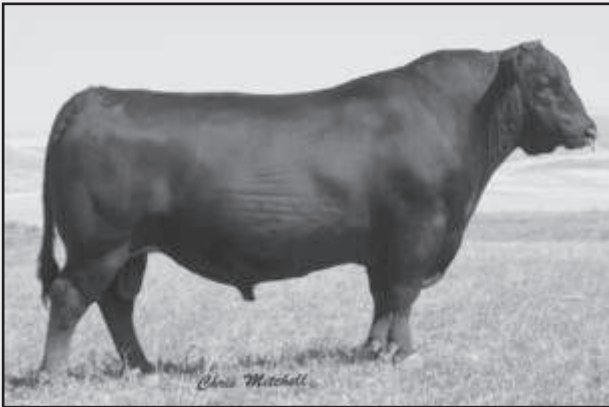
Nichols Extra K205 - Sire of Lots 53, 54 and 55.

His dam, the 249 cow, is the grandam of Lot 55. Two really good bulls here.