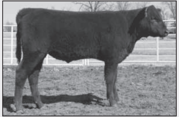
WR AA D940 - Lot 16A