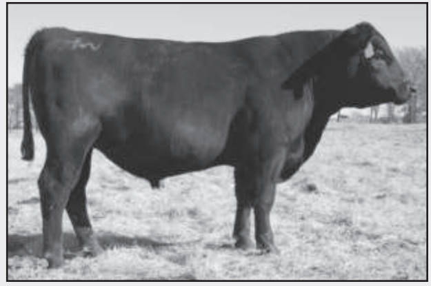
WR Analyst D815- Lot 60

Calving Ease, Growth and CMI. The 437 cow has never had a heifer calf. Her sons have always been favorites sale day. In Focus, Lead On, EXT. You can't write a better pedigree.