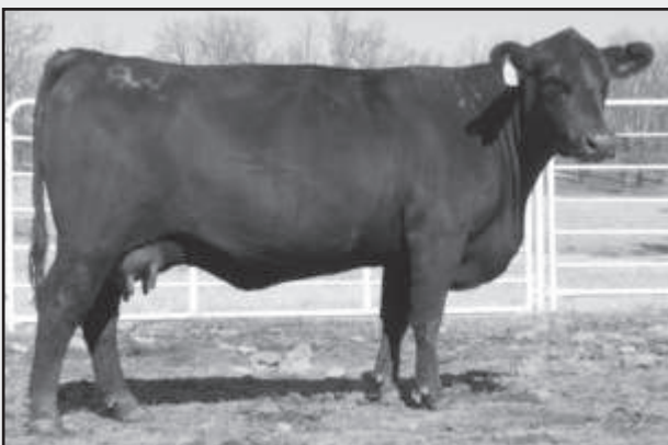
WR Mam IF of S54 607 - Lot 24