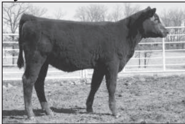
WR Miss OT26 949 of 551 - Lot 4A