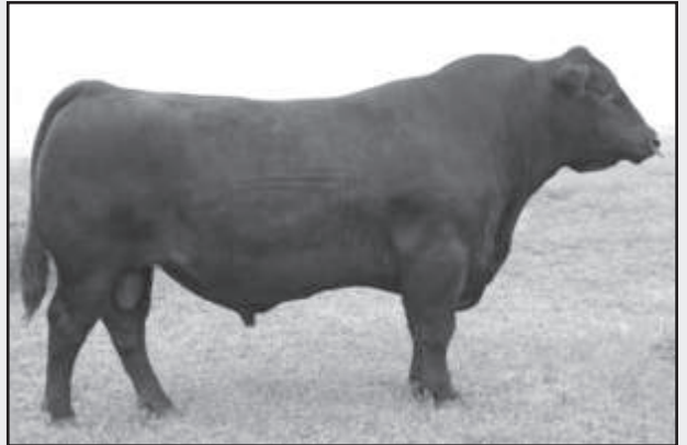
Woodhill Mainline - Sire of Lot 56.

When was the last time you saw a BW EPD of -2.6 and a YW EPD of +100. His dam is a Pathfinder! Don't miss this all purpose bull.