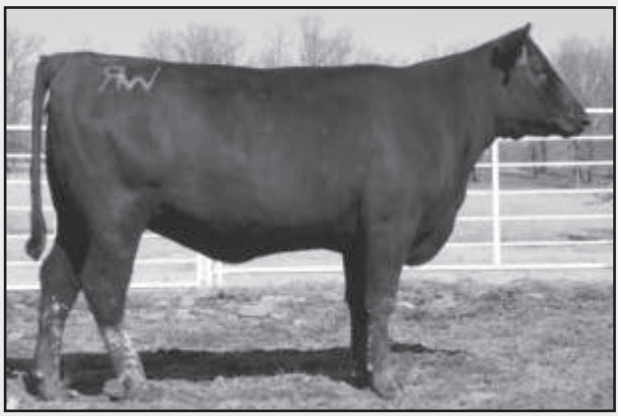
WR Evergreen Obj 838 of 668 - Lot 39