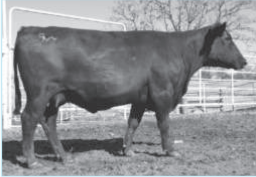
Lot 4 - WR NL Queen 551