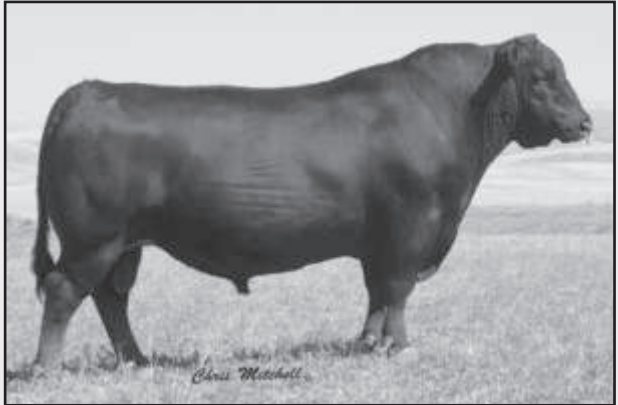
Nichols Extra K205 - Sire of Lot 37.

37 WR QUEEN K205 910 OF 001 Birth Date: 2-16-2009 Cow 16405886 Tattoo: 910