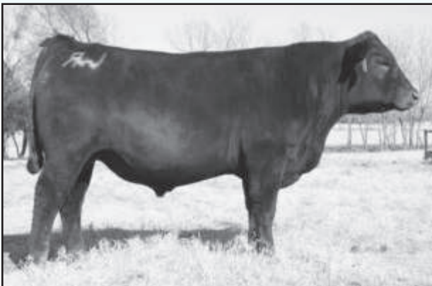
Lot 62 - WR IF R813