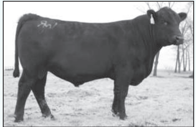
Lot 59 - WR Analyst D825