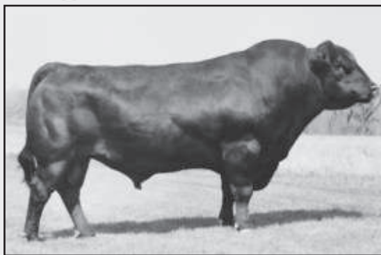
Connealy Lead On

OT26 - Our Objective daughters are making great cows.