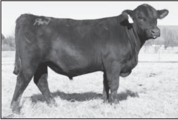
WR K205 D814 - Lot 53