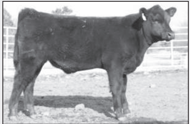
WR Daybreak D947 - Lot 19A