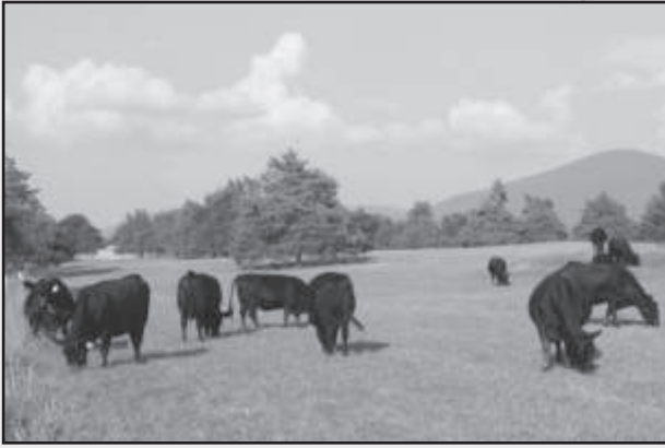
Bred heifers on pasture at Wann Ranch.