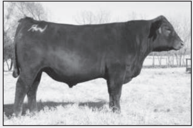
WR IF R813 - Lot 62

Calving Ease, Growth and CMI. Another multi-generation AI pedigree. This carcass king posted ratios of 140 for Marbling and 105 on Ribeye Area.