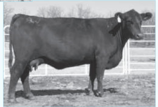
Lot 24 - WR Mam IF of S54 607