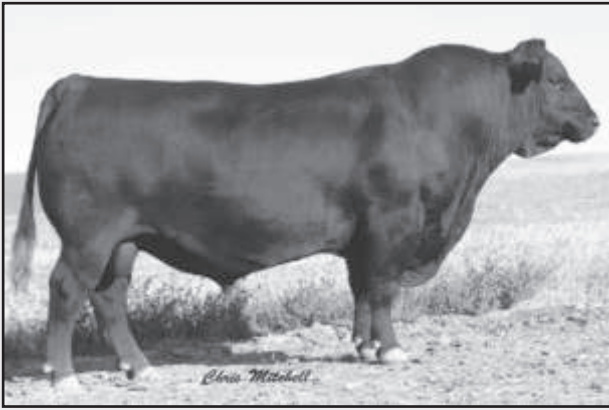
Boyd On Target 1083 - Sire of Lots 10 and 11.