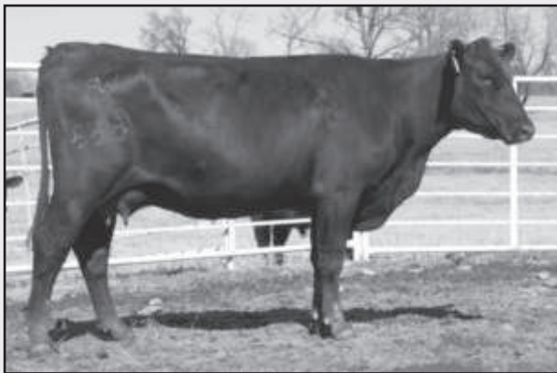
WR OT Evergreen 668 - Lot 10