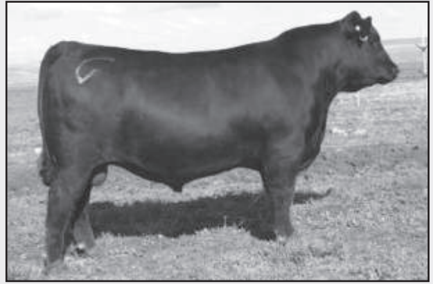
Connealy All Around - Sire of Lot 23B.