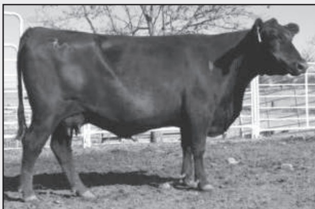
WR New Design 305 - Lot 7