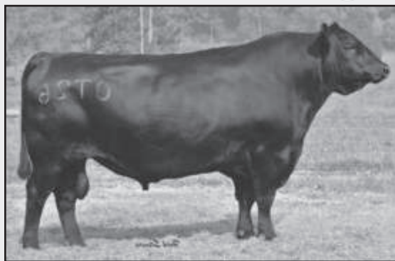
SS Objective T510

OT26 - Our Objective daughters are making great cows.