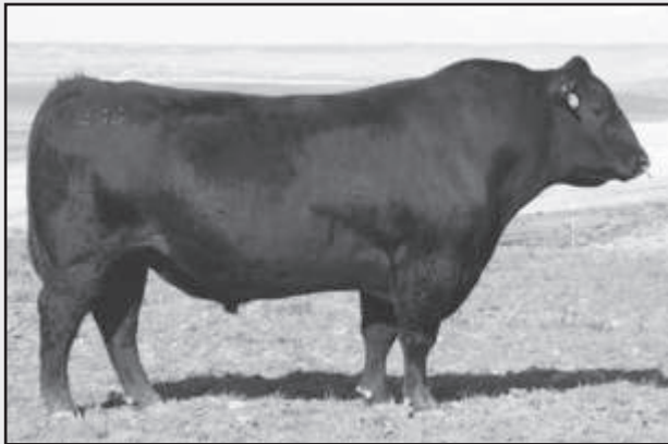
LCC New Standard - This outstanding calving-ease bull is the sire of Lots 71, 72 and 73.