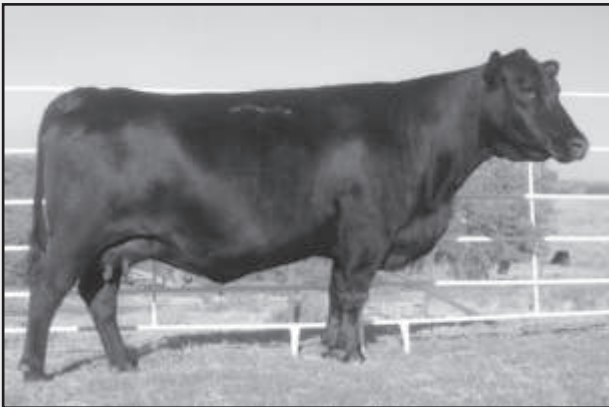
Thomas Miss Lucy 4624 - Dam of Lot 20.