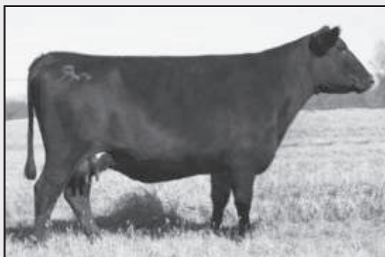
WR 878 Miss 436

Offering buyer's choice between Lot 1 and Lot 2. The buyer can double their money and have the right to flush both.