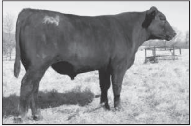
FH New Design 813U - Lot 79