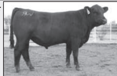
WR Crossover D828 - Lot 51

49 WR CROSSOVER R814 [AMF-NHF] Birth Date: 9-26-2008 Bull 16321135 Tattoo: R814