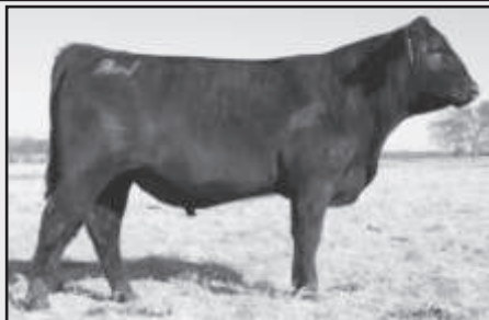
WR Crossover R814 - Lot 49

With the high cost of feed and the abundant grass we had last summer, we fed these bulls less feed than we ever have before. Their actual yearling weights were lower than they have been in the past. We have brought them along well since that time and they look great now. We have seen bulls that were pushed hard for high yearling weights have semen production problems and feet and leg problems. We believe these bulls will hold up extremely well and stay sound for you. These bulls average +8 for Calving Ease Direct, top 20% of the breed, +.8 for Birth Weight EPD, top 25%, +50 for WW EPD, top 25%, +92 for YW EPD, top 25% and +42 for $B, top 40% of the breed. Their genetic value is high.