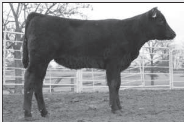
WR LO Lucy 953 - Lot 5A