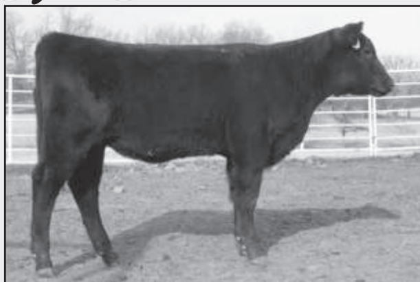
WR Pride AA 936 of 525 - Lot 6A

6 WR LO PRIDE 525 Birth Date: 9-3-2005 Cow 15354193 Tattoo: 525