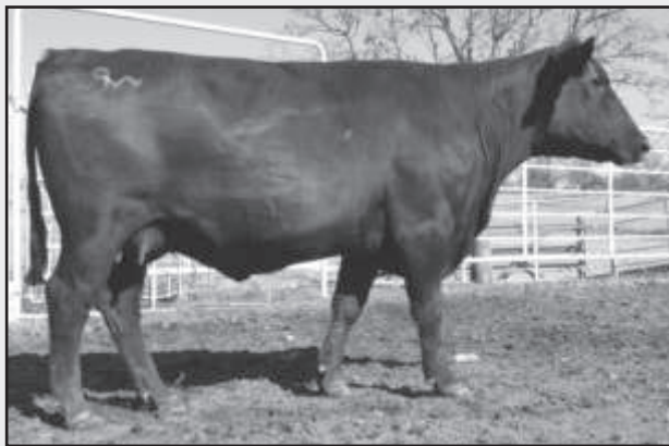
WR NL Queen 551 - Lot 4