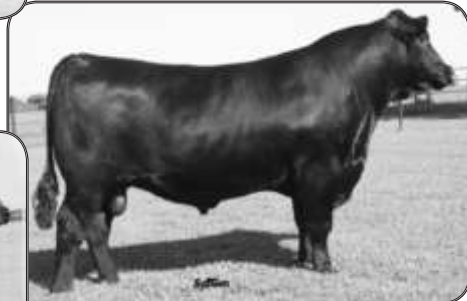
SYDGEN SEDALIA 8166 Full brother to Lot 8.