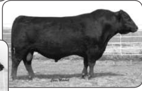
LEACHMAN BOOM TIME Sire of Lots 66 and 67.