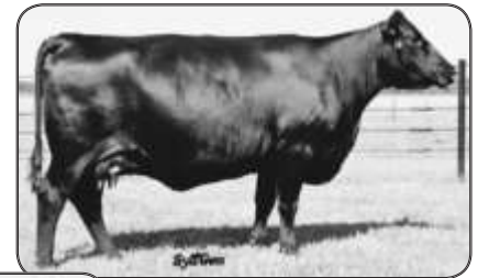
SYDGEN BLACKBIRD LADY 1059 - DAM OF LOTS 66 AND 67.

Show-Me Select Qualified Service Sire for Heifers, with a nice look to him.