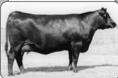
SAF FOREVER LADY 0020 Dam of SAF Contact.