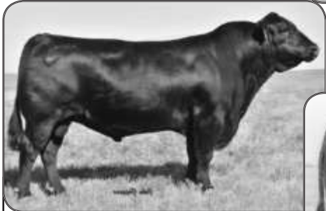
CONNELY FORWARD Sire of Lot 12.