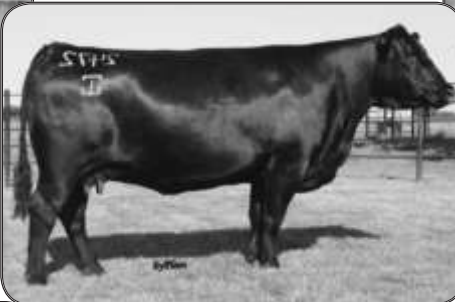
GAR 616 RITA 2472 Grandam of Lots 49, 50 and 51. Dam of Lot 6.