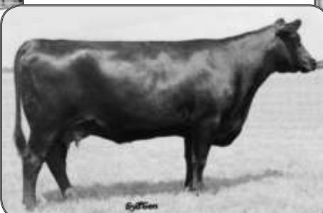
SAF ROYAL QUEEN 5084 Dam of Directive, Connection, Strategy and 9095.