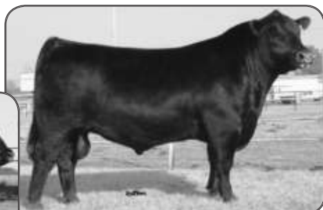
SYDGEN CC&7 Sire of Lots 7, 8 and 73 Maternal brother to Lot 5.