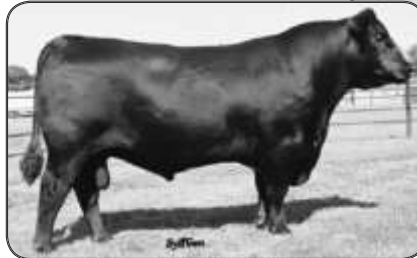
SCR PROMISE 4042 - SIRE OF LOT 60