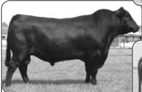
KCF BENNETT COALITION SCC Grandsire of Lots 61 through 64.