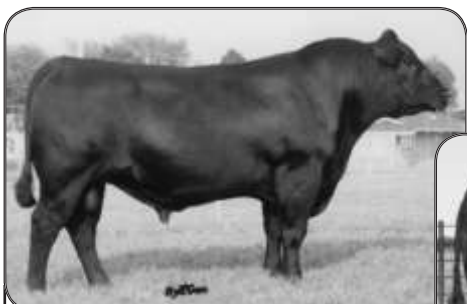
SYDGEN 1407 CORONA 2016 Sire of Lots 13, 14, 72 and 75.