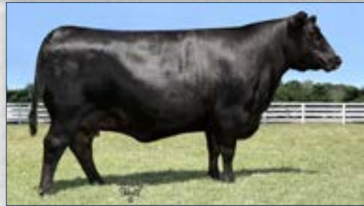
Quaker Hill Blackcap OA35 - Dam of Lot 18

A pedigree that needs no intro as this female's dam is the full sister to Quaker Hill Rampage. This young female offers a bold EPD profile with a pedigree as time tested and proven as anything in the breed, yet still relevant as the day she was born. The brood of maternal sisters to the dam OA35 have generated eggs for the top breeders in the country and you will find them on the bottom and top side of thousands of pedigrees. Exposed to Silfa BC 3710B-868 4-27-20 to 5-28-20.