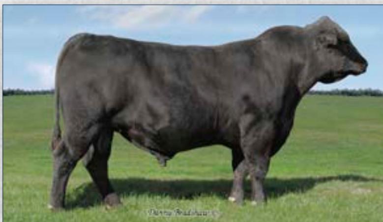
Sydgen Big League - Sire of Lot 22A