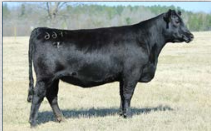
FF Rita 3F66 of 12E4 Prophet - Dam of Lot 78

The daughter of the $15,500, FF Rita 3F66 of 12E4 Prophet, from the 2016 Friendship Farms sale. In that same sale her granddam was the $21,000 top selling pair to Fairway Farms and a direct daughter of "5F56". Exposed 4-27-20 to 5-28-20 to Silfa BC x 3710B-868.