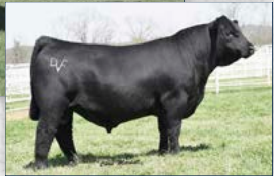
Deer Valley Growth Fund - Same maternal pedigree as dam of Lot 7