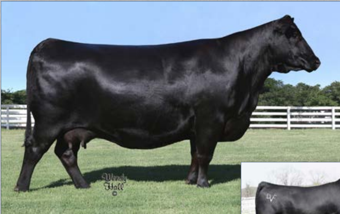
Deer Valley Rita 0217 - Dam of Lot 7