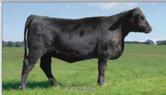
Woodside Rita 6U9 of 4 x 27 - Lot 23

A great granddaughter of the famous sister to Sitz Upward, Sitz Henrietta Pride 639T. Between her and her sister 643T they have made a massive impact in the breed. The Henrietta Prides' injection of muscle and substance has been well received with millions in the bank on progeny. Due approx. 10-15-20 to Sydgen Big League 6014 or Silfa Closer 832.