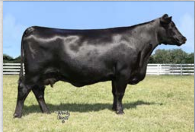
Spruce Mtn Rita 692 - Dam of Lot 9