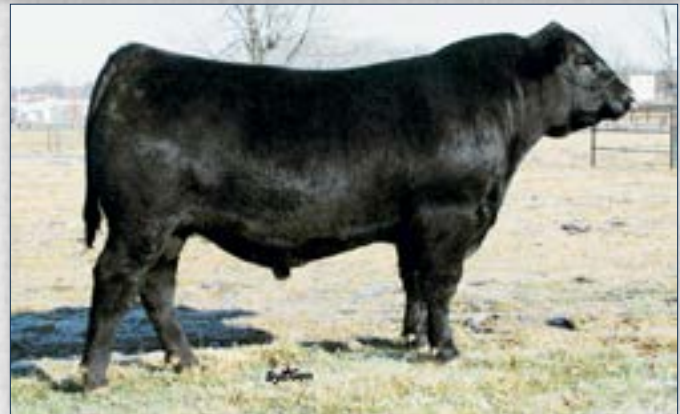
Sydgen For All - Maternal brother to Lot 35

This is a great pedigree with the best breeding son of Ten X on top of the mother of Sydgen For All. For All was our $43,000 half interest pic in the 2013 Sydgen Sale and has made a major impact of our herd. Due approx. 9-9-20 to Sydgen Expansion 5917.