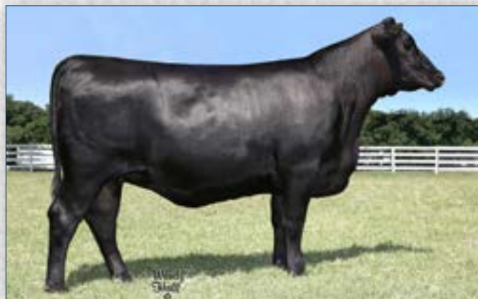
Vintage Rita 5186 - Lot 72

Coming from an excellent line of high producing females especially G A R Objective 2345 with bull progeny in stud, who is also a full sister to G A R Composure. AI to Jindra Acclaim on 4/23/20. Exposed to Silfa BC 3710B-868 4-27-20 to 5-28-20.