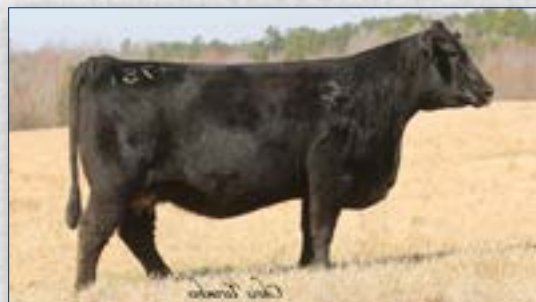
EXAR Rita 4751 - Dam of Lot 4