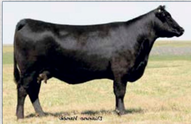
Lady Ida of Ellston G180 - Dam of Lot 48

Maternal sister to Lot 34 and out of a stellar cow with great production records. Top 1% for docility and rib eye and top 2% for weaning. Due approx. 10-8-20 to SilFa Xpand x 1022-832 or Sydgen Big League 6014.