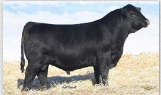
Sydgen Expansion 5917 - Lot 87

The top selling bull in 2016 from Sydgen at $20,000. His dam sells as Lot 79 and was the top selling pair at the 2015 Sydgen sale for $30,000. Selling half semen interest and full possession.