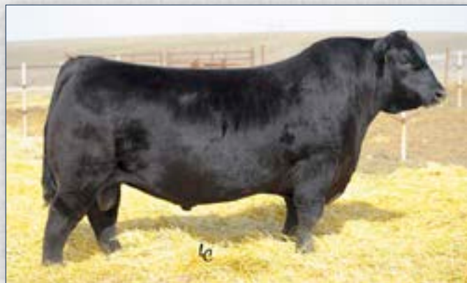
RB Tour of Duty 177 - Sire of Lot 51

Another daughter of a superior mother from the Ruby cow family. A highly tested pedigree that has performed every time. Due approx. 9-8-20 to SilFa Xpand x 1022-832 or Sydgen Big League 6014.