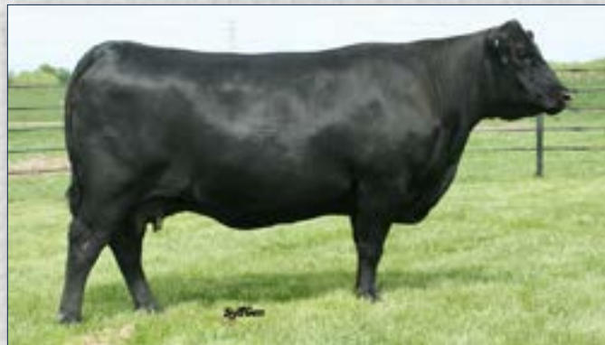
Sydgen Envious Blackbird 102 - Dam of Lot 27

A flawless EPD profile with a fresh pedigree. Her sire has been a no miss for performance and eye appeal. Her maternal brother is Sydgen Expansion 5917 owned with ABS and sells in this sale. Her dam sells as Lot 79 and has quite the production record. AI to Sydgen Exceed on 4/23/20. Exposed to Silfa BC 3710B-868 4-27-20 to 5-28-20.