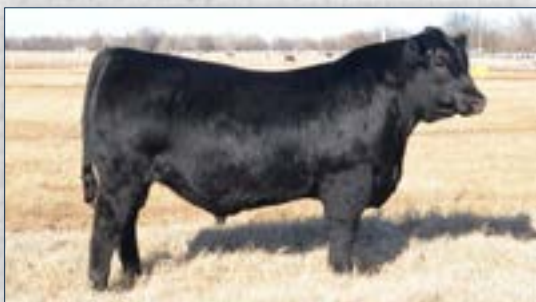
EXAR Hi-Tech 4769B - Brother to the dam of Lot 4

A direct daughter of the, EXAR Rita 4751, the full sister to EXAR Hi-Tech. FF Rita 6J21 of 4751 Journey, was the $14,000 purchase from Friendship Farms. Across the board EPD excellence and pedigree value tracing back to the popular donor dam, GAR Precision 1200, the full sister of GAR New Design 5050. AI to SS Niagara Z29 on 4/23/20. Exposed to Silfa BC 3710B-868 4-27-20 to 5-28-20.