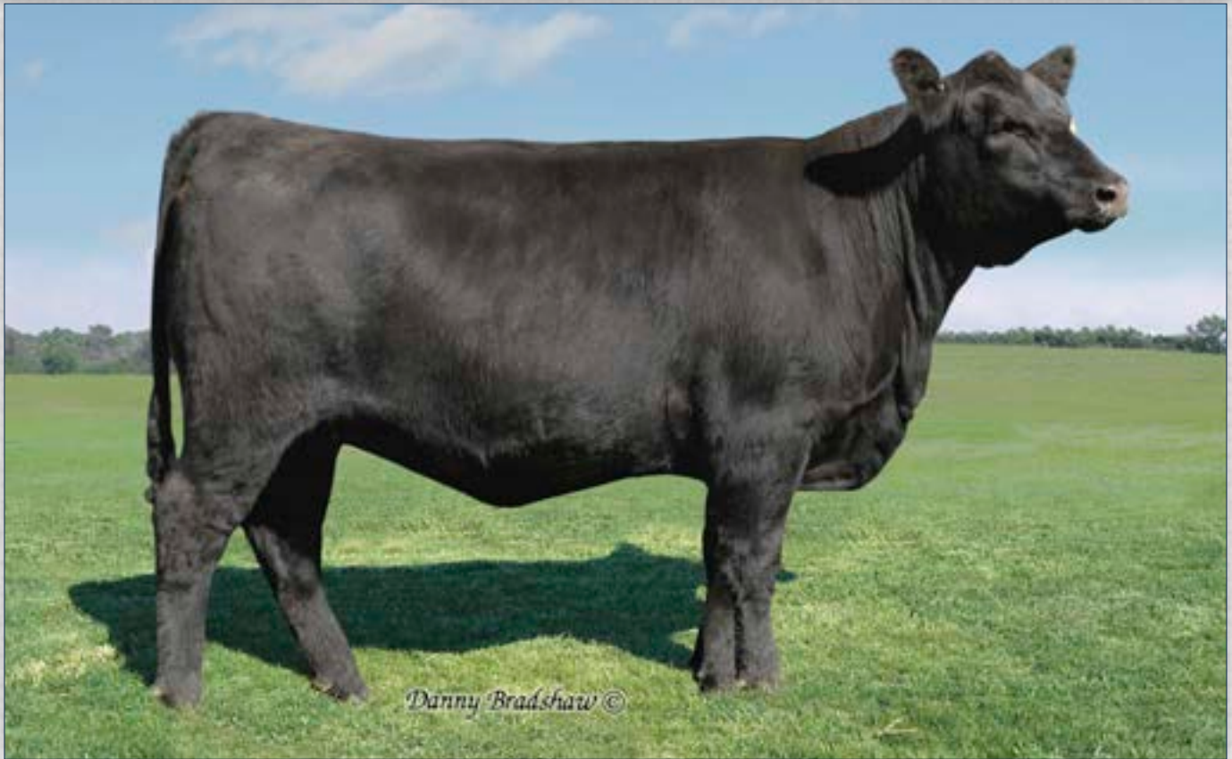
SydGen Mary Blackbird 6928 - Lot 1