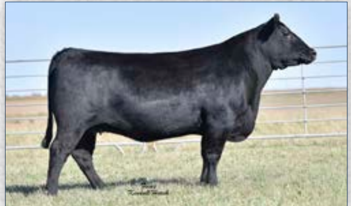
DSA Rito 9Q13 1022 1425 - Dam of Lot 12