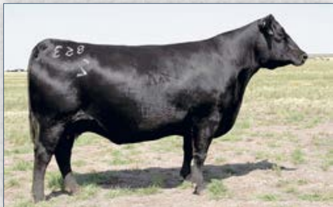
2 Bar Objective 863 - Dam of Lot 80

A maternal sister to the popular and valuable 2 Bar Mile High 9360 who was a big producer over the years. Dam of Lot 77 and 30. Exposed 4-27-20 to 5-28-20 to Silfa BC x 3710B-868.