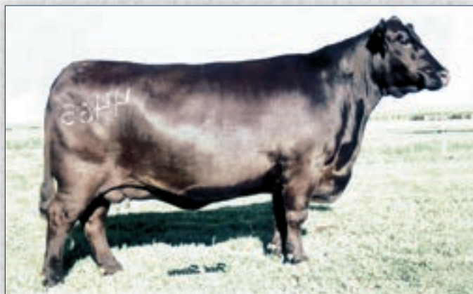
Ideal 4465 of 6807 4286 - Great grandam of Lot 71

This young female's dam is the maternal sister to the $120,000 Vintage First Lady 7013 who sold in the 2017 Vintage Sale. AI to Sydgen Exceed on 4/23/20. Exposed to Silfa BC 3710B-868 4-27-20 to 5-28-20.