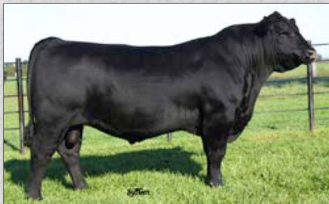
Sydgen Liberty GA 8627 - Sire of Lot 66