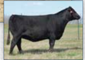
Dean's Queenie X108 - Lot 15 dam