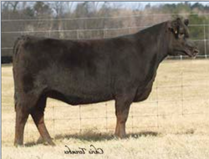
FF Rita 5E66 of 3125 3710B - Lot 5