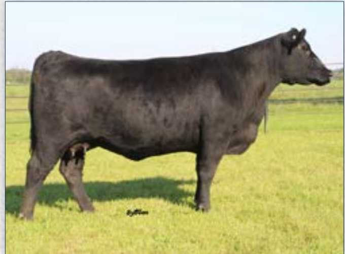
Tehama Mary Blackbird B244 - Lot 2

Embryos by the Lot 2, Tehama Mary Blackbird B244, generated $2,300 per egg in the 2016 Sydgen Sale. Due 9-8-20 to Bar R Jet Black 5063.