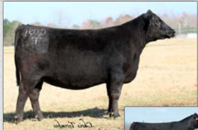
Dean's Queenie C091- Lot 15 as a heifer

Dam is a maternal sister to the $300,000 half interest Dean's Queenie Y120 purchased by High Roller through the Cox Ranch sale in 2016 as well as a $70,000 and $40,000 sold in that same sale. This female will carry on a valuable Queenie legacy with great carcass values. Due approx. 10-8-20 to Sydgen Big League 6014 or Silfa Closer 832.