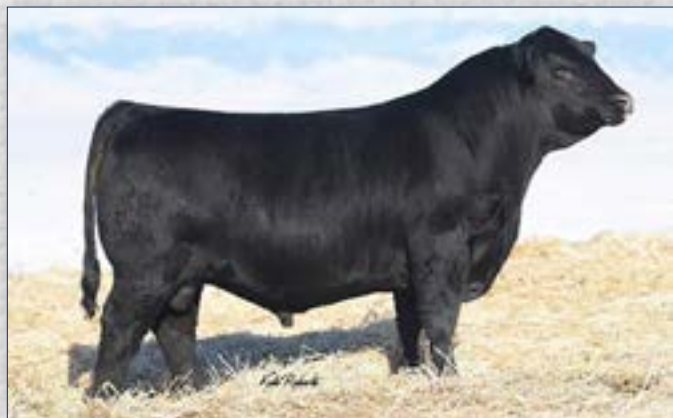
Sydgen Expansion 5917 - Son of Lot 79