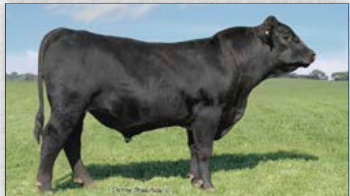
44 Big Commerce 6076 - Sire of Lot 40

A top 1% growth female in the top 2% for scrotal EPD and up to top 2% for $B. Due approx. 9-4-20 to Mead Magnitude. Exposed to Sydgen Expansion 5917.