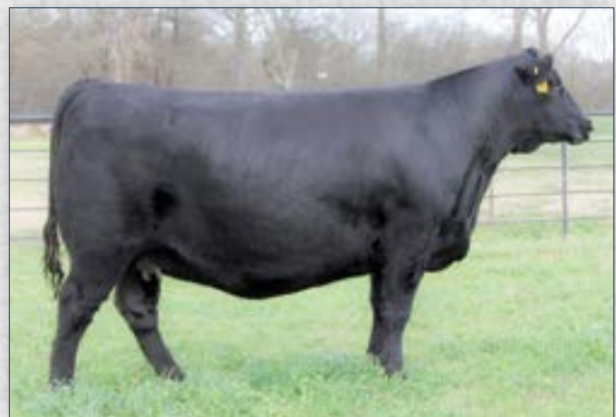
BCA Mary Blackbird 2742