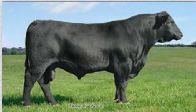
Sydgen Bullion - Sire of Lots 30-33

A good growth female whose bottom side is maternally focused with Consensus, Mandate and New Day 454. Due approx. 9-14-20 to Sydgen Expansion 5917.