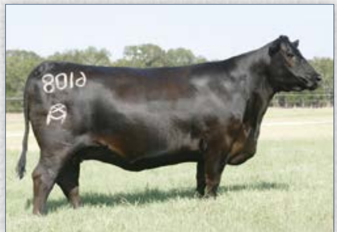
DRMCTR 111 Rita 6108 - Dam of Lot 6