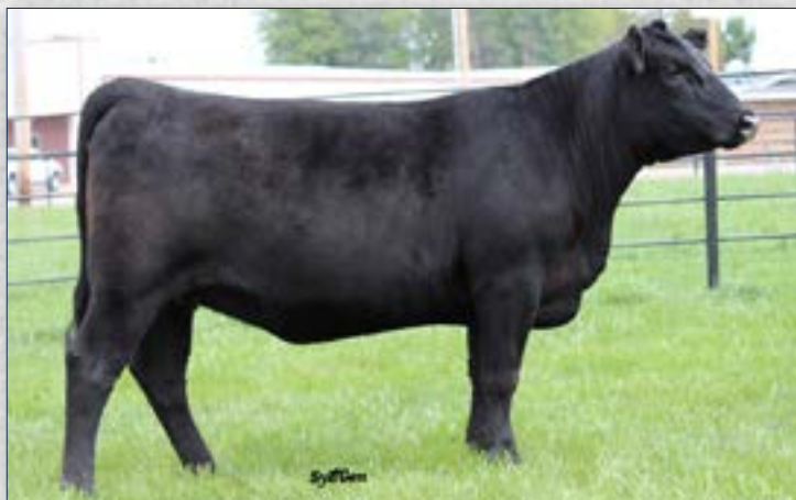
Sydgen Roseanne 1228 - Dam of Lot 63

This female comes from the $20,000 dam from the 2012 Sydgen sale. The sire, Googol, was the one time #1 $Beef sire in the breed and is a great source of outcross genetics. Due approx. 9-8-20 to SilFa Xpand x 1022-832 or Sydgen Big League 6014.