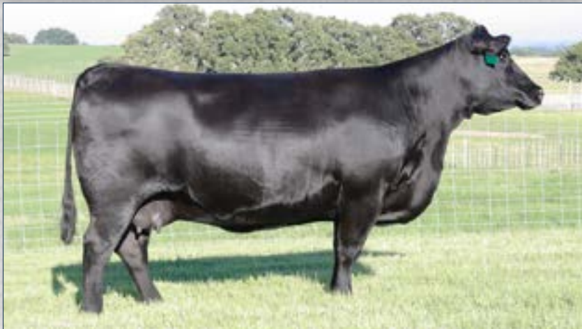
SJH Complete of 6108 1548 - Dam of Lot 3