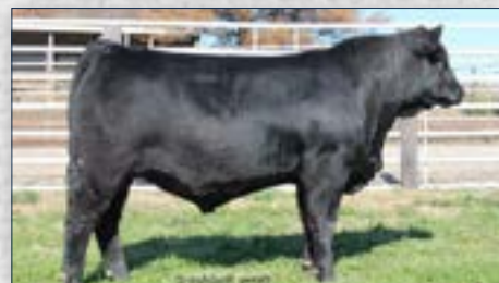
Hoover Hawkeye - Sire of Lot 16A

A daughter of Lot 16, this female grabs another gear for growth with a little bit different pedigree for most. Due approx. 9-18-20 to Silfa Xpand x 1022-832 or Sydgen Big League 6014.