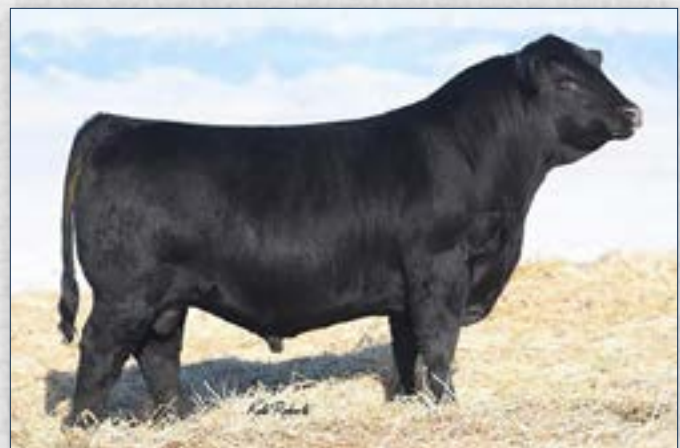
SydGen Expansion 5917 - Sire of Lot 10A

Due approx. 9-14-20 to Silfa Exceed x B244-818.