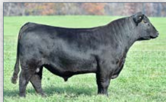
KB Full Measure C40 - Sire of Lot 6A

AI to Sydgen Rock Star on 4/23/20. Exposed to Silfa BC 3710B-868 4-27-20 to 5-28-20.