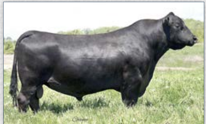
Jindra Acclaim - Sire of Lot 83A

A superior pedigree for calving ease and marbling and ranks in the top 2% for $Beef. AI to Byergo Black Magic on 4/23/20. Exposed to Silfa BC 3710B-868 4-27-20 to 5-28-20.