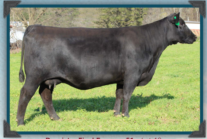
Bannister Final Empress 51 - Lot 49