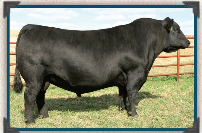
SAV Registry 2831