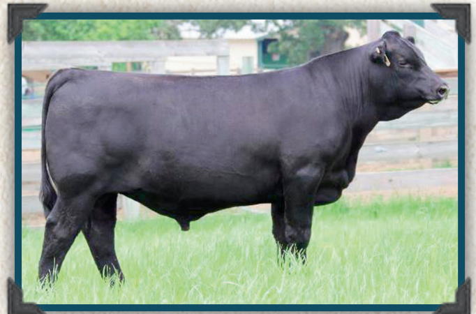
Springfield Ramesses 6124