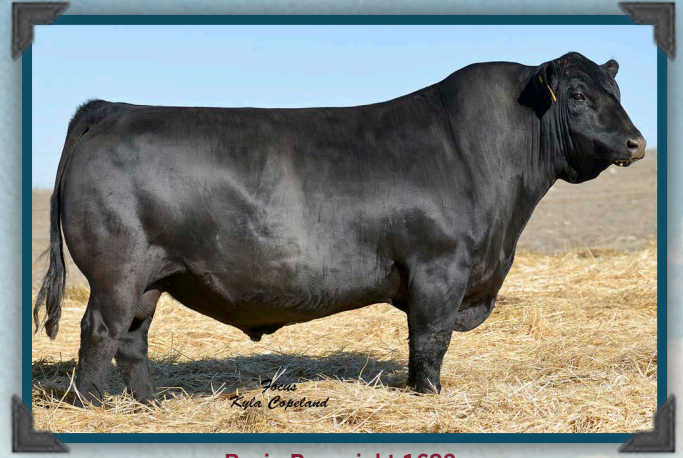
Basin Payweight 1682