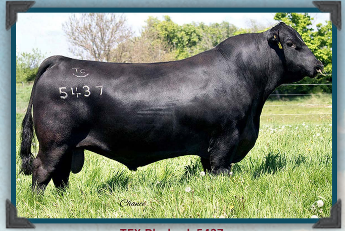
TEX Playbook 5437