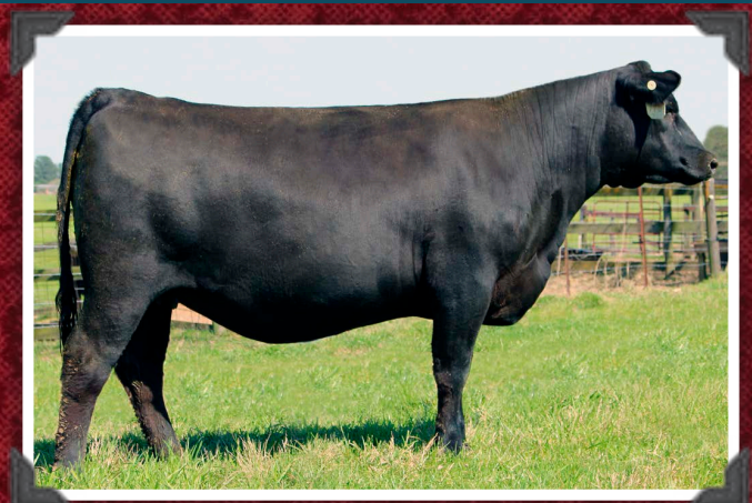
DA Ethel Eden 324 710 - Lot 36