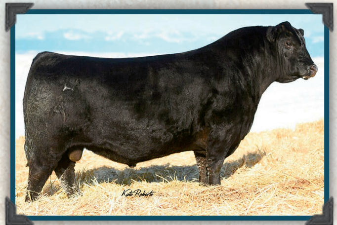
HA Cowboy Up 5405