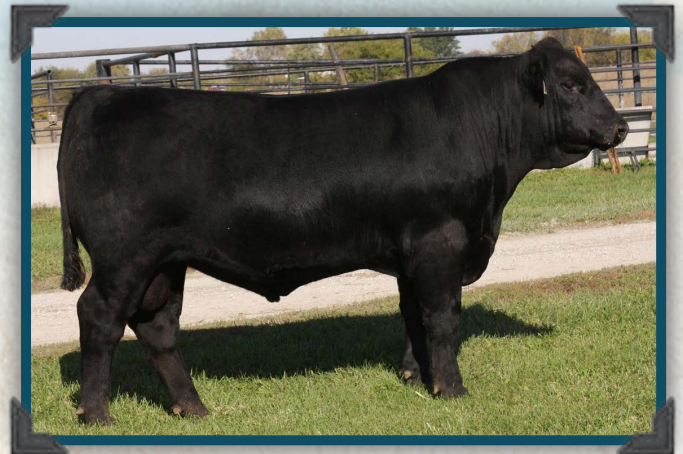
Byergo Blackstone 6325