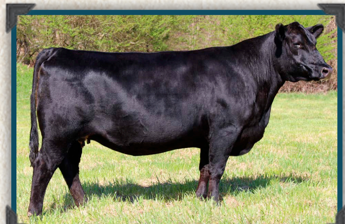
WCA Rita 3500 - Lot 16