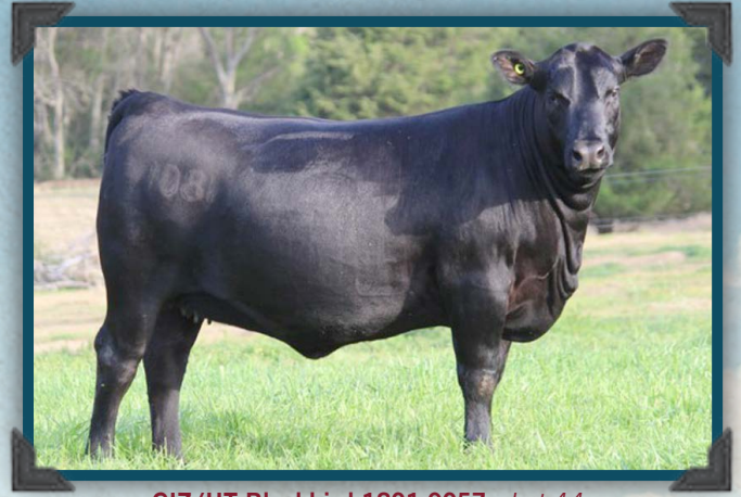
GIZ/HT Blackbird 1801 9057 - Lot 44

✓ This is a pregnancy is out of our donor dam Sinclair Queen Mother 6R109 who is a direct daughter of Rito 707 and sired by Reign. The recip B8 Registration 18165497 is out of a Donor in the Kinsington herd that we flushed until she came up being a DDC.