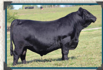
Byergo Titus 6340