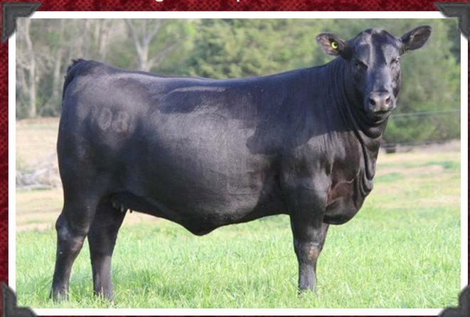
GIZ/HT Blackbird 1801 9057 - Lot 44