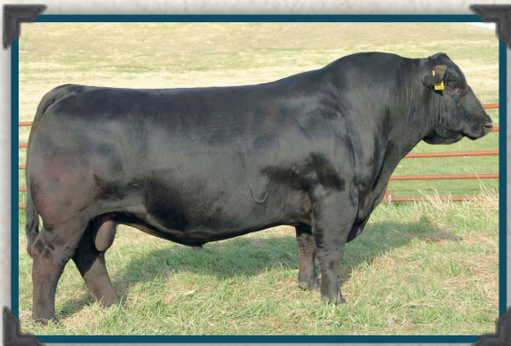
SAV Platinum 0010

✓ Lucy is from a long line of solid and famous cows. Her maternal Great-Grandmother is S A V Emulous 8145, which is the mother to SAV Final Answer 0035. This is a powerhouse cow family. Lucy 368's grandam is still in our herd, and what a great producer of calves. 368 was bred to the calving ease grandson to Basin Payweight, Basin Rainmaker 4404 on 12/22/2018 and has been checked to be safe in calf to deliver early October.