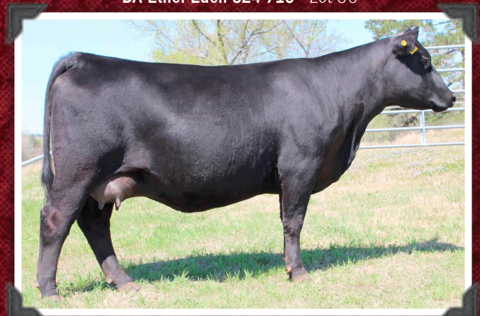
McGuire Esteem 610 - Lot 48