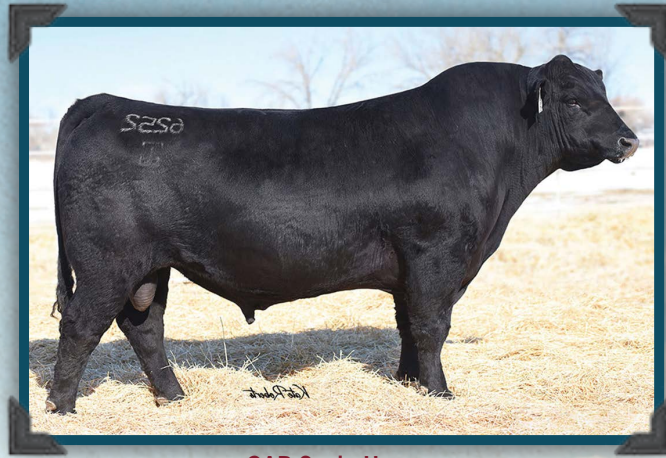
GAR Scale House