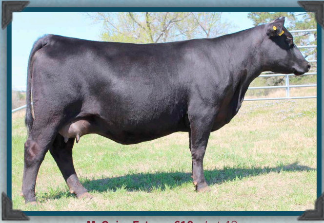
McGuire Esteem 610 - Lot 48