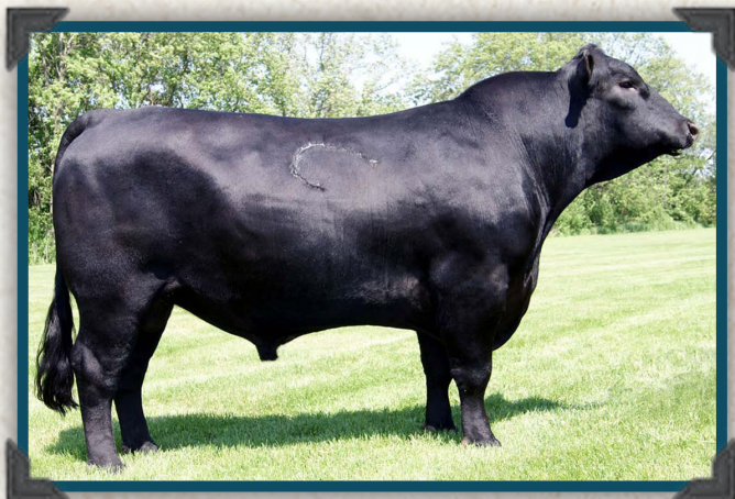
Connealy Sensation 964