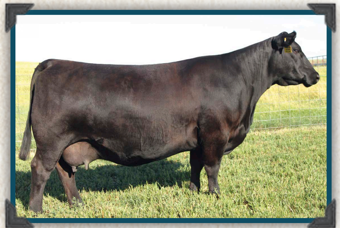
SAV Blackbird 9057 - Dam of Lot 44