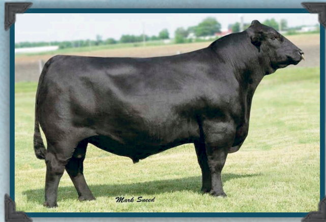
Quaker Hill Mile High 4EX31