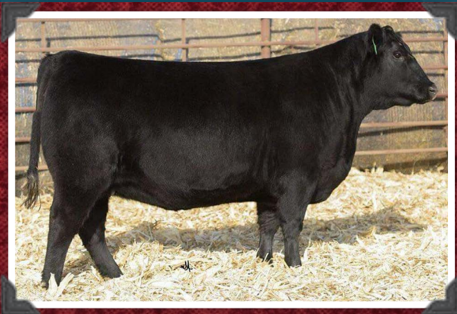
Vintage Blackcap 5194 - Lot 15

Do Not Miss This Great Opportunity! albauction.com