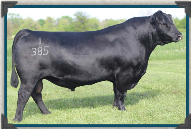
Connealy Comrade 1385

✓ BW: 51 ✓ This is a stand out heifer that has the potential to be a show heifer. She should be an easy keeping kind of cow.