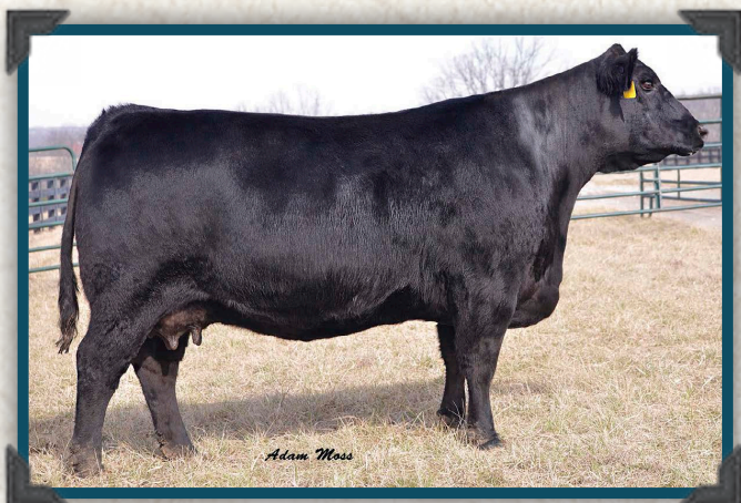
BoBo Blackcap 532U - Dam of Lot 67

✓ Lot 68A: Sex: Heifer DOB: 03-06-19 Sire: Tex Playbook