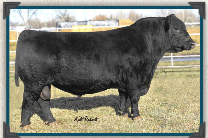
S Whitlock 179