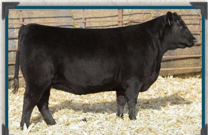
Vintage Blackcap 5194 - Lot 15