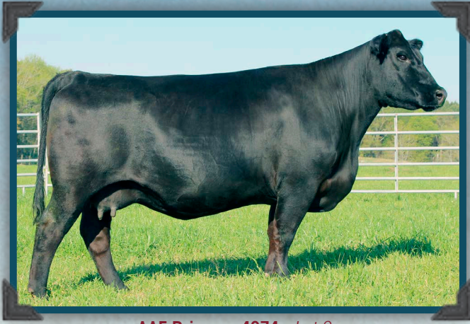
AAF Princess 4074 - Lot 2