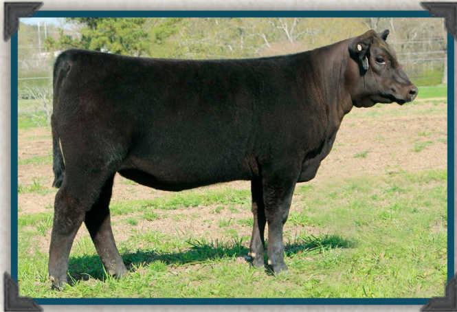
Hillside Barbara 618 - Lot 53

✓ Top 1% WW, Top 3% YW, Top 2% RADG, Top 3% YH and SC, Top 2% HP and CEM, Top 1% MW, Top 5% MH and CW, Top 2% RE, Top 4% FAT, TOP 15% $W, TOP 2% $F, TOP 4% $YG and TOP 2% $B. ✓ A really nice two year old QUAKER HILL RAMPAGE daughter. Her dam is from our Ruby cow family and is sired by GAR PREDESTINED. The Ruby cow family has been in our herd since 1991 and has been very productive for us. GIBBS RUBY 4 was the top cow picked out of the Gibbs herd in 1991 and the first cow we ever flushed. Sells with a nice SS NIAGARA heifer born 9/1/18. AI bred 12/19/18 to SAV RAINDANCE 6848. Examined Safe.