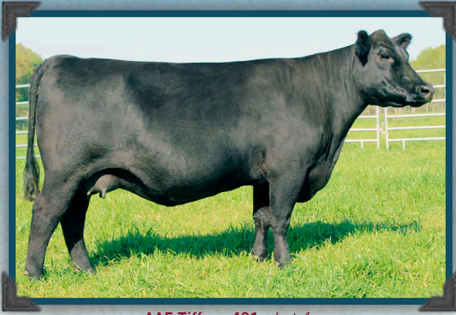
AAF Tiffany 401 - Lot 4