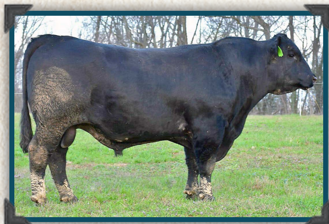
Bartels Ontime 2005 527

✓ Lot 69A: Sex: Heifer DOB: 03/06/19 Sire: Jindra Acclaim