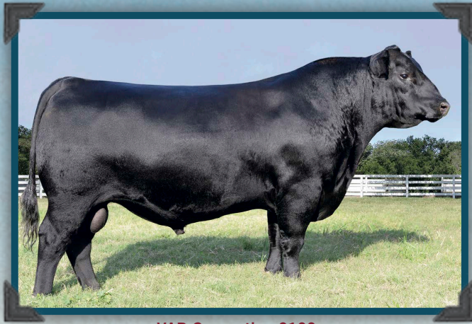
VAR Generation 2100