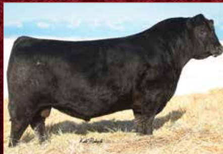
HA COWBOY UP 5405