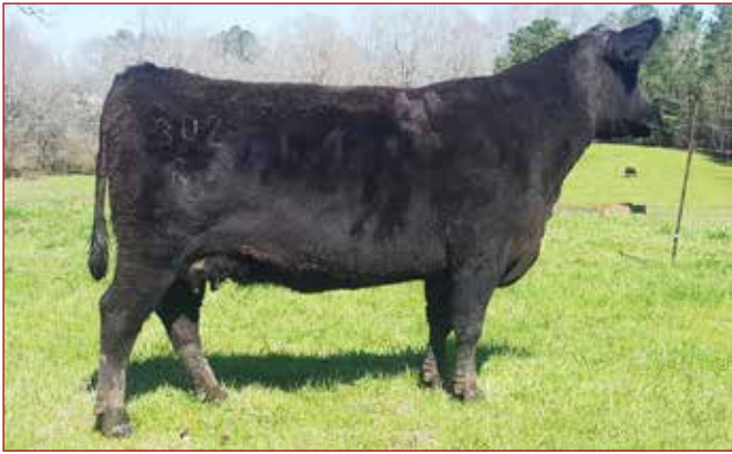
GR SANDRA 302 /// She sells as Lot 45.