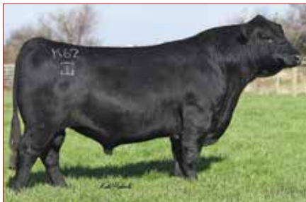
GAR SURE FIRE /// The proven and elite maternal and marbling sire of Lots 9A and 9B.