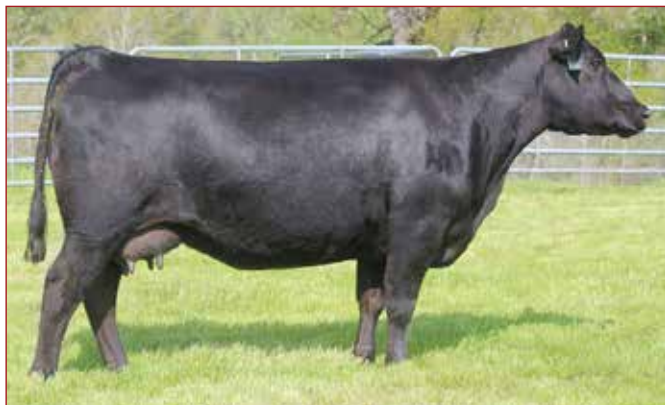
ZWT DONNA 4829 /// This daughter of SAV Hesston 2217 sells as Lot 44.