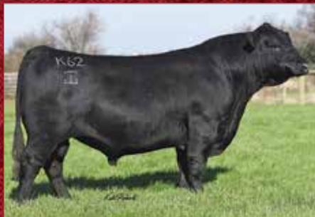
GAR SURE FIRE