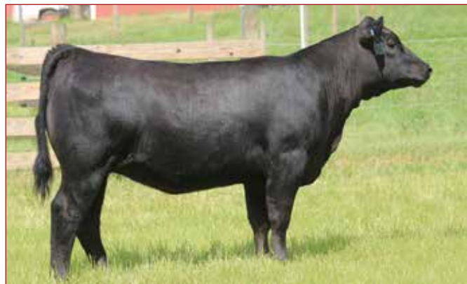
UPCHURCH G3 DONNA 369 /// She sells as Lot 44A.