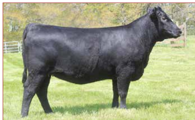
UPCHURCH EVERELDA 955 /// This daughter of Bruin Torque 5261 sells as Lot 4.

» Bred AI to calve 12/22/20 to SAV TERRITORY 7225 (HC Semen).