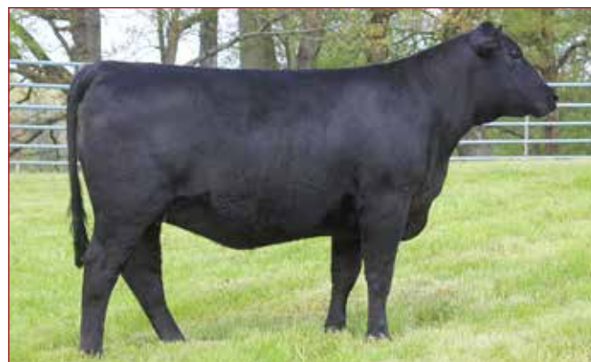
UPCHURCH BARBARAMERE 954 /// She sells as Lot 5.

» Bred AI to calve 12/22/20 to SAV TERRITORY 7225 (HC Semen).