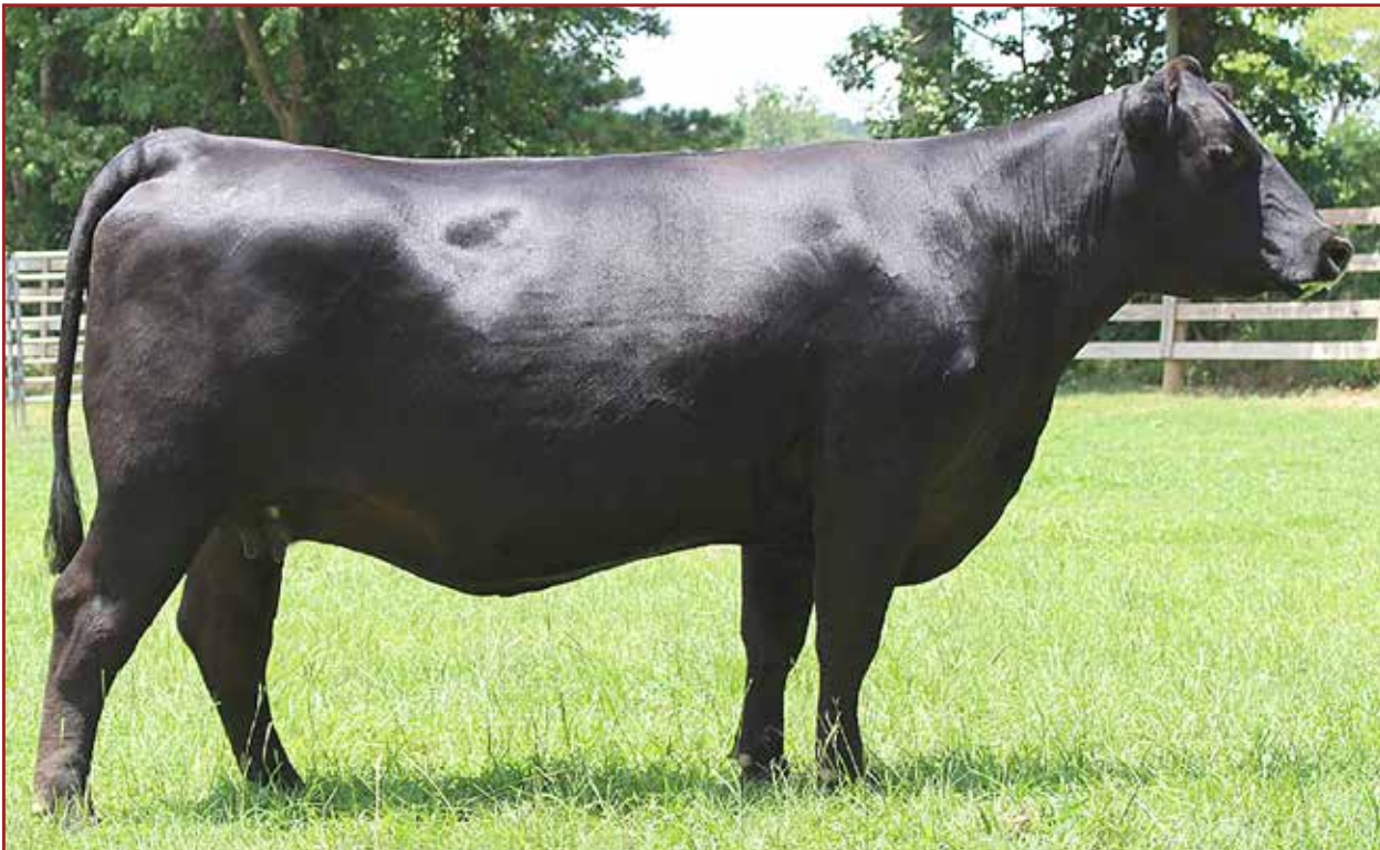
BOBO LUCY 5016 /// This daughter of GAR Prophet from the great Lucy cow family sells as Lot 32.

» Pasture Exposed after 2/22/20 to TRM ENHANCED 0608. Examined Safe.