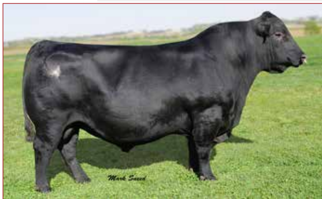
CONNELY IN FOCUS 4925 /// Daughters of this proven Pathfinder Sire sell.