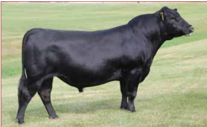
EWA WEST POINT /// The service of this high growth sire sells.