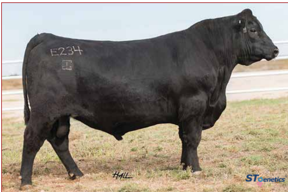
GAR PREDICTOR /// This ST Genetics herd sire is a maternal brother to Lots 9A and 9B.