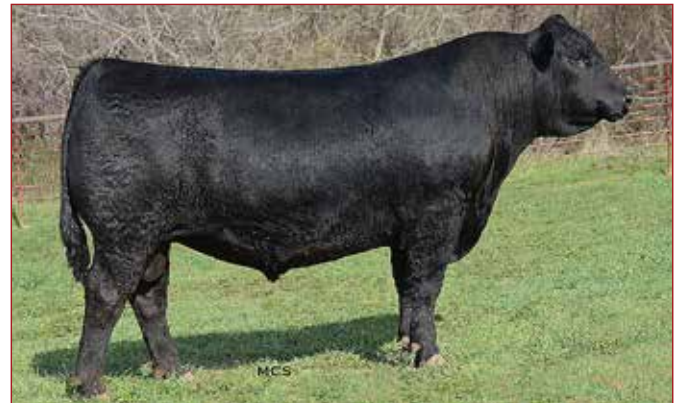
BYERGO/DOUBLE GG BLACKSTONE /// The sire of Lots 39A, 40A and 41A.