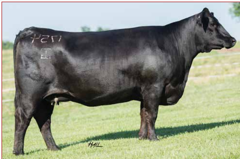
GAR PROPHET 1754 /// A maternal sister to Lots 9A and 9B.