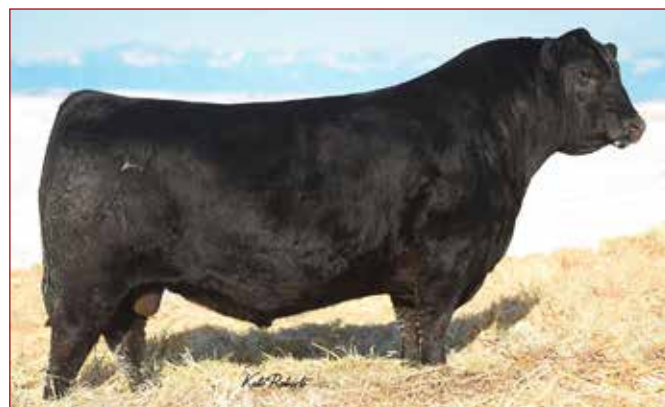
HA COWBOY UP 5405 /// Several daughters of this proven high growth sire sell.