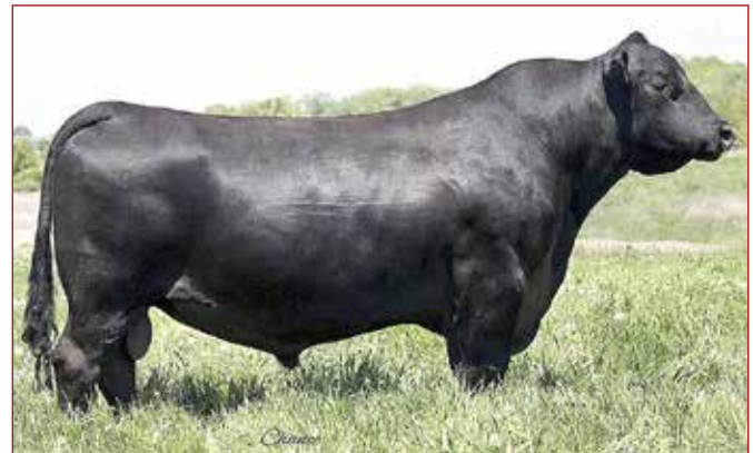
JINDRA ACCLAIM /// Progeny of this breed leader for end product traits sell throughout this offering.