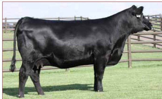
EXAR BLACKCAP 5879 /// The $80,000 valued maternal granddam of Lot 3.

» Phenomenal growth values that rank among the breed's most elite 1% in this daughter of the $350,000 Cowboy Up produced from a dam by the $200,000 one-half interest EXAR Upshot 0562B and her next dam is the $40,000 one-half interest EXAR Blackcap 5879 who in turn is a direct daughter of the powerful 2328 donor who is best known as a full sister to GAR Grid Maker.