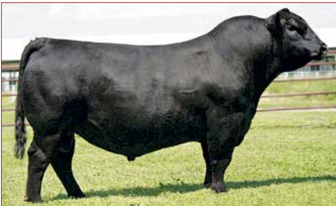
MAR INNOVATION 251 /// An impressive three-year-old daughter sells as Lot 34.