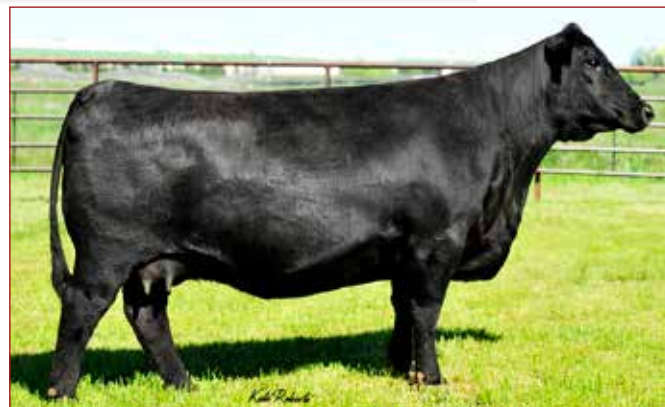
DEER VALLEY RITA 22110 /// The maternal granddam of Lots 13A and 13B.