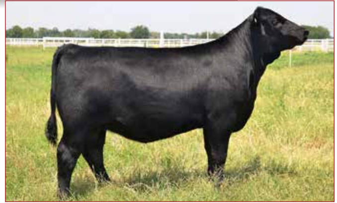
EXAR RITA 2912 /// The $60,000 one-half interest maternal granddam of Lot 14.