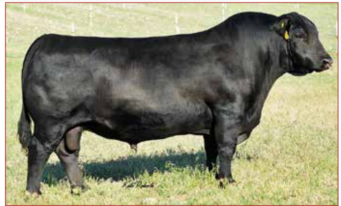
MILL BAR HICKOK 7242 /// A daughter sells as Lot 25 and his service is also well represented.

Bred AI 11/16/20 to MILL BAR HICKOK 7242 (HC Semen) then PE after 2/22/20 to TRM ENHANCED 0608.