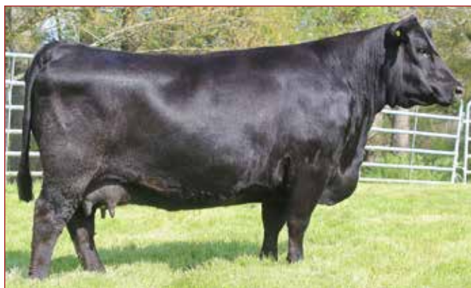
WK PRIMROSE 0002 /// She sells as Lot 7.

» Bred AI to calve 11/18/20 to MUSGRAVE 316 EXCLUSIVE.