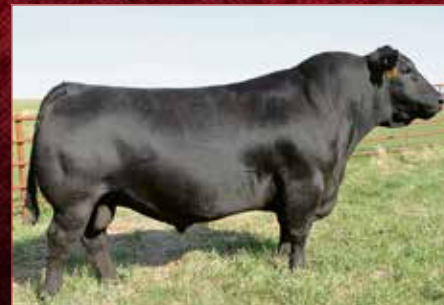
SAV RESOURCE 1441

THE PREMIER ANGUS SALE IN THE SOUTHEAST FEATURING BREED LEADING GENETICS.