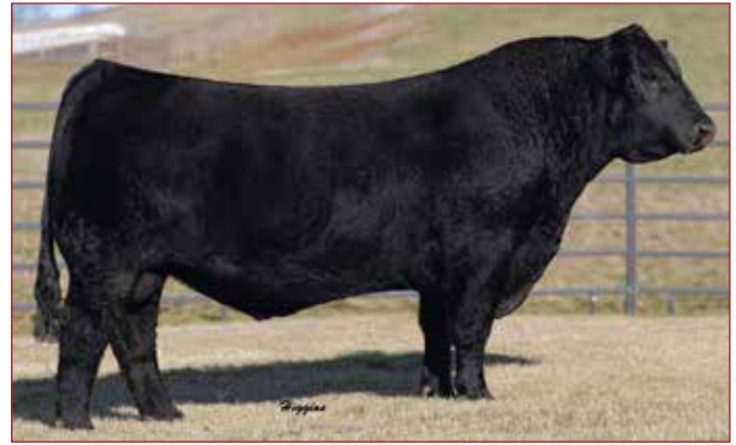
SAV EXTENSION 6856 /// The sire of Lot 33A.