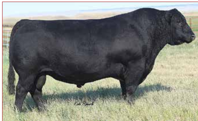
SYDGEN ENHANCE /// Progeny of this breed leading end product sire sell.