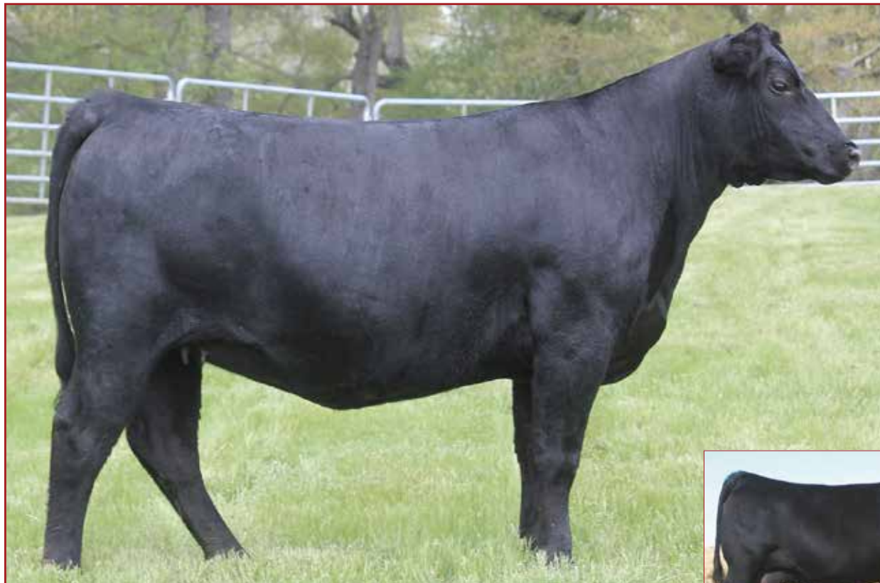
UPCHURCH ELBA 938 /// This impressive daughter of Remedy from the Elba family sells as Lot 16.