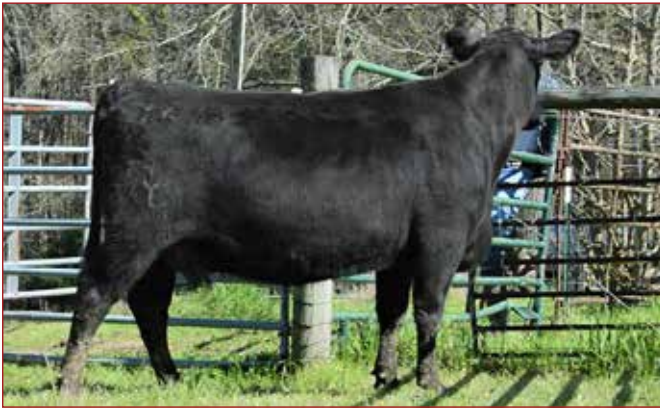
RC DORA 720 /// She sells as Lot 33.