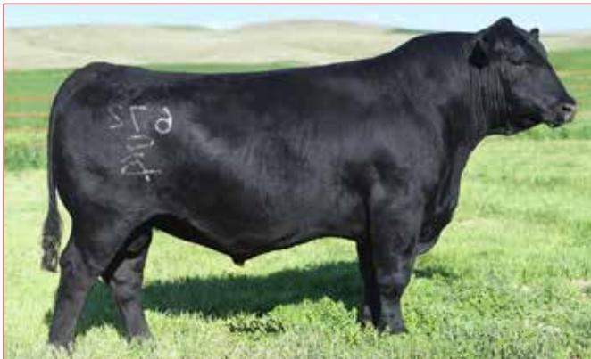
GB FIREBALL /// Several females sell carrying his service.