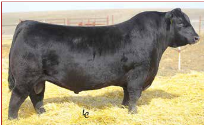
RB TOUR OF DUTY 177 /// A daughter sells as Lot 38.