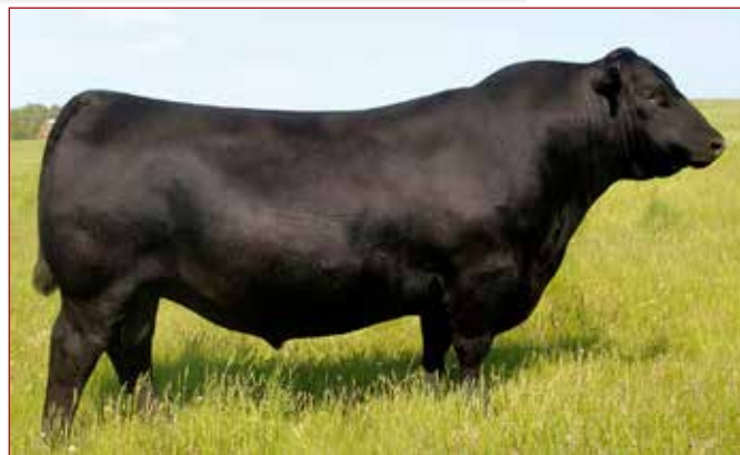
SAV RAINFALL 6846 /// His service sells.