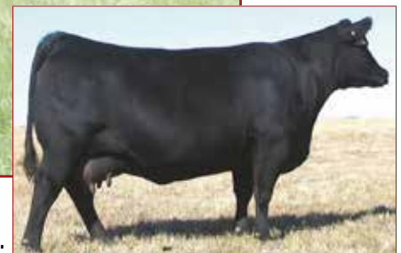
SAV ELBA 4436 /// The high-income producing Pathfinder maternal granddam of Lot 16.