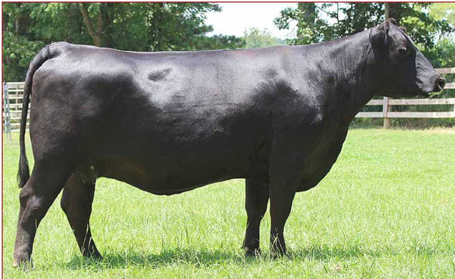
BOBO LUCY 5016 /// Daughters of this outstanding GAR Prophet daughter sell as Lots 1A, 1B and 1C.

» Bred AI 11/16/20 to MILL BAR HICKOK 7242 (HC Semen) then PE after 2/22/20 to TRM ENHANCED 0608.