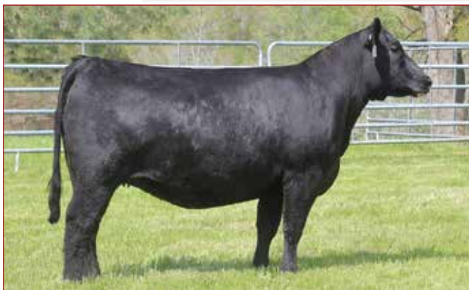
UPCHURCH MISS WIX 258 /// This Bruin Torque daughter sells as Lot 17.