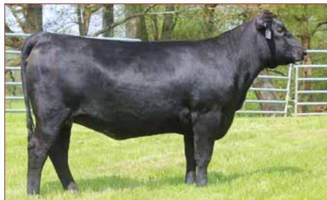
UPCHURCH EVERELDA 1008 /// This daughter of SAV 654X Rainmaster sells as Lot 18.