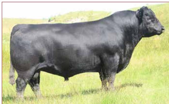
HOOVER COUNSELOR N29 /// The sire of Lot 8A and the service sire of Lot 8.

» Sells with a HEIFER calf at side (Lot 8A) born 1/7/20 sired by HOOVER COUNSELOR N29.