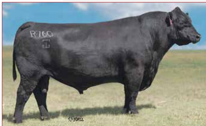
GAR SUNRISE /// A daughter sells as Lot 10.