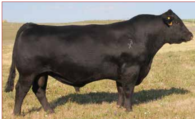
EXAR UPSHOT 0562B /// A daughter sells as Lot 59.