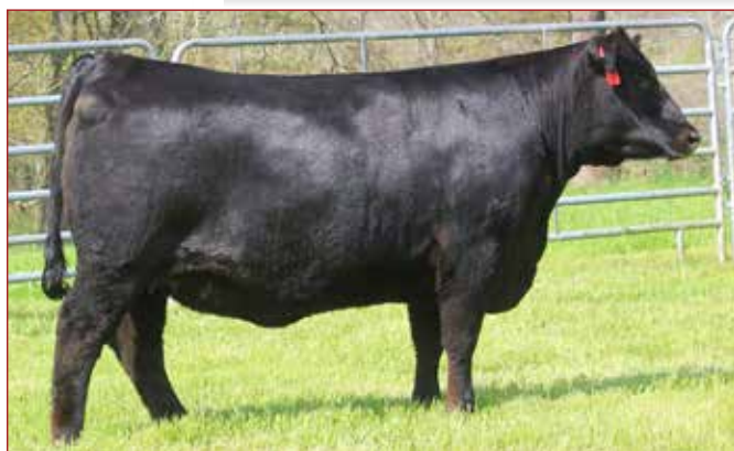
SHADY BROOK RITA 9005 /// She sells as Lot 6.