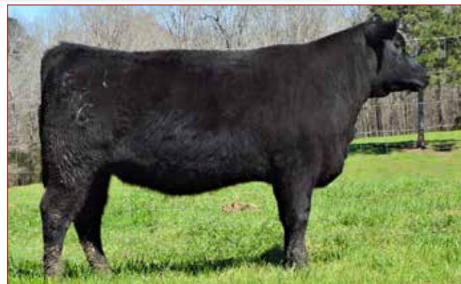
RC SANDRA 810 /// This Coleman Charlo 0256 daughter sells as Lot 19.