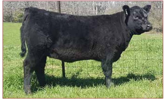
RC SANDRA 930 /// She sells as Lot 45A.