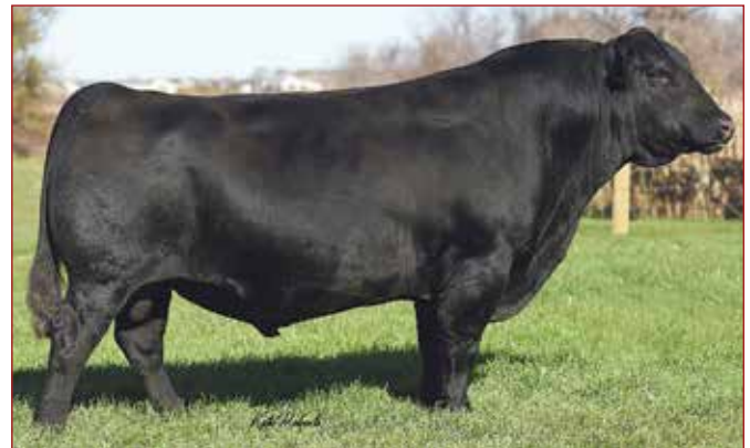
KCF BENNETT FORTRESS /// This long-time Select Sires AI sire has progeny and his service represented.