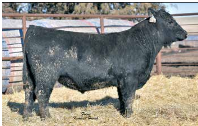
S A Comrade 8114 - Lot 46