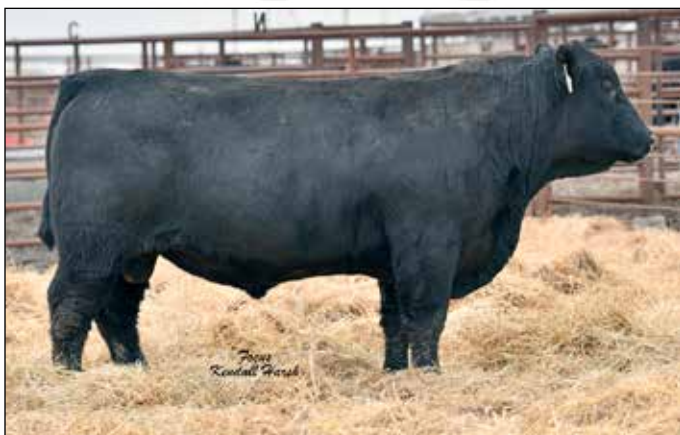
S A Full Power 7196 - Lot 10