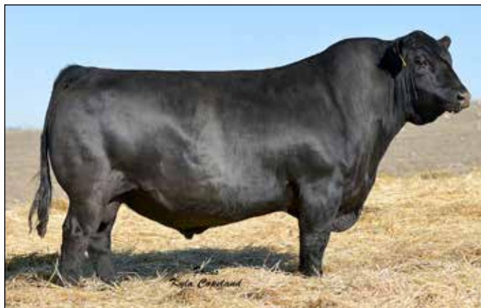
Basin Payweight 1682