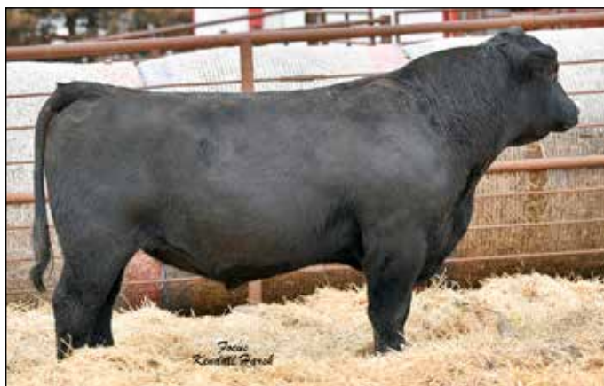
S A Broken Bow 7145 - Lot 14