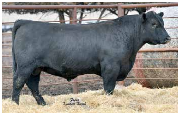
S A Forthright 7182 - Lot 6