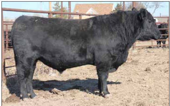
Gardens Timex P257

Gardens Timex is a bull with modest birth weight that will add volume, capacity, dimension and carcass merit to your calf crop. We have used him in our herd and his offspring have excellent vigor, performance and excel in the feedlots. He will produce long lasting, productive and profitable daughters to improve any herd. On the rail, he will deliver carcasses with quality and cutability that are sure to earn you grid premiums. Timex ranks in the top 3% on Marbling in the breed and is also a superior settler. Semen is available through Schreiber Angus.