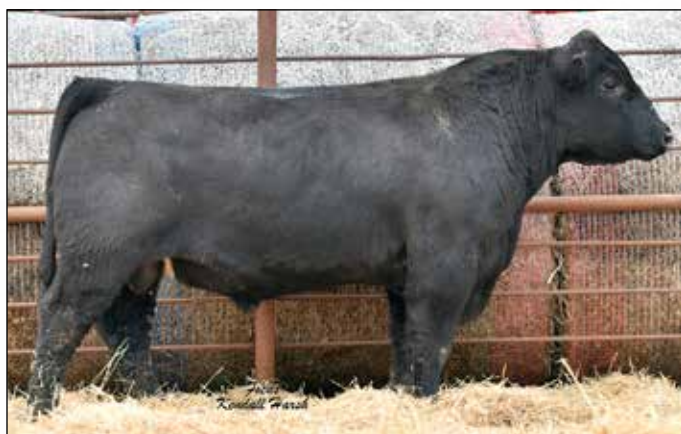
S A Black Granite 7173 - Lot 22