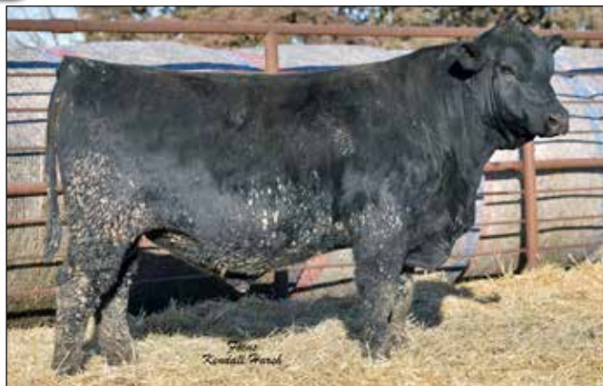
EXAR Prophet 7914B - Lot 27