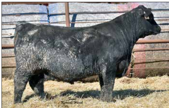
S A Tour of Duty 8113 - Lot 47