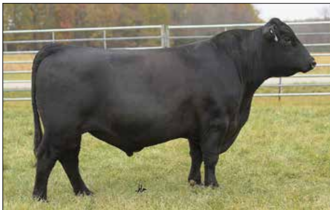
TC Country Wide 401