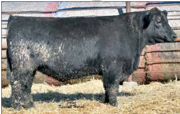
S A Timex 8239 - Lot 48