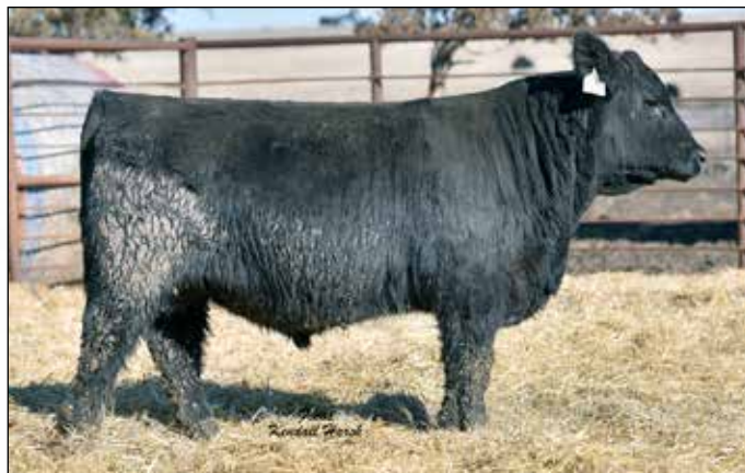
S A Beaver Boy 8188 - Lot 63