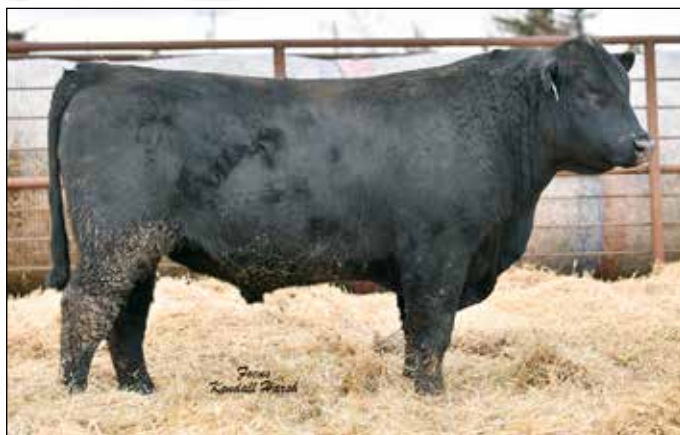
S A Hickok 7188 - Lot 13