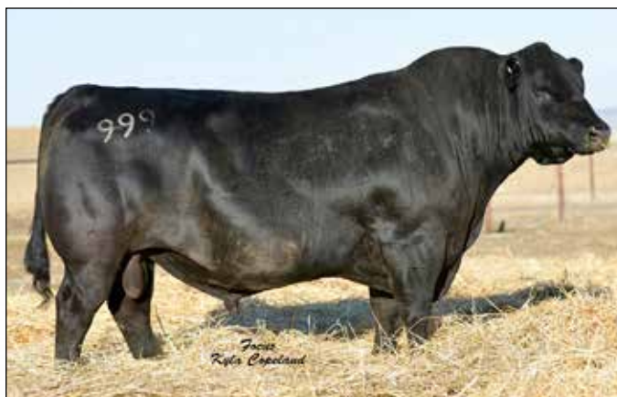
LD Emblazon 999