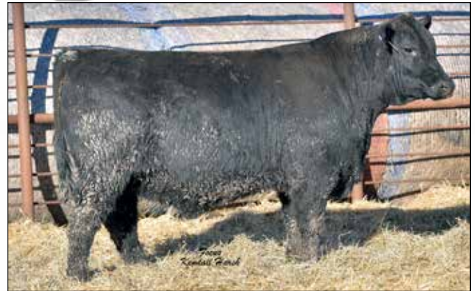
S A Cowboy Up 8119 - Lot 40