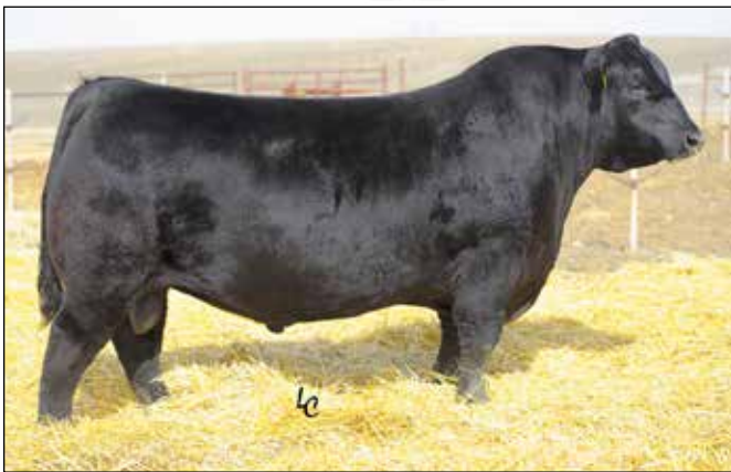
RB Tour of Duty 177