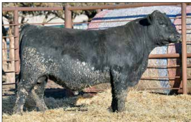
S A Top Game 7413 - Lot 29