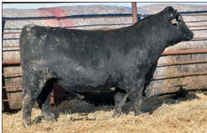
S A Broken Bow 8126 - Lot 61