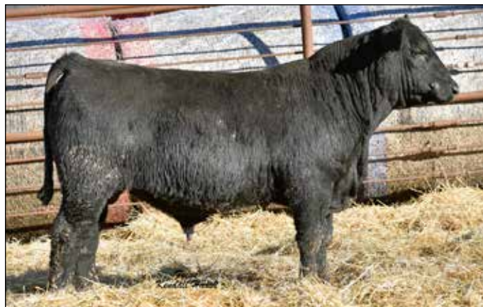
S A Power Tool 8241 - Lot 58