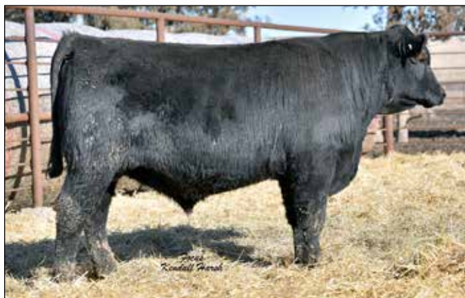
S A Infinity 8184 - Lot 67