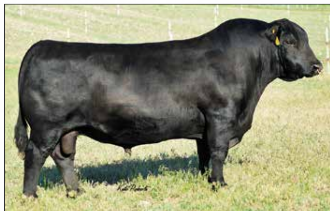
Mill Bar Hickok 7242