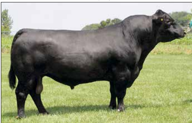
KM Broken Bow 002