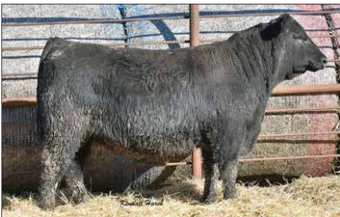
S A Authentic 8228 - Lot 43