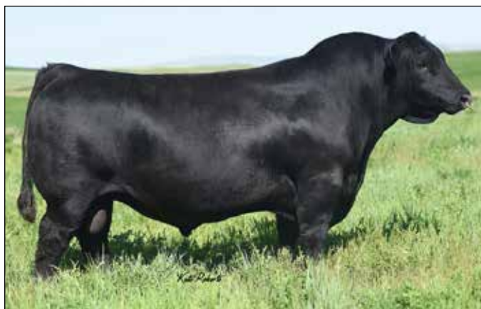
Ellingson Chaps 4095