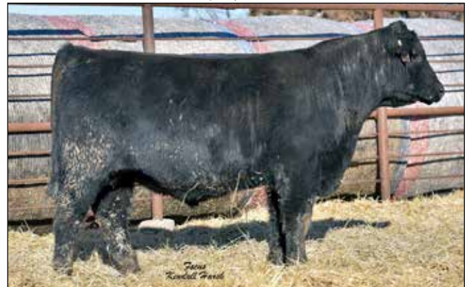
S A Cowboy Up 8117 - Lot 41