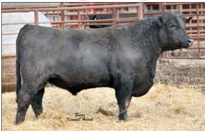
S A Timex 7305 - Lot 5