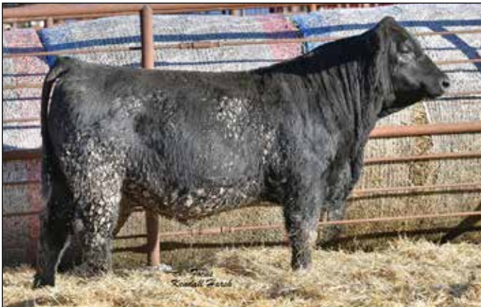
S A Top Game 7403 - Lot 32