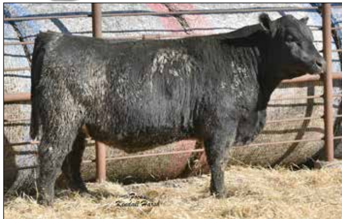
S A Chaps 8146 - Lot 50