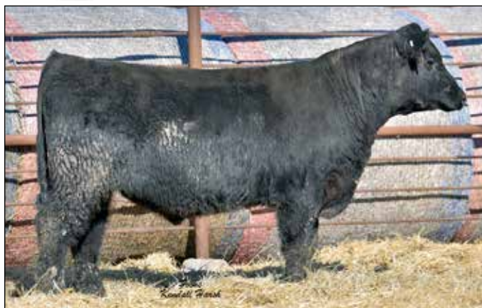
S A Timex 8313 - Lot 68