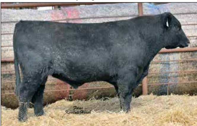
S A Timex 7219 - Lot 2