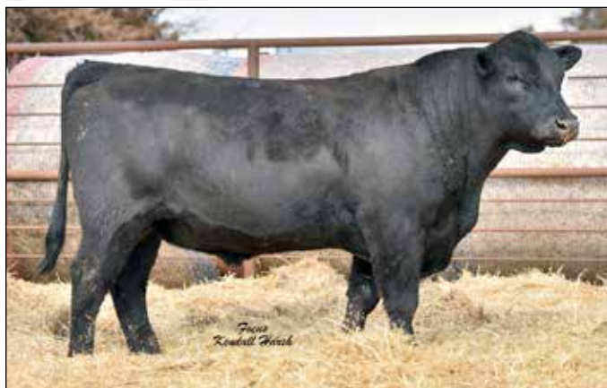
S A Infinity 7268 - Lot 18