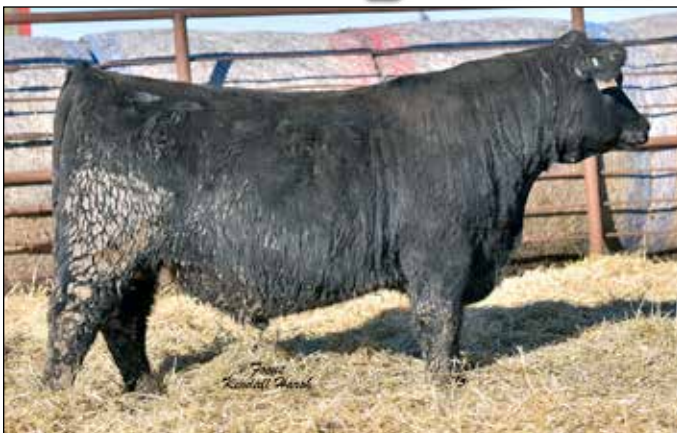
S A Emblazon 8145 - Lot 52