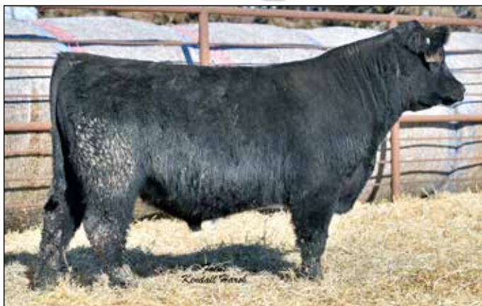
S A Power Tool 8186 - Lot 57