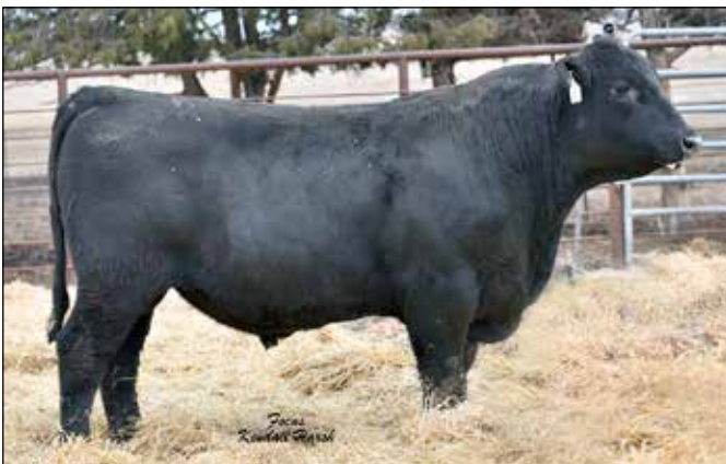
S A Country Wide 7207 - Lot 3