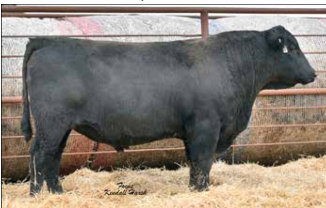
S A Hickok 7169 - Lot 4