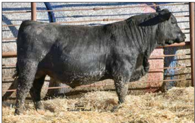
S A Top Game 7404 - Lot 34