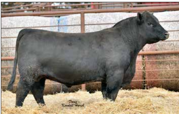
S A Courage 7102 - Lot 16