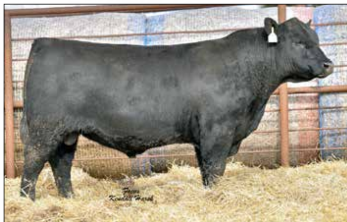
S A Broken Bow 7202 - Lot 9