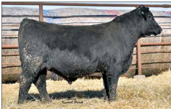
S A Fortright 8166 - Lot 56