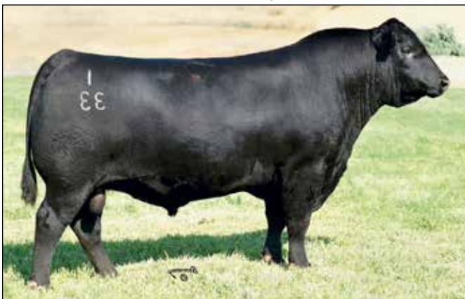
Connealy Black Granite