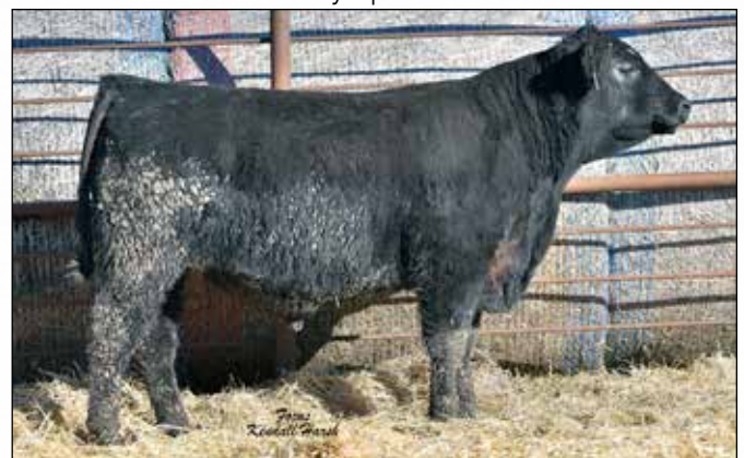
S A Command 8157 - Lot 42