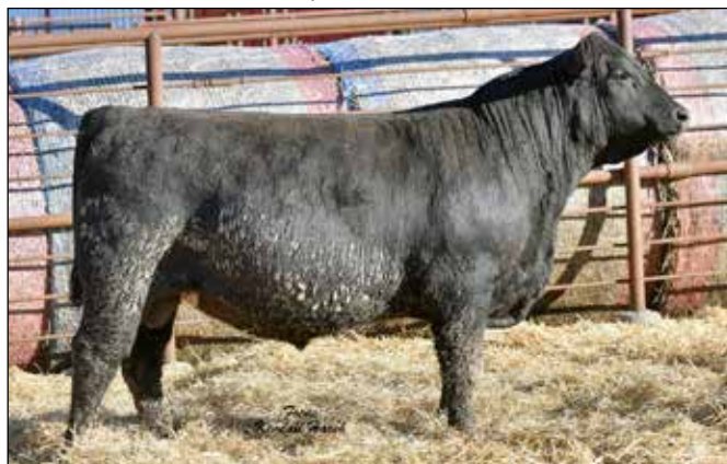
S A Top Game 7406 - Lot 28