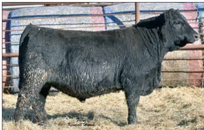
S A Chaps 8130 - Lot 51