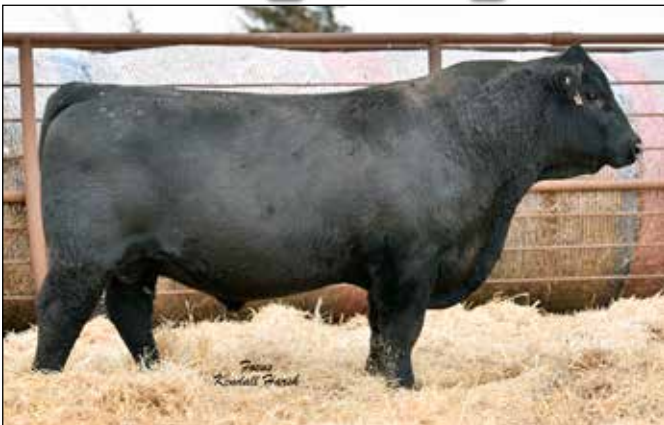
S A Payweight 7142 - Lot 1