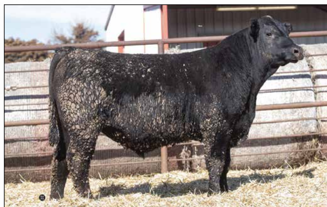
SA Traveler 9105 - Lot 80

#SAV 8180 Traveler 004 #SAV Emblynette 0429 Hoff Duracell SC 7307 1141 BB Margo 0031 #*WMR Infinity 141 #SF Heirsta 2120 SF New Design 3001 SF Wyola 4005