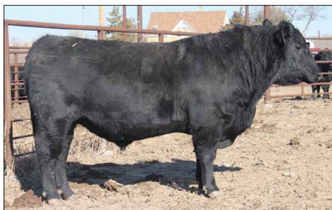
Gardens Timex P257

Gardens Timex is a bull with modest birth weight that will add volume, capacity, dimension and carcass merit to your calf crop. We have used him in our herd and his offspring have excellent vigor, performance and excel in the feedlots. He will produce long lasting, productive and profitable daughters to improve any herd. On the rail he will deliver carcasses with quality and cutability that are sure to earn you grid premiums. Timex ranks in the top 2% on marbling in the breed and is also a superior settler.