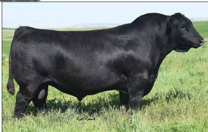
Ellingson Chaps 4095