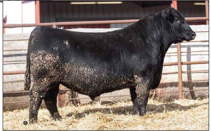
SA Power Tool 8403 - Lot 59