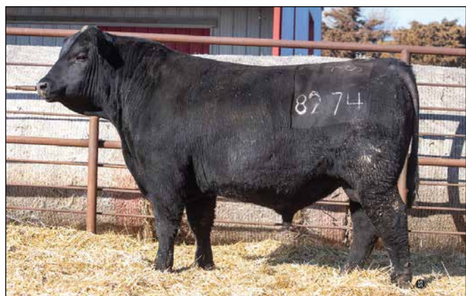
SA Authentic 8274 - Lot 13