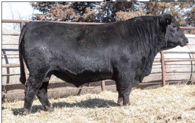
SA Emblazon 8167 - Lot 15