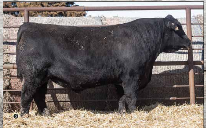
SA Infinity 8275 - Lot 25