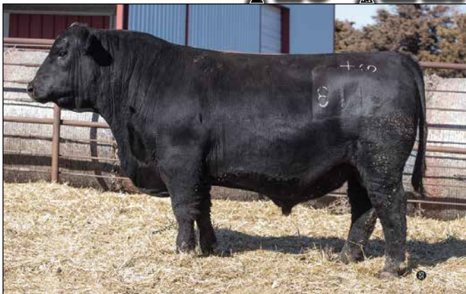
SA Cowboy Up 8116 - Lot 1