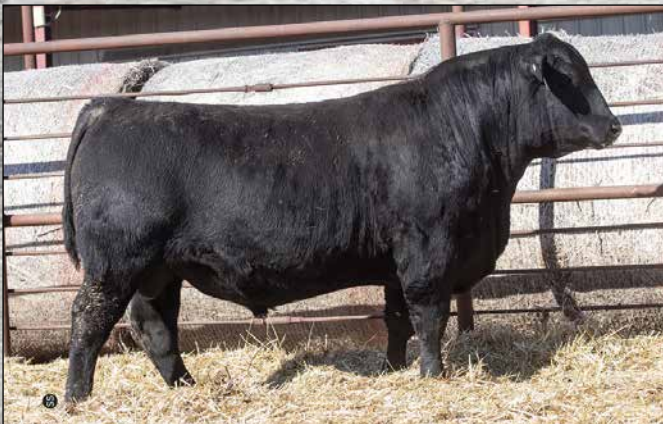
SA Chaps 8125 - Lot 19