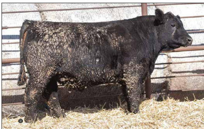
SA Power Tool 9283 - Lot 85