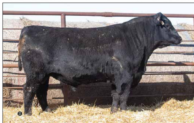
SA Beaver Boy 8216 - Lot 29