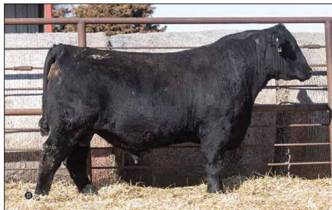
SA Power Stroke 8215 - Lot 31