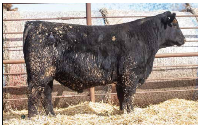
SA Cowboy Up 9241 - Lot 71