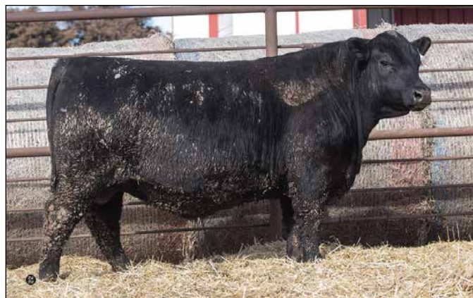
SA Power Tool 8414 - Lot 58