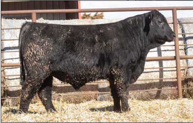
SA Hickok 9287 - Lot 90