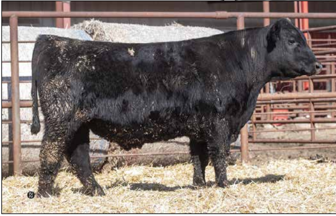
SA Rampage 9112 - Lot 72