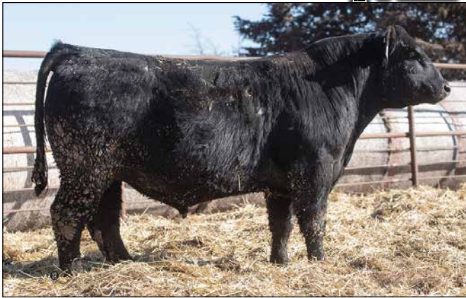
3F Dually 8616 - Lot 51