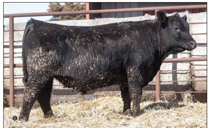
SA Rock Star 9296 - Lot 76