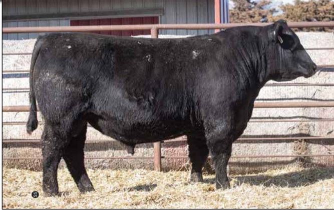
SA Timex 8286 - Lot 44