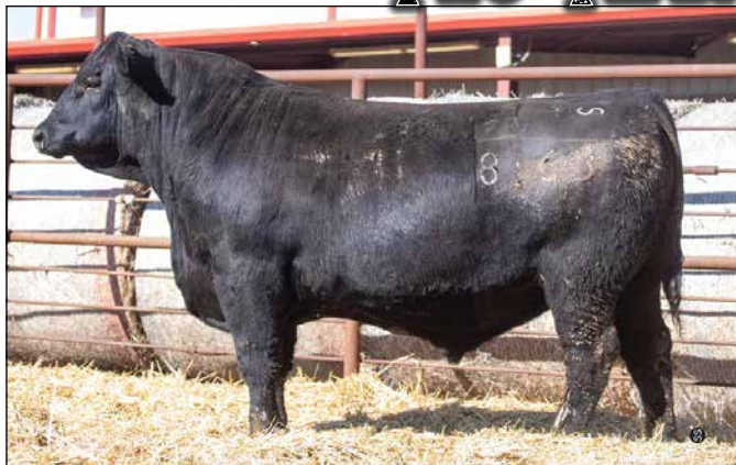
SA Predominant 8163 - Lot 27