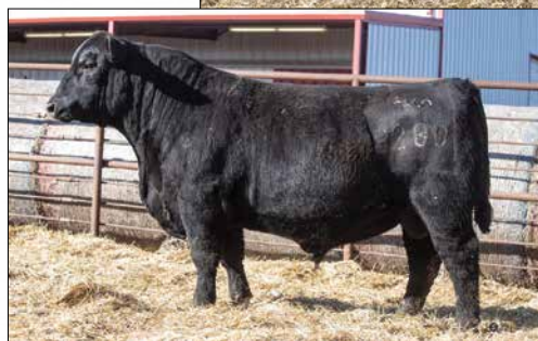
SA Infinity 8280 - Lot 23