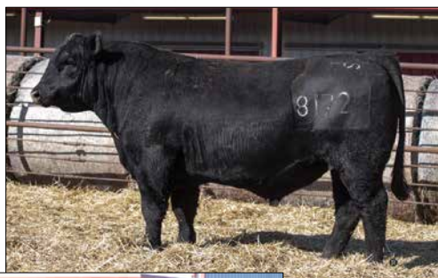
SA Upward 8172 - Lot 22