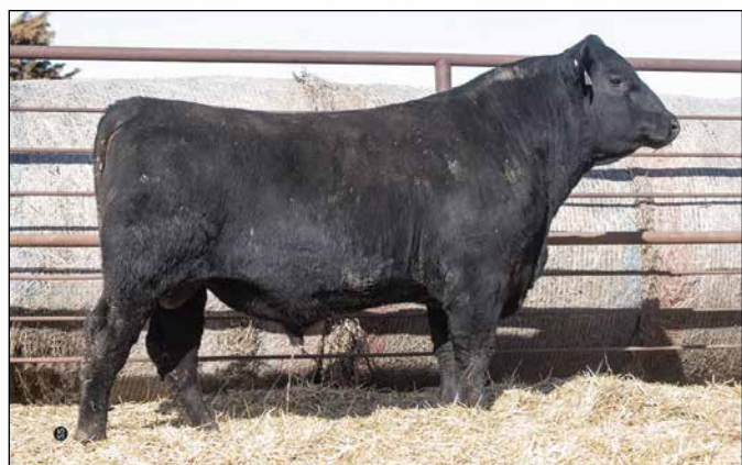
SA Forthright 8219 - Lot 40