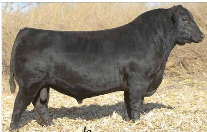
EF Commando 1366 - Sire of Baldrige Command C036