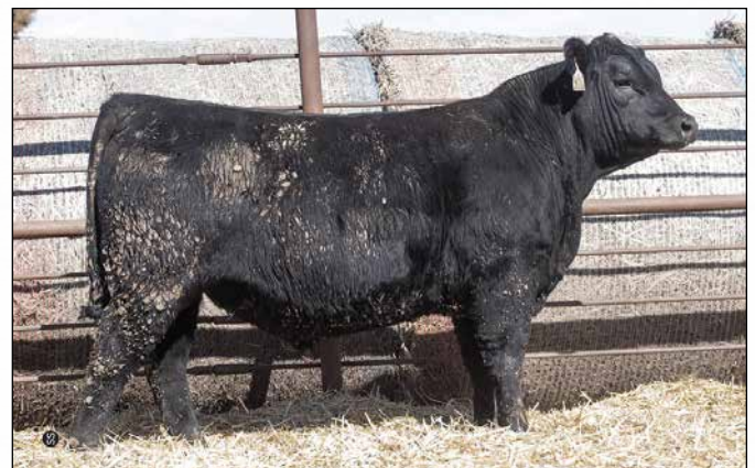
SA Dually 9107 - Lot 66