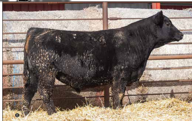
SA Command 9137 - Lot 81

+SydGen Rocky Road 2060 +SydGen Forever Lady 8420 #GAR Solution SF Wyola 6100 *Connealy Product 568 #Ebonista of Conanga 471 BB Best Answer 9084 SF Wyola 9165