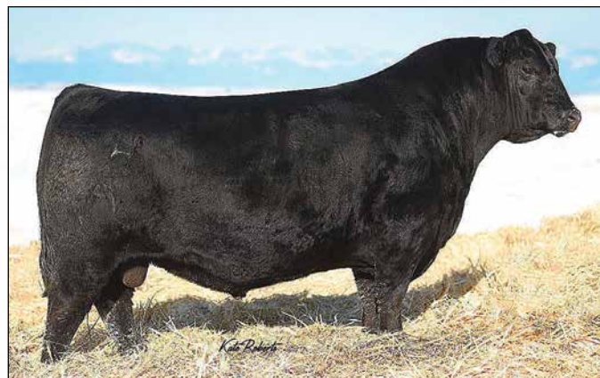
HA Cowboy Up 5405