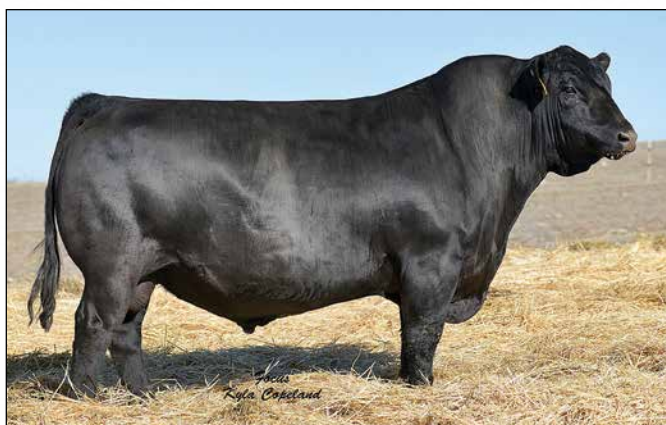
Basin Payweight 1682