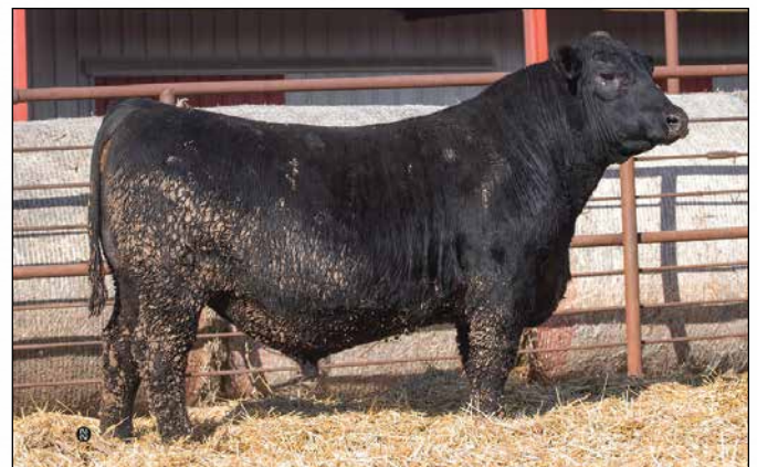
SA Power Tool 8407 - Lot 55