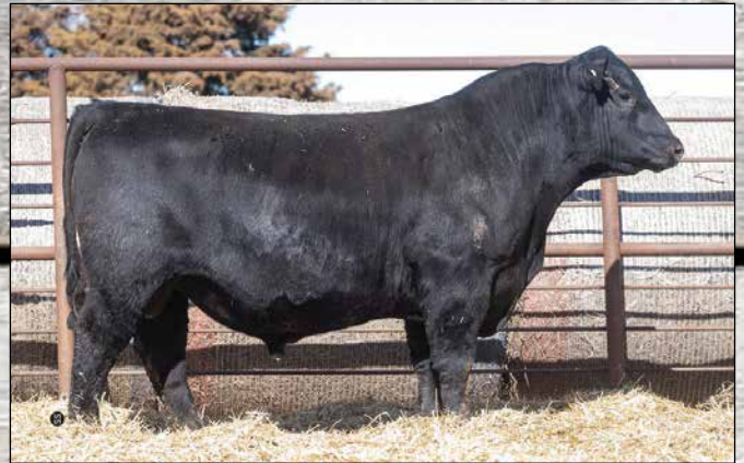
SA Fortright 8202 - Lot 8