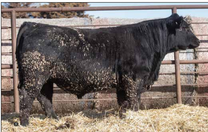
3F Epic 8626 - Lot 52