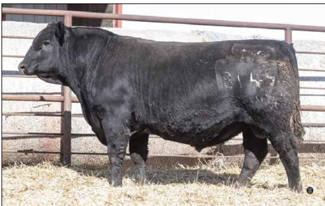
SA Epic 8149 - Lot 2