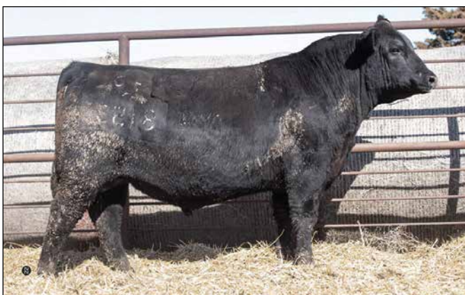
SA Rampage 8153 - Lot 4