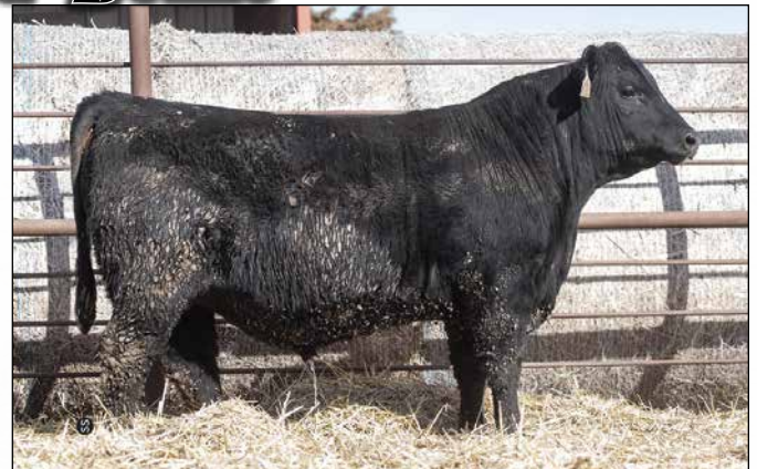
SA Dually 9101 - Lot 65