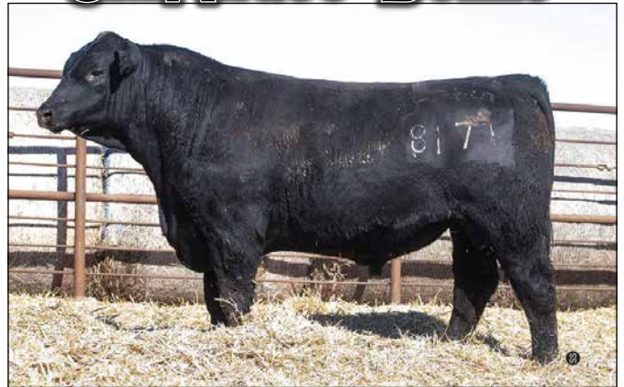
S A Yellowstone 8171 - Lot 48