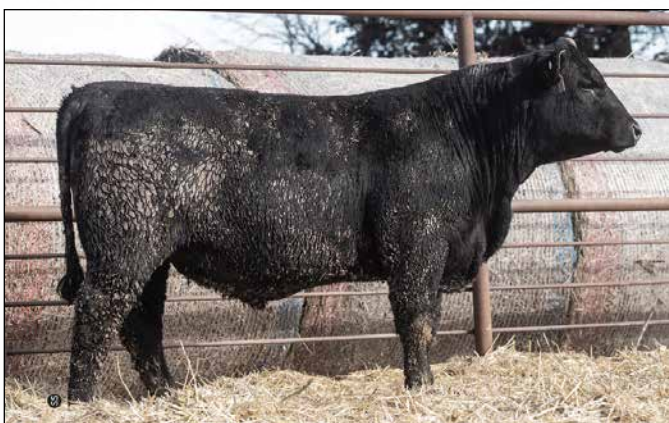
SA Tour of Duty 9280 - Lot 68