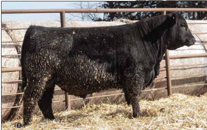
SA Payweight 9292 - Lot 67