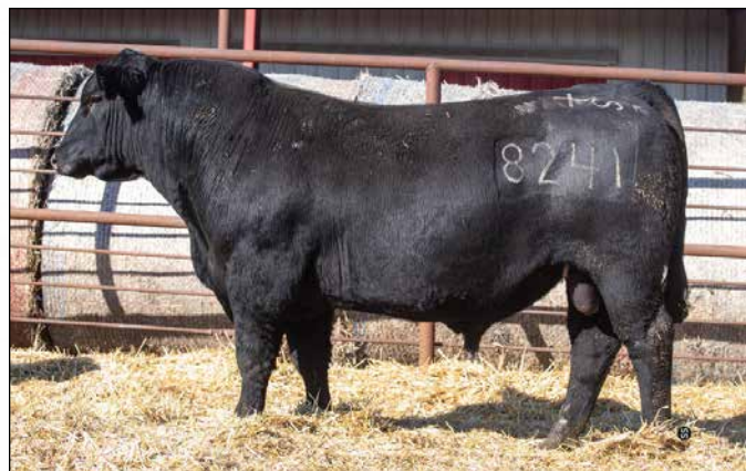
SA Power Tool 8241 - Lot 33