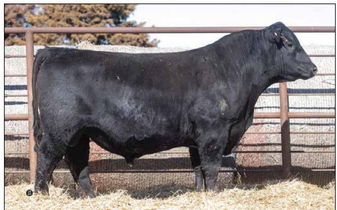
SA Forthright 8202 - Lot 8