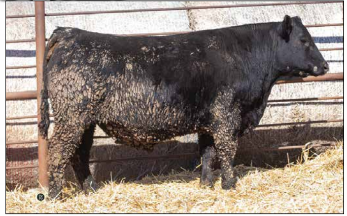
SA Conquest 9229 - Lot 75