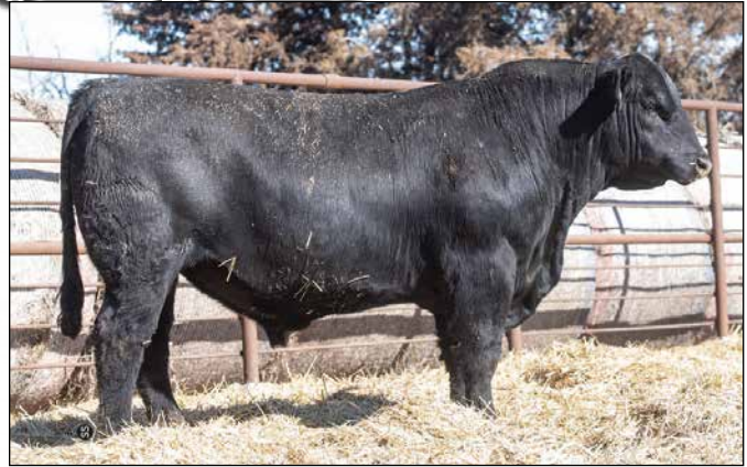
SA Power Too 8298 - Lot 5