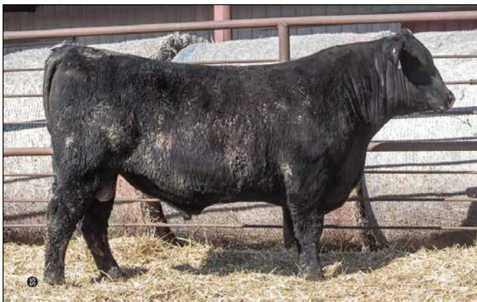
SA Tour of Duty 8101 - Lot 3