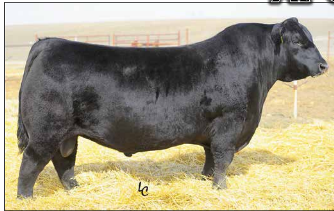
RB Tour of Duty 177