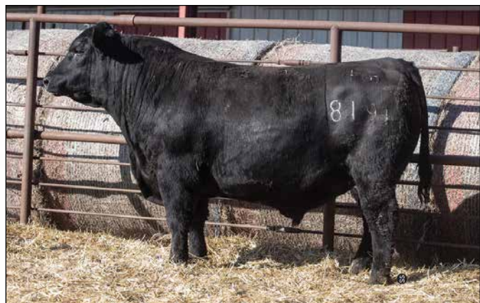
SA Final Product 8191 - Lot 35