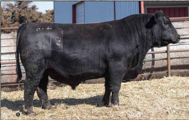
SA Cowboy Up 8116 - Lot 1