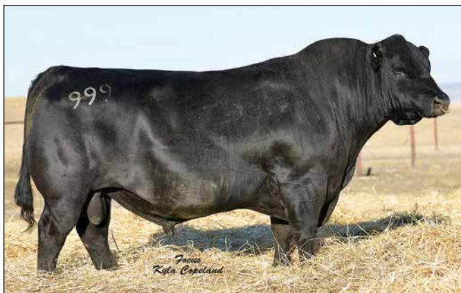
LD Emblazon 999