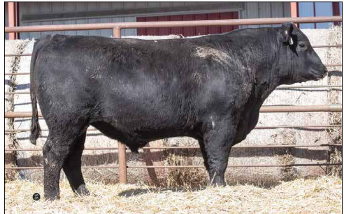
SA Final Product 8168 - Lot 6