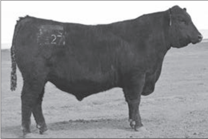
RRR BRONC R0327 - Lot 14