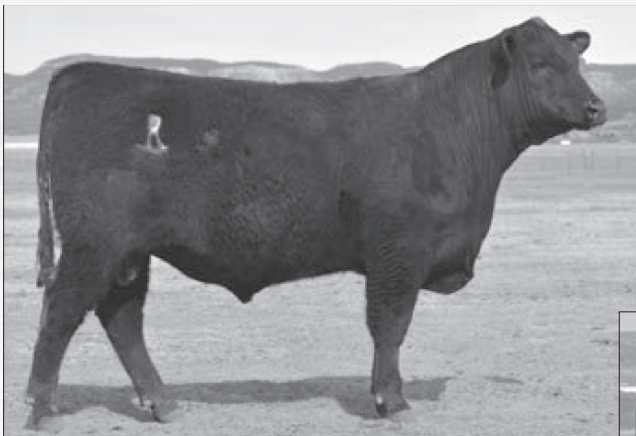
RRR 100X R0187 - Lot 38