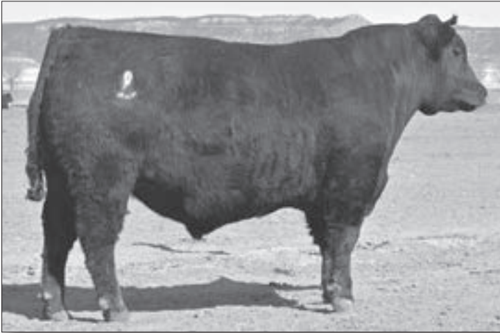
RRR TITAN R0376 - Lot 29