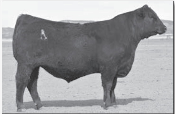
RRR TITAN R0796 - Lot 33