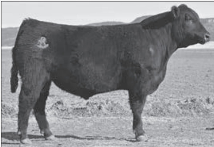
RRR BRONC E039 - Lot 19