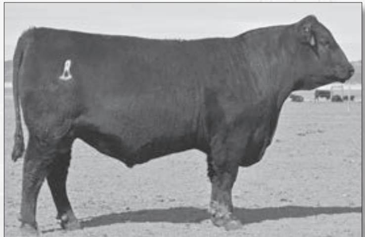
RRR TITAN R0236 - Lot 34