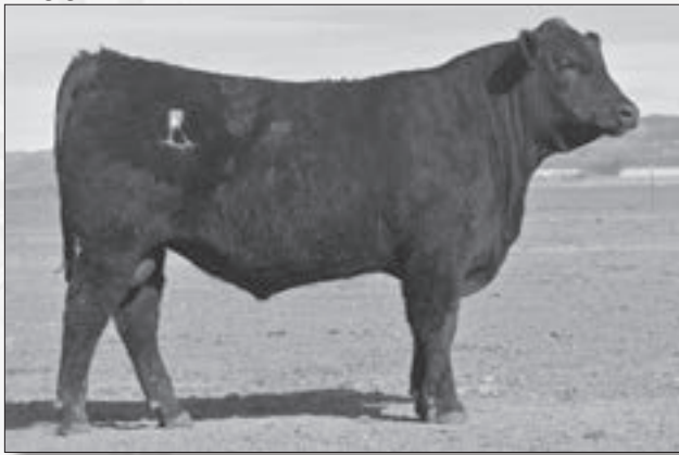
RRR TITAN R0257 - Lot 24