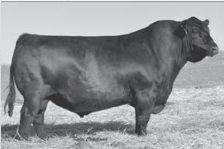
VAR DISCOVERY 2240

1682 is one of the elite sires of the breed. He currently ranks in the top 25% for 9 different EPDs or $Values. He consistently produces progeny that are deep and easy fleshing with excellent udder quality on the females. 1682 has been widely desired for the combination of multiple traits including end product merit. Nothing is more challenging in the breed today than to excel in desired traits but also to have replacement females be able to maintain themselves and perform in tough country. 1682 looks to be as close to that goal as any sire in the breed today.