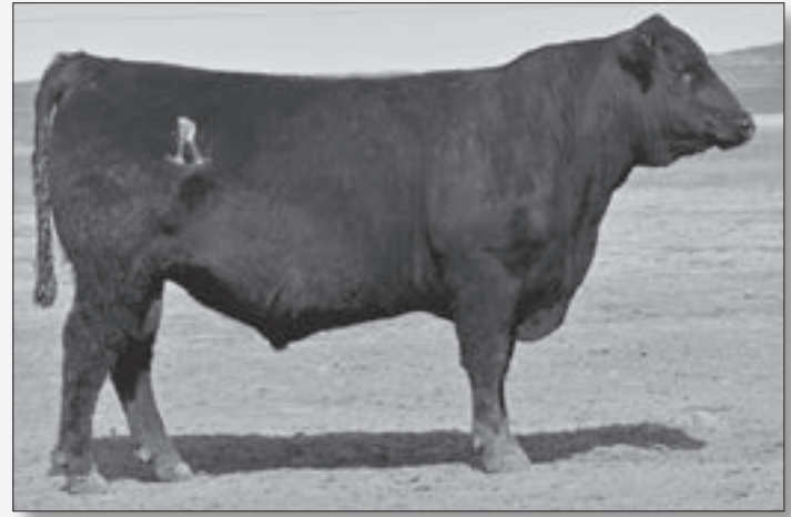
RRR COMMANDO M0247 - Lot 55