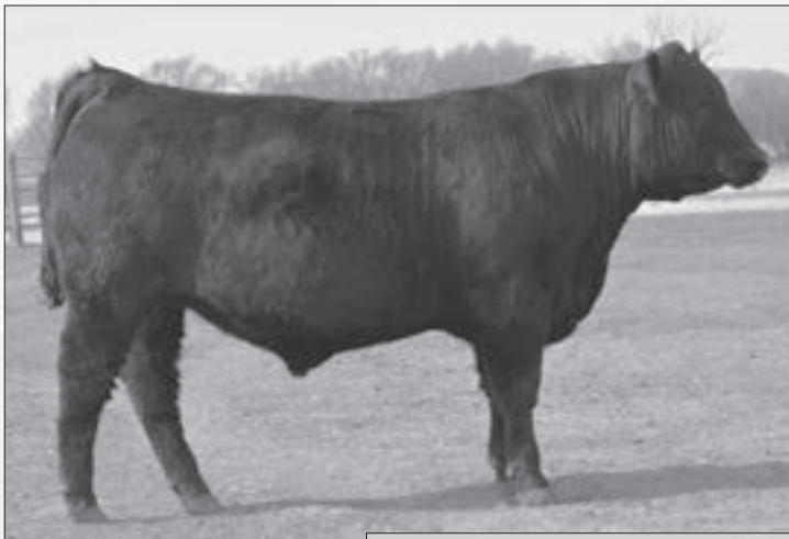
RRR COMPASS 23 - Lot 22