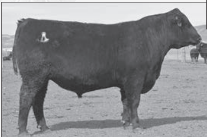
RRR COMMANDO H0286 - Lot 60