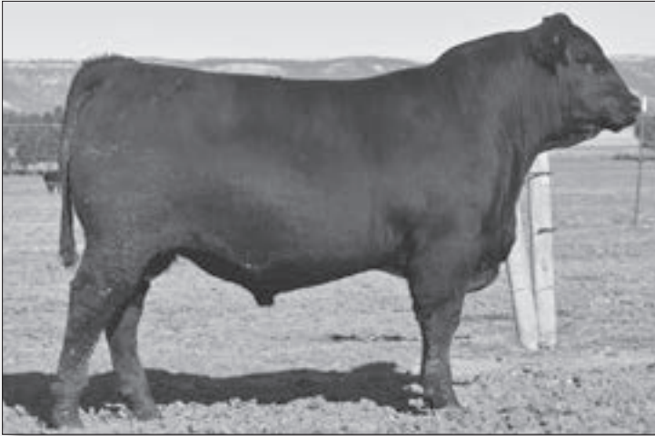
RRR TITAN R605 - Lot 26