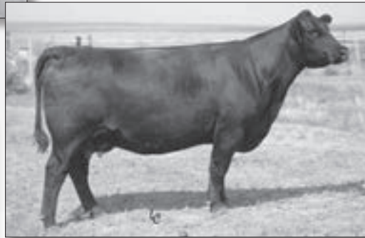
BALDRIDGE BLACKCAP W70 - The dam of Lot 3 and featured Triple D donor in IL.