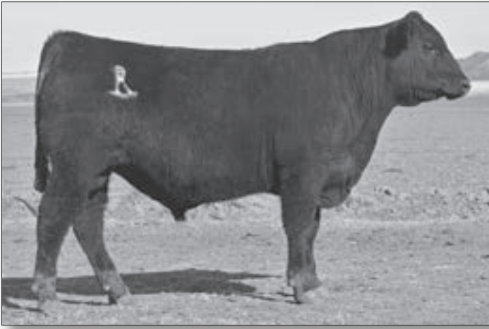
RRR COMMANDO M0767 - Lot 54