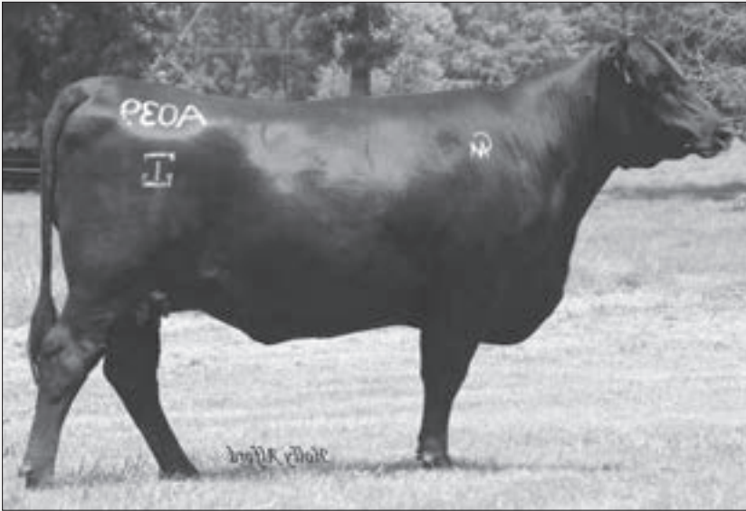
G A R 5050 NEW DESIGN A039 - The deceased donor dam of Lots 7-9.