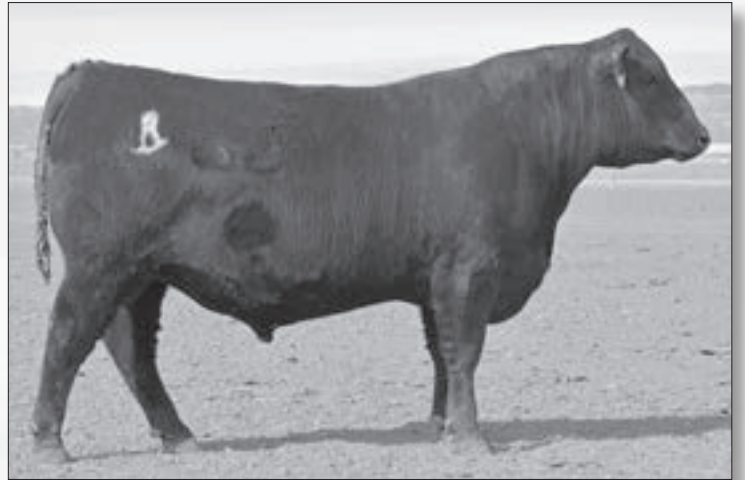
RRR GOLD RUSH H0136 - Lot 45