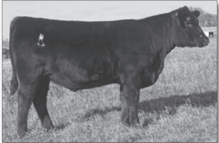
RRR - 7 OAKS RITA R0127 - Full sister to Lots 38-40 owned with Hott Farms, IL and a feature of the 2018 Foundation Female Sale, CO.