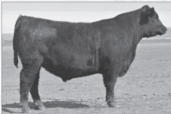
RRR COMMANDO H0266 - Lot 63