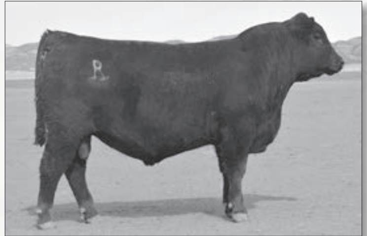
RRR TITAN R0287 - Lot 27