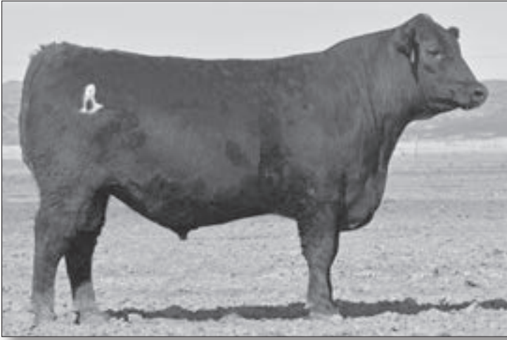
RRR GOLD RUSH H0116 - Lot 44