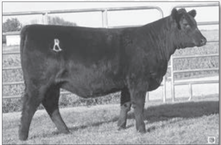
RRR - 7 OAKS RITA R0177 - Full sister to Lots 38-40 and owned with Zumbrunnen Angus, WY.