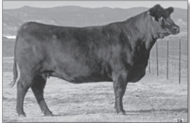
DSA NEW DIRECTION 1022 - The now-deceased donor dam and one of the great cows of the breed. She is the donor dam of Lots 24 and 25 and multiple other bulls in the offering. Owned with 7 Oaks Angus, IA.