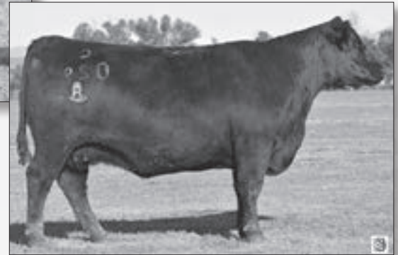
BALDRIDGE ISABEL C029 - Dam of Lot 1 and full sister to the $157,500 Baldridge Bronc and the $100,000 Baldridge 38 Special.