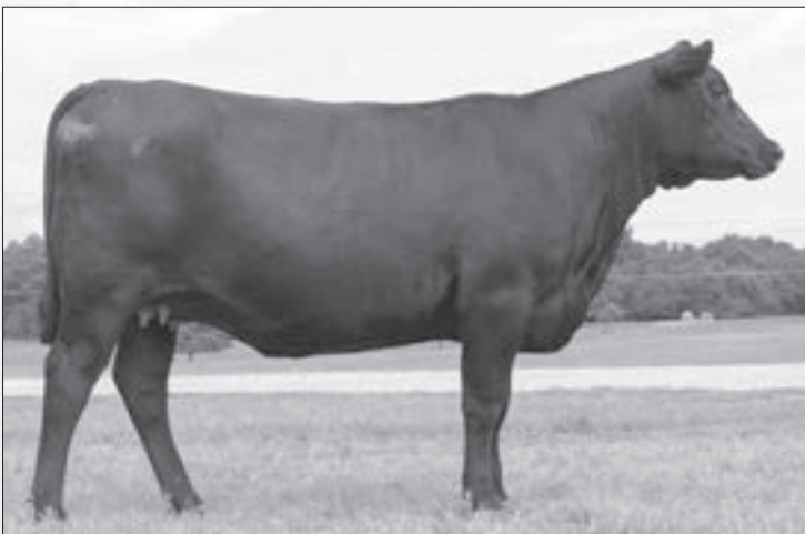
YON SARAH B433 - The donor dam of Lot 6.