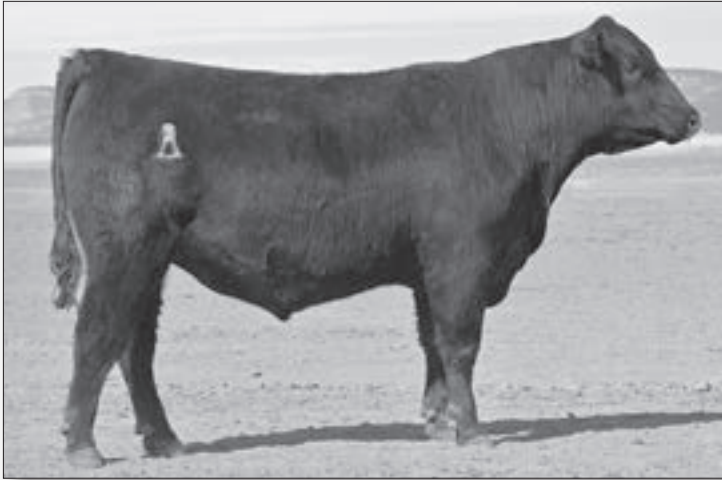
RRR PATRIOT R6382 - Lot 47