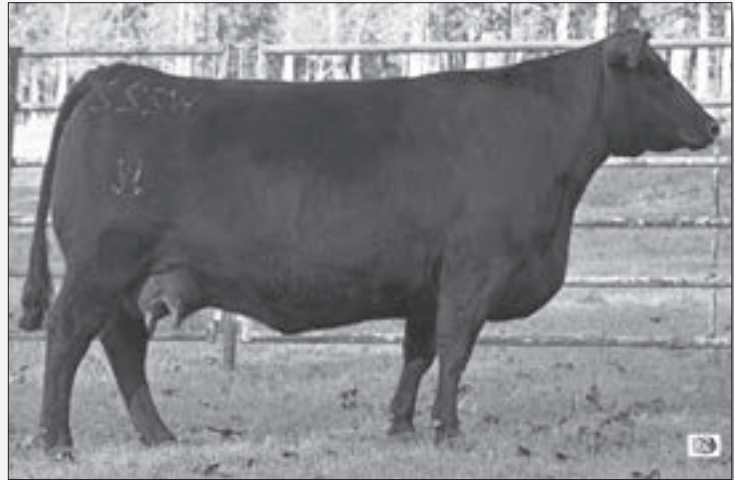
RWA PROGRESS W222 - Donor dam of Lot 74.