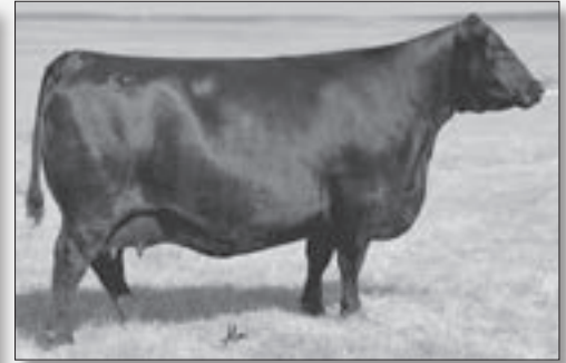
BALDRIDGE ISABEL Y69 - The grandam of Lot 1. She is the dam of the $580,000 Baldridge Colonel and one of the elite cows in the breed.