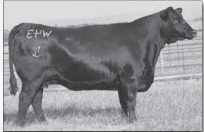
RWA INGENUITY W43 - Donor dam of Lots 53-57.