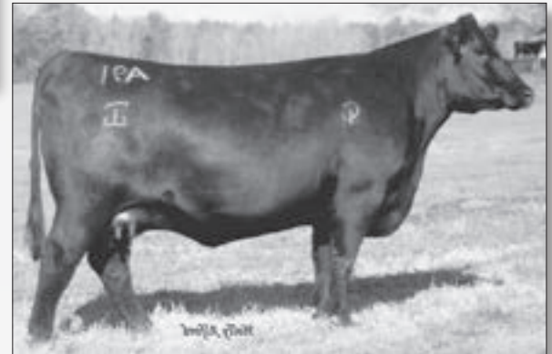
G A R 5050 NEW DESIGN A91 - The full sister to the dam of Lots 7-9 and the dam of the $100,000 G A R 100X.