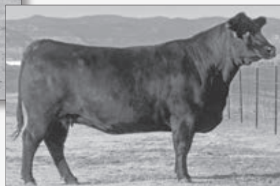
DSA NEW DIRECTION 1022 - The donor dam of Lots 38-40.