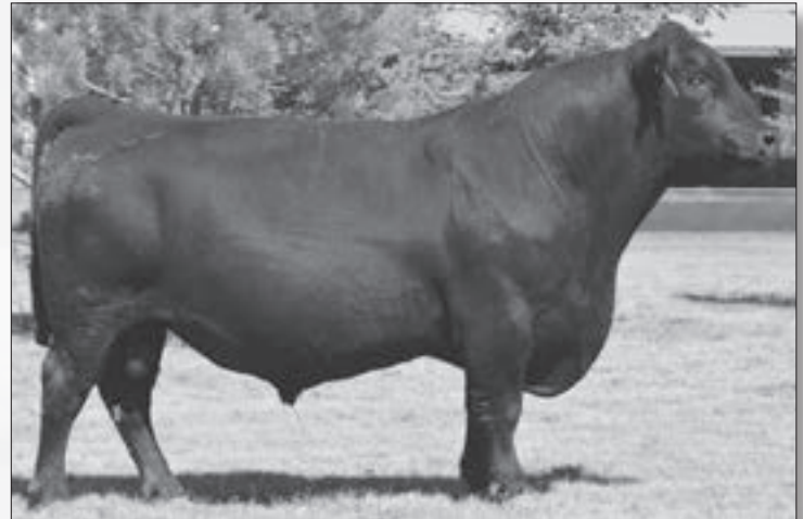
BALDRIGE ABUNDANCE A085 - Sire of Lot 71.