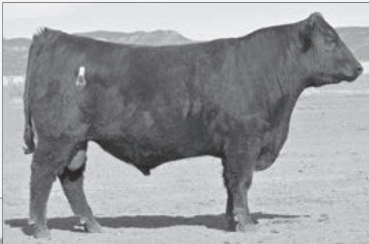
RRR COMMANDO R0446 - Lot 59