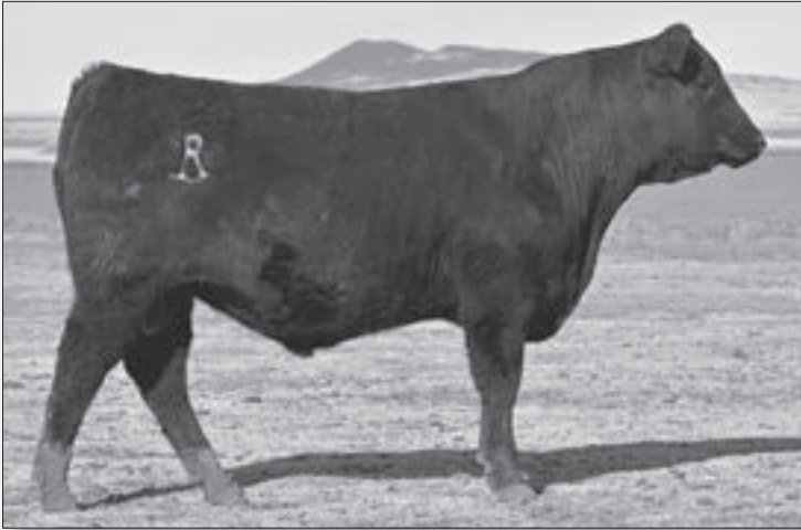
RRR PAYWEIGHT M0597 - Lot 4