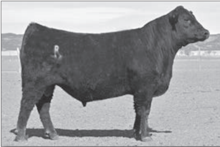
RRR CONSENT R0466 - Lot 70