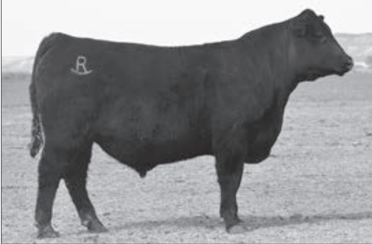
RRR PAYWEIGHT E022 - Lot 5