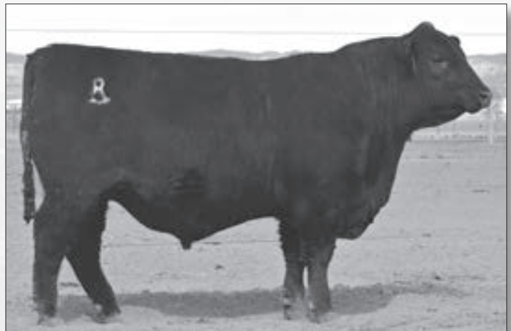
RRR TITAN H0206 - Lot 30