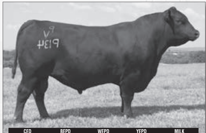
KCF BENNETT ABSOLUTE