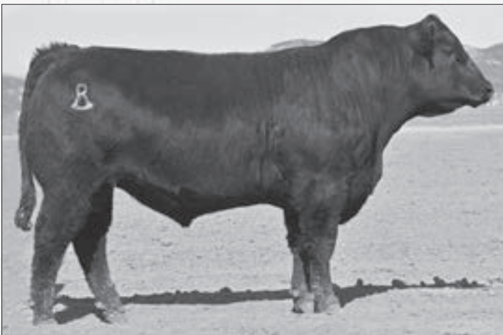
RRR IMPACT R614 - Lot 46