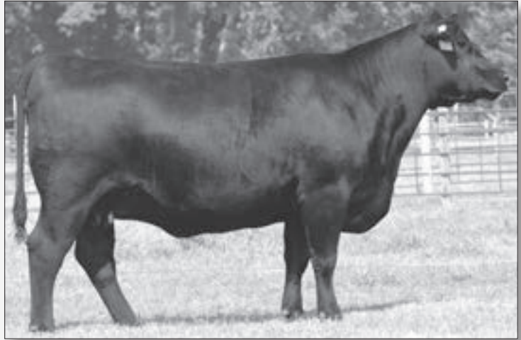
YON BURGESS B437 - One of our featured donors owned with Raven Angus, SD and dam of Lots 10-12.