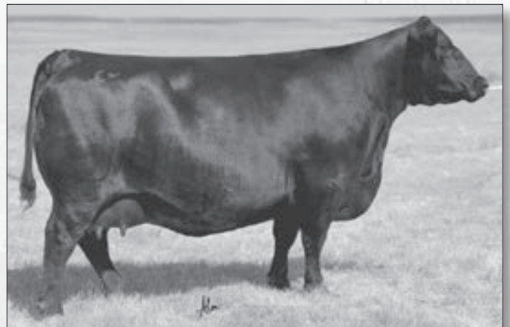
BALDRIDGE ISABEL Y69 - Grandam of Lots 28 and 29.