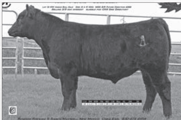
RRR - 7 OAKS COLD BEER - The full brother to Lots 38-40 and owned with Zumbrunnen Angus, WY.