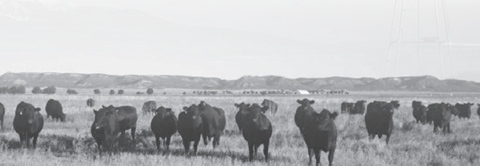
DEER VALLEY PATRIOT 3222