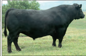
SINCLAIR EMULATION XXP