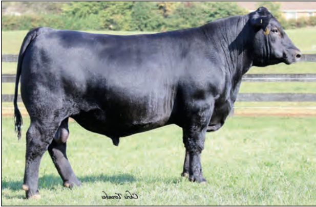
QUAKER HILL COLUMBUS 6CV48 - Maternal brothers to Lots 4-8, 17, 39 and 45.