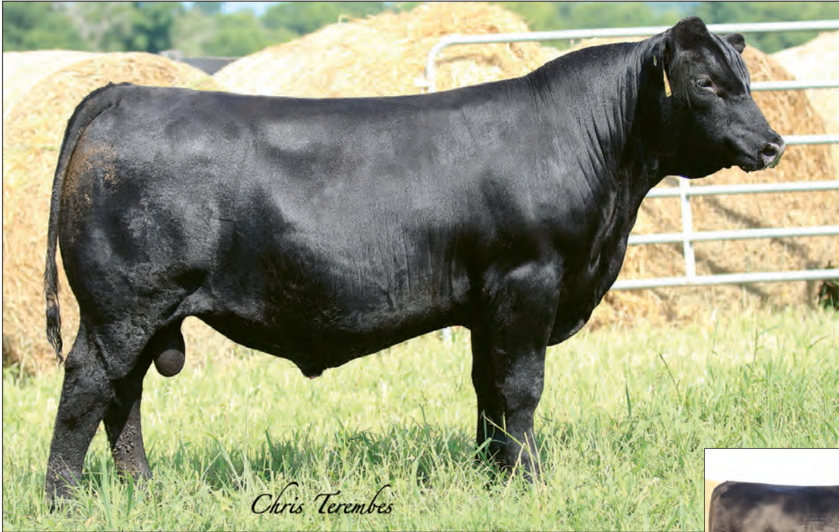
QUAKER HILL FURY 7R80 - Lot 24