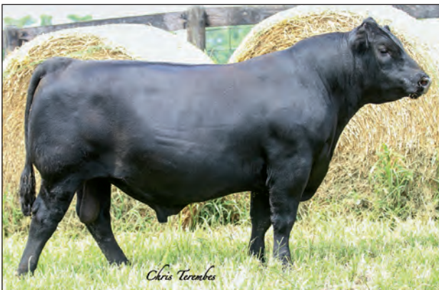
BIG MOMENTUM OF 4036 6053 - Lot 37