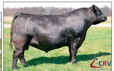
CONNELY UNITED 1116