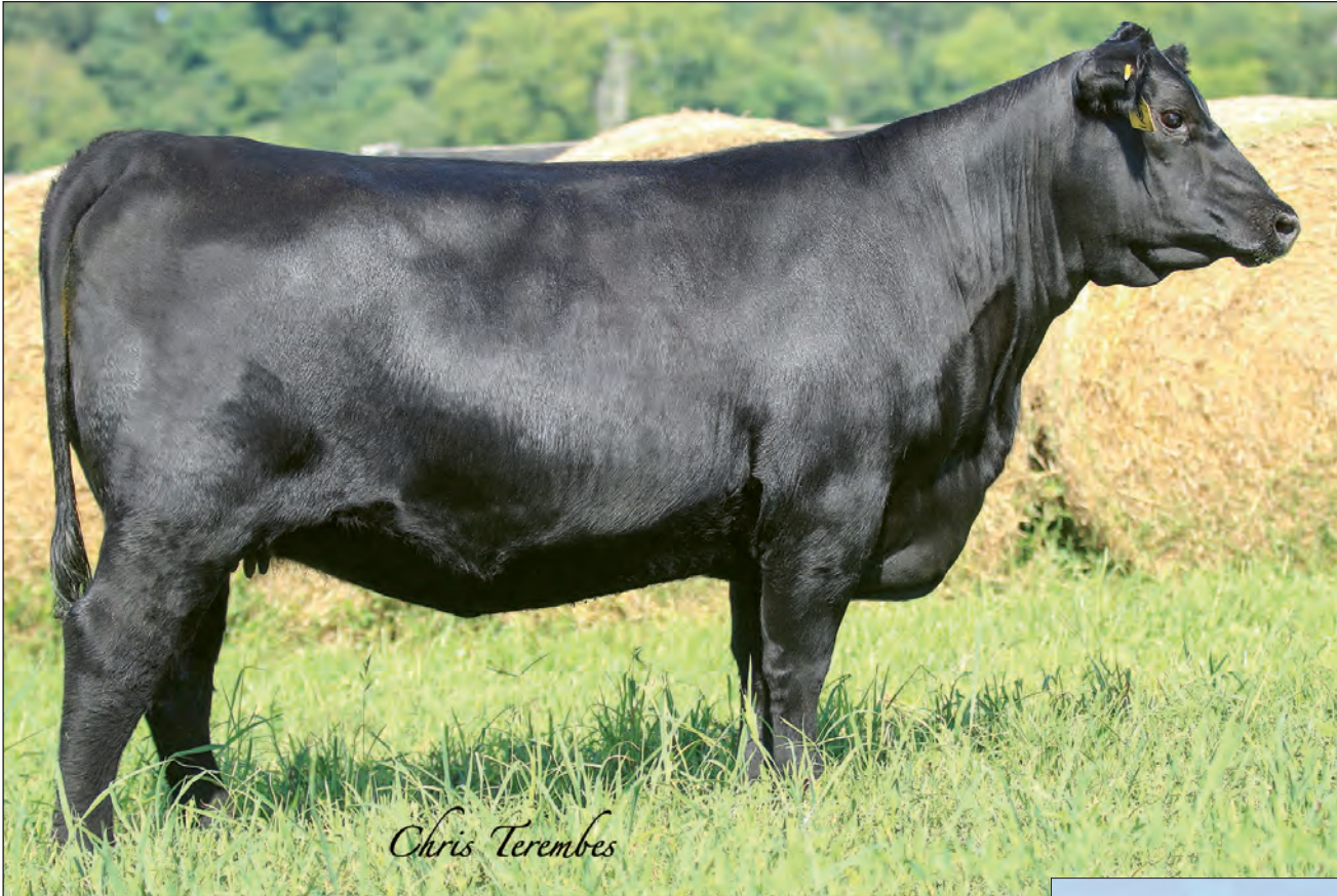
QUAKER HILL EMPRESS 6V50 - Lot 69