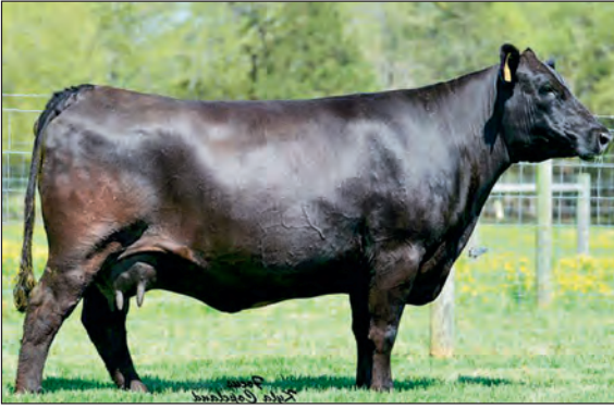
QUAKER HILL BLACKCAP oA38 - $150,000 valued dam of Lots 13-16 and 42.