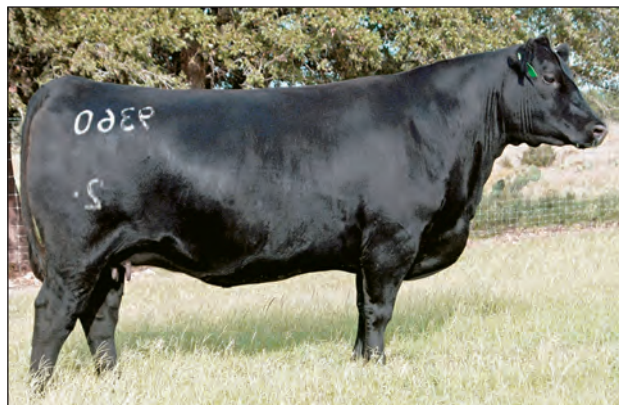
2 BAR MILE HIGH 9360 - Dam of Lot 97.