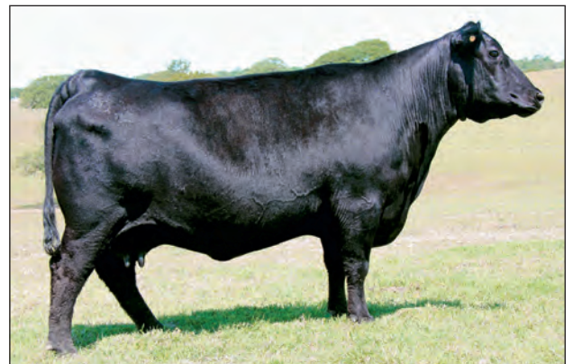
QHF BLACKCAP 6E2 OF 4V16 4355 - Featuring her influence.