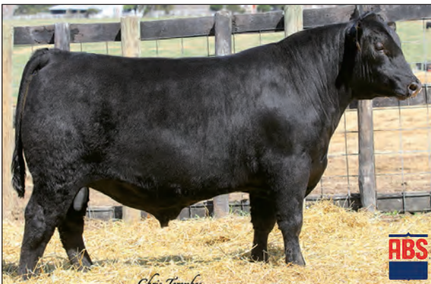
QHF WEST COAST SGR C403 - Reference Sire N