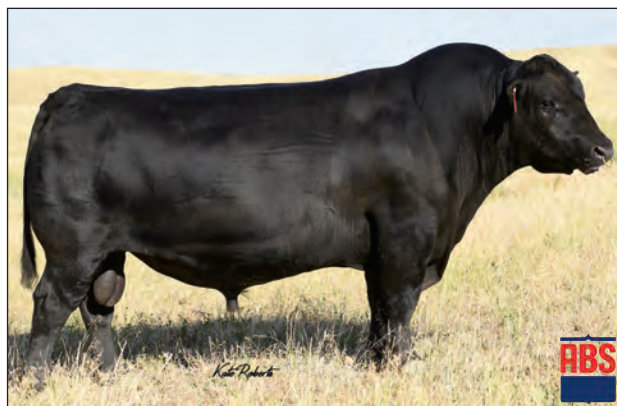
QUAKER HILL FIRESTORM 3PT1 - Reference Sire B