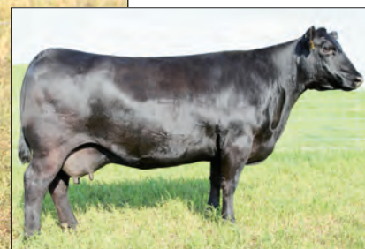
SAV BLACKCAP MAY 4136 - Grandam of Lots 24, 25, 48A and 48B.