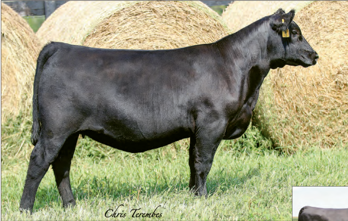
QUAKER HILL ELBA E077 - Lot 50