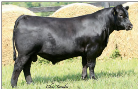
QUAKER HILL GENESIS 7GN3 - Lot 1

Selling: 35 Registered Service-Age Bulls, 25 Registered Open Heifers, 20 Registered Fall Bred Cows, 5 Registered Open Donors, 6 Registered Bred Heifers, 1 Flush Frozen Embryos, 18 Commercial Open Heifers, 10 Commercial Fall Bred Cows, 15 Commercial Spring Bred Cows