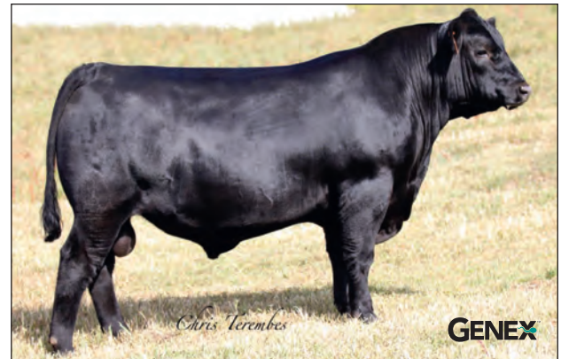
QUAKER HILL BIG DADDY 4W2 - Reference Sire H