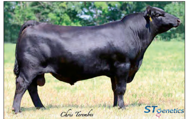
QUAKER HILL BIG STUFF 5A19 - Reference Sire Q

• The $10,500 top-selling bull of the 2016 Quaker Hill Fall Sale to ST Genetics. This bull is the result of mating the Select Sires bull Deer Valley All In with the top-valued full sister to the ABS Global sire Quaker Hill Rampage A036.