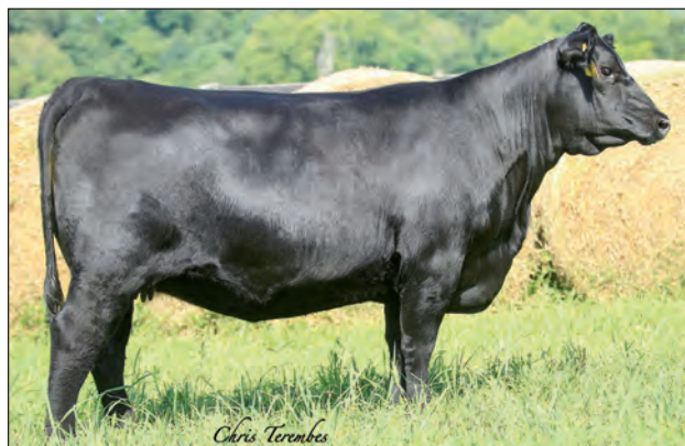
QUAKER HILL EMPRESS 6V50 - Lot 69