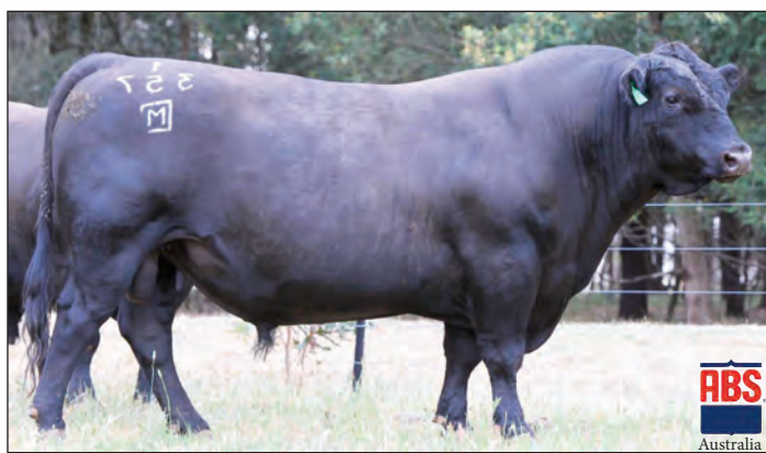
PATHFINDER GENESIS G357 - Sire of Lots 1 and 2.