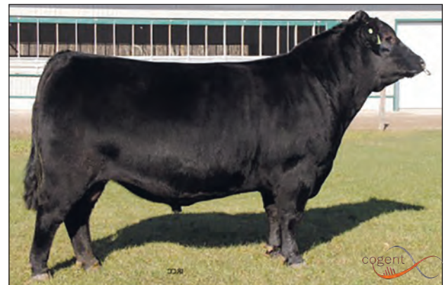
QUAKER HILL LIKE NO OTHER - Reference Sire J