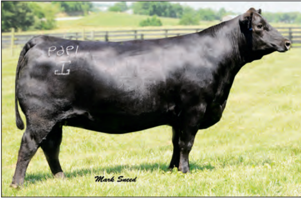
GAR 28 AMBUSH 1969 - Flush sister to the dam of Lots 92-92C.