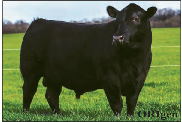
QUAKER HILL MAXIMUS SGR C402 - Reference Sire O

• This member of the ORigen AI stud is a maternal brother to the Select Sires bull Quaker Hill Manning 4EX9, the Alta Genetics sire Quaker Hill Mile High 4EX31, the Cogent sire Quaker Hill Dead Center, the ABS Global sire QHF West Coast SGR C403, the ABS Global sire Quaker Hill Blindside SGR, the ST Genetics sire Quaker Hill Big Stuff 5A19 and the ABS Global sire Quaker Hill Swagger 5U75.