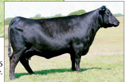
QHF BLACKCAP 6E2 OF 4V16 4355 - Featuring her influence.