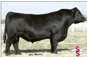
PLATTEMERE WEIGHT UP K360