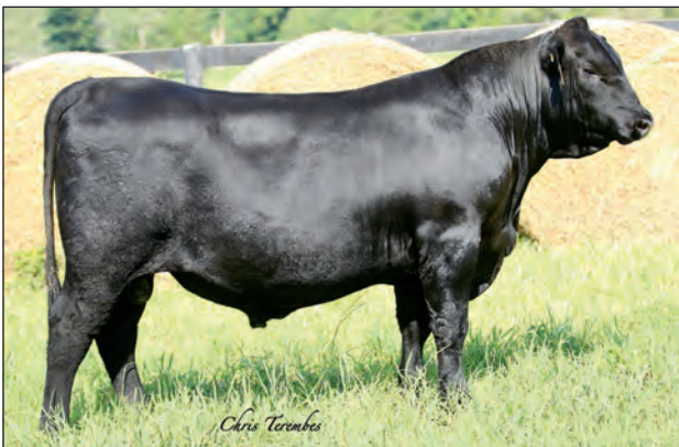
QUAKER HILL RAMPAGE 7R20 - Lot 21