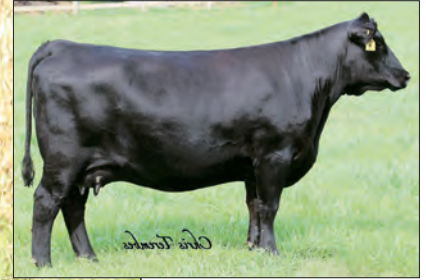
QUAKER HILL BLACKCAP 4EX5 - $50,000 valued dam of Lot 9.