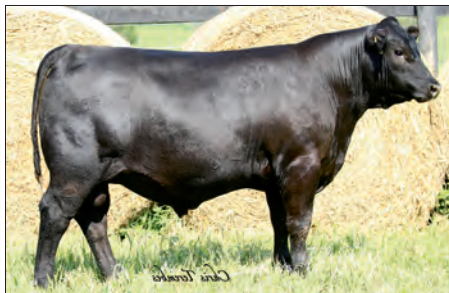
QUAKER HILL PAYWEIGHT 7BP23 - Lot 9