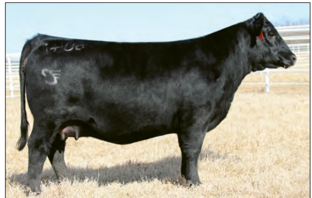
JETSET GLORY 6041 - Dam of Lots 88 and 88A.