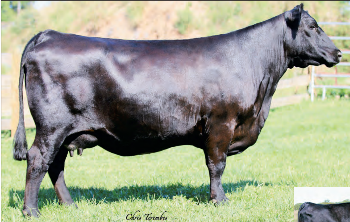
Chris Terembes QUAKER HILL BLACKCAP 3N23 - The dam of Lots 4-8, 17, 39 and 45.