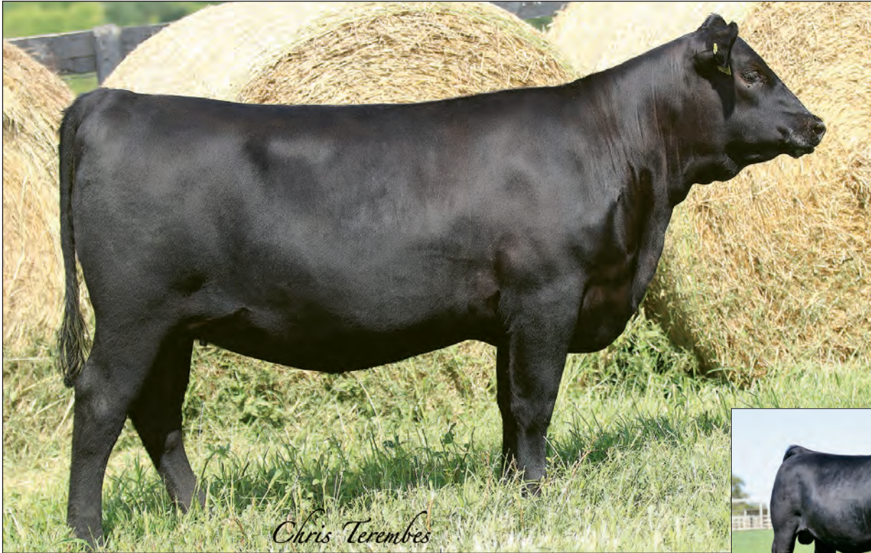
QUAKER HILL PRIDE 7TR3 - Lot 55