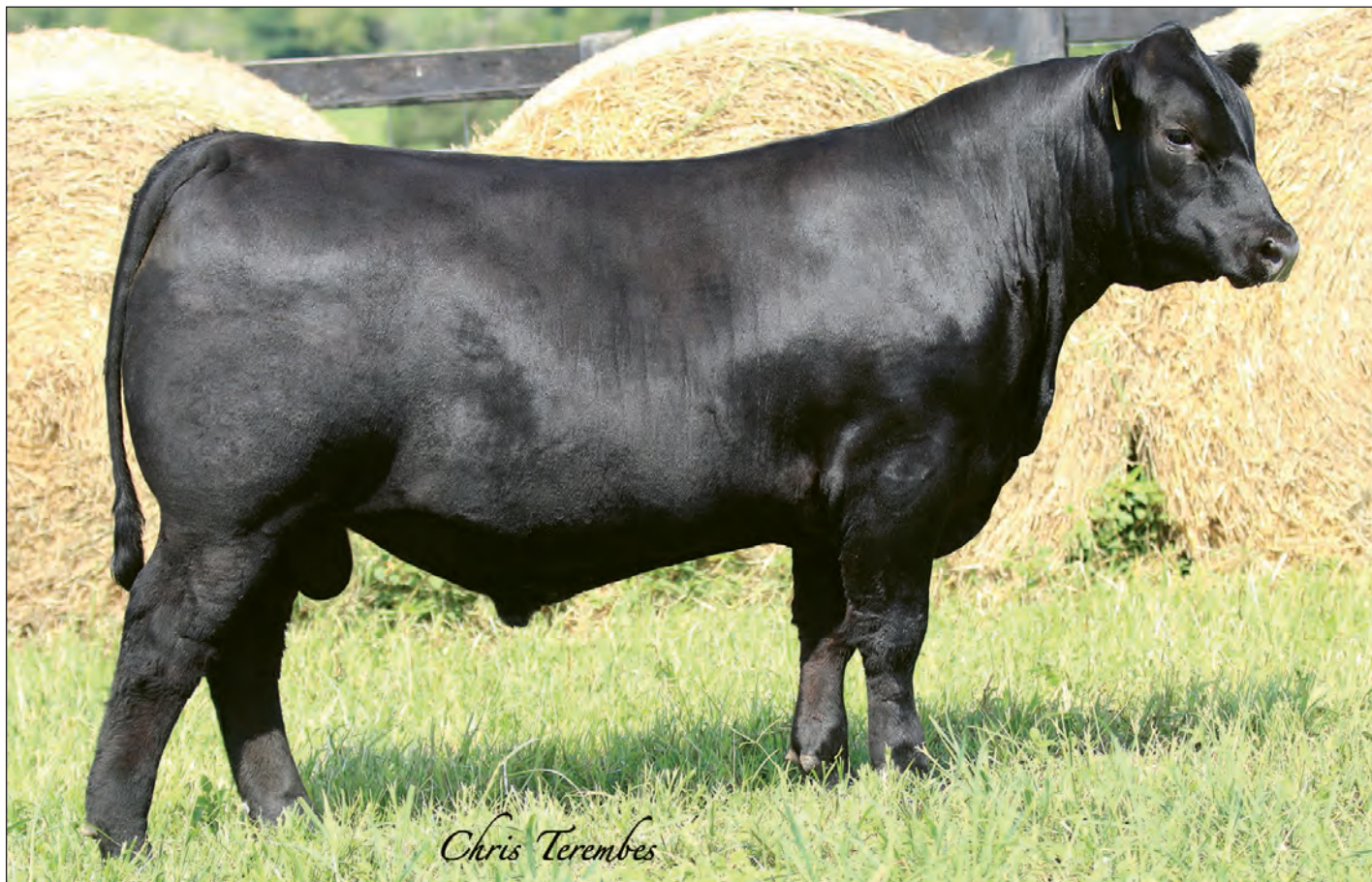
QUAKER HILL GENESIS 7GN3 - Lot 1