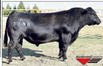
VAR DISCOVERY 2240