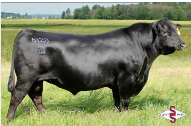
GAR PROPHET - Maternal brother to the dam of Lots 92-92C.