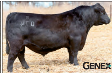
BALDRIDGE BEAST MODE B074