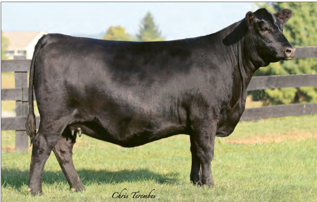
EXAR JOY 6079 - The dam of Lot 89.