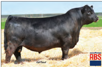
HA COWBOY UP 5405