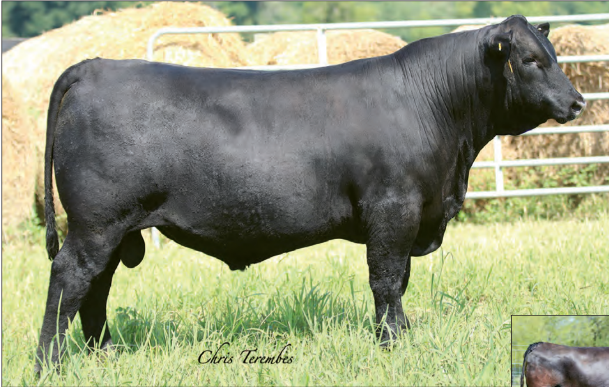
QUAKER HILL FORTRESS 7KF31 - Lot 13