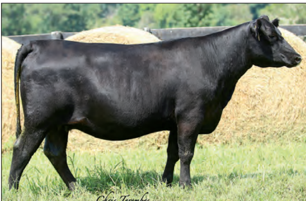
QUAKER HILL ENDA LASS 6PW6 - Lot 70