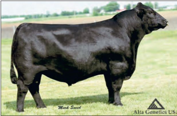
QUAKER HILL MILE HIGH 4EX31 - Reference Sire L