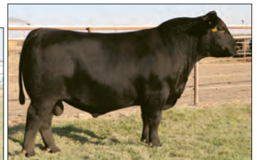
VAR REVELATION 6299