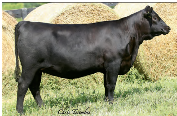
QUAKER HILL PRIDE 7TR3 - Lot 55