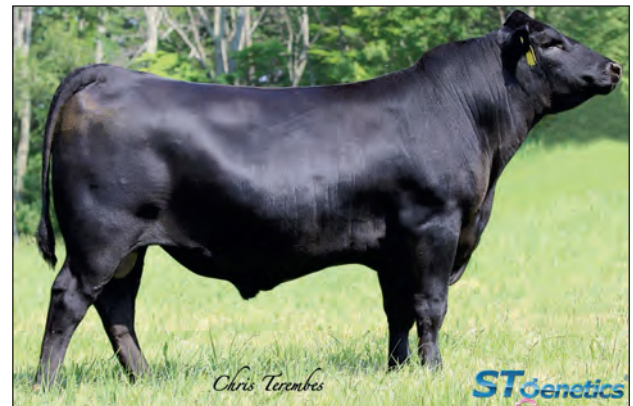
QHF WWA BLACK ONYX 5Q11 - Reference Sire R

• The $9,750 third top-selling bull of the 2016 Quaker Hill Fall Sale featured in the ST Genetics AI stud. This EPD outlier is the result of mating Connealy Black Granite with a full sister to Quaker Hill Rampage 0A36.