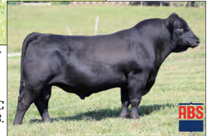
BYERGO BLACK MAGIC 3348 - Sire of Lots 87 and 88.