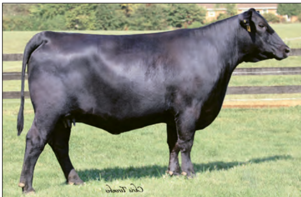
QUAKER HILL BLACKCAP 5R13 - $32,000 valued dam of Lot 46.