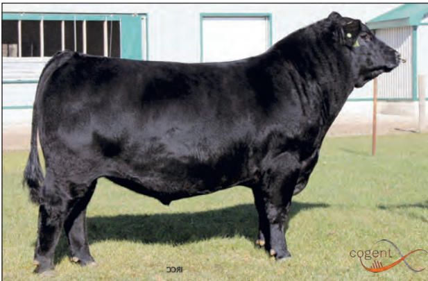
QUAKER HILL DEAD CENTER - Reference Sire M