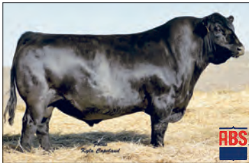
BASIN PAYWEIGHT 1682