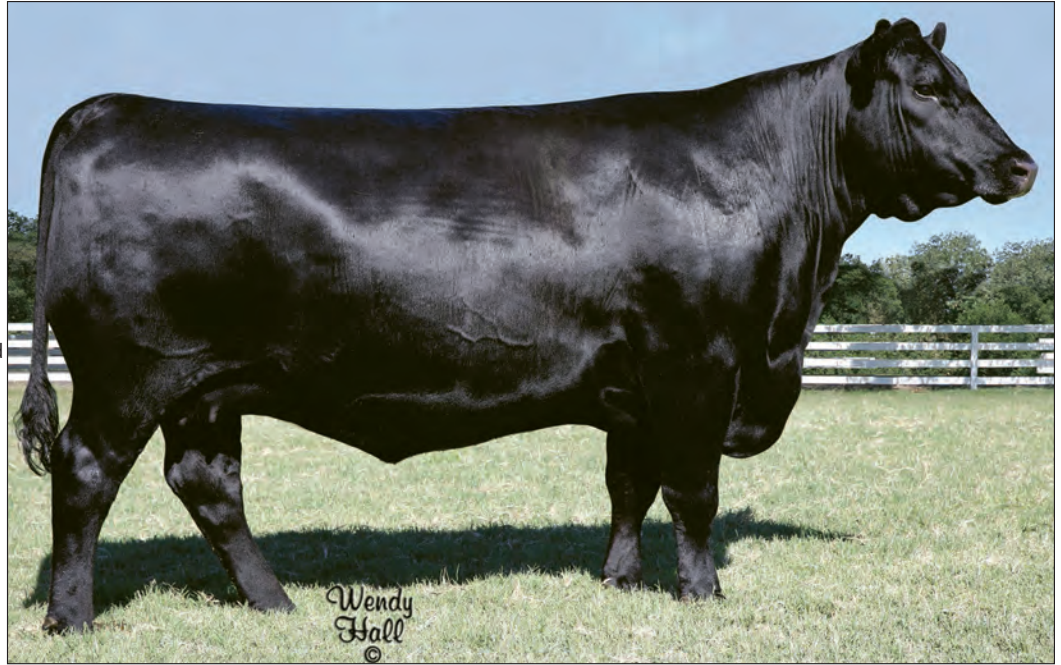
DEER VALLEY RITA 2711 - Dam of Lot 90.