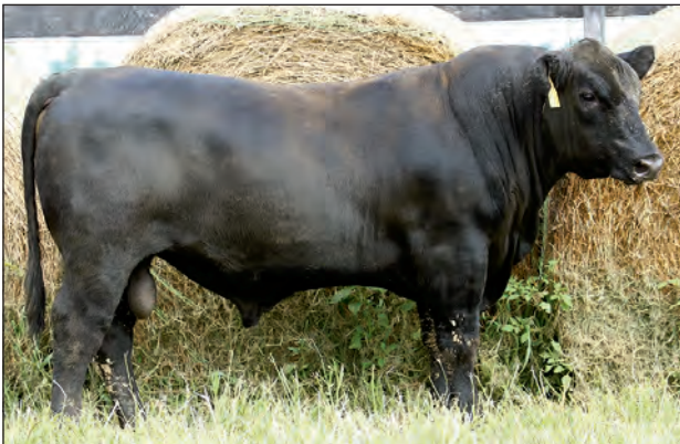
QUAKER HILL WRANGLER 7CU3 - Lot 12