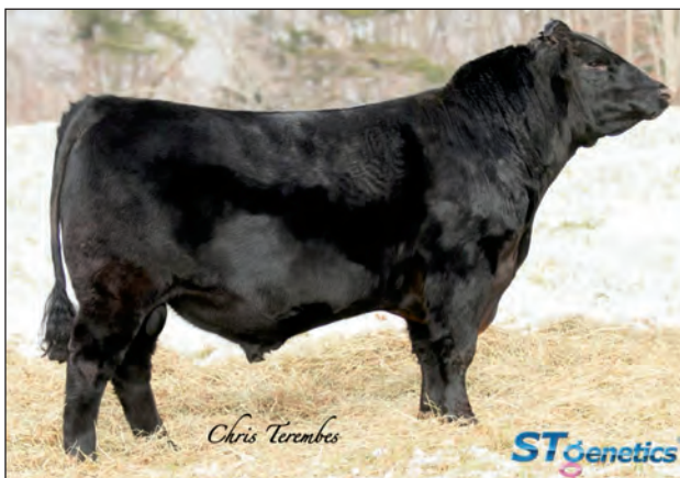
QUAKER HILL CHIEFTAIN - Reference Sire F