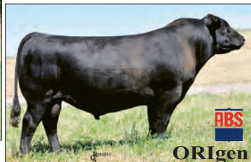
WR JOURNEY - 1X74