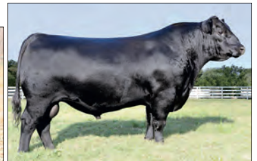
VAR GENERATION 2100