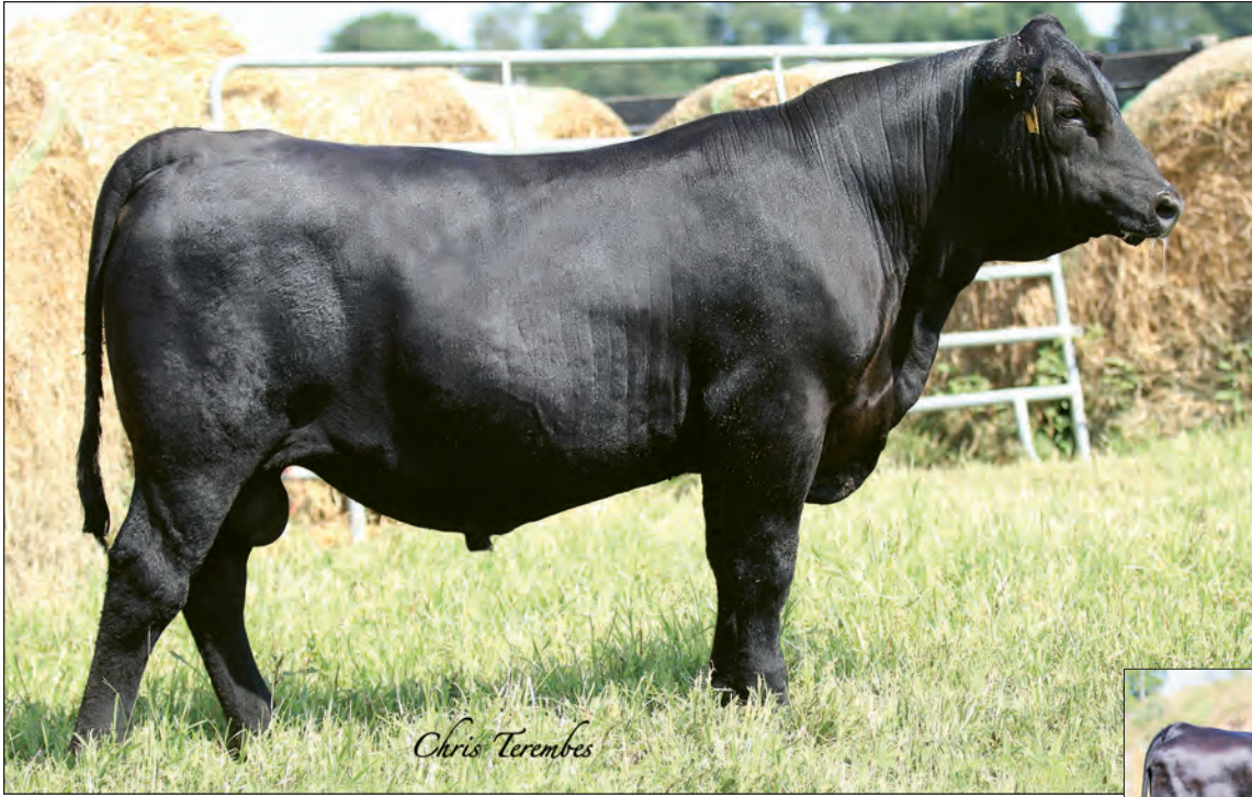
QUAKER HILL AMPLIFY 7WP3 - Lot 4

4 Quaker Hill Amplify 7WP3 Birth Date: 9-20-2017 Bull #*19107794 Tattoo: 7WP3