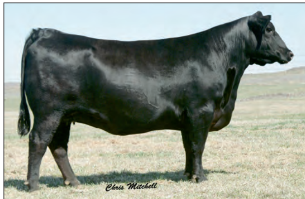
RITA 1198 OF 2536 RITO 616 - Third dam of Lot 94.