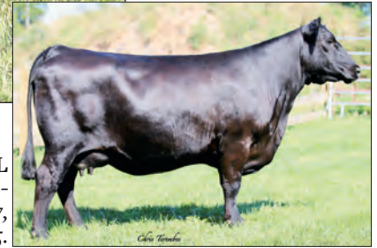
QUAKER HILL BLACKCAP 3N23 - The dam of Lots 4-8, 17, 39 and 45.

5 Quaker Hill Knockout 7WP1 Birth Date: 9-15-2017 Bull #*19106980 Tattoo: 7WP1