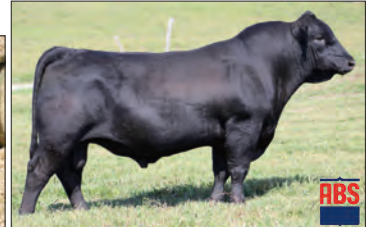
BYERGO BLACK MAGIC 3348