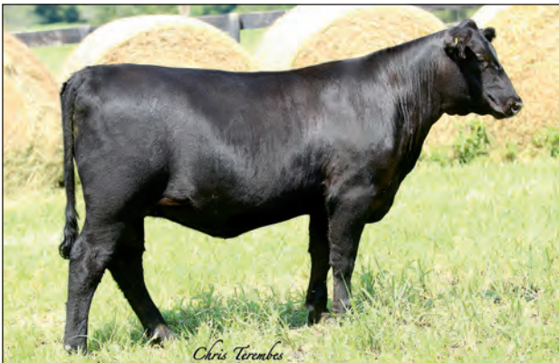
QUAKER HILL BLACKCAP 7H7 - Lot 41