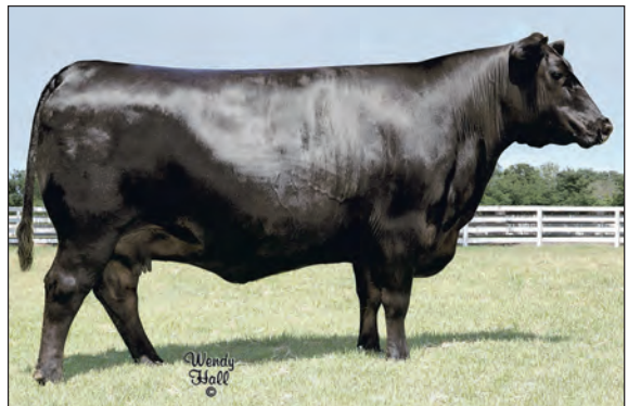
QUAKER HILL BLACKCAP oA35 - $100,000 full sister to Quaker Hill Blackcap oA32, Quaker Hill oA38 and Wilks Blackcap oD82.