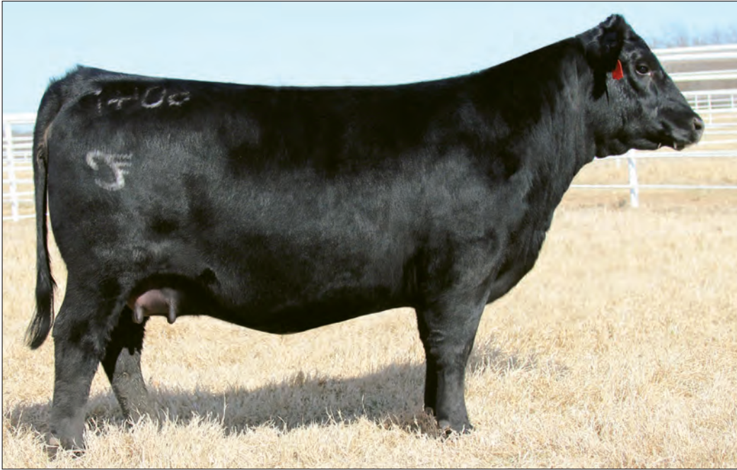
JETSET GLORY 6041 - Dam of Lots 88 and 88A.