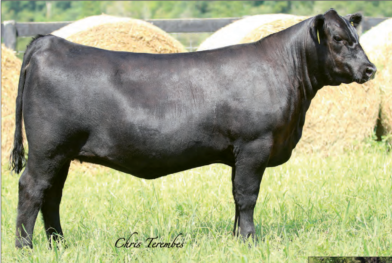
QUAKER HILL BLACKCAP 7G53 - Lot 40