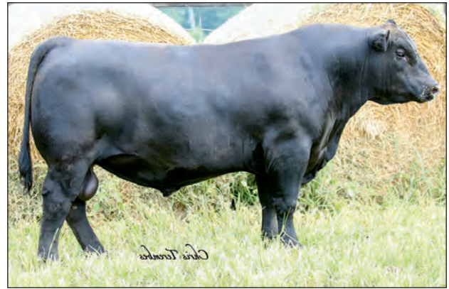
QUAKER HILL FAIRFAX E008 - Lot 38