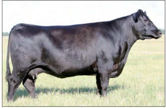
WILKS BLACKCAP oD82 - $25,000 dam of the Lot 44 donor.