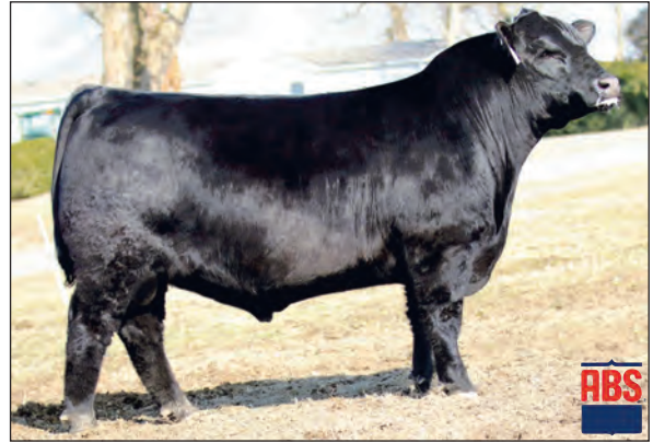
QUAKER HILL WIDE STRIDE - Reference Sire G