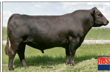
KCF BENNETT SOUTH SIDE