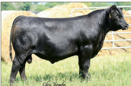
QUAKER HILL FURY 7R80 - Lot 24