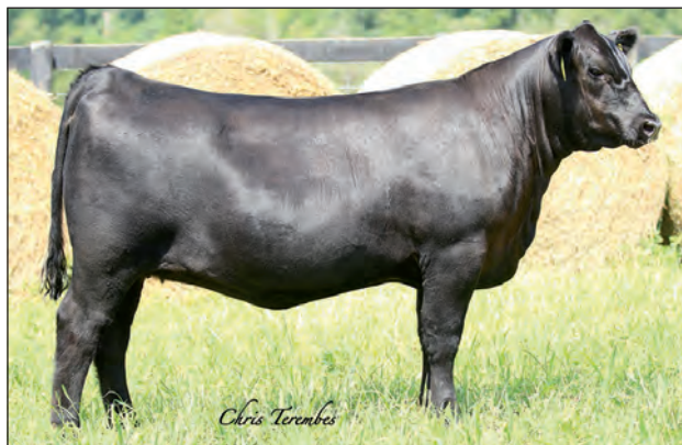
QUAKER HILL BLACKCAP 7G53 - Lot 40