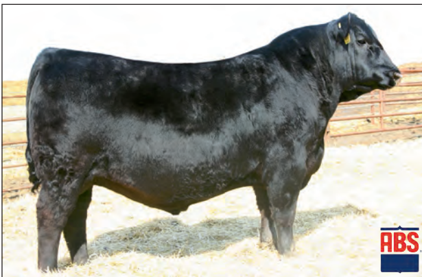
SAV BRUISER 9164 - Maternal grandsire of Lot 50.