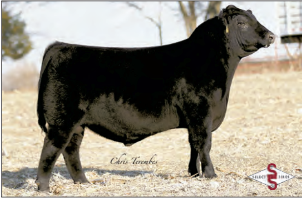
QUAKER HILL MANNING 4EX9 - Reference Sire K