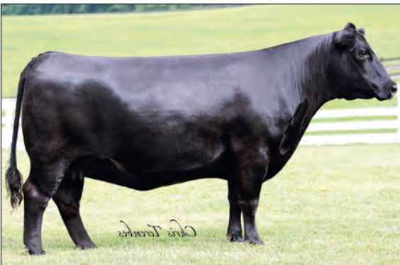
QUAKER HILL BLACKCAP oA32 - $500,000 valued grandam of Lot 43.