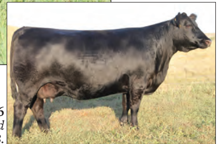
SAV BLACKCAP MAY 1426 - Dam of Lots 24, 25, 48A and 48B.