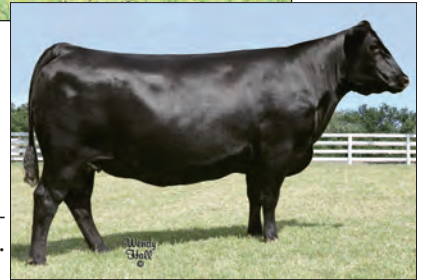
EXAR EMPRESS 1124 - Dam of Lots 35 and 69.