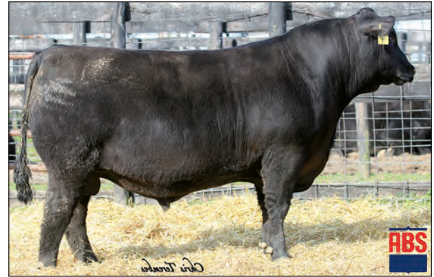
QUAKER HILL BLINDSIDE SGR - Reference Sire P

• This bull is one of seven maternal brothers enrolled in AI studs, from a dam who has ten sons in AI studs.