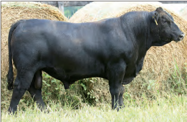
QUAKER HILL 100X 8697E - Lot 8

7 Quaker Hill 100X 8685E Birth Date: 5-22-2017 Bull #*19189758 Tattoo: 8685E