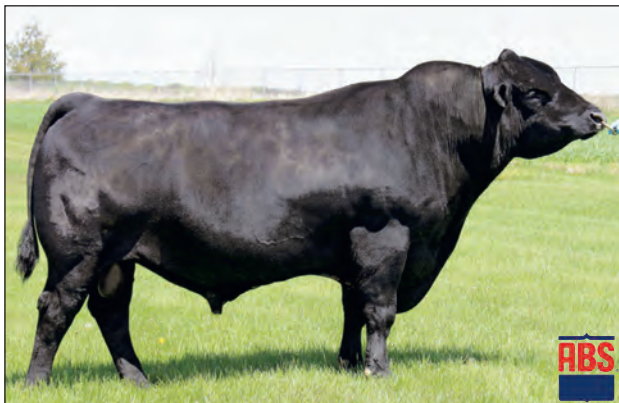
QUAKER HILL INSIDE TRACK oY1 - Reference Sire C