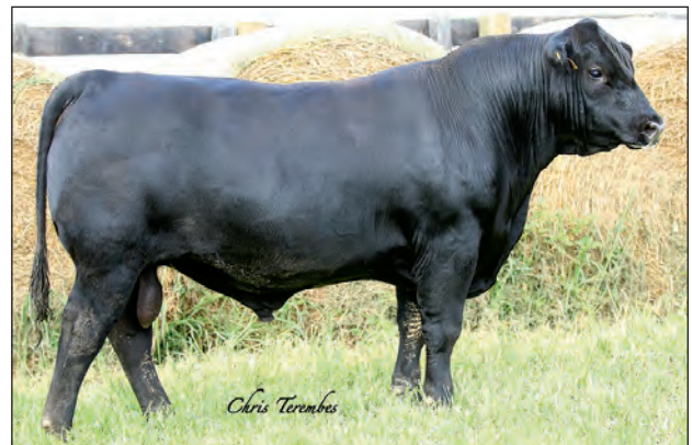
QUAKER HILL JOURNEY 8698E - Lot 39