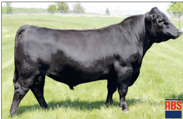
QUAKER HILL CONVICTION 3N30 - Reference Sire D