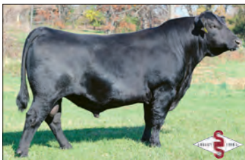
KCF BENNETT FORTRESS