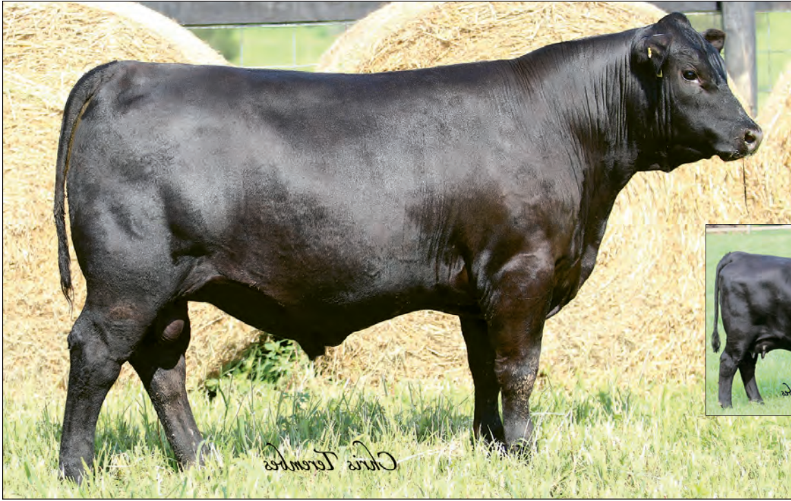
QUAKER HILL PAYWEIGHT 7BP23 - Lot 9