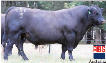
PATHFINDER GENESIS G357