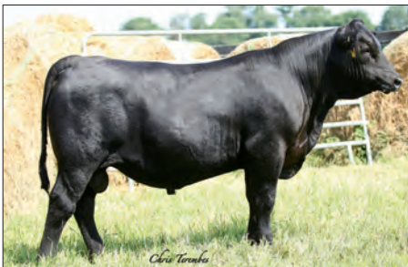
QUAKER HILL AMPLIFY 7WP3 - Lot 4