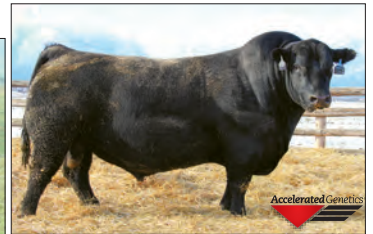
COLEMAN CHARLO 0256