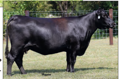
QUAKER HILL BLACKCAP 4EX1 - Dam of Lot 40.