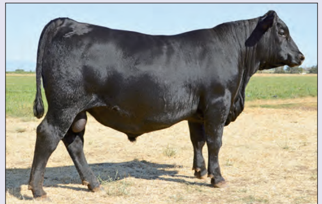
TEHAMA DELIVERANCE B697 - Reference Sire S