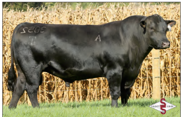
GAR 100X - Produced from a maternal sister to the dam of Lot 93.