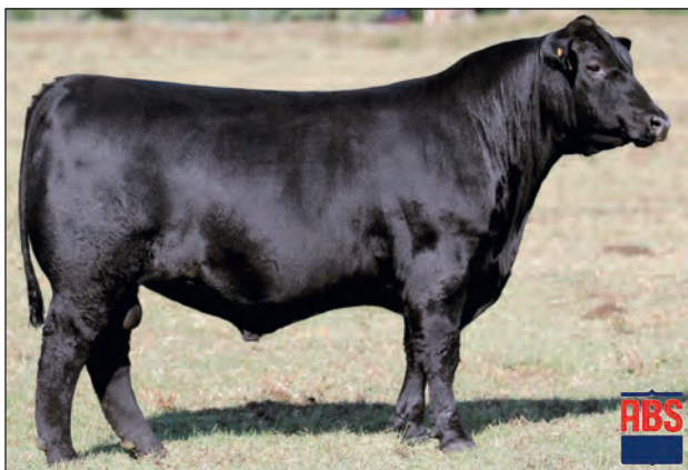
QUAKER HILL ASSURANCE 3N34 - Reference Sire E