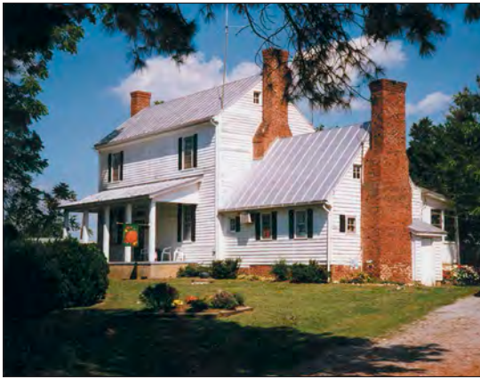
The Rosson family home built in 1742