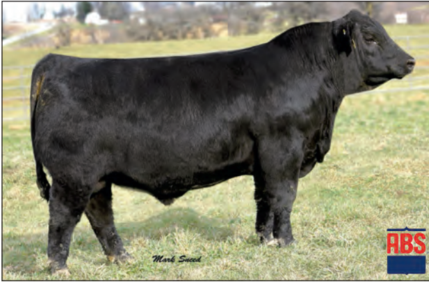
JANSSEN WYATT EARP 510 - Flush brother to the sire of Lots 57, 58 and 59.