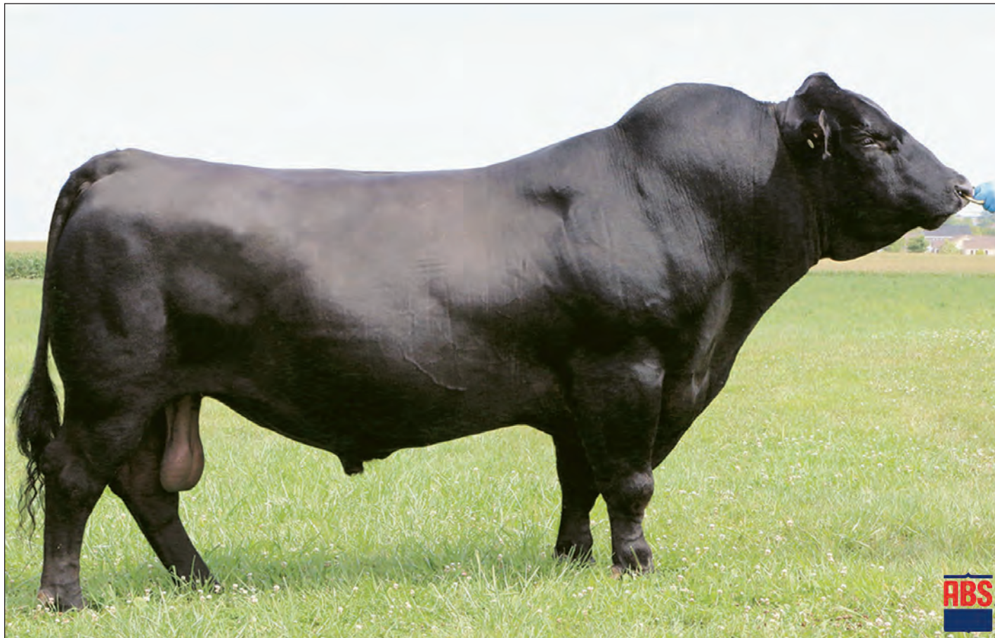
QUAKER HILL RAMPAGE 0A36 - Reference Sire A

A Quaker Hill Rampage 0A36 [AMF-CAF-DDF-MiF-NHF-OSF-RDF] Birth Date: 9-11-2010 Bull #*16925771 Tattoo: 0A36