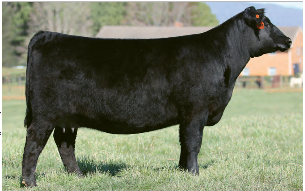
WELYTOK JOURNEY ERIANNA 6D62 - Dam of Lot 91.