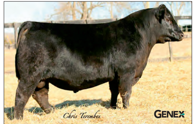
QUAKER HILL DEACON 5EX6 - Reference Sire I