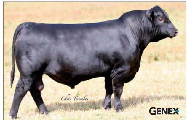
QUAKER HILL SLAM DUNK 4A30 - Maternal brother to Lots 21, 23 and 27.