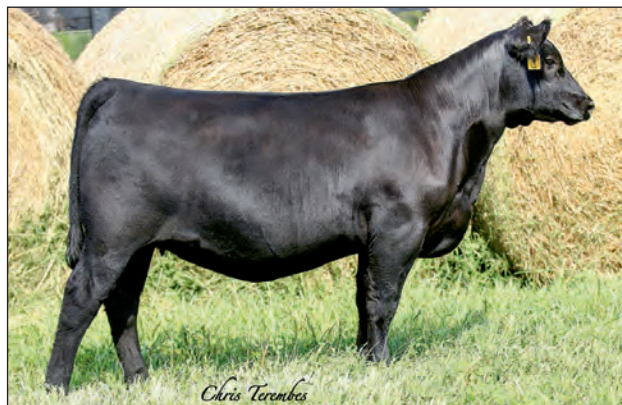
QUAKER HILL ELBA E077 - Lot 50