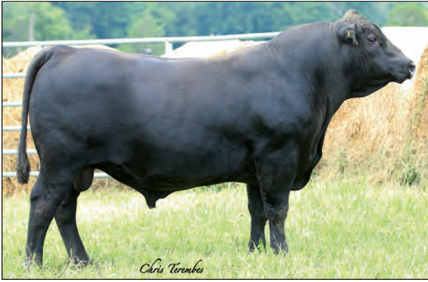
QUAKER HILL FORTRESS 8663E - Lot 31