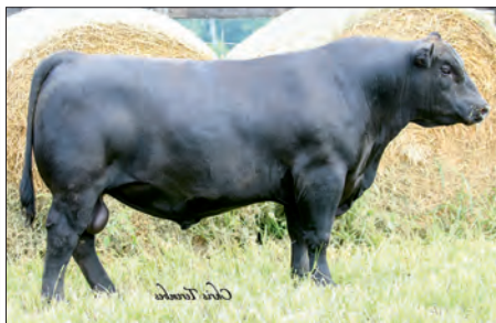
QUAKER HILL FAIRFAX E008 - Lot 38