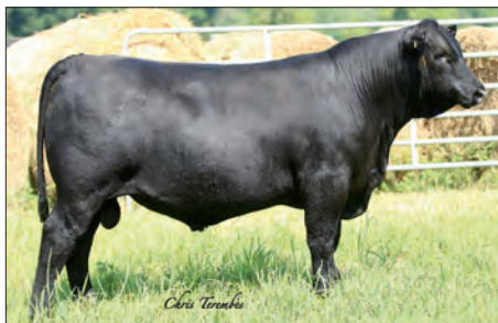
QUAKER HILL FORTRESS 7KF31 - Lot 13