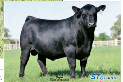
MGR TREASURE - Sire of Lot 55.