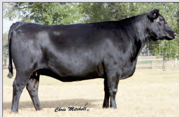
QUAKER HILL QUEEN 1L4 - Pathfinder third dam of Lot 49.