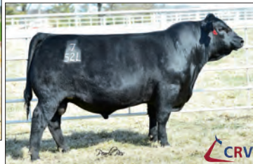
CONNELY FORTUNE 752L