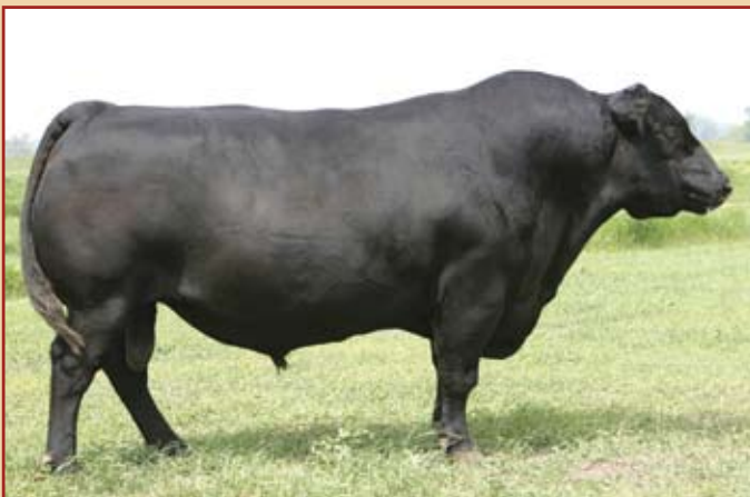
SS Rito Rito R011 2R12 / The sire of Lots 39 and 40.