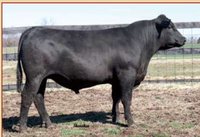
Quaker Hill PR 701T X21 / He sells as Lot 33.