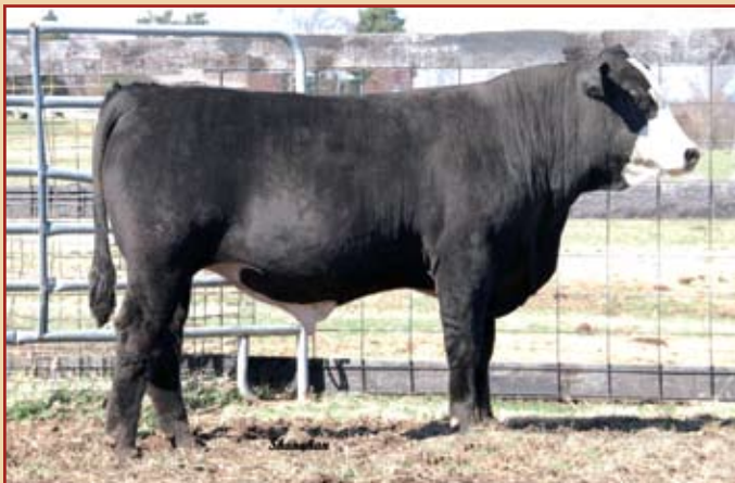
Quaker Hill SimAngus X19 / This high performing half-blood prospect sells as Lot 35.

34 Quaker Hill Ace X43 Birth Date: 3-10-2010 Bull 2548024 Tattoo: X43