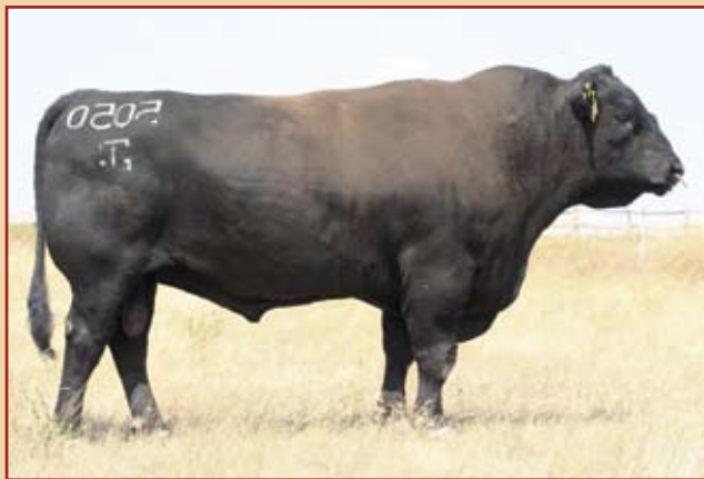
GAR New Design 5050 / The sire of Lot 3.

#SS Objective T510 0T26 [AMF-CAF-NHF] #SS Traveler 6807 T510 [AMF-CAF-NHF] Quaker Hill Burgess 6J19 SS Miss Rita R011 7R8 [AMF-NHF] 15602937 #Quaker Hill Burgess 878 4D25 #Bon View New Design 878 [AMF-CAF-NHF] Clear View Burgess H400