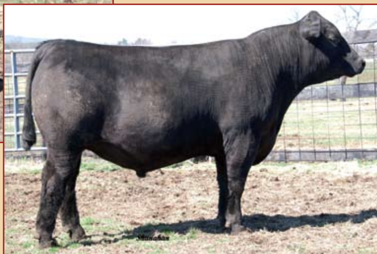
Quaker Hill Eureka 9E18 / He sells as Lot 5.