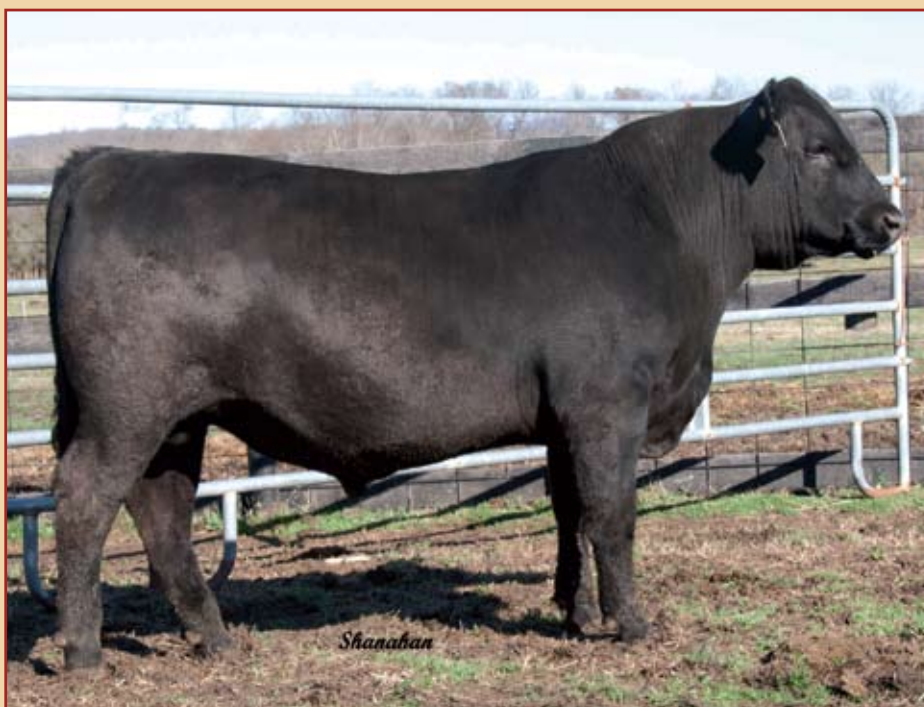
Quaker Hill Final Answer 0M3 / Lot 14