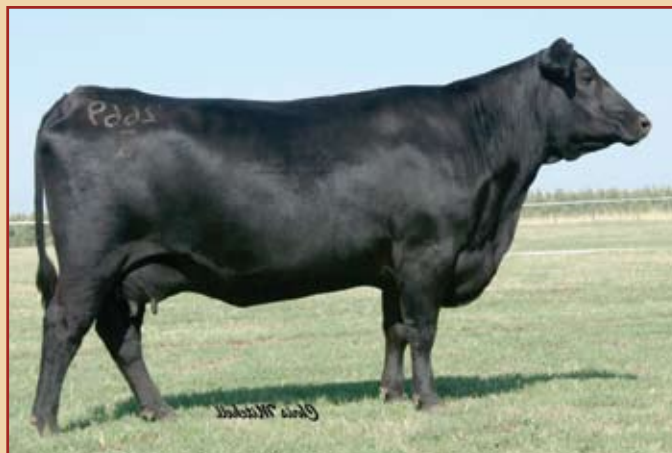
GAR New Design 2669 / The dam of Lot 42.