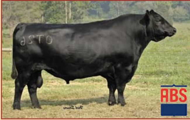
SS Objective T510 OT26