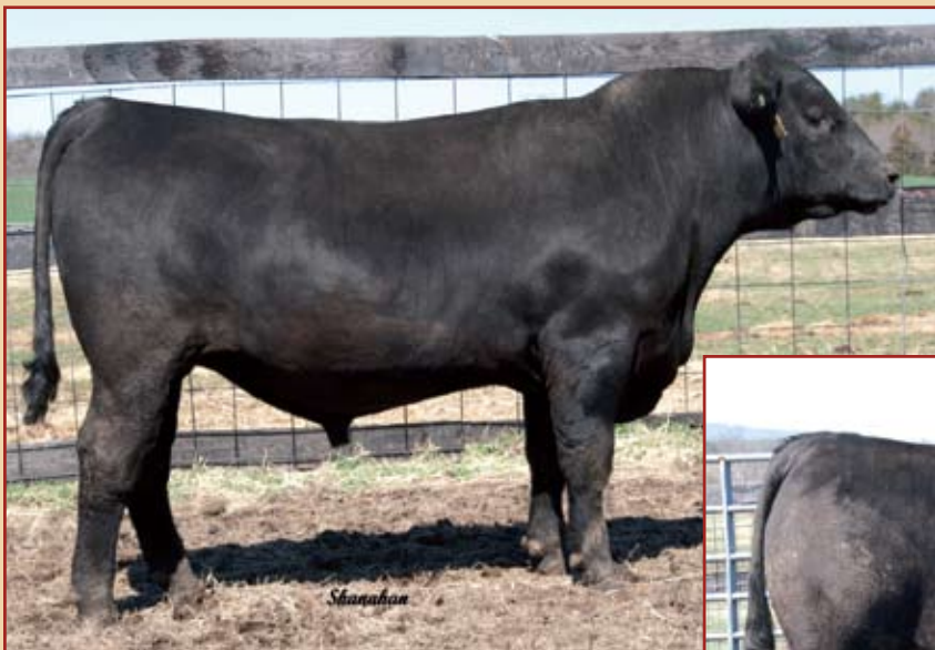
Quaker Hill Objective 9J3 / Lot 4