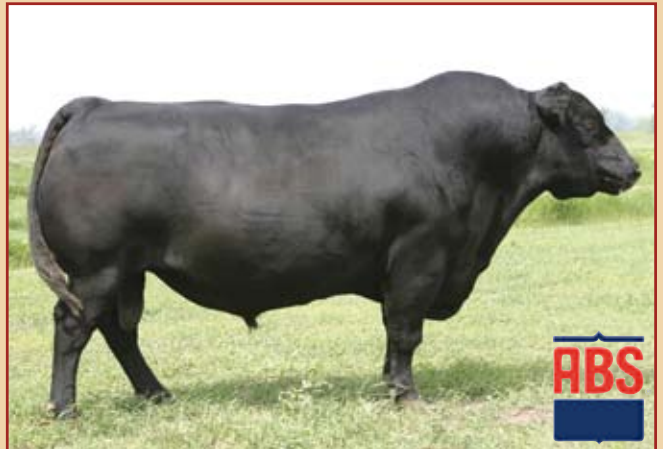
SS Rito Rito R011 2R12