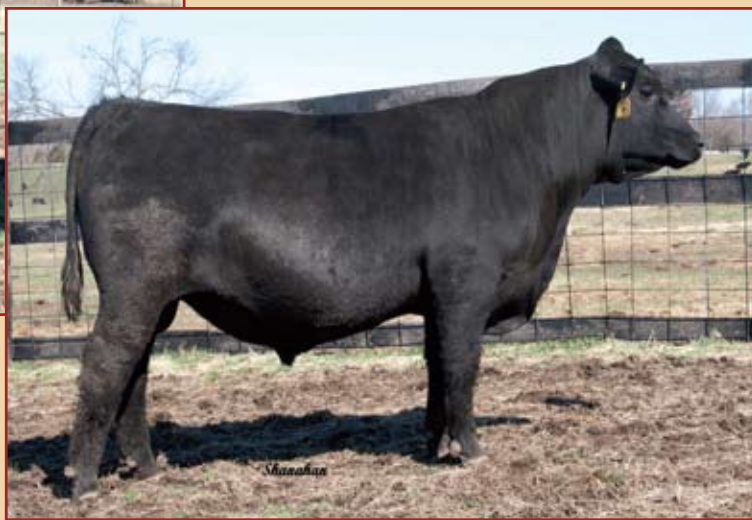
Quaker Hill Fast Track 0Y1 / This big spread bull sells as Lot 9.