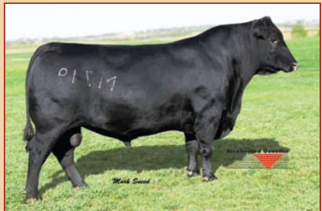
SS Fast Track M719