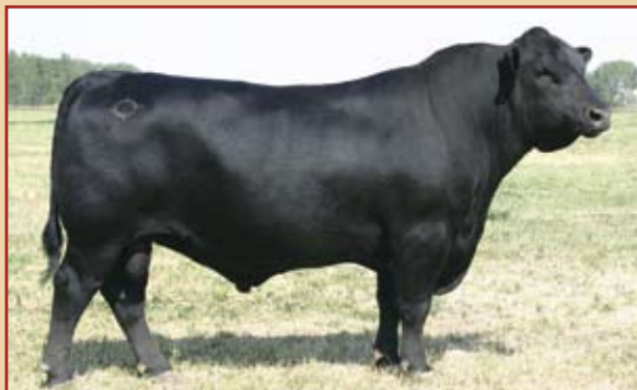
Mytty In Focus / Daughters are featured as Lot 71 through 73.