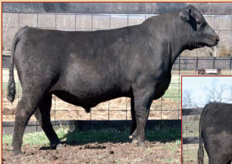
Quaker Hill Selective 0SV2 / Lot 7