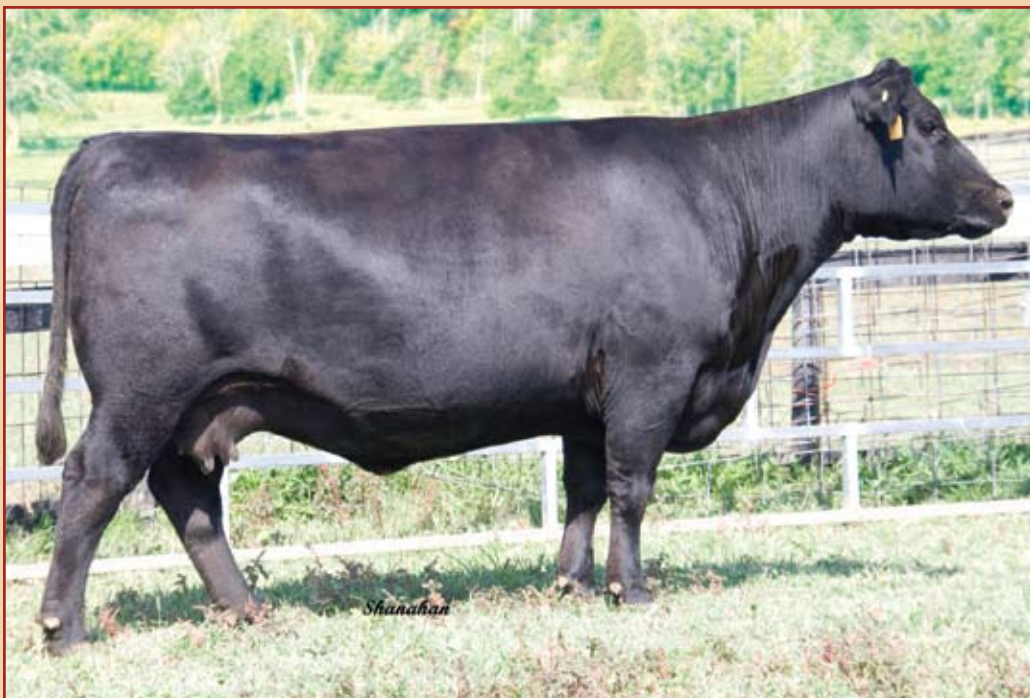
Quaker Hill Flavia 4PT1 / The grandam of Lot 10.