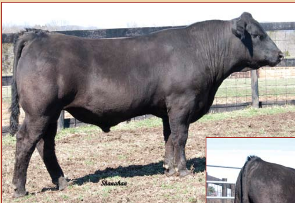
Quaker Hill Lucky Man X5 / This powerful Simmental herd sire prospect sells as Lot 25.