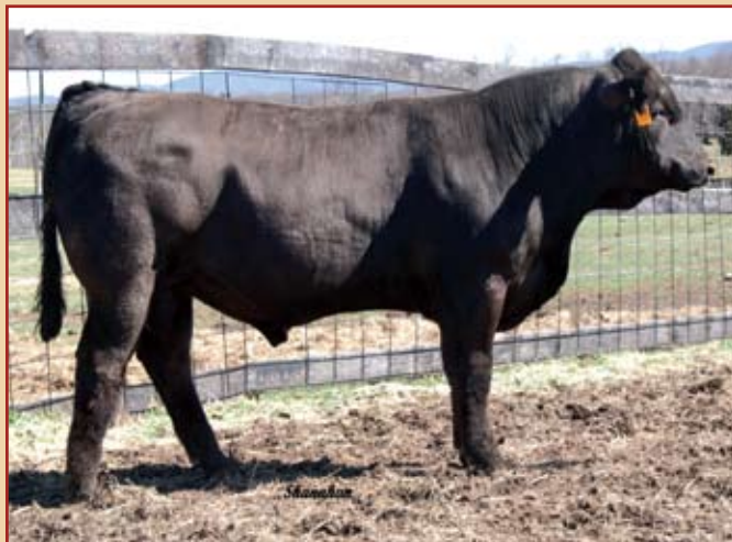
Quaker Hill Charmer X12 / Lot 29