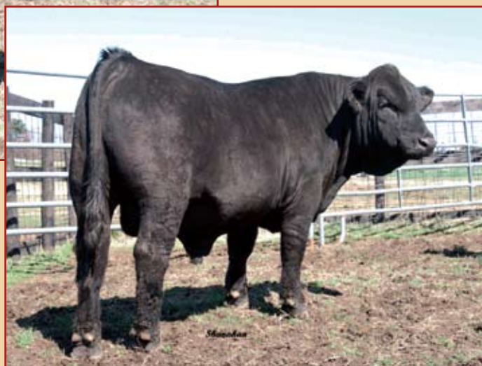
Quaker Hill Hollywood X1 / He sells as Lot 26.