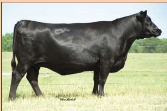
Rita 7152 of 2036 6807 / The grandam of Lot 45.