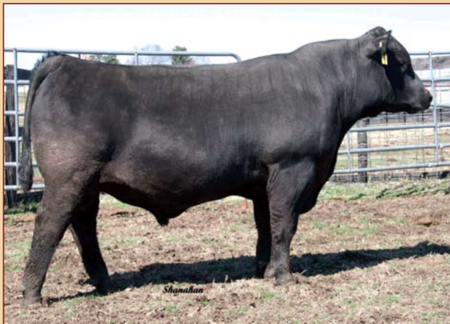
Quaker Hill Eureka 9E56 9E56 / This exciting prospect sells as Lot 1.