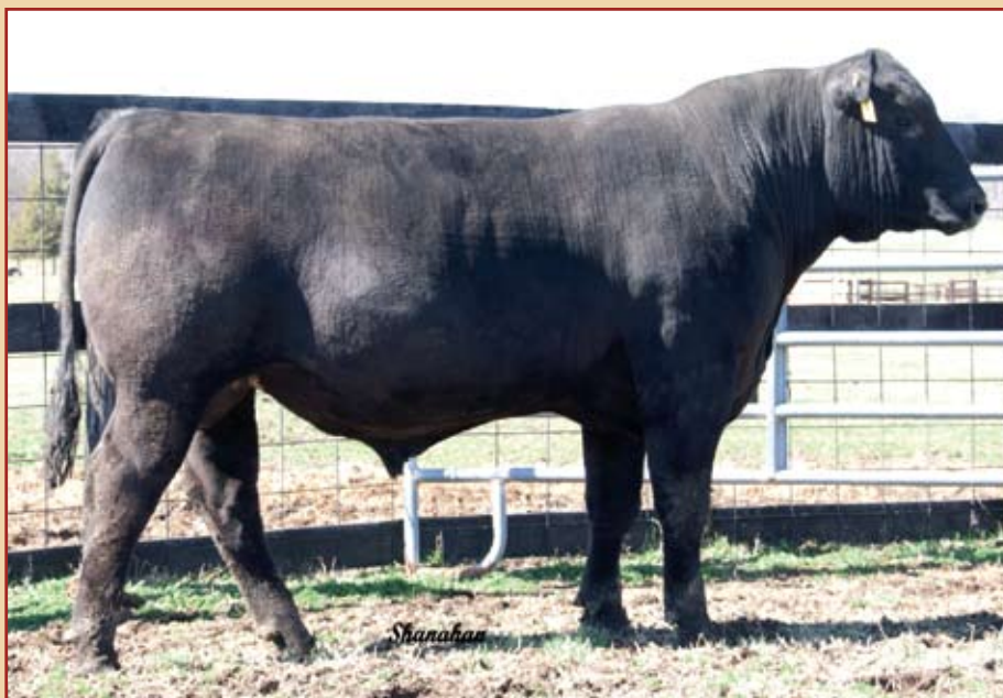
Quaker Hill 5050 9M10 9M10 / Lot 2