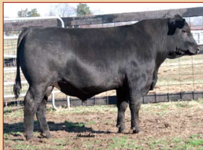
Quaker Hill Fastrack X60 / Lot 31