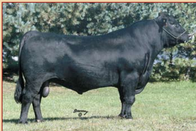
CRA Bextor 872 5205 608 / The sire of Lot 11.

• The dam of Lot 11, Flavia 8F53 records a WR 1@107.