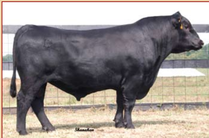
Schafer 21st Century / The sire of Lots 20 through 22.