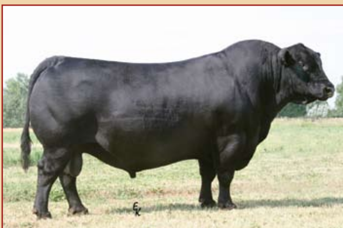
SAV Final Answer 0035 / Sire of Lot 38.

38 Quaker Hill Final Answer 9N6 Birth Date: 9-12-2009 Bull 16685237 Tattoo: 9N6