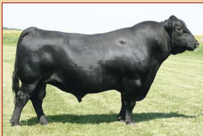
Bon View New Design 878 / A daughter of the former breed leader for registrations sells as Lot 63.