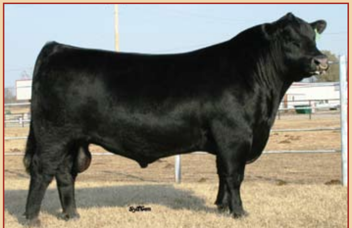
Sydgen CC&7 / The service sire of Lot 40.