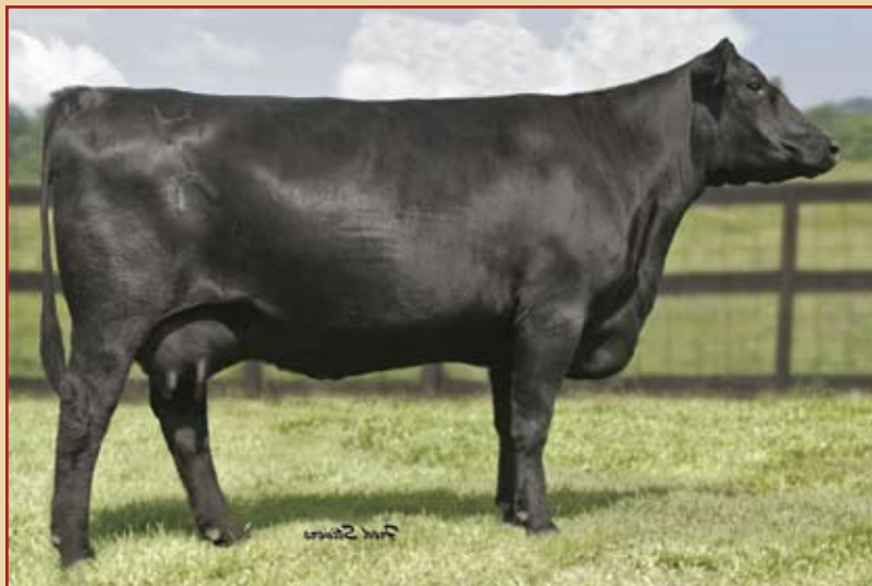
HA 4167 Lady 1014 / The former Quaker Hill donor and dam of Lot 41.