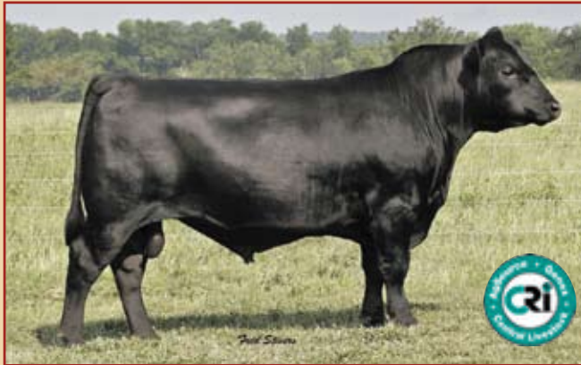
Ideal 4355 of OT26 2440