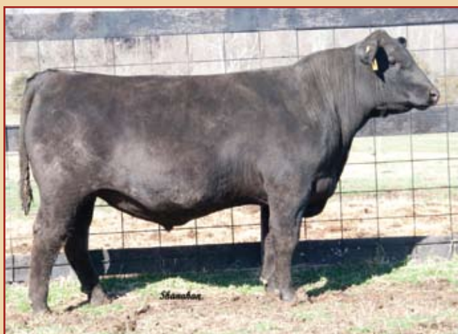
Quaker Hill 5050 0M1 / He sells as Lot 15.