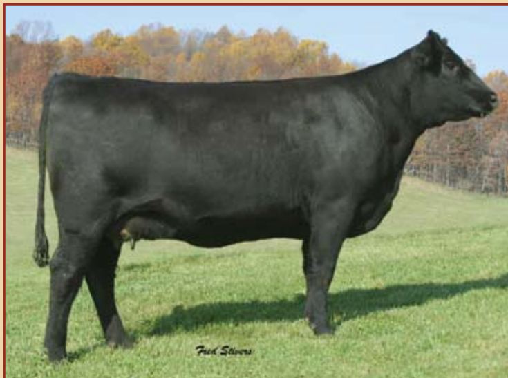
Sugar Loaf First Lady K503 / The $7,300 valued maternal sister to the dam of Lot 50.