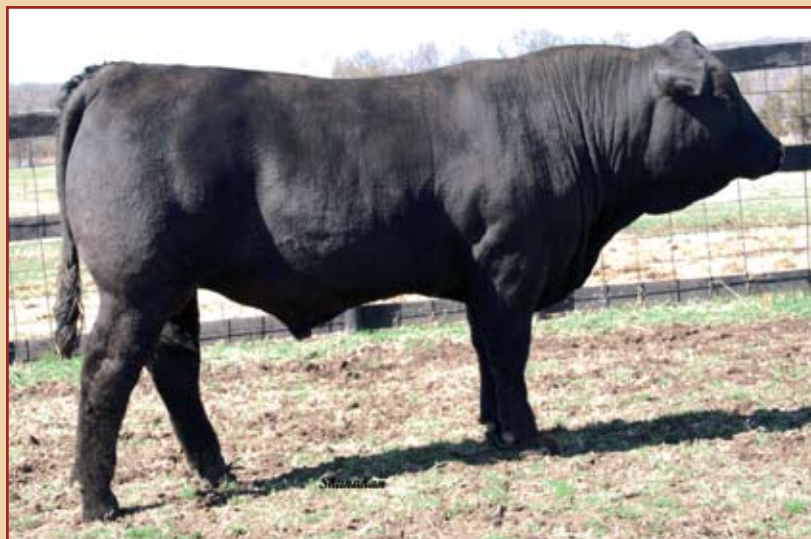
Quaker Hill Lucky Boy / Lot 24