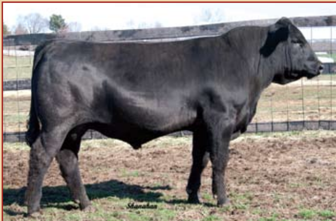
Quaker Hill Bravo X200 / Lot 36

36 Quaker Hill Bravo X200 Birth Date: 3-15-2010 Bull 2548028 Tattoo: X200