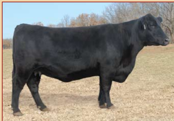
Twin Valley Primrose 1154 / The donor dam of Lot 49.