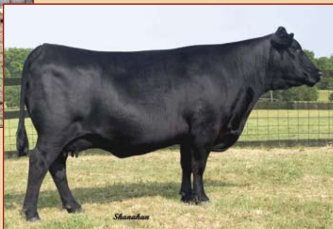
Quaker Hill Blackcap 8H1 / The well-known flush sister to the dam of Lot 18.

#TC Total 410 [AMF-CAF-NHF] #Bon View New Design 208 [CAC-AMF-NHF] Quaker Hill Erianna 8T2 +TC Erica Eileen 2047 [NHC-AMF] 16140045 #Quaker Hill Erianna 2J3 [AMF-NHF] #SS Objective T510 0T26 [AMF-CAF-NHF] Quaker Hill Erianna 0A12