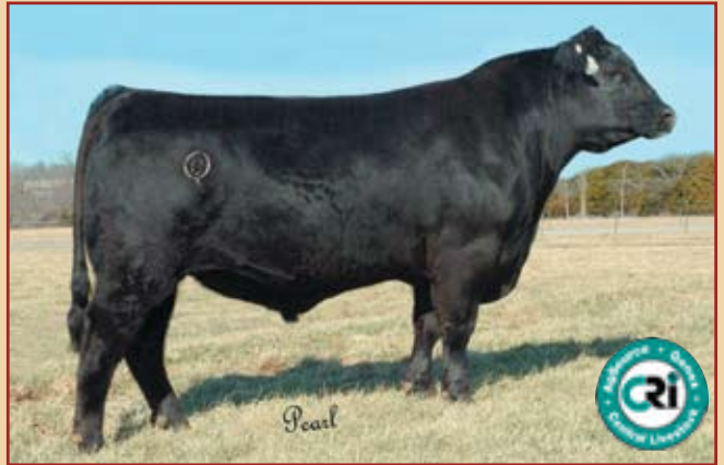
Quaker Hill Objective OT26