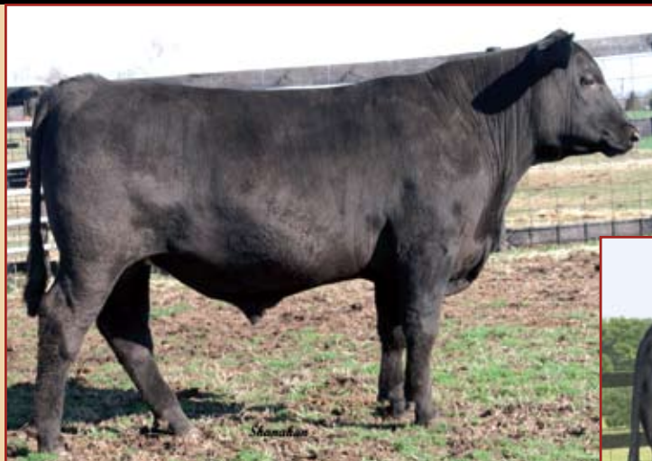
Quaker Hill 5050 8T2 / Lot 16