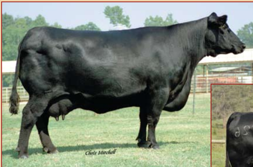
SVF Forever Lady 57D / A descendant of this legendary donor sells as Lot 54.