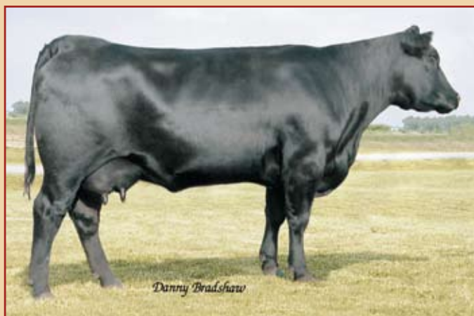
ALC Hazel L12L / The well-known dam of Lot 46 and the Select Sires roster member Big Eye.