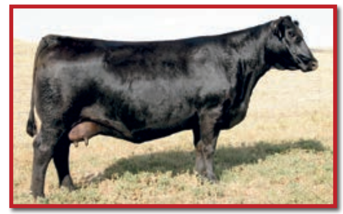
4 SAV ELBA 4236 - Grandam of Lots 5-5D.