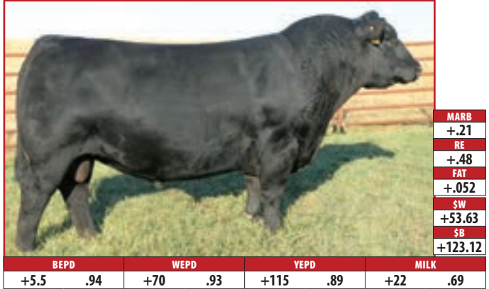
SAV INTERNATIONAL 2020- The $400,000 record-selling Lot 1 bull of the 2013 SAV Sale, sired by SAV Harvestor 0338 from SAV Emblynette 5483.