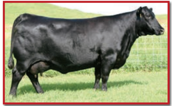
SAV ELBA 1094 - Third dam of Lots 5-5D.

Maternal brothers include the top-selling bulls of the 2016 and 2017 DBL Sales.