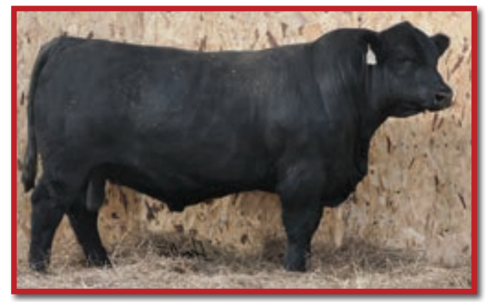
PINEHURST SEEDSTOCK 6021 - Lot 76

A maternal brother was the $15,000 top-selling bull of the 2015 DBL/Pinehurst Sale.