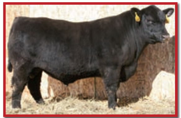
PINEHURST POINT MAN 2332 - $8,000 maternal brother to Lot 74.

This son of SAV Seedstock 4838 was produced from a dam who records progeny weaning and yearling ratios of 104 and 102, respectively, on five calves.