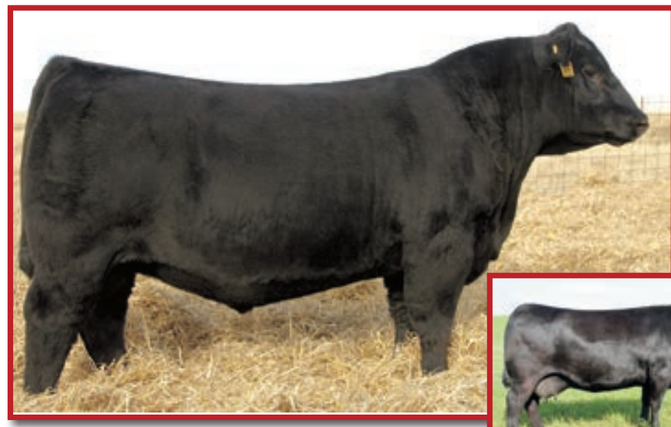
SAV REVOLUTION 4846 - Reference Sire B

This powerful herd sire was selected as a $100,000 feature of the 2015 SAV Sale where he was the heaviest 365-day weight ET bull of the entire offering, and was produced from the mating of the $120,000 SAV Revere 1180 with the all-time world record income-producing cow SAV Blackcap May 4136 who has generated more than $8.5 million in progeny sales to date.