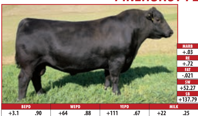
SAV SEEDSTOCK 4838 - The $235,000 lead-off bull of the 2015 SAV Sale, sired by SAV Registry 2831 from SAV Blackcap May 4136.