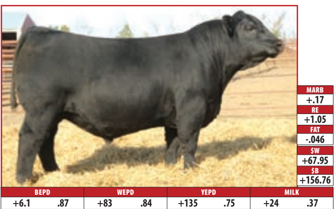
SAV REGARD 4863 - The $180,000 top-selling bull of this sire group in the 2015 SAV Sale, sired by SAV Resource 1441 from SAV Blackcap May 5530.