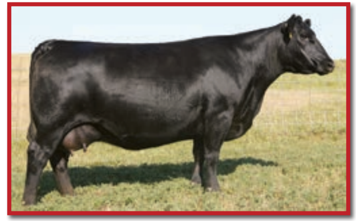
SAV BLACKCAP MAY 5530 - The Pathfinder Dam of 13 SAV Reproduction 5632 whose progeny sell.

+2.4 .32 +58 A promising prospect from the first calf crop by the $30,000 Pinehurst, DBL and ZWT sire SAV Reproduction 5632 who has the distinction of being a full brother to the Genex sire SAV Regard 4863 and the ST Genetics sire SAV Robust 4858. The dam of this heifer is a product of the embryo program by the high-performance and high-maternal sire SAV Harvestor 0338 backed by generations of prominent donors.