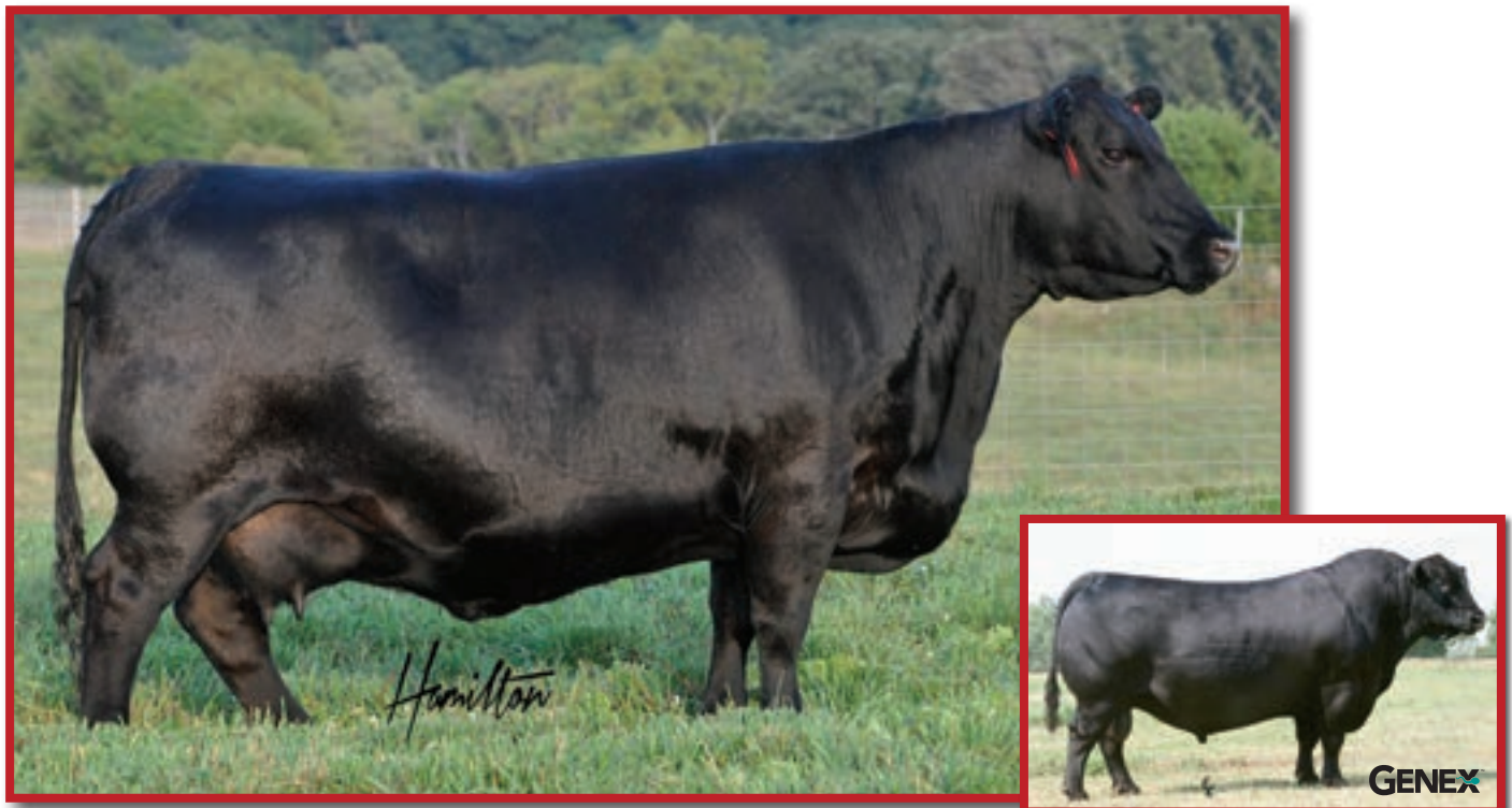
SUNSET FRVR LADY 8N03 - Lot 1 and dam of Lots 1A-4B, 50, 68 and 78. SAV FINAL ANSWER 0035 - The Pathfinder Sire of Lot 1.