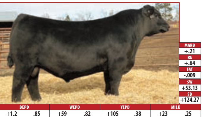
SAV SENSATION 5615 - The $650,000 top-selling lead-off bull of the 2016 SAV Sale, sired by SAV Registry 2831 from SAV Blackcap May 4136.