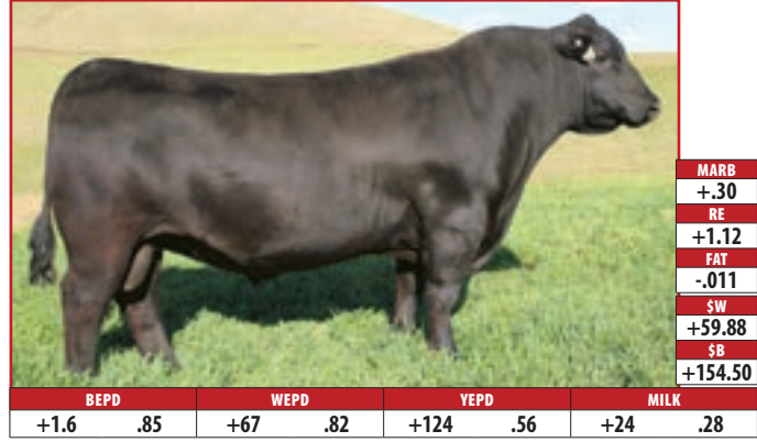
SAV PEDIGREE 4834 - The $725,000 world record-selling bull from the 2015 SAV Sale, sired by SAV Pioneer 7301 from SAV Blackcap May 4136.