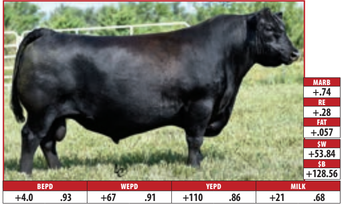
MOHNEN SOUTH DAKOTA 402 - The $120,000 record-selling bull of the 2015 Mohnen Sale featured in the Semex Al Stud, sired by Mohnen Density 730 from Mohnen Jilt 539.