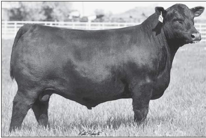
S Powerpoint WS 5503 - The sire of the embryos selling as Lot 9.