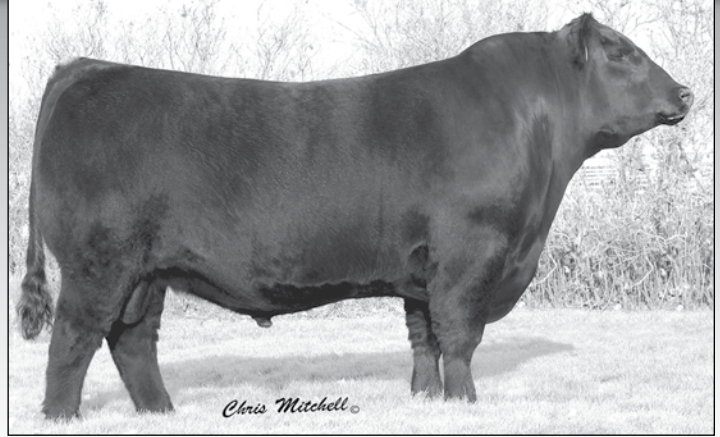
Vin Mar O Reilly Factor - The influence of this popular AI sire sells.

Owned by New Penn Farm A halter broke, young, high maternal granddaughter of the Pathfinder sire, HF Prowler 43U in this female who offers double digit CED and is very feed efficient. Sells with a BULL calf at side, (Lot 1A) born 3/1/19, sired by New Penn Signature Boy 4847.