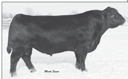
Plattemere Weigh Up K360