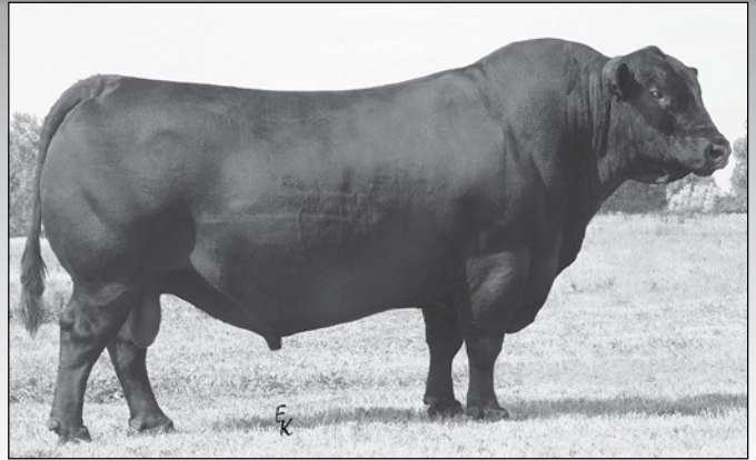
SAV Final Answer 0035 - The influence of this high maternal Pathfinder sire sells in Lot 38.

Owned by Mason's Angus Farm Double digit CED in this granddaughter of SAV Final Answer 335 who posted %IMF-116 and UREA-107. Her high maternal dam records WR 7@101. Due to calve April 2019 to SAV Quarterback 7933.