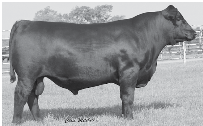
Deer Valley All In - A daughter of this breed-leader in the Select Sires lineup sells as Lot 34.

Sells with a HEIFER calf at side, (Lot 34A) born 3/1/19, sired by JMB Traction 292.