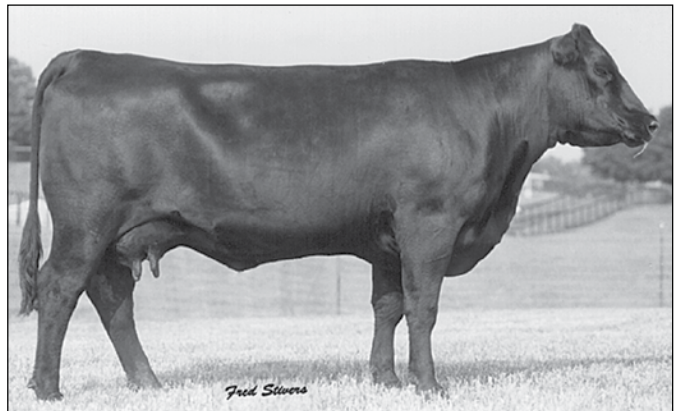
SVF Forever Lady 181C - The high income producing maternal grandam of Lot 41.

Owned by Murphy Farm Outcross genetics at their very best in this proven female who records 1@103. Her dam, who is a direct daughter of the high income producing, Forever Lady 181C, records BR 4@99 and WR 4@101. Sells with a HEIFER calf at side, (Lot 41A) born 3/9/19, sired by WRA Mirror Image 211. Will be rebred to Virago Black Magic.