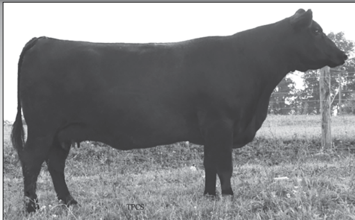
TVF Duchess's Full Power 807 - She sells as Lot 27.