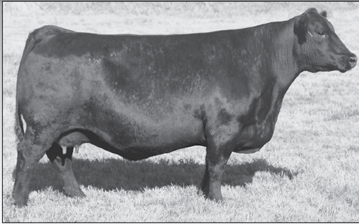
Frosty Answer 3979 - The dam of Schiefelbein Effective 61 and paternal grandam of Lots 14 and 15.