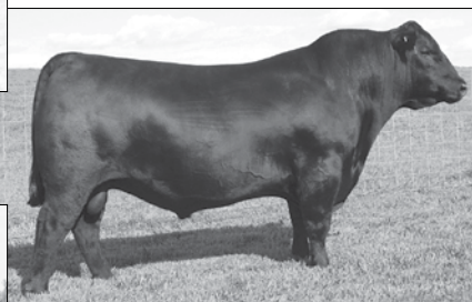
Sitz Upward 307R