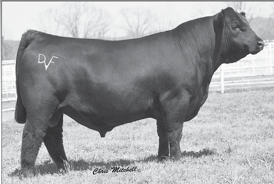
Deer Valley Growth Fund - The popular sire of Lot 6.