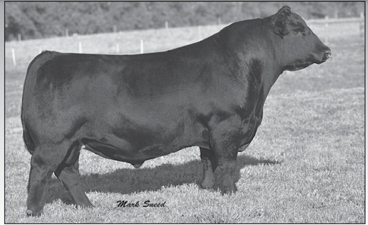
PVF Insight 0129 - Direct daughters of this breed-leader in the Genex lineup sell.