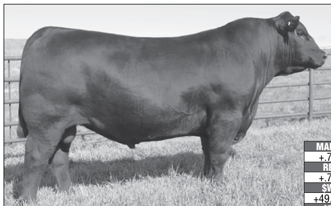
SAV Ten Speed 3022