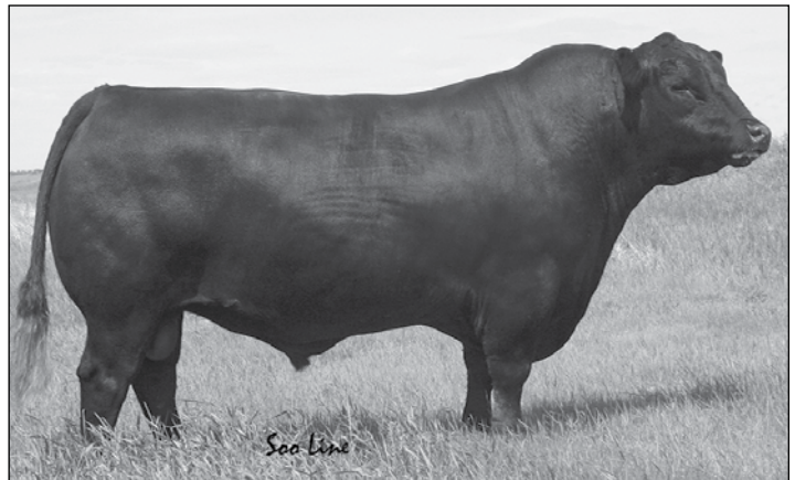
HF Kodiak 5R - The influence of this proven Canadian sire sells.