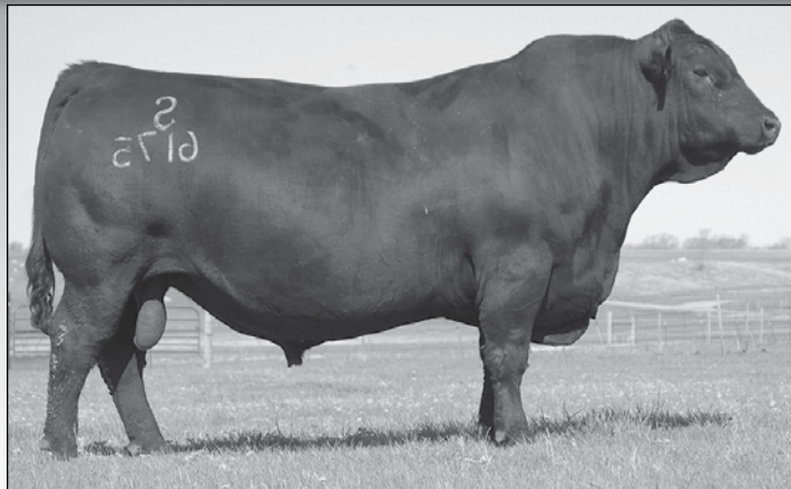
S Chisolm 6175 - A daughter sells as Lot 33.