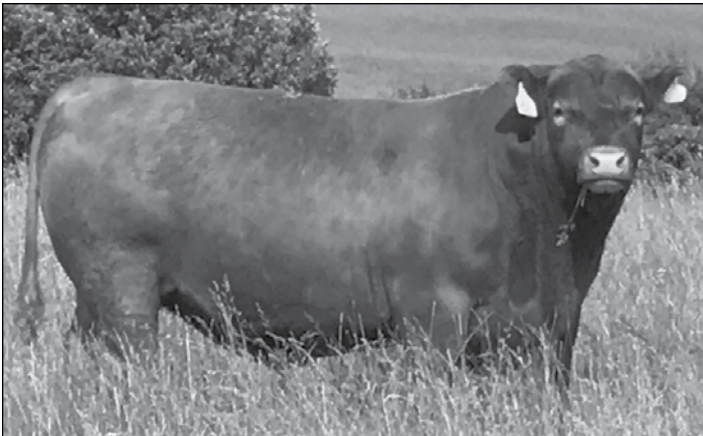
Phillips Hoyt 52 - Sire of Lots 106-108.

Owned by Finger Lakes Cattle Company Outstanding growth values ranking in the top 6% of the breed for both WW and YW EPDs in this female whose dam is ten years of age and still in production, and her grandam is fourteen years of age and still in production. Several breed-leading AI sires stacked in this pedigree. Sells with a HEIFER calf at side (Lot 111A) born 2/26/19 sired by 5L Independence 60-298X. RE MARB 0.07 0.54