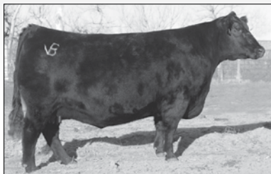
JMB Emulota 013 - The powerful dam of Traction and maternal grandam of Lot 6.

An exciting opportunity to select a set of embryos sired by one of the breed's most popular young AI sires today, Deer Valley Growth Fund, who is one of the most prominent bulls in the Select Sires line up. The donor dam of this embryo package excels for calving ease, growth and end product values and is a maternal sister to the high performance Select Sires AI sire, JMB Traction 292.