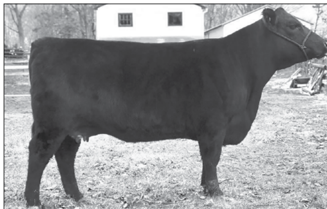
Diamond B Pride of AZP - This many times champion is the dam of Lot 31.

Sells with a HEIFER calf at side, (Lot 31A) born 3/7/19, sired by Cole Creek Cedar Ridge IV.