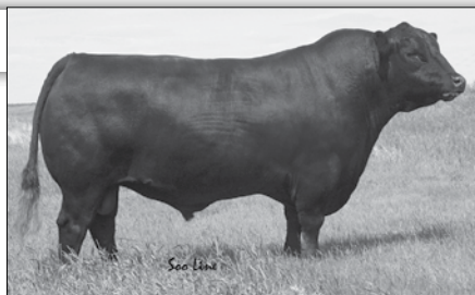
HF Kodiak 5R

HF Kodiak 5R Angus - Red Carrier 10 Units Owned by Brackle Ridge