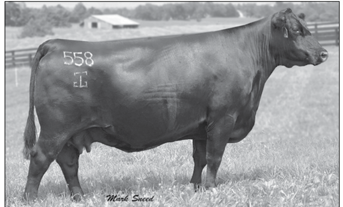
GAR Bextor 558 - This $70,000 valued full sister to GAR Prophet is the maternal grandam of Lot 12.

Low birth with added growth and performance in the daughter of the record selling Baldridge Colonel C251. Her dam by Ten X is a direct daughter of the $70,000 valued full sister to GAR Profit, GAR Bextor 558. She ranks in the top 4% of the breed for WW and REA traits with a 5% ranking for yearling growth and $W value.