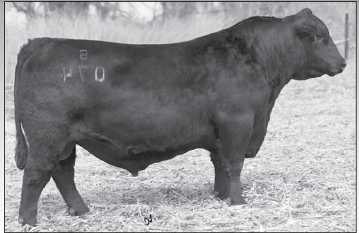
Baldrige Beast Mode B074 - The service sire of Lots 22 and 23.

Bred AI 3/25/19 to Baldrige Beast Mode B074.