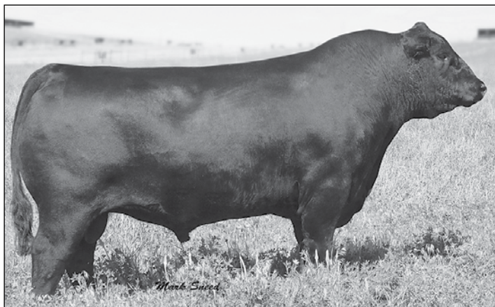
Connealy Consensus - The influence of this rare high maternal sire sells in Lot 37.

Owned by Russell Vacinek A daughter of the $210,000, Connealy Consensus 7229 from a dam by Emblazon from the Everelda Intense cow family. Due to calve April 2019 to Rollin Coal 5K8.