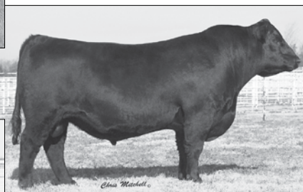
Plattemere Weigh Up K360