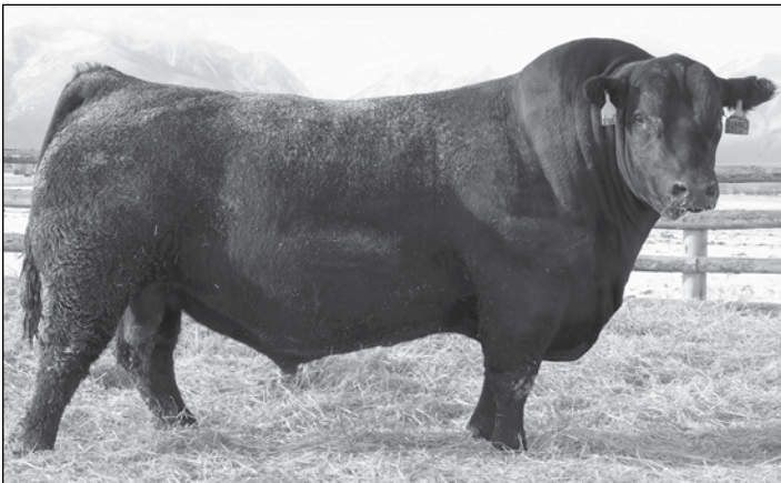
Coleman Charlo 0256 - A daughter of this proven and popular AI sire sells as Lot 22.