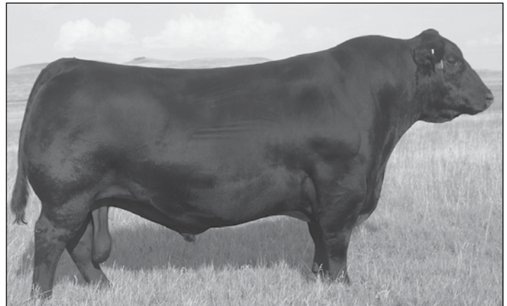
SAV Renown 3439 - A daughter sells as Lot 24.