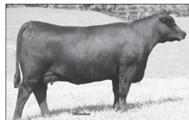
Limestone Pure Pride T152 - The prominent maternal grandam of Lot 7.

A great opportunity to select a set of embryos by the ABS Global sire, Basin Payweight 1682 from a dam who is one of the top daughters of the all-around performance sire, EXAR Denver 2002B. The dam of these embryos, who has been a long-time donor in the At Ease program, is a direct daughter of one of the breed's great Lookout dams, Pure Pride T152.