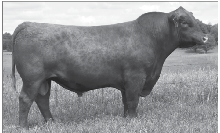
15 5L Independence 560-298Y - The sire of Lot 111A.