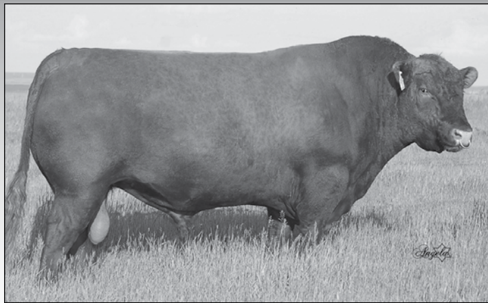
RED RMJ Redman 1T - The sire of Lot 112.