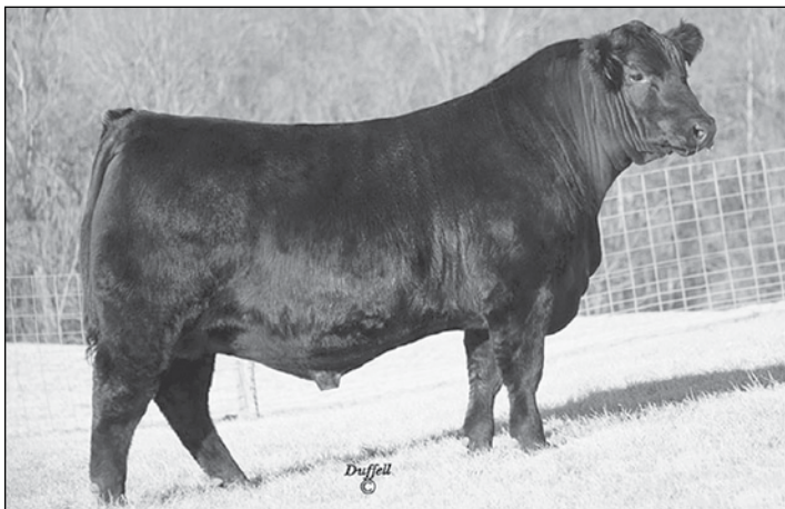
Whitestone 18-Million - The service sire of Lot 43.

Owned by Mason's Angus Farm Individual WR-105 and YR-100 in this Rito Revenue daughter. Her productive dam by EXT is a direct daughter of Forever Lady 181C and records WR 2@105. Due to calve 7/11/19 to Whitestone 18-Million.