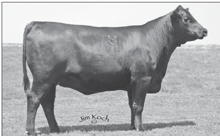
B/R Young Lucy 449 - The proven maternal grandam of Lot 28.

Will sell with a calf at side (Lot 28A) Sired by ZWT Summit 6507.