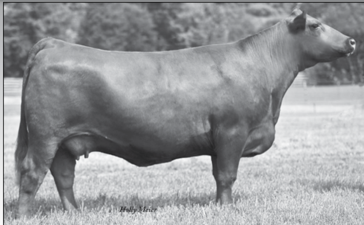
Trowbridge Lana 707 - The donor dam of the embryos selling as Lot 101.