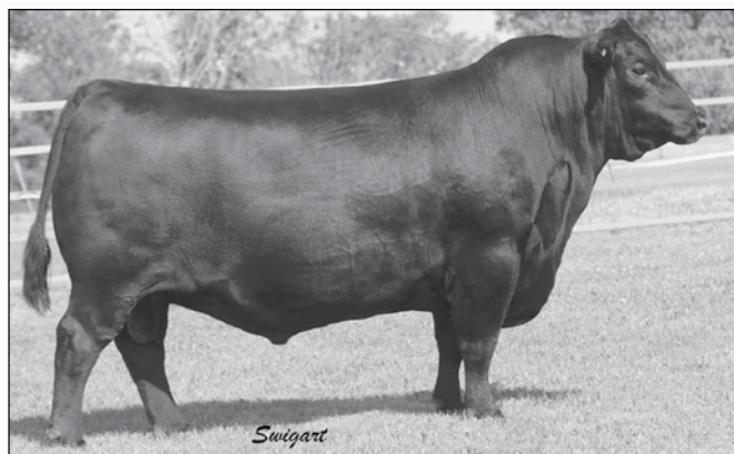
Bobcat Black Diamond - A direct daughter of this proven high maternal and calving ease sire sells as Lot 30.

Sells with a HEIFER calf at side, (Lot 30A) born 1/27/19, sired by GAR Drive. Bred AI 3/26/19 to Baldrige Bronc.