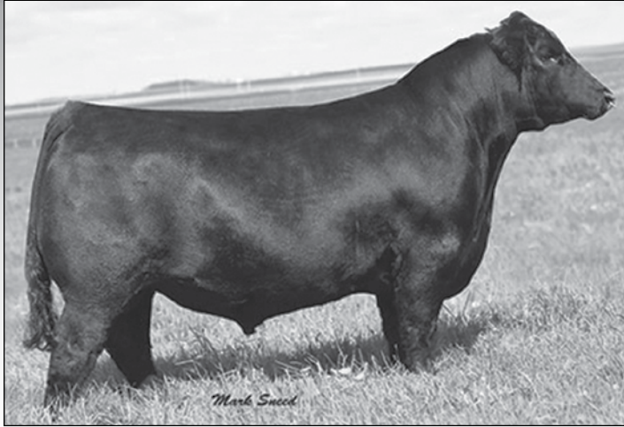
PVF Surveillance 4129 - The popular and proven sire of Lot 8.