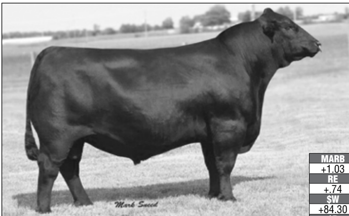
Quaker Hill Mile High 4EX31

Owned by Pleasant Valley Farm Calving ease with added growth in this halter broke daughter of Quaker Hill Mile High. Her dam combines the high maternal traits of SAV Final Answer 0035 with a top daughter of BC Lookout from the Forever Lady cow family.