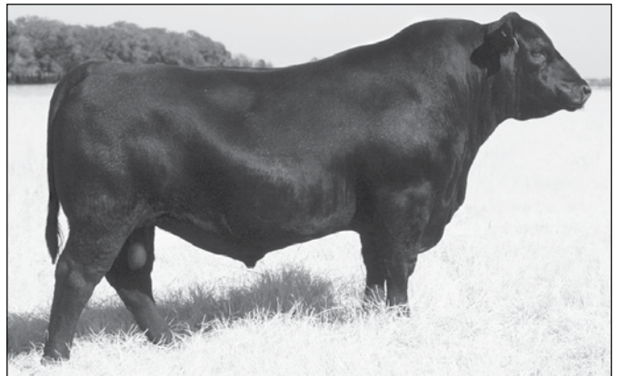
EF Authentic 0829 - A daughter sells as Lot 40.

Owned by Pompey Hollow A low birth daughter of the Pathfinder sire, EF Authentic. Her dam is backed by the famous TC Peg cow family. Will sell with a calf at side, (Lot 40A) Sired by Basin Excitement.