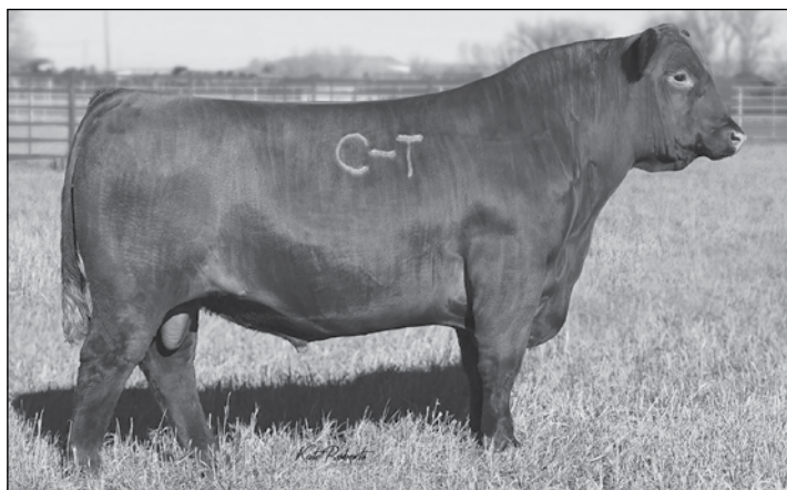
C-T Red Rock 5033 - The sire of Lot 103.

Owned by Wayward Wind Ranch Extreme weaning and yearling growth in this female who excels to the extreme top 1% of the breed for both WW and YW EPDs plus offers a solid balance of carcass traits.