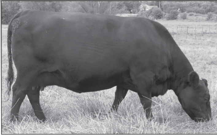
Dorado Elba E134 - This daughter of Connealy Capitalist 028 sells as Lot 42.