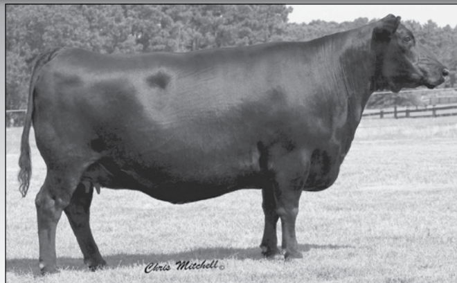
BT Everelda Entense 814L - The maternal grandam of Lot 29.

Sells with a HEIFER calf at side (Lot 29A) born 3/7/19, sired by Quaker Hill Rampage OA36.