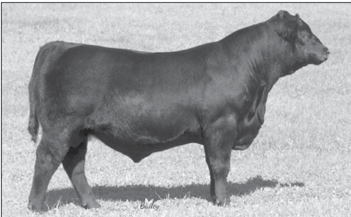
Marda Blacksmith 683 - His service sells.

Owned by New Penn Farm A top yearling replacement combining the proven traits of Kodiak with a dam sired by the $170,000, Boyd Signature 1014. Sells open and ready to breed.