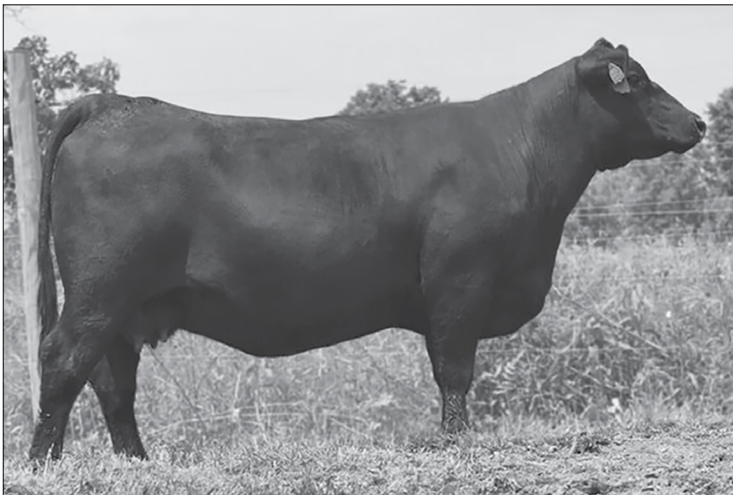
Visions Denver Pride 421 - The dam of Lot 7.

A great opportunity to select a set of embryos by the ABS Global sire, Basin Payweight 1682 from a dam who is one of the top daughters of the all-around performance sire, EXAR Denver 2002B. The dam of these embryos, who has been a long-time donor in the At Ease program, is a direct daughter of one of the breed's great Lookout dams, Pure Pride T152.