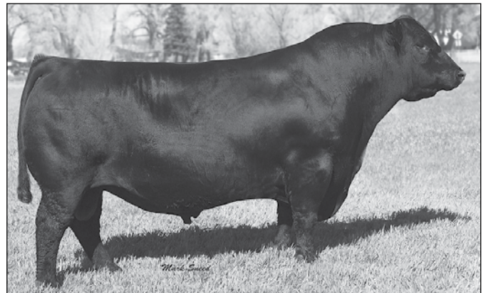
Schiefelbein Effective 61 - This extreme calving ease sire in the Genex lineup is the sire of Lots 14 and 15.

Extreme calving ease genetics in this daughter of the $45,000, Schiefelbein Effective 61. She earned a low birth ratio of 84 from her two-year-old dam by the high maternal sire, Connealy Courage.