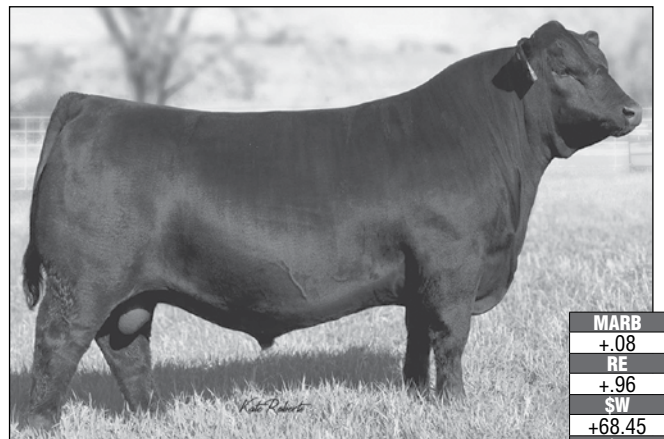
SAV Raindance 6848

Owned by Watchwind Farm and Connecticut Junior Republic A blending of the proven growth values of SAV Universal with the high maternal traits of the Pure Pride cow family in this young female, whose dam records WR 1@114. Due to calve 9/13/19 to SAV Raindance 6848.