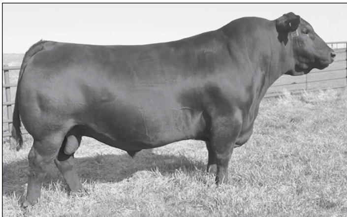
SAV Resource 1441 - This prominent Genex sire is the proven sire of Lot 10.