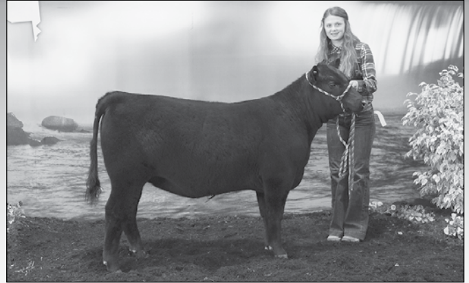
Trowbridge Miss Burgess 880 - This impressive fall heifer calf by Tehama Bonanza E410 sells as Lot 11.

Style and eye appeal combined with an impressive EPD profile in this attractive daughter of the popular and proven Select Sires AI sire, Tehama Bonanza E410. Her dam by the proven power sire, Connealy Earnan 076E is backed by one of the all-time great cow families from the Sitz program. Note that this female is double bred to the power traits of Connealy Earnan 076E.