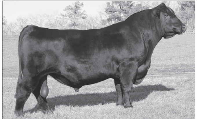
Werner War Party 2417 - This long time Select Sires AI sire is the sire of Lot 39.

Owned by Kings Roaming Angus A direct daughter of the $75,000 Select Sires AI Sire, Warner War Party 2417. She stacks three consecutive generations of bred leading growth and Pathfinder sires in her pedigree. Sells with a HEIFER calf at side, (Lot 39A) born 3/28/19, sired by KRA Upward D613.