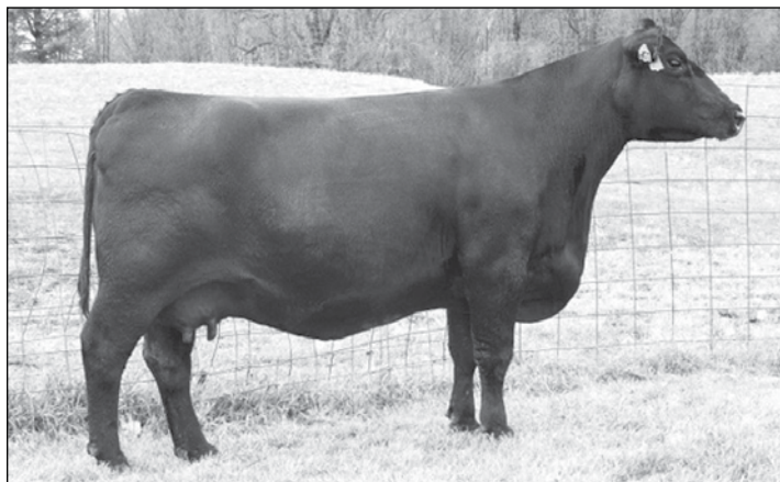
Trowbridge Pure Pride 776 - The proven donor dam of Lot 26 who has an impressive progeny record.