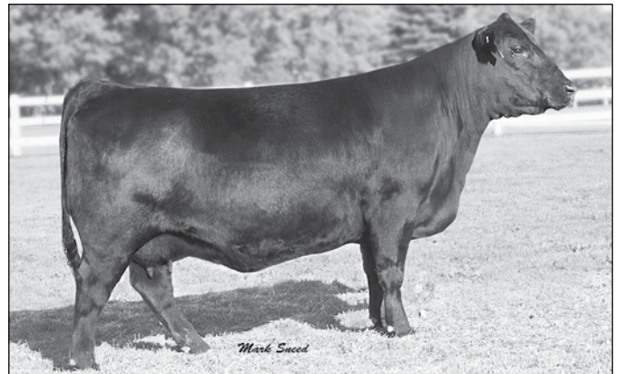
SAV Madame Pride 8827 - The foundation dam of Lot 13.

Double digit calving ease in this well-made daughter of the popular AI sire, Connealy Legendary. Her dam blends the high maternal and proven cow making genetics of Connealy Black Granite with the high income producing SAV Madame Pride cow family.