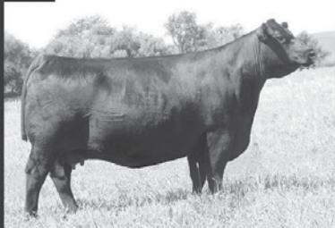
Blackstone Pride 3003 Granddam of 2XL Bronc 8153