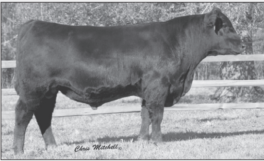
MONARCH MIDLAND U383 - Lot 12