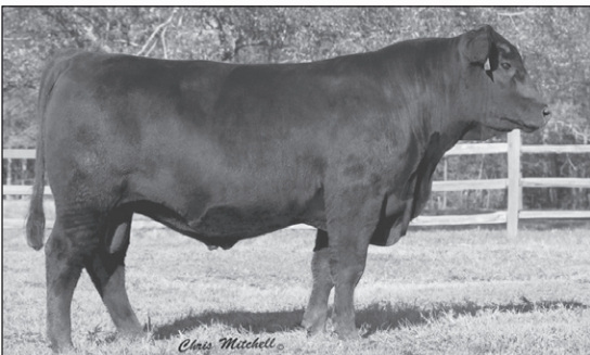
MONARCH STARDOM 8516 - Lot 29

From Interstate 55, take Amite Exit Hwy. 16, go East to caution light, go south 2 miles to sale barn on West side of Hwy. 450.