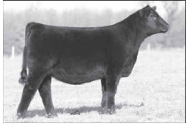
Hunters Royal Blackbird 721 - Lot 26

Excellent DNA on this "Discovery" granddaughter. She ranks in the top 1% of the breed for $B, $F, WW, YW and YH, as well as ranking in the top 10% or higher for 15 EPDs. This donor prospect goes back to S A V Emblynette 1180, G A R New Design 5050, Bakers Blackbird 8046 and Bakers Destination 6137. We think you'll appreciate her extra extension and correctness of phenotype. She also had a WWR of 108 and genomically tested in the top 24% for tenderness.