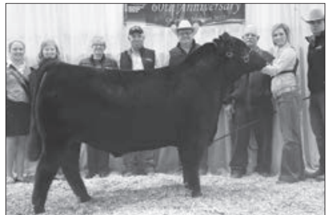
2017 Reserve Grand Champion Bull, Hunters Wyatt Earp 536 - Consigned by Hunter Angus, Fair Grove, MO and purchased by Branbrook Farms, Kidder, MO.

Presented by Tebbenkamp Show Cattle, Corder, MO. London's calling but you won't have to fly across the pond to find this one. An own daughter of the immortal "First Class" and the popular "Dixie Erica" cow family on the dam's side. She is stout and big bellied! Once her show career is over, you will be able to lead her from your show barn straight to the donor pen. Big potential here!