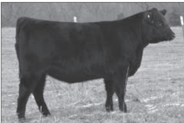
BAF Lucy B317 - Lot 25

This exceptionally made heifer is a direct daughter of the top-selling open heifer at Express Ranch's 2010 sale. She comes from the high revenue generating Basin Lucy cow family with both Basin Lucy 3829 and Basin Lucy 178E close in her pedigree. She ranks in the top 5% or better for YW, WW, $B, $F, RADG and Fat. An exceptional EPD profile on this female and one that is sure to draw attention at the stalls.