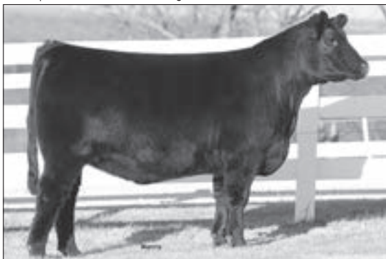
Clearwater Eriskay J 6260 - Lot 46

Presented by Clearwater Farm, Springfield, MO. Shoot for the moon with this breeding piece! Sired by MAR Innovation, Eriskay J 6260 is the Clearwater Farm pick for phenotype with a killer look! She packs tremendous internal dimension and is square-hipped in a free-moving, super-sound package. Her dam is a full sister to the Eriskay J 1425-featured donor that has been represented at the MO Futurity for more than a decade. Carrying the service of "Challenger," a new addition to the ABS sire line-up, a full brother to Baldrige Colonel. Due to calve 9/17/2018.