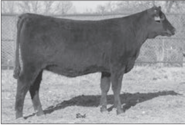
DHT Disc 639 Layla 212 - Lot 24