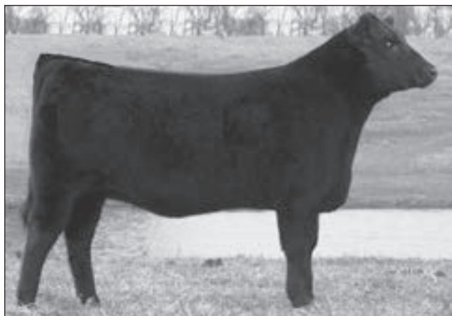
DAF Emblynette 1745 - Lot 13

Genetic potential is written all over this show heifer. Her pedigree combines two of the great breeding programs outside of the state of Missouri, Schaff Angus Valley of North Dakota and Champion Hill of Ohio. DAF Emblynette 1745's maternal great-grandmother, SAV Emblynette 7319, has produced over $750,000 worth of progeny. The Emblynette cow family has surfaced as champions at numerous Angus shows across the country. This exciting young show prospect combines a great amount of rib, muscle and femininity.