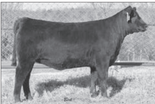
DHT Rampage 902 Maid 196 - Lot 29

Presented by Driftwood Holding Trust, Ava, MO. DHT Rampage 902 Maid 196 is a female with loads of style and body. She is the product of a very strategic mating made here at Driftwood Holding Trust that combines Quaker Hill Rampage 0A36, JMB Traction 292 and Baker's Blackbird 7170. This special heifer ranks in the top 1% for RE, $G and RADG and the top 10% or higher for $B, $F, $W, Fat, CW, YH, YW and WW.