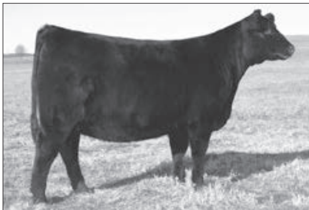
Birks Forever Lady 306 - Lot 42