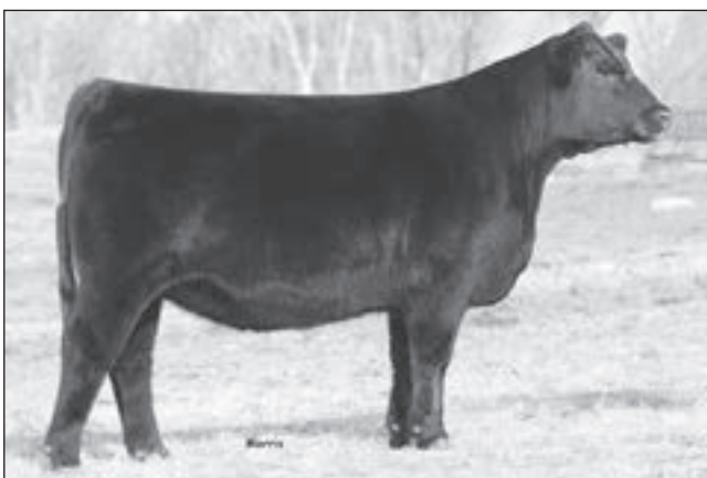
Meyer Queen 1629 - Lot 50

Presented by Birk Beef Cattle, Gordonville, MO. An excellent young donor prospect by the cow maker Vin Mar O'Reilly Factor. These O'Reilly Factor daughters are becoming very popular and productive. The dam of this great female is a descendant to the famous $750,000 producing B&M Forever Lady 294. This female is a 7/8 sister to the past several very popular cow/calf pairs we have sold through this Futurity. She is a very attractive and feminine female that is super complete. Will have a calf at side (Lot 52A) sale day, due 1/30/18 to PVF Insight 0129.