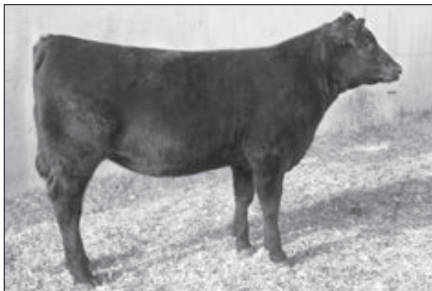
Tri-K Ruby 9722 - Lot 9

Backed by proven performance in and out of the show ring, this sweetheart show heifer prospect has been primed for handling by a first-time competitor. Maternal performance and longevity dominate her strong pedigree, offering the opportunity for years of production. This heifer's numbers are backed by genomically enhanced EPDs and she is a prime fit for raising Show-Me-Select bulls.