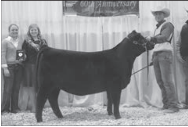
2017 Grand Champion Female, Meyer Elite 1637 - Consigned by Meyer Cattle Co., Curryville, MO and purchased by Woodruff Angus Farm, Milton, IA.