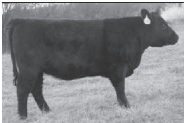
BAF Miss 7 Discovery B616 - Lot 41

This stout made daughter of "Discovery" has a pedigree stacked with nationally renowned A.I. sires. Additionally, she posts a YW EPD of 120 and ranks in the top 10% of the breed for $W and $B. The guesswork has been taken out of this heifer and it is exciting to have her at this year's Breeders Futurity for your appraisal.