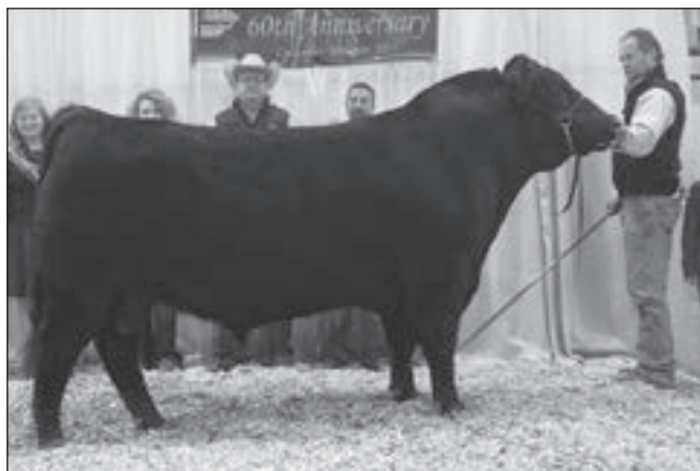
2017 Grand Champion Bull, Clearwater Scout 4205 - Consigned by Clearwater Farms, Republic, MO and purchased by Sydenstricker Genetics Inc., Mexico, MO.