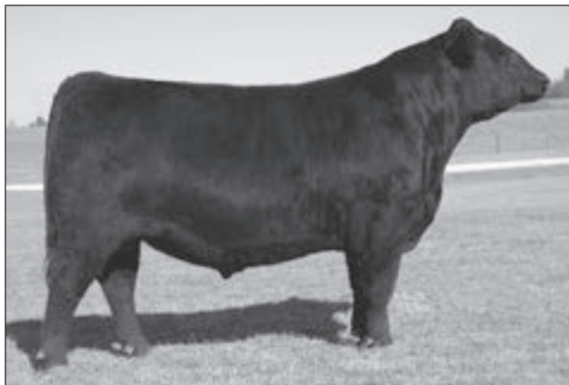
Butchs Insight D301 - Lot 79

A full two-year-old bull that is loaded with predictable genetics and an EPD profile to advance any set of cows. Here is a bull that has a Show-Me-Select CED and still ranks in the top 10% of the breed for YW and $B and an EPD of over +20 for Docility. A true herd improvement kind of bull from every angle and an exciting entry to have at the 2018 MO Angus Breeders Futurity for your appraisal.