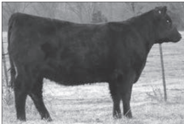
BAF Primrose-Jrny-B716 - Lot 40