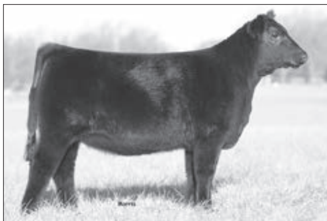
Meyer Lady 1746 - Lot 14

Here is an April female with a world of potential. She combines a great phenotype with a pedigree proven to produce replacement females or bulls after her show career. We are excited to have her for your appraisal at the Futurity.