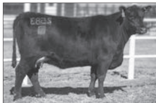
GAR 5050 New Design 2583 - Dam of Lot 55.

Presented by Brinkley Angus Ranch, Milan, MO. This offering from Brinkley Angus Ranch has the potential to move anyone's program forward in terms of carcass merit. A maternal sister to the dam was the top-selling female at Deer Valley's 2016 sale, selling for $150,000 for 1/2 interest to High Roller Angus of Texas. Additional maternal sisters sold the year before for $90,000 for 1/2 interest and $30,000. The calving ease and marbling leading grandam, GAR Progress 830 posts progeny ratios that include IMF 44@113 and REA 44@102. She is a $425,000 valued cow that is the #1 MB proven dam in the breed at her accuracy. The sire of this pregnancy, SydGen Enhance, is a fescue produced bull that is one of the most popular young sires in the Angus breed. He brought $30,000 for 1/2 interest and was co-top selling bull in Sydenstricker's 2015 production sale. Additionally, he boasts individual ratios of WWR 116, YWR 114, IMF 132 and RE 108 and is one of the breed leaders in the ever so sought after $B Value. Due to calve 9/22/2018.