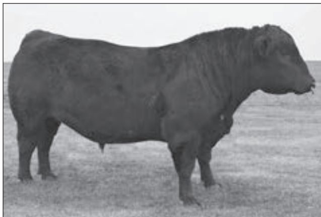
Lewis Tin Pan 603 - Lot 81