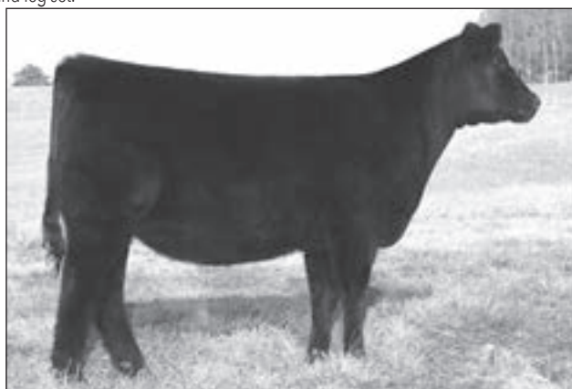
Birks Forever Lady 187 - Lot 10

An outstanding July show prospect sired by the 2016 Forth Worth Reserve Grand Champion 5T Power Chip 4790 and backed by a very good Vin Mar O' Reilly Factor daughter from the famed Forever Lady family. The dam of this female is a flush sister to the very popular cow/calf pair that we sold in the 2017 MO Angus Futurity for $6,800 to Lappe Farms. This female has lots of look and style with a beautiful hip and hind leg set.