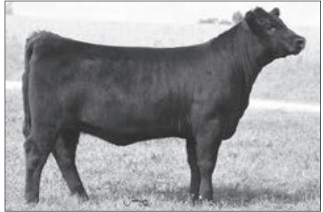
TCCC Forever Lady 91957 - Lot 30