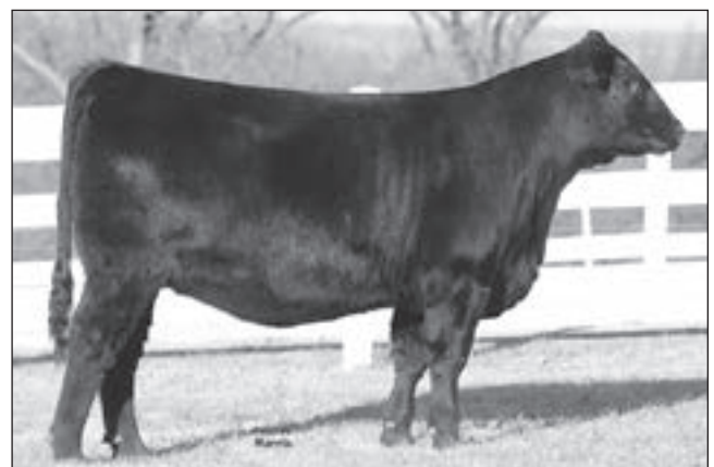
Clearwater Forever Lady 6215 - Lot 48

Presented by Clearwater Farm, Springfield, MO. Here's your chance to own a Forever Lady, tracing to the $20,000 New Trend daughter out of Forever Lady 294. Sired by the Genex growth trait leader MAR Innovation, Forever Lady 6215 has the power, bone and mass to bring performance to any cowherd. The Forever Lady's are consistent producers, with her grandam by EXT still calving as a 12-year-old. She carries the service of V A R Legend, the Discovery son from the Henrietta Pride family. Due to calve 9/19/2018.