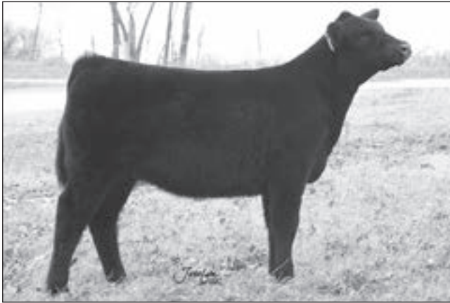
H S Eila Eila 944 367 - Lot 1