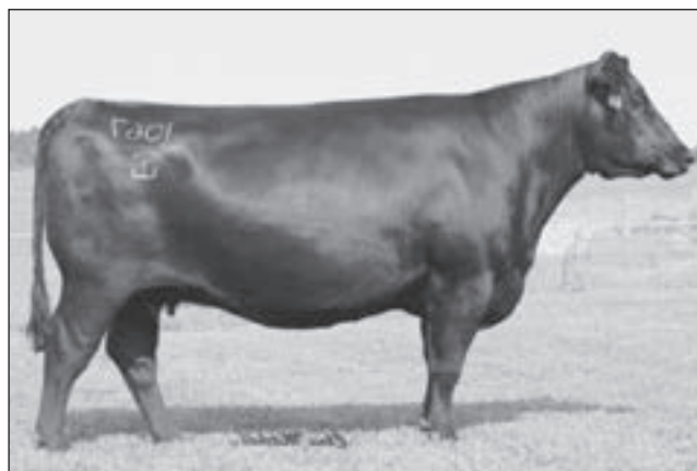
GAR Objective 1067 - Maternal great-grandam of Lot 60.