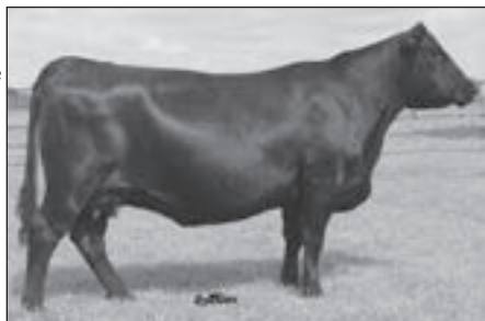
EXAR Henrietta Pride 9343 - Dam of Lot 57.