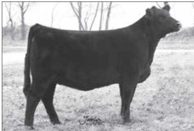
H S Lady Blackbird 518 117 - Lot 23

Here is a heifer bred for style and class. The sire of this female is the widely used Silveiras S Sis GQ 2353 and the dam originated from the famous Wallace Cattle Co. herd here in MO. This young female is loaded with look and has the potential to make a great project for an up-and-coming Angus junior.