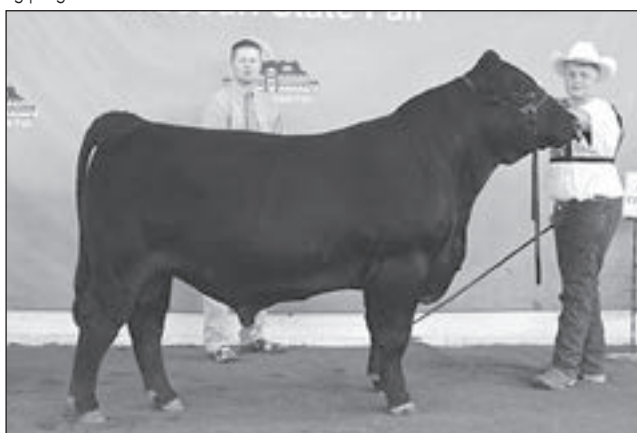
S L F Rizzo 6018 - Lot 80

This two-year-old is a big-footed herd sire that is incredibly sound from the ground up. He was a many-time champion, including grand champion bull at the 2017 Missouri State Fair FFA show. SLF Rizzo 6018's dam is a consistent top producing female in the Rhode herd. He's docile, kid-broke and sure to be an asset to any purebred or commercial breeding program.