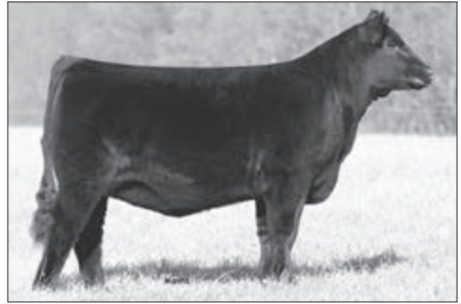
BDM Prizemere Style 643 - Lot 47

Presented by Daves Angus Farms, Buffalo, MO. This special bred heifer entry from Daves Farms comes right out of their replacement heifer pen. Phenotypically, a heifer you'll find to be very correct and comes with some extra stoutness. Not to mention a pedigree that is stacked with herd sires that have left a major impact across the county, starting with Connealy Consensus 7229 and on the bottom side of her pedigree Connealy Western Cut and H A S F Bando 1961, one of the dominant sires that helped catapult the Musgrave Angus program from Illinois. Bred to SydGen Exceed 3223 on 12/5/17; pasture exposed to DAV CC&7 014 from 12/20/17-2/16/18.