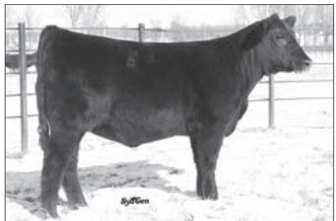
SydGen II Rita 7179 - Lot 35