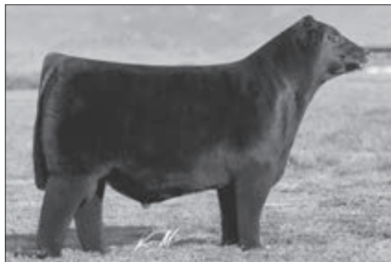
Colburn Primo 5153 - Sire of Lots 56 and 58.