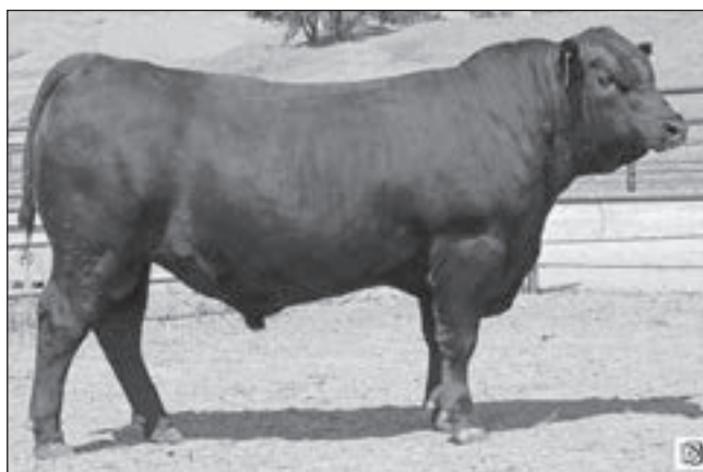
Diablo Deluxe 1104 - Sire of Lot 59.

Presented by Galaxy Beef LLC, Maryville, MO. Selling four embryos with the guarantee of two successful transfers if implanted by an AETA-certified technician. Galaxy Blackbird 4551 embodies all the positive traits of the Angus breed, from shape and kind, foot and udder structure and EPD profile. She is a maternal sister to the high-selling lots in both the 2017 Galaxy Beef LLC Show-Me the Beef! Spring bull sale and the 2017 Galaxy Beef LLC Black Friday Fall production sale. The grandam is a maternal sister to Sandpoint Blackbird 8809, the prolific bull producer at Vintage Angus Ranch. Diablo Deluxe 1104 was the winner of the 2017 Cal Poly Bull Test, has all the correct EPDs, great structure, fluidity in his movement and is docile to boot.