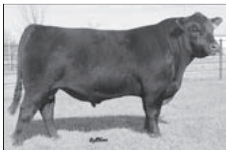
SydGen Enhance - Sire of Lots 55 and 57.

Presented by Sydenstricker Genetics, Mexico, MO. Selling five frozen IVF embryos with the guarantee of two successful transfers if implanted by an AETA-certified technician. A special feature of this year's event will be an embryo package of 5 frozen IVF embryos from the $60,000-valuation EXAR Henrietta Pride 9343, an own daughter of Sitz Henrietta Pride 643T sired by PA Power Tool 9108. 9343 was the top-selling cow at $30,000 for one-half interest in our November production sale to Greiner Angus, Kalona, IA. 9343's first six calves to sell, also in our 2017 production sale, grossed $50,000 including the third top-selling bull calf, SydGen Black Ice 7029. This cow family has produced many of the breed's top-selling females and bulls in recent years, and 9343's mating to the widely-used SydGen Enhance offers a breed-leading package of both EPD and phenotypic excellence.