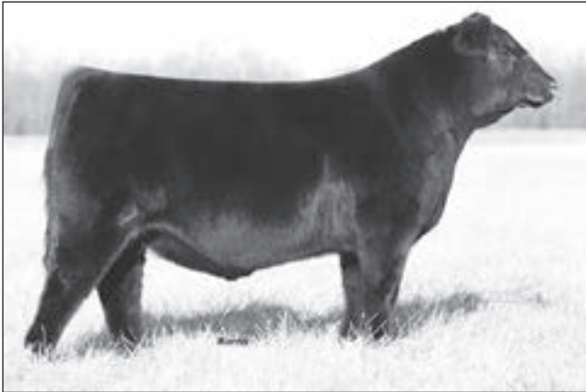
Meyer Insight 1732 - Lot 65

Presented by Green Gate Farm and Frey Family Angus, Wentzville, MO. This young herd sire has a Show-Me-Select qualifying CED and is sired by the Reserve Grand Champion bull at the 2016 Fort Worth Stock Show. The dam of GGF/Freys Power Ranger E19 has a tremendous track record in the Cow/Calf Division at the Atlantic National ROV Show. She herself was the Champion Cow/Calf Pair in 2015 and she produced the Champion Cow/Calf Pair in 2016 as well as the Reserve Champion Cow/Calf Pair in 2017. This young herdsire has a Show-Me-Select qualifying CED and maintains a $B number in the top 50%. He is bred to make a set of calves with extra pop and style. Selling 2/3 semen interest with full possession.