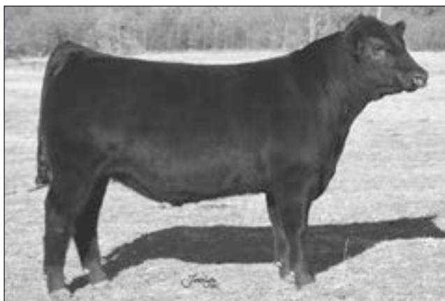
Our Place XXL 325 713 - Lot 70

A true herd sire prospect with a unique outcross pedigree. This bull offers the power, performance, bone, and exceptional depth of body. Guyman is super sound and extremely long bodied. The future is unbelievably bright for this junior herd sire.