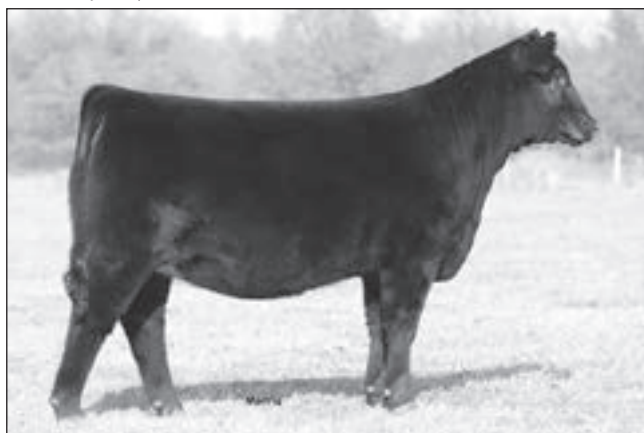
Hunters Rose 701 - Lot 37

Presented by Paige Birk, Gordonville, MO. A very complete and stylish female that will be competitive at all levels in the show ring. Sired by the popular Champion 74-51 Sudden Look 1023 this female is out of Paige's 2015 MO State Fair Reserve Grand Champion FFA Heifer. She is very thick, deep bodied and powerful with a very nice hind leg set and stout hip. At the end of her show career, this female will be a donor female with lots of cow power and productivity just like her dam.