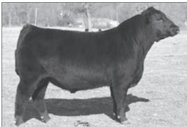
OurPlace Front Runner 25 715 - Lot 69

Don't forget to "like" our Facebook page ( https://www.facebook.com/Missouri-Angus-Association-128147131167/ ) to get updates and reminders on upcoming events.