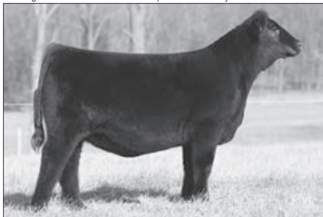
Hillard Lady 705 - Lot 20

An extremely nice March Style x Brilliance show heifer that has already made many friends. She has a tremendous amount of eye appeal. She is a neat necked, big bellied, square hipped female that sure has the parts to compete at any level. She descends back to the popular Werner Lady 3107 which was the 2009-2010 ROV Show Heifer of the Year. We are extremely proud to offer this heifer straight from the show team! Seller reserves the right for 2 flushes at the seller's expense and the buyer's convenience.