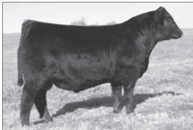
Birks Sudden Look 276 - Lot 75