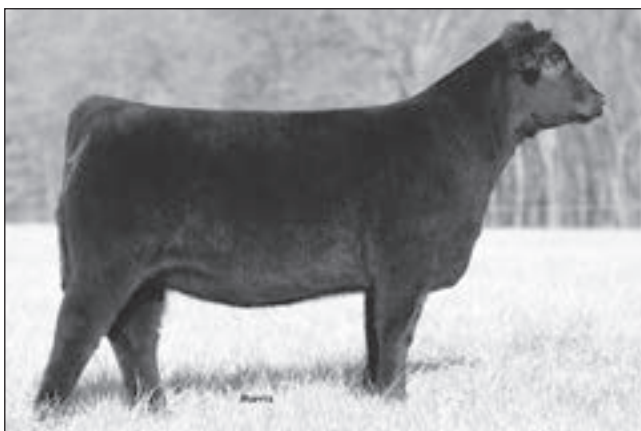
Harvey Miss Look 1728 - Lot 33