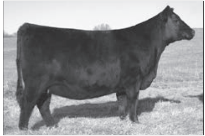
Birks Forever Lady 66 - Lot 51