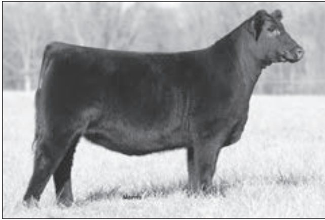
Harvey Miss Sassy 17117 - Lot 32