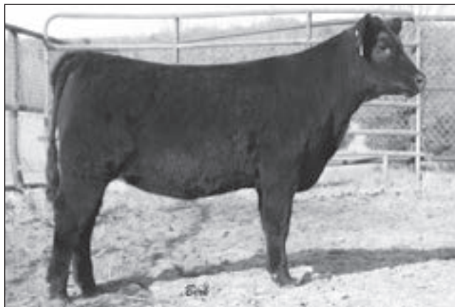
DHT Bism 919 Embly 250 - Lot 11

This foundation heifer that comes from Driftwood Holding Trust is exceptional in her build and out of a dam that ranks in the top 1% for $B and RE. The dam of this heifer also very uniquely combines an RADG EPD in the top 1% and DMI EPD in the top 3%. Ultimately, ranking her in the top 25% for 17 EPDs.