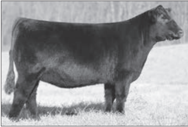
Hillard Frontier Gal 612 - Lot 49