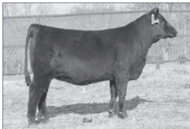
DHT Generation 626 Sandy 223 - Lot 21

A standout in the pasture from day one, we are excited about the future of this young female. An own daughter of BSF Hot Lotto 1401 and tracing back to the legendary Famous 7001 on the bottom side of her pedigree, she is sure to be a genetic contributor for years to come.