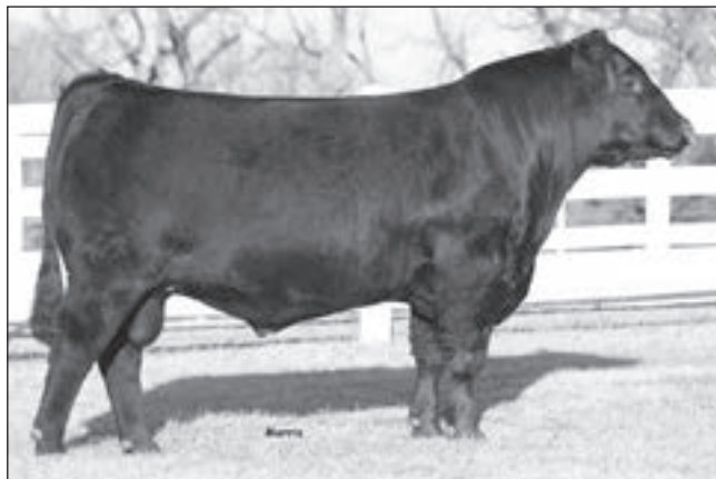
Clearwater Commander 6201 - Lot 76