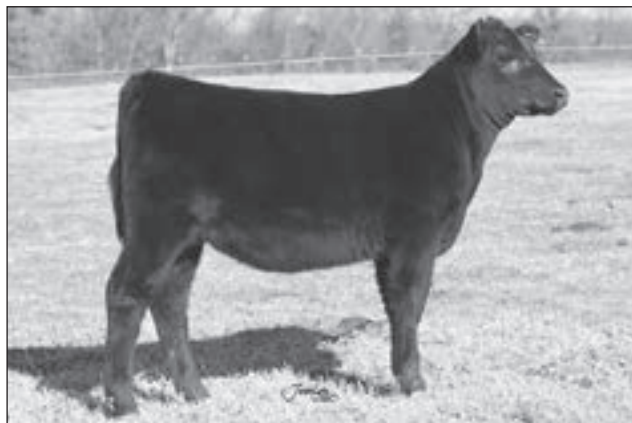
Our Place Lady Pride 427 - Lot 7