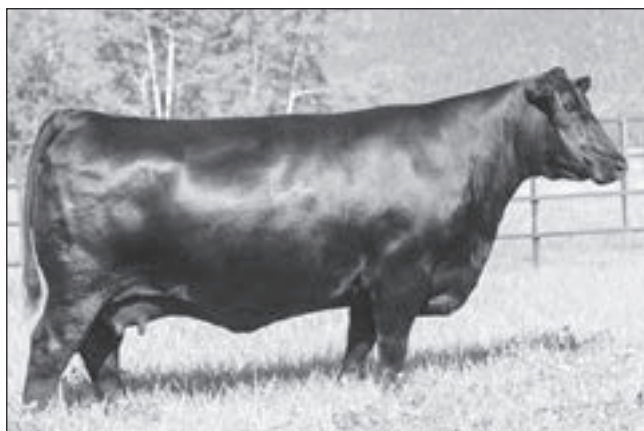
Galaxy Blackbird 4551 - Dam of Lot 59.