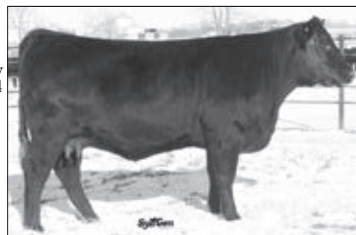
SydGen Forever Lady 5427 - Lot 54