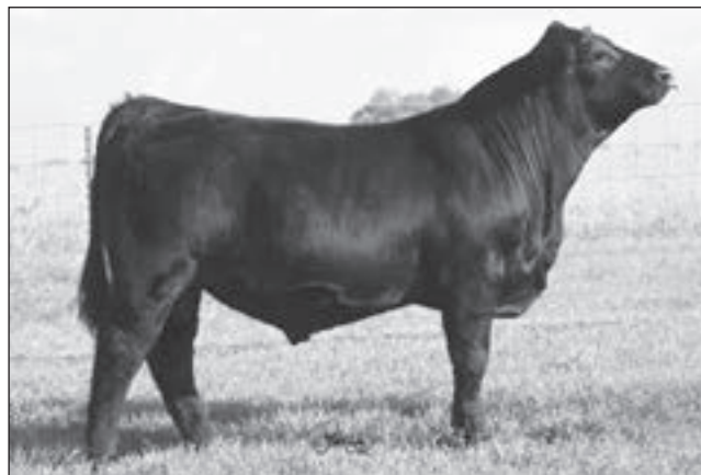
TCCC Consensus 1181D - Lot 74

BARA McKinley 7101 has a staggering list of showing wins already under his belt as a calf. At the side of his dam, they were named Grand Champion Cow/Calf Pair at the MO Junior Angus Preview Show, Ozark Empire Fair Junior Show, Ozark Empire Fair Open Show, MO State Fair FFA Show and MO State Fair Open Show. BARA McKinley 7101 was also named the Reserve Champion Bull at the MO State Fair FFA Show and won his respective division in the open show. In his last outing, he was a class winner at the 2017 American Royal. We think you'll appreciate the combination of this bull's extra thickness and Show-Me-Select qualified CED.