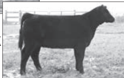
S S Erica 395 317 - Lot 53A