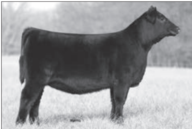
Harvey Miss Peggy 1768 - Lot 16