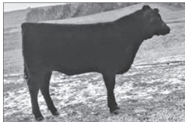
Tri-K Ruby 9720 - Lot 8

Here is an own daughter of the ever so popular Quaker Hill Ramage 0A36. An outstanding EPD profile on the heifer that ranks her in the top 2% for WW and top 10% for YW and $B. Not to mention she stems from the B/R Ruby cow family and note that in 44 Farms 2008 sale her maternal granddam, B/R Ruby 7130, sold to Murcielago Farms for $130,000 for 1/2 interest and her maternal great-granddam, B/R Ruby 9114, sold to Vintage Angus Ranch for $105,000 for 1/2 interest. A great Futurity offering.