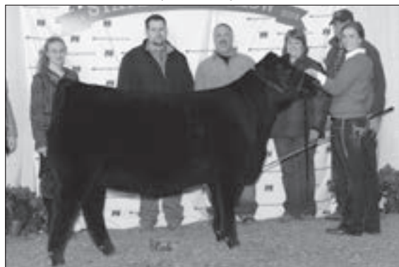
Cherry Knoll Elisha 1125 - Maternal sib of Lot 58.

The East has moved West with a chance to purchase embryos that are maternal siblings to the Grand Champion Owned Heifer of the 2015 PA Junior Farm Show and Junior Heifer Champion of the PA Open Farm Show. The dam, Elisha 1125 is a direct daughter of the featured Cherry Knoll foundation donor Elisha of Conanga 227. Maternal sisters to the donor dam of this lot include Cherry Knoll Elisha 1146, the Reserve Grand Champion Female 2012 NILE and Grand Champion Cow-Calf 2013 NAILE in addition to Cherry Knoll Elisha 1240, the Intermediate Champion Female 2013 NAILE. The proven pedigree of Elisha 1125 combined with the ever-popular Colburn Primo should result in a special mating.