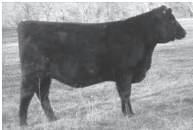
BAF Henrietta Pride B117 - Lot 36