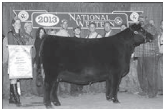
W B PVF Lucy 1052 - Full sister to the grandam of Lot 56.

Presented by Valley Oaks Angus, Oak Grove, MO. With the spirit of juniors in mind, we are excited to offer this heifer pregnancy. It is a mating combination of the hottest young show sire in the breed, Colburn Primo and a full sister to the National Western Stock Show Reserve Grand Champion Female owned by the Ward Brothers. The guesswork for making your next great show heifer has been done and is offered to you in this package. Confirmed heifer pregnancy due 9/9/2018.