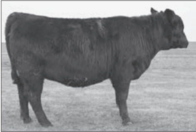
Lewis Ever Entense 700 - Lot 28