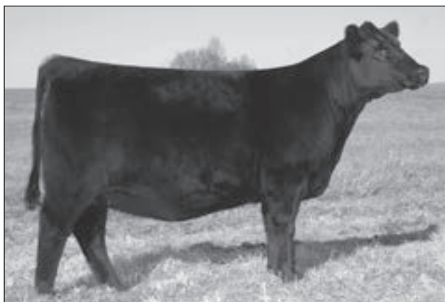
Birks Forever Lady 27 - Lot 39