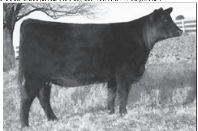
Birks Forever Lady 435 - Lot 52