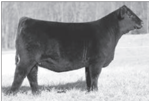
Hillard Frontier Gal 702 - Lot 38