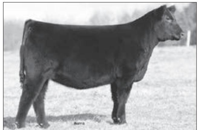
Hunters Erica 728 - Lot 19

This heifer offers a tremendous amount of raw performance. We think this "Insight" x "Raven" mating will make a great cow that can be mated many different ways.