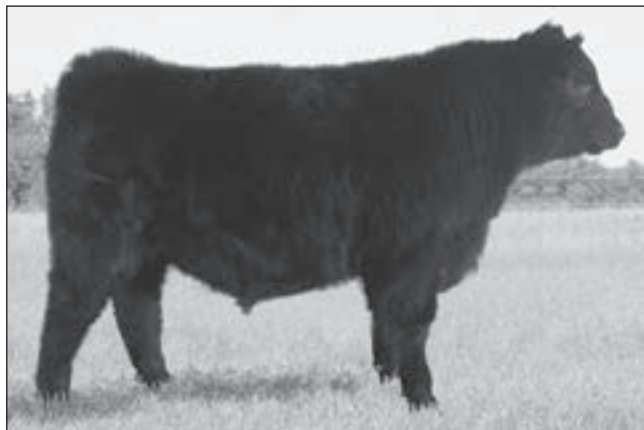
JKR Style 217 - Lot 67

Here is a bull that is bred to sire the next set of show heifers. Silveiras Style 9303, Dameron First Class and Leachman Saughatchee 3000C are all bulls that have left a major impact on the Angus show cattle world and this bull combines them all. The guesswork has been bred out of this young herd sire's pedigree.