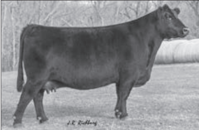
Champion Hill Georgina 6337 - Dam of Lot 66.

Presented by Tebbenkamp Show Cattle, Corder, MO. A really nice, eye appealing herdsire prospect with plenty of phenotype out of the popular "McKinley" bull of Express and Nowatzke. The "Machinist" dam of this bull is a "can't miss" and has had multiple offspring sell in the Futurity. A bull with plenty of body that is projected to sire great females.