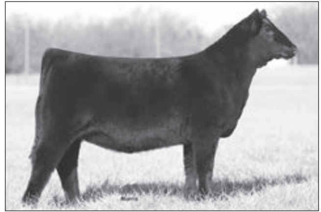
Meyer Erica 1737 - Lot 18