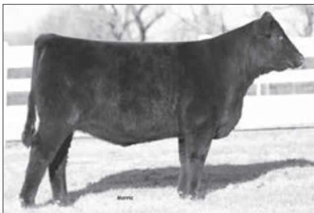
Clearwater Eriskay J 6375 - Lot 43

Here's a fancy daughter of Clearwater Farm's featured donor, Clearwater Eriskay J 1425. Sired by EXAR Classen, Eriskay J 6375 has all the right pieces to fit many environments. She's deep bodied, open-ribbed, sound and easy on the eye. Her dam has generated more than $200,000 in progeny sales and continues to be productive at 12 years of age. Longevity is built into this one! Show potential in the making! Bred to PVF Insight 0129 and due to calve 9/4/2018.