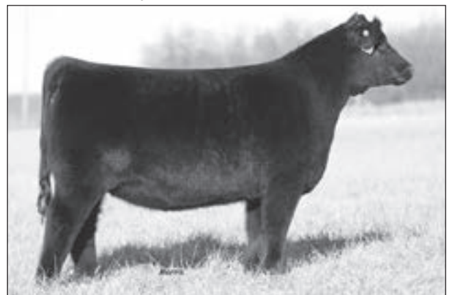
Harvey Lady Ericka 17120 - Lot 27

This Eathington Sub-Zero daughter was made for the showing! She's an incredibly extended March heifer calf that is ready to lead into the ring all summer long. Don't miss out on this "Erica" daughter.