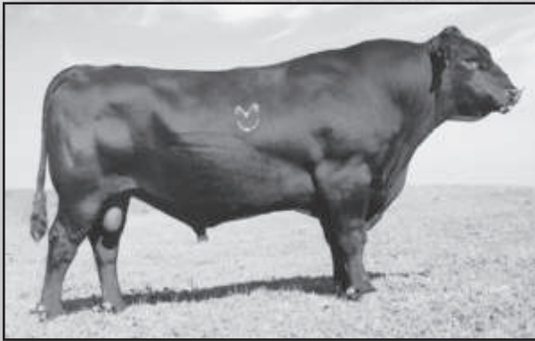
B/R New Design 036 - Maternal and paternal grandsire to Lot 51.