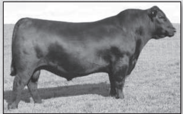
SAV Bismarck 5682 - Service sire to Lots 3 and 4.