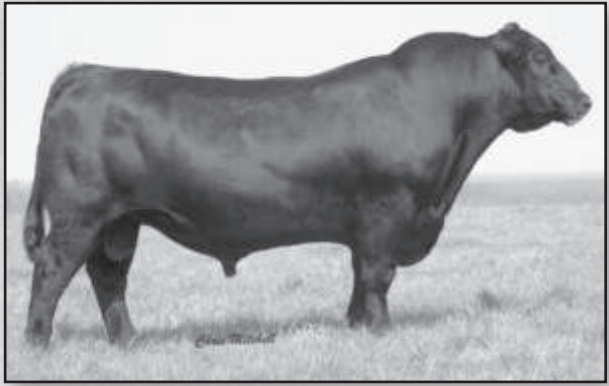
Lemmon Newline C804 - Sire of Lot 36.