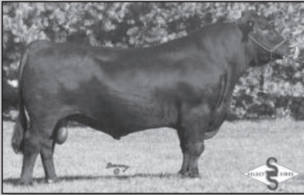
CRA Bextor 872 5205 608 - Service sire to Lot 24.

224 Lollar Circle Mantachie, MS 38855 662-282-7683 2 Bred Heifers • 2 Bred Cows • 1 Open Cow