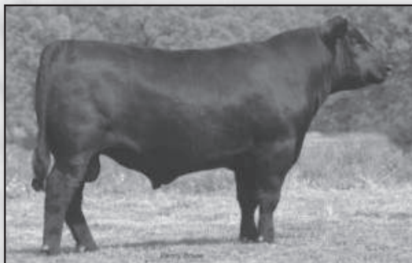
ACF New Design 2062 - Sire of Lot 49.

328 Robert-Earl Way Savannah, TN 38372 731-925-7307 1 Bull