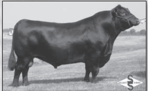
GAR Predestined - Sire of Lots 21 and 22.