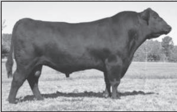
Twin Valley Precision E161 - Paternal grandam of Lots 11-14.