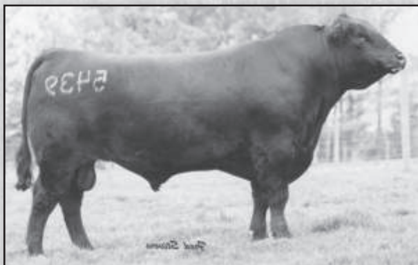
Ideal 5439 of 1418 2455 - Sire of Lot 46.