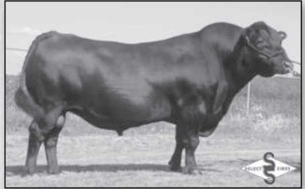
GAR Retail Product - Sire of Lot 52.

Box 9515 Mississippi State, MS 39762 662-325-3378 1 Bull