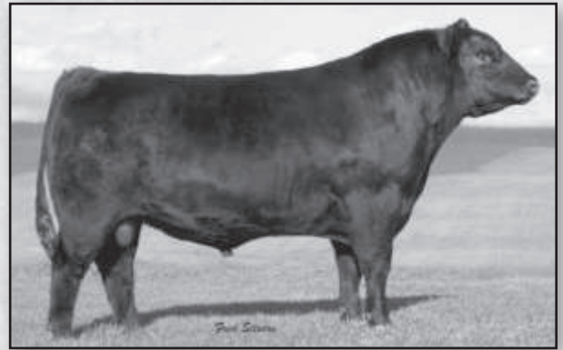
B/R New Frontier 095 - Service sire to Lot 43.

215 Bell Branch Rd. Huron, TN 38345 731-968-2737 3 Bred Cows • 1 Open Heifer