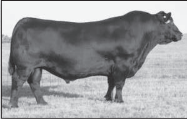
SAV 8180 Traveler 004 - Sire of Lot 54.

51 CR 7370 Booneville, MS 38829 662-728-4987 2 Bulls