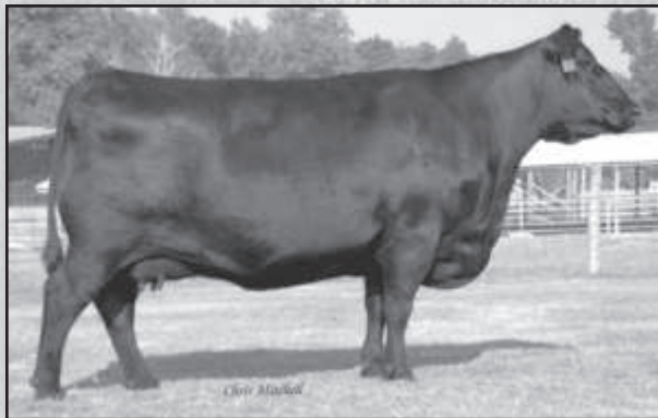
BT Everelda Entense 76D - Maternal grandam of Lot 1.

9670 Old Jackson Rd. Somerville, TN 38068 901-299-6571 1 Bred Cow • 2 Pairs • 1 Bred Heifer