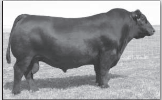
SAV Net Worth 4200 - Sire of Lots 9 and 10.

989 S. Main St. Ripley, MS 38663 662-837-8871 6 Open Heifers