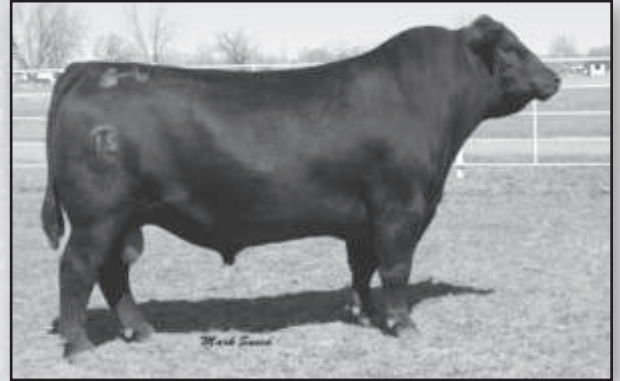
HARB Pendleton 765 JH - Service sire to Lots 15 and 17.