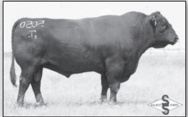
GAR New Design 5050 - Service sire to Lots 19 and 20.