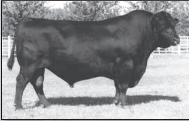
Basin Max 602C - Maternal grandsire of Lot 35.