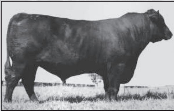
VDAR Lucys Boy - Maternal grandsire of Lot 8.