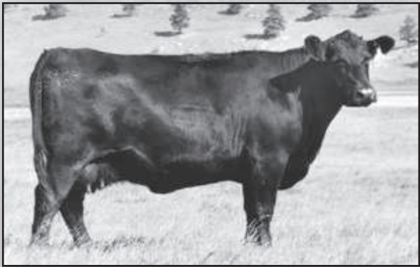
N Bar Primrose 2424 - Maternal great-grandam of Lot 29.

Oak Manor Plantation/Sherrill Angus • Lots 29-31 845 Hwy. 368 Grand Junction, TN 38039 731-764-2454 1 Pair • 2 Bred Cows