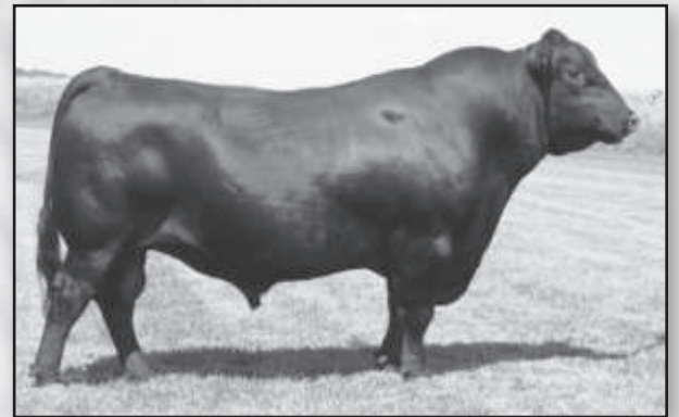
Bon View New Design 878 - Sire of Lot 27.

• A young heifer that we showed this past year. She is out of the Lot 25 cow. Breeding information available sale day.