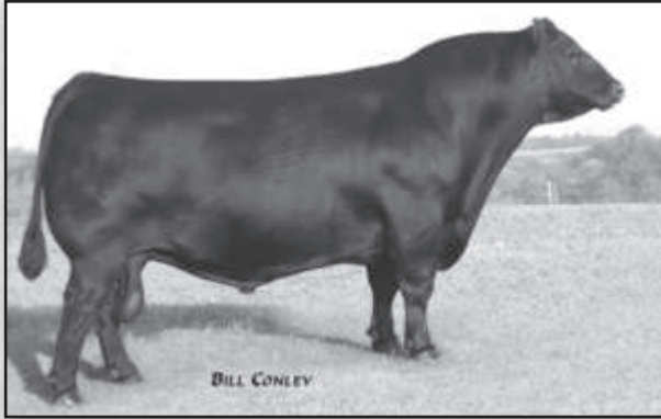
BC Matrix 4132 - Service sire to Lots 32 and 33.

Riverside Angus • Lots 32-34 137 Gurley Rd. Potts Camp, MS 38659 662-333-7831 2 Bred Heifers • 1 Bred Cow