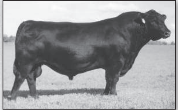
Boyd New Day 8005 - Sire of Lot 56.

534 Glenie Smith Rd. Parsons, TN 38363 731-847-3378 2 Bulls