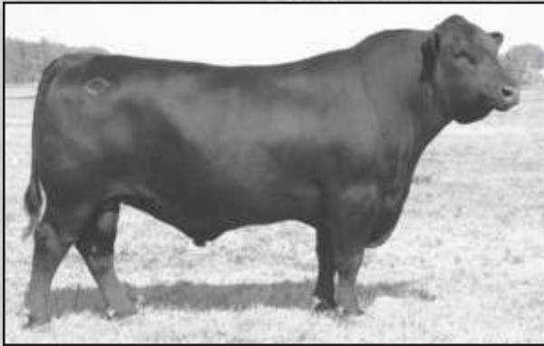
Mytty In Focus - Service sire to Lots 39 and 40.

51 CR 7370 Booneville, MS 38829 662-728-4987 2 Bred Heifers • 2 Pairs