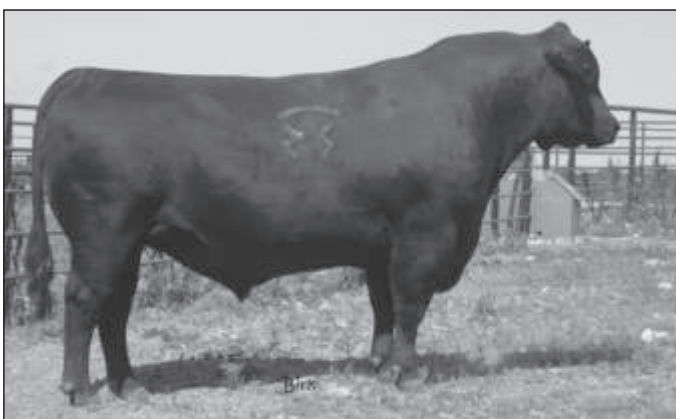
Basin Expedition N189 — Sire of Lots 56-59.

Dam's Production Record: BR 3-98, WR 3-115, YR 2-103, IMF 2-112, REA 2-108