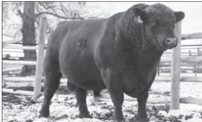
5L Norseman King 2291 – Sire of Lots 71-74.