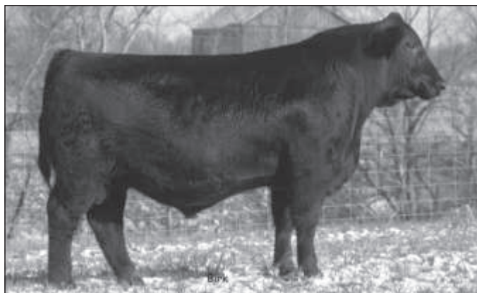
Boyd Pay Day 7011 – Sire of Lots 51-54.

Dam's Production Record: BR 3-103, WR 3-103, YR 3-109, IMF 10-92, REA 10-99 His full brother serves as a Mead herd sire!