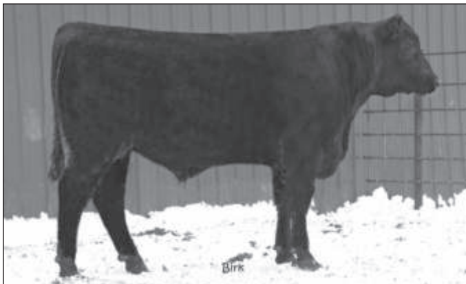
Mead Traveler I215 – Lot 23