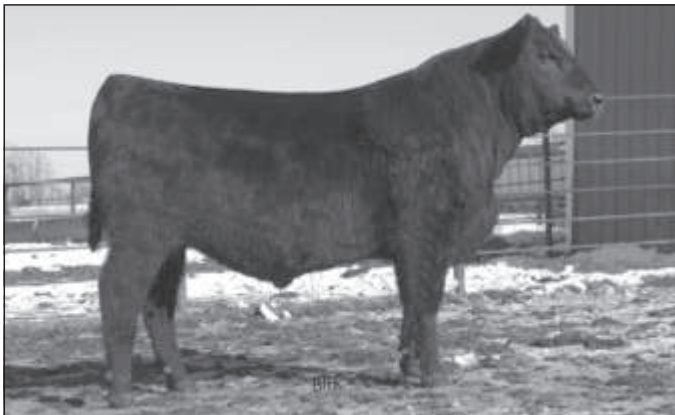
Mead Rito 1096 – Lot 1