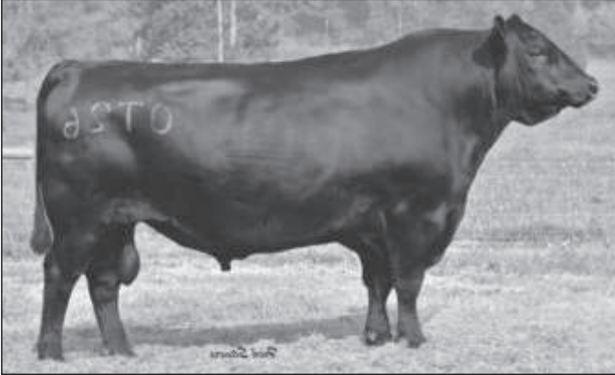
SS Objective T510 oT26 – Sire of Lots 7-12.