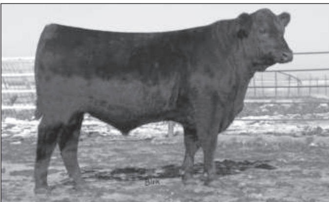
Mead Objective I003 – Lot 7