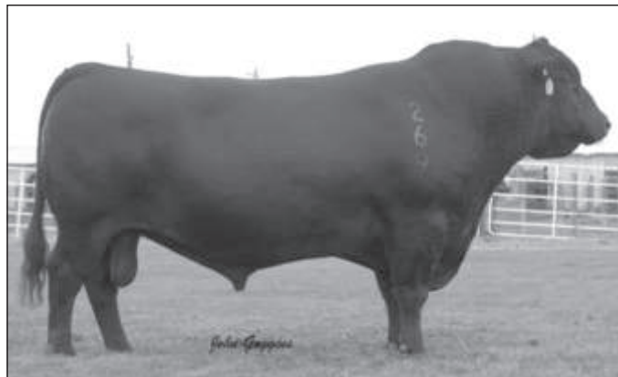
Gardens Expedition – Sire of Lots 30-37.