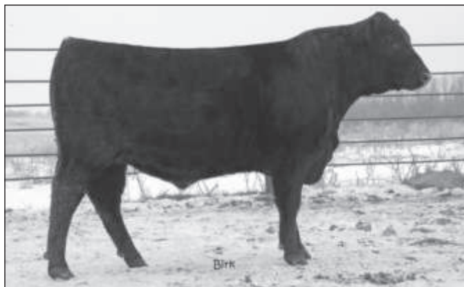
Mead Traveler I024 – Lot 26