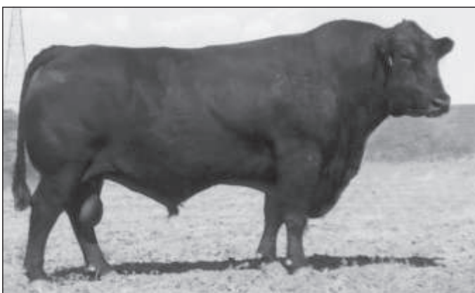
Sitz Alliance 6595 – Sire of Lots 42-46.

Dam's Production Record: BR 2-104, WR 2-104, YR 2-103, IMF 2-129, REA 2-98