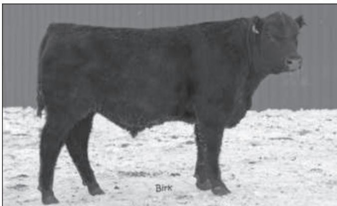
Mead Rito I395 – Lot 24