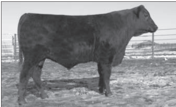
Mead Foresight I170 – Lot 28