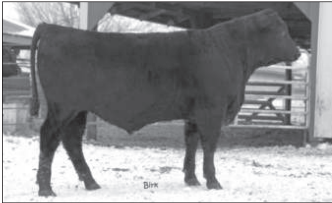
Mead Expediiton I203 – Lot 33