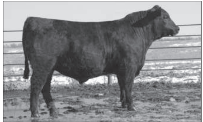
Mead Rito 1178 – Lot 3