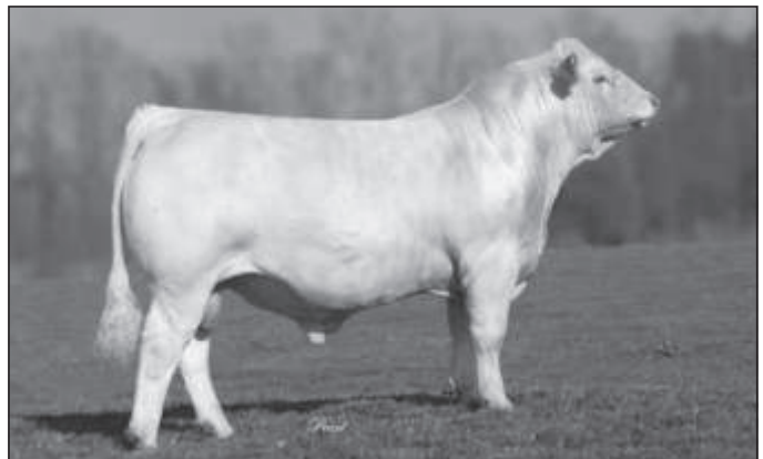
Mead RF X Factor – This many-time champion was selected through the 2008 Mead Angus Farm Performance-Tested Bull Sale.