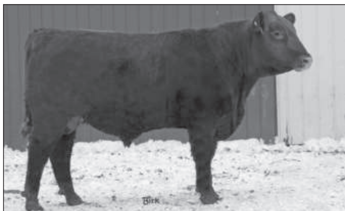
Mead Norsman King 1030 – Lot 71