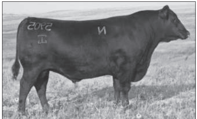
GAR Predestined N5905 – Sire of Lots 38-41.