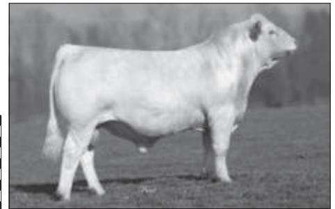
MEAD RF X FACTOR 11 Powerful Charolais Bulls Sell!