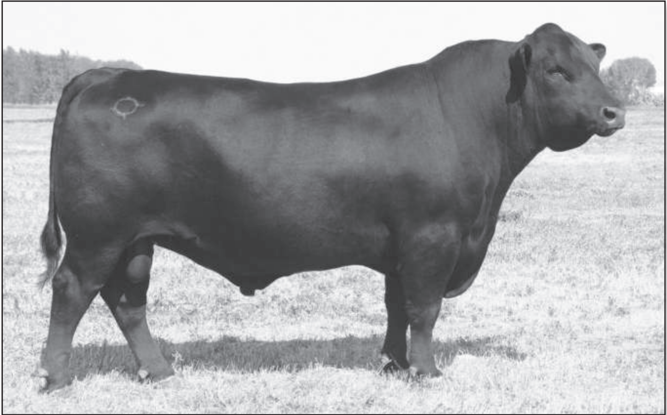
Mytty In Focus - Sire of Lots 12, 13, 17, 27, 34, 37, 40, 44, 45, 58, 68, 74 and 81.