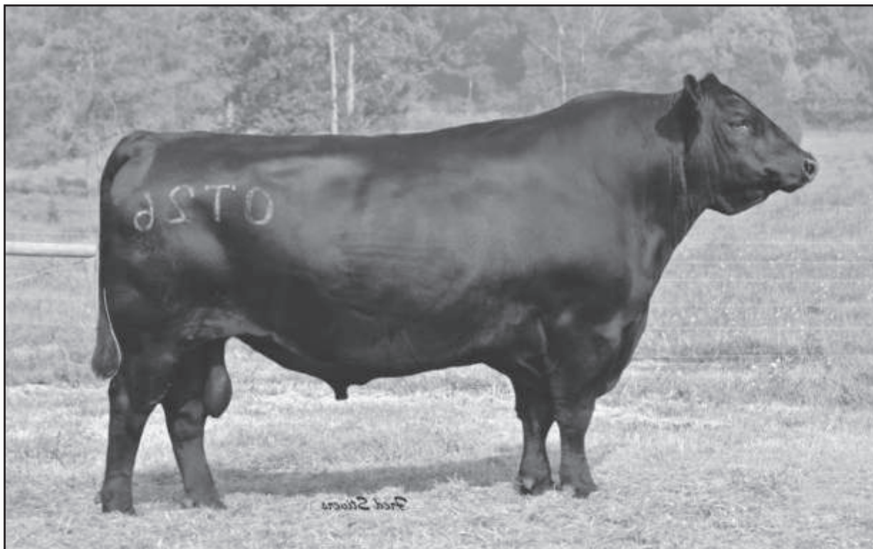
SS Objective T510 OT26 - Sire of Lots 5-10, 50, 62, 67 and 75.