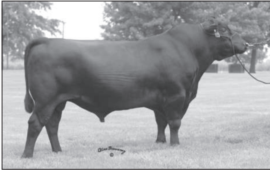
ALC Big Eye D09N - Sire of Lots 59 and 78.