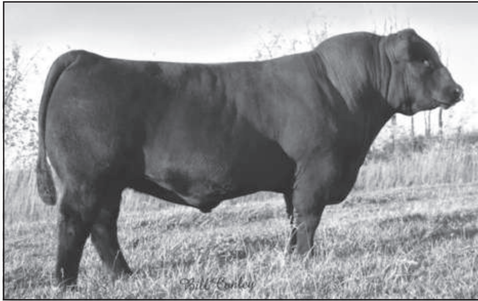
BC Marathon 7022 - Sire of Lots 38, 64 and 69.