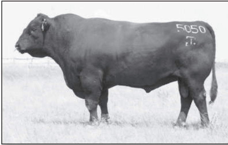
GAR New Design 5050 - Sire of Lots 56, 57, 66, 72, 76 and 85.