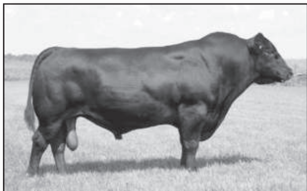
Woodhill Foresight - Sire of Lot 80.