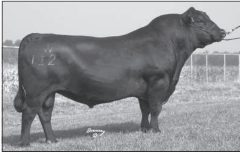
Rito 112 of 2536 Rito 616 - Sire of Lots 14, 18, 19, 21 and 25.