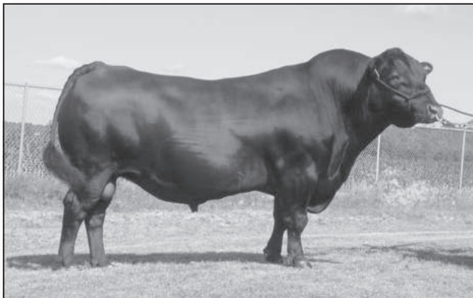
GAR Retail Product - Sire of Lots 31, 33, 43, 55 and 63.