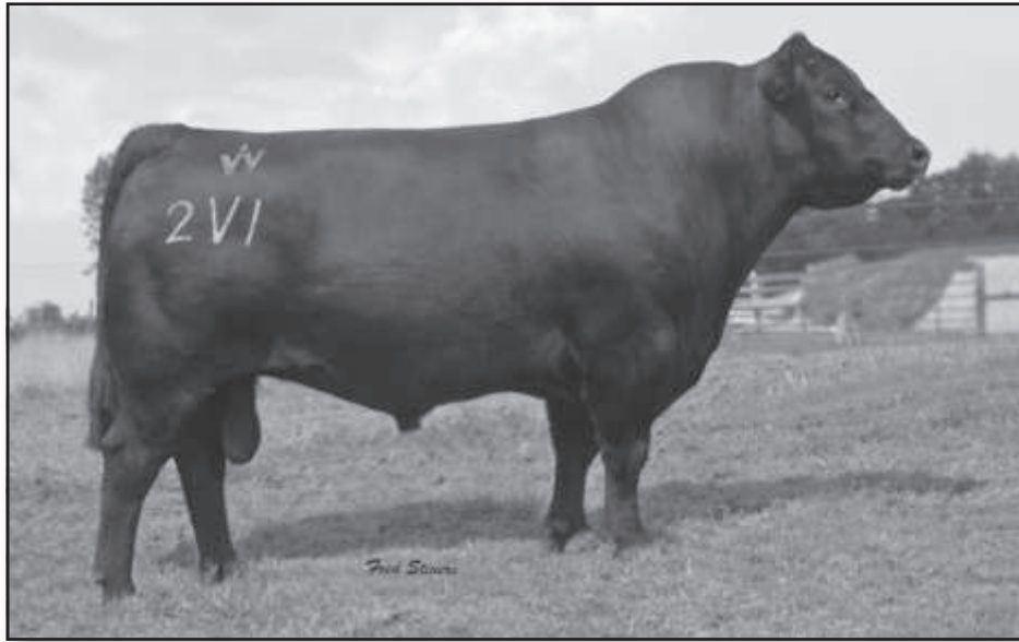
Rito 2V1 of 2536 1407 - Sire of Lots 32 and 36.