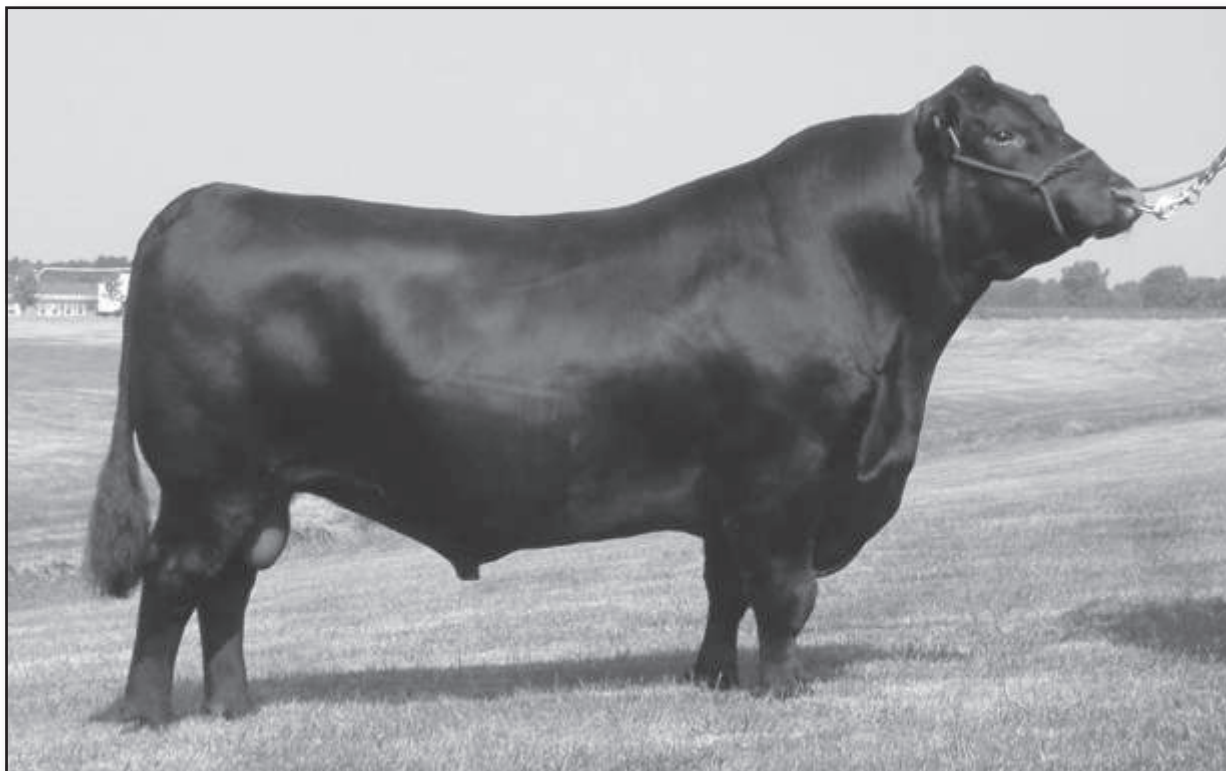
GAR Predestined - Sire of Lots 1, 11, 15, 20, 22, 26, 28-30, 70, 73 and 77.