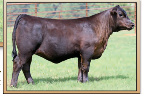
Lazy F Lucy 1820 - Lot 5C