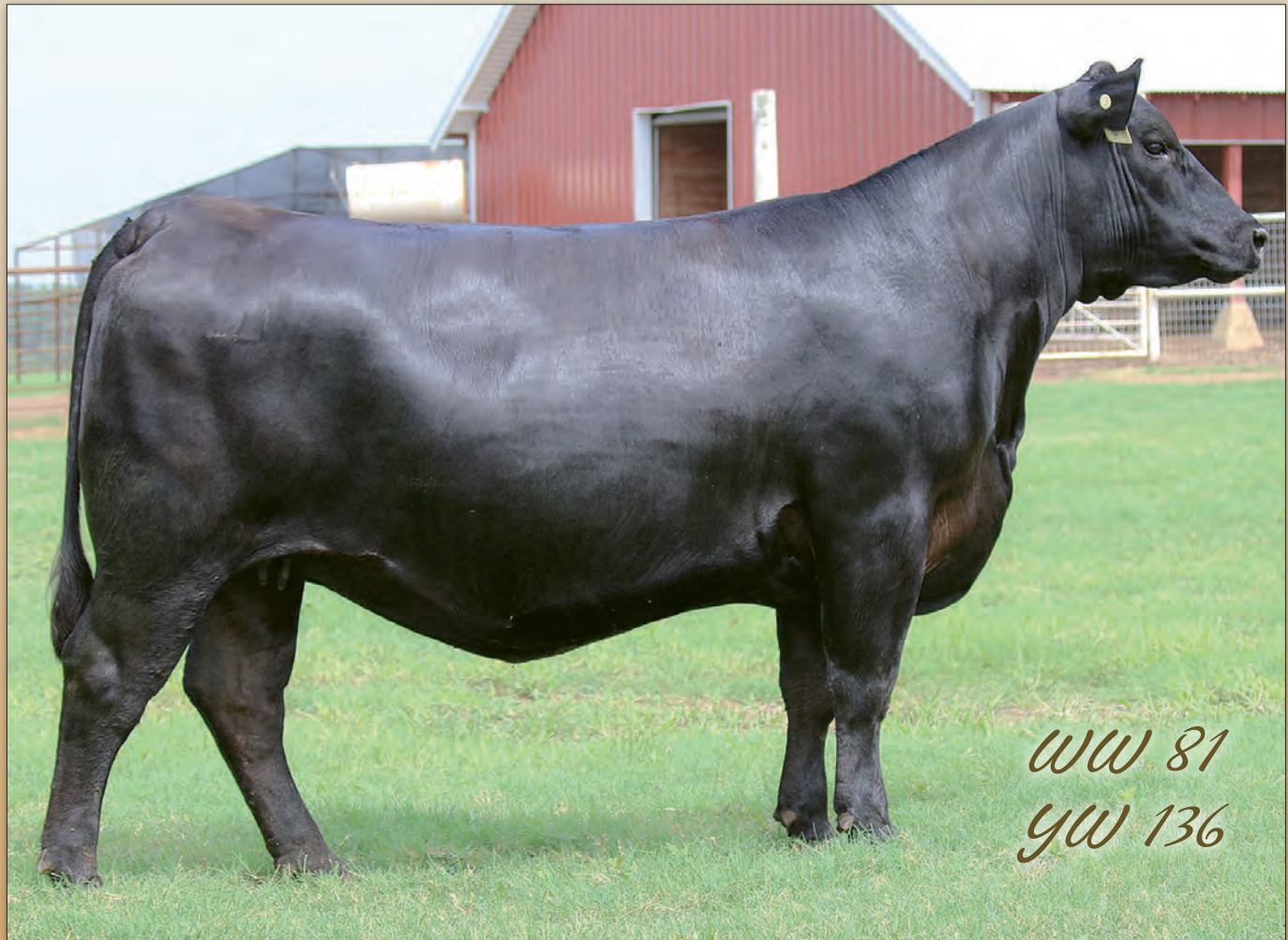
Vintage Henrietta Pride 6101 - Lot 3A