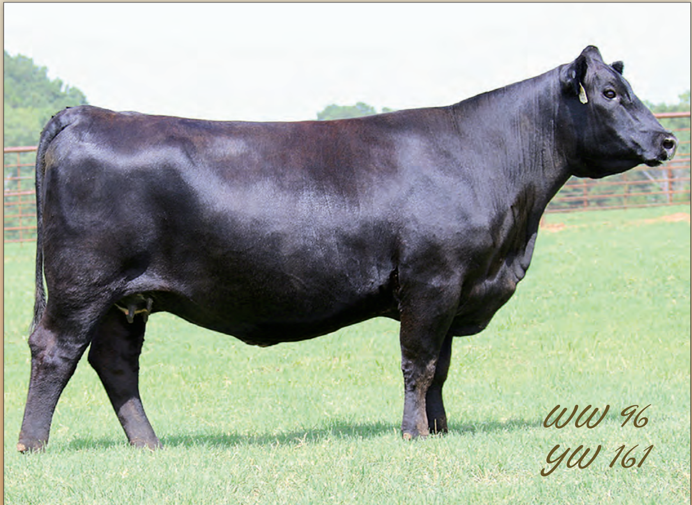
CoX 1031 Ideal 5557 - Lot 2