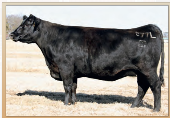
G A R Objective 277L - Dam of Lot 75.