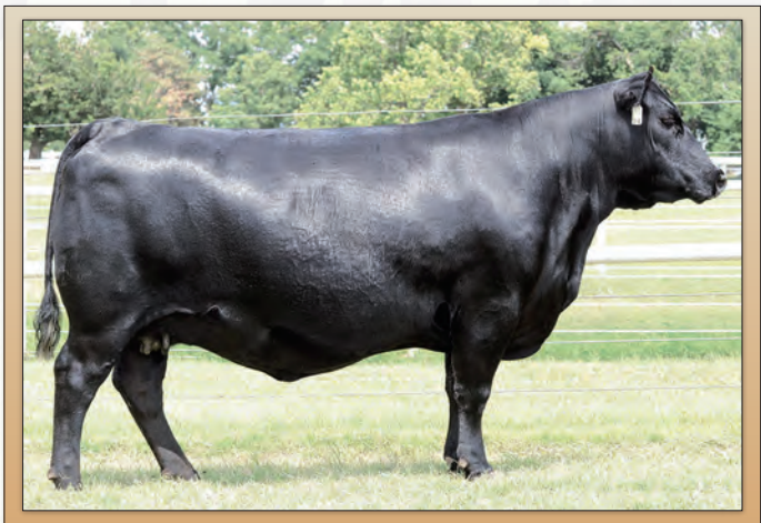
EXAR Rita 8153 - Donor dam of Lot 8.