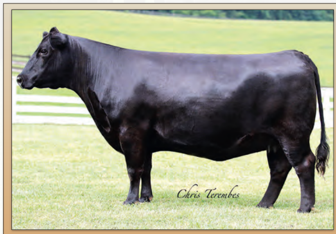
Quaker Hill Blackcap 0A32 - Dam of Lot 33.