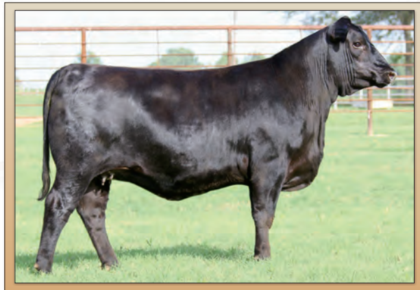
Lazy F Azalea 1718 - Lot 28