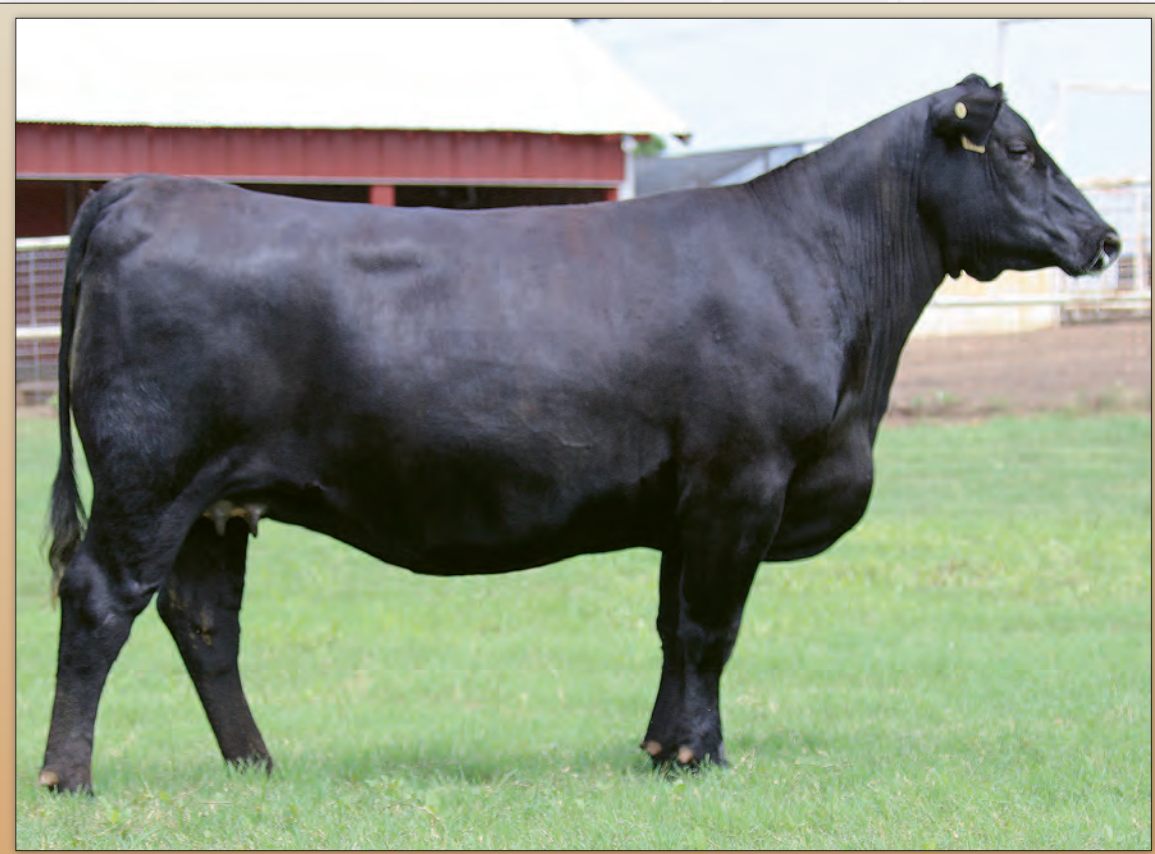
Lazy F Fanny 1635 - Lot 53