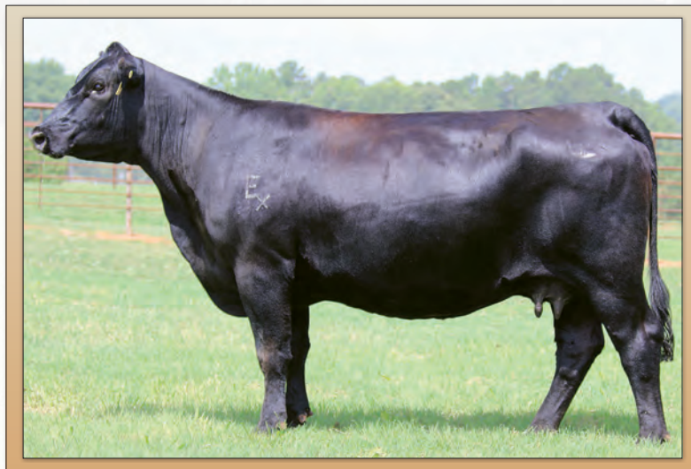
EXAR Empress 4602 - Lot 35