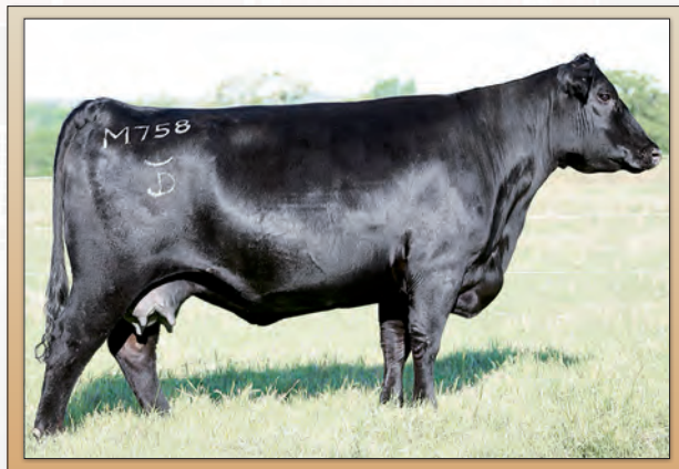
D A R Erica M758 - Dam of Lot 59.