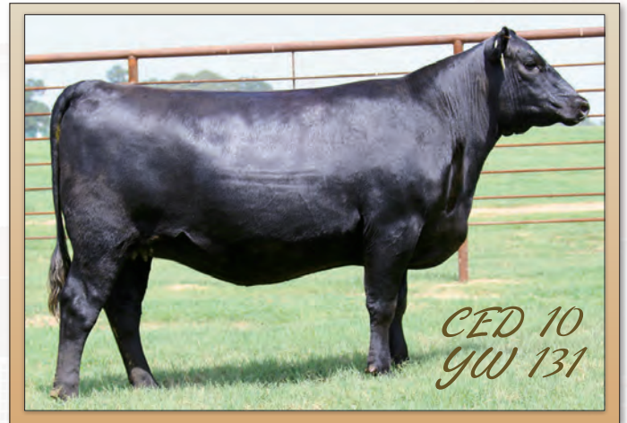
Lazy F Barbara 1609 - Lot 56