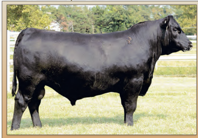
EXAR Stud 4658B - Sire of Lot 19.