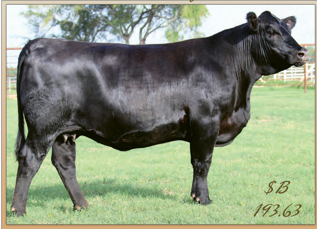
TMR Lucy 1D57 - Lot 47