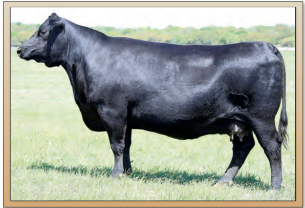
EF Rita 9525 - Dam of Lot 34.