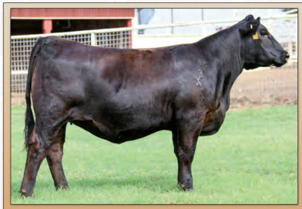
EXAR Princess 7813 - Lot 29