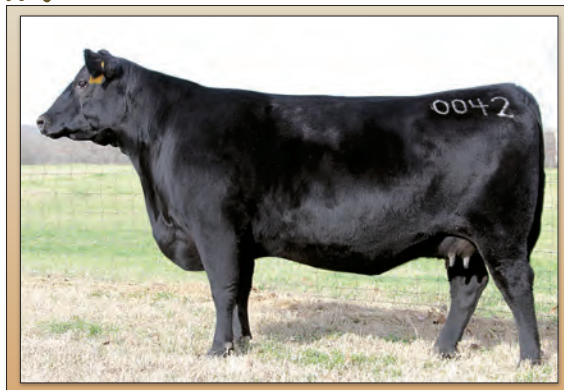
SJH Objective of 6108 0042 - Dam of Lots 73 and 74.