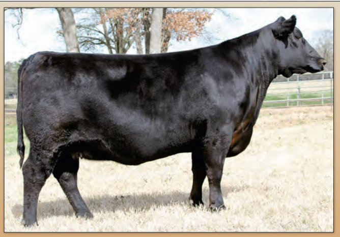
G A R Daybreak M721 - Dam of Lot 4.