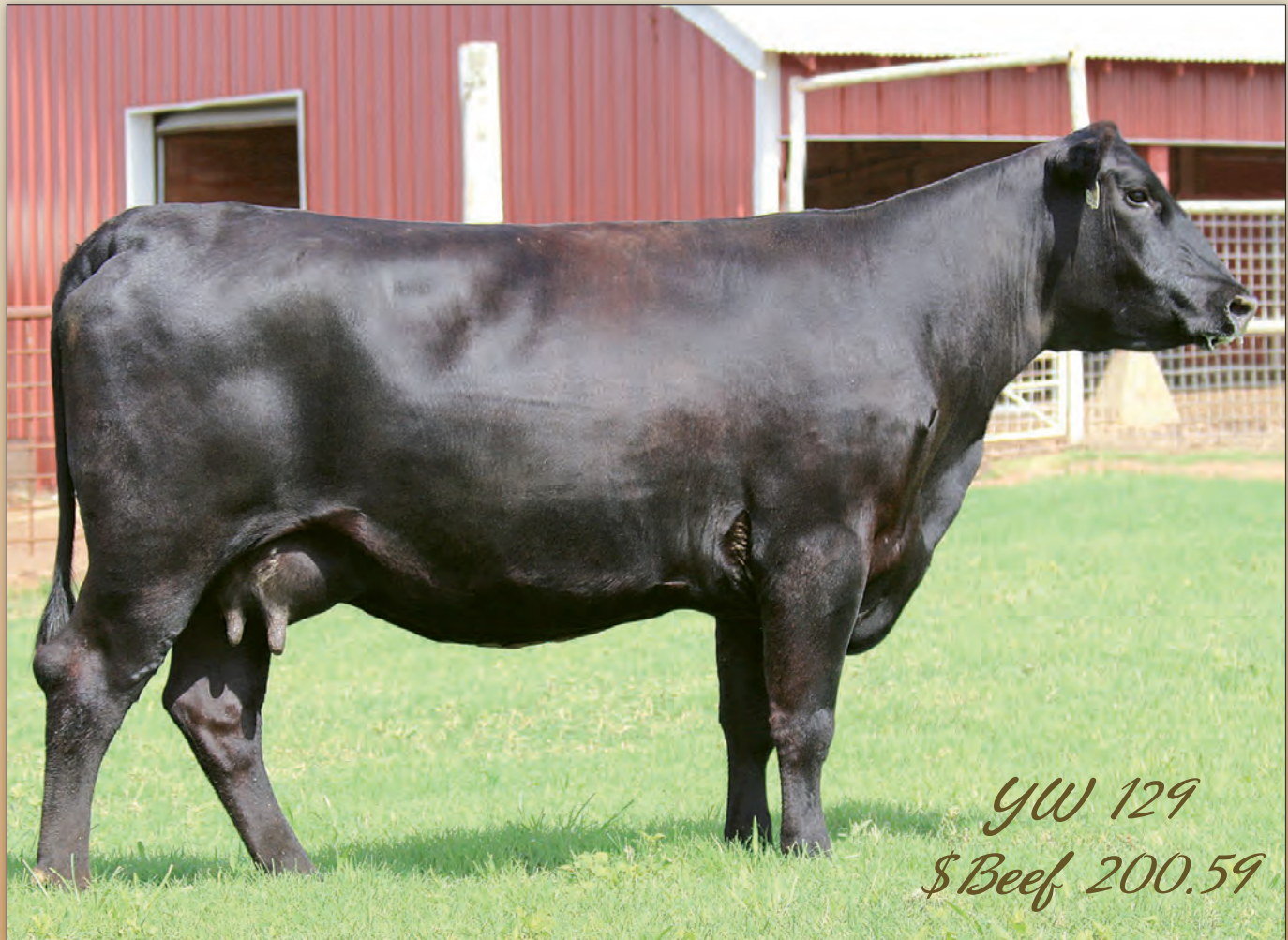
MGR JP Rita 5023 - Lot 6