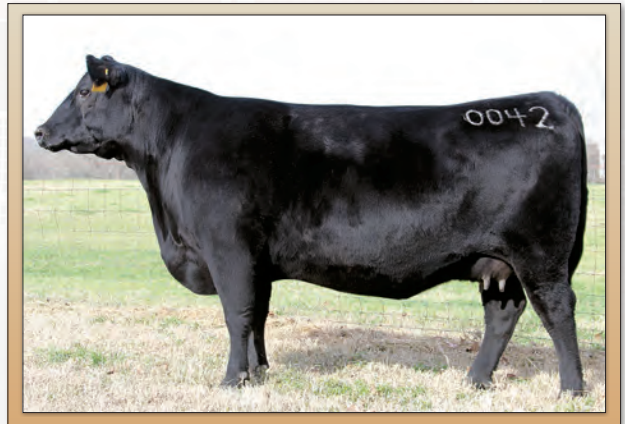
SJH Objective of 6108 0042 - Dam of Lot 67.