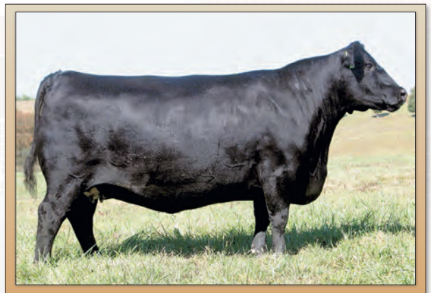
Maplecrest Eva 7010 - Dam of Lot 41.

• Maternal sister to G A R Storm who stands at ST Genetics. A maternal sister, Maplecrest Eva 5185, sold for $84,500 to Bar W out of the 2017 High Roller Event. A full sister, Maplecrest Eva 3188, sold to Lisonbee Angus for $14,000 in the 2014 Maplecrest Sale. Five other maternal sisters selling through the Maplecrest sales have averaged $10,400. This female is, without a doubt, one of the most impressive cows to sell for the maternal look of body and rib with a great udder. She has that classic Confidence look backed by the highly valuable Maplecrest Eva cow family.