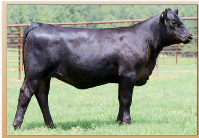
Lazy F Rita 1741 - Lot 17

• This big marbling, docile Stud daughter will be easy to find. She ranks in the top 25% of the breed for 16 traits and indexes. The grandam of this female has stacked up 28 progeny with genomic work.