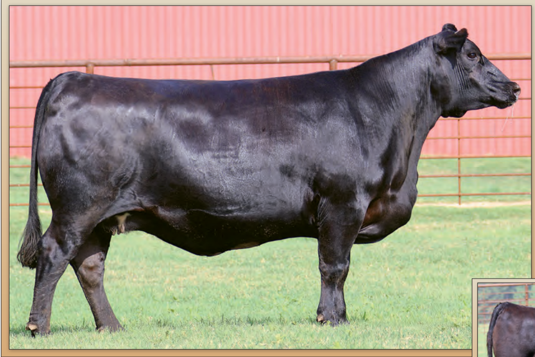
VC 561X of 66U1 4704 - Lot 5