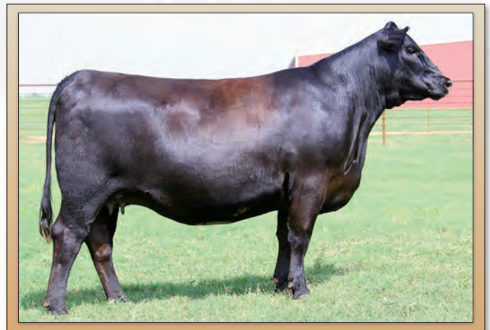
Lazy F Bonnie 1622 - Lot 49