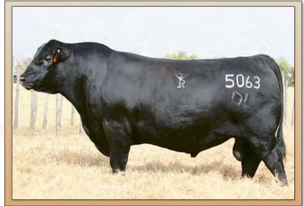
BAR R Jet Black 5063 - Service sire to Lot 63.