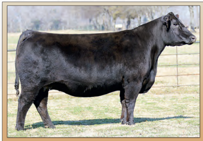
DSA Ten X 1022 1433 - Dam of Lot 13.