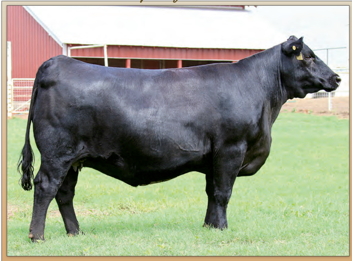
3F Kem 5904 - Lot 45