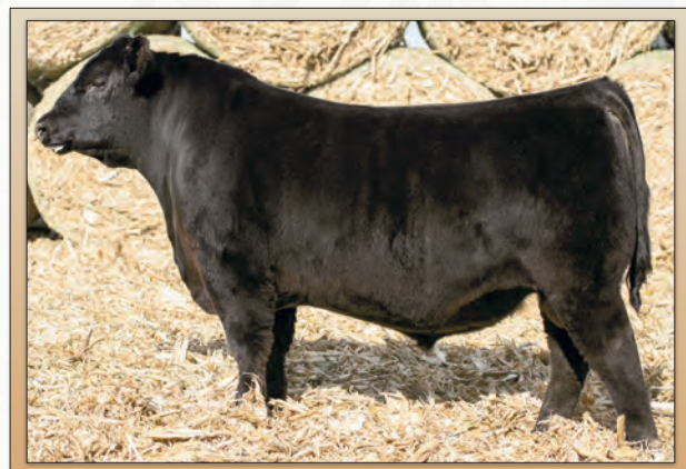
Jindra Acclaim - Service sire to many lots in this sale.