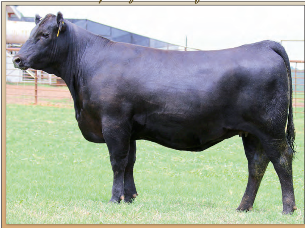
Lazy F Ruby 777 - Lot 32