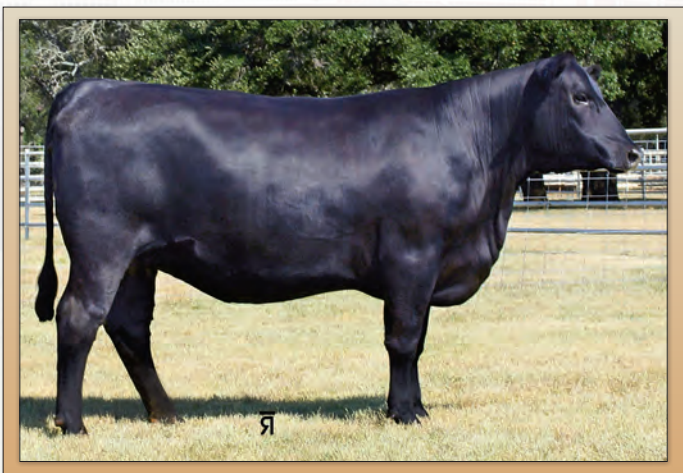
MGR Rita 2145 - The dam of Lot 6.