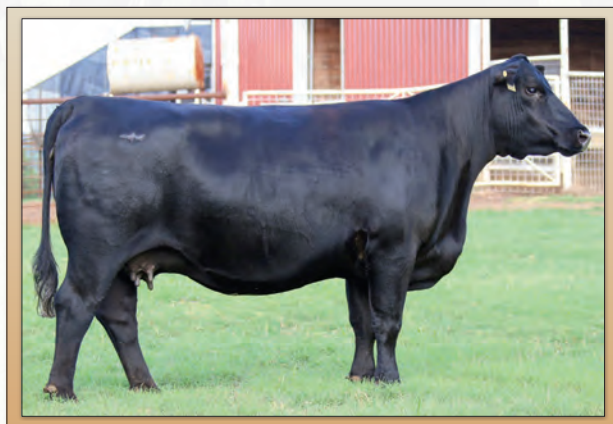
44 Princess 4555 - Lot 60