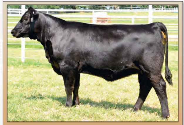
EXAR Blackcap 1619 - Dam of Lot 64.