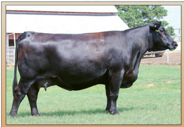
44 Erica P279 - Lot 37