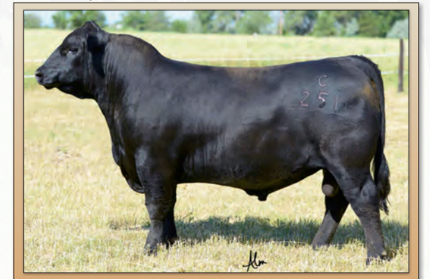
Baldrige Colonel C251 - Service sire of Lots 67 and 72.