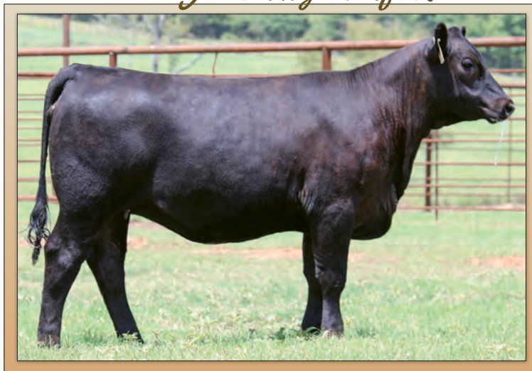
Lazy F Ruby of Tiffany 1723 - Lot 20