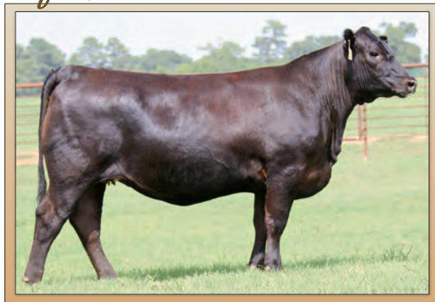
Powell Lady 6388 - Lot 26