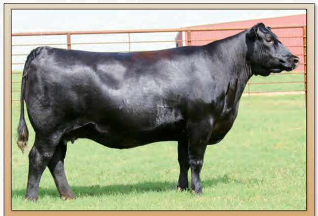
FF Rita 5V61 of 2183 2240 - Lot 42

• This female is so impactful across the board from her moderate birth and good growth to her awesome SC, DOC and MB. This female's grandam is the famous 2 Bar Objective 863 who was one of the top Objective daughters in the breed. She is the mother of the noted 2 Bar Mile High 9360, who has a rap sheet a mile long on progeny sales for many across the country.