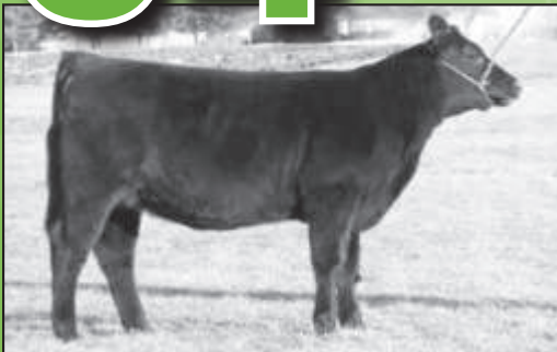
Shelby 901 - She sells as Lot 16.