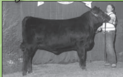
DCF Miss Sparkle Evergreen - She sells as Lot 21.