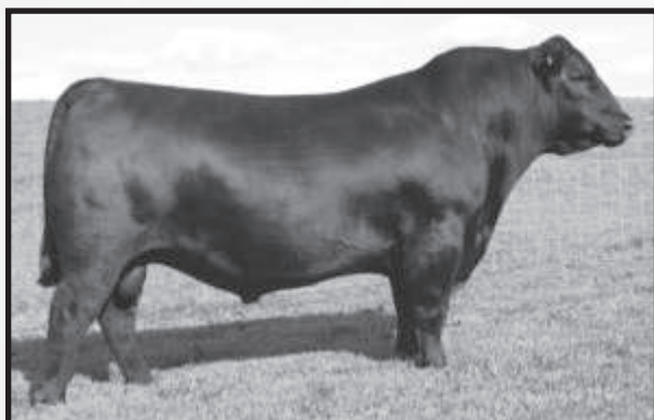
SAV Bismarck 5682 - Service sire of Lot 21.

A great young female from the Car Don Miss Evergreen family, she offers the carcass merit of line-breeding to the New Design line. She was named 2009 Macon County Reserve Champion Angus Female and 2009 Illinois Junior Angus Show Reserve Bred/Owned Intermediate Champion. Her dam was the 2006 Champaign-Fisher Champion Angus Female and the 2007 Illinois Junior Angus Field Day Reserve Champion Senior Heifer, while her sire was the Division 1 Champion of the 2007 Illinois Angus Futurity. This young heifer has a great background and the genetics to be a great brood cow to establish a new line in your program. Bred to calve 9/07/10 to SAV BISMARCK 5682.