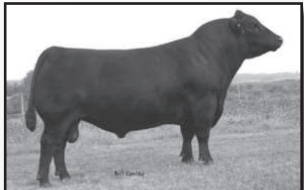
BC Lookout 7024 - Service sire of Lot 28.