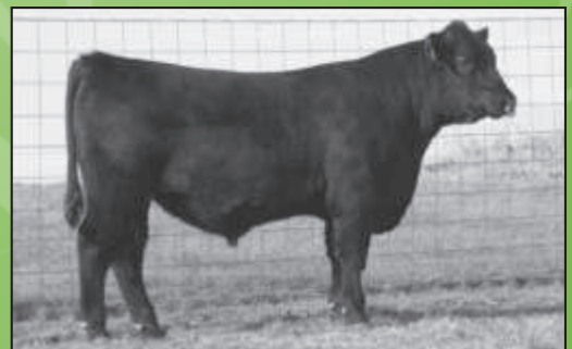
C J Reflection 215W - He sells as Lot 35.