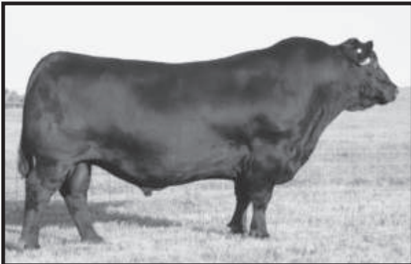
S A V 8180 Traveler 004 - Sire of Lot 38.

His dam is from the Blackcap family line adding the carcass performance of GT Max.