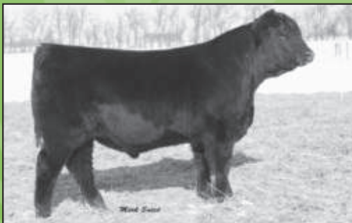
Lemanager HF Free Will 922 - He sells as Lot 33.