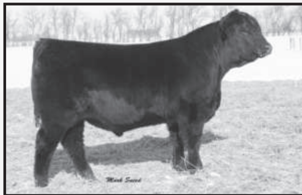
Lemanager HF Free Will 922 - He sells as Lot 33.

This eye appealing February young bull is by the highly regarded sire, TC Freedom 104 and from the famous Forever Lady family line. His dam is a son of the popular Prairie View breed New Horizon 001 and topped out through Dateline.