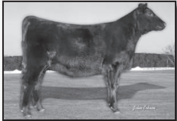
Eathington Queen 97V - She sells as Lot 11.

A granddaughter of 6T6 from a dam by Rito 2 878, one of the great sons of 878 in service today. This young female offers calving-ease genetics, positive Carcass data and $Values combined with a great pedigree.