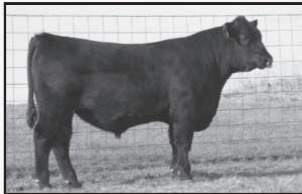
C J Reflection 215W - He sells as Lot 35.

Another young son of Rito 4L60, this one produced by a son of the noted New Design 878 and from the Blackcap family line. He offers low birth combined with moderate growth and a Milk EPD in the top 10% of non-parent bulls.