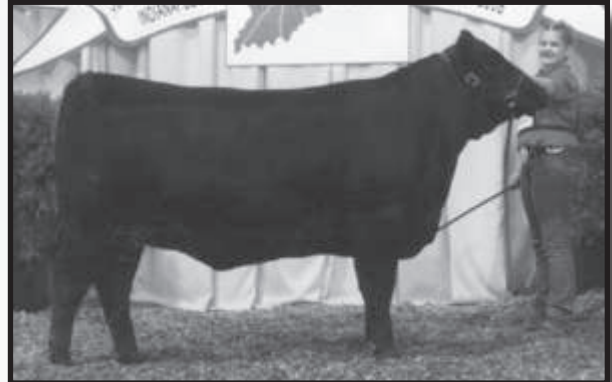
Erica of Shilo 2095 - She sells as Lot 28.

Bred to calve the end of March, 2010 to ERA BON DESIGN 0605.