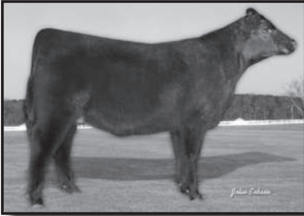
Eathington PVF Elba 95V - She sells as Lot 8.