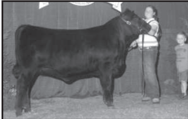
DCF Miss Sparkle Evergreen - She sells as Lot 21.