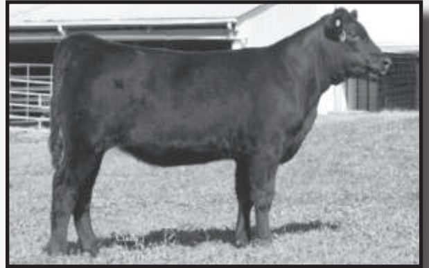
C J Wendy 510W - She sells as Lot 5.

Daughters of this Genex/CRI sire will be valuable additions to any program. She has the genetic strength to be a great brood cow after her show career for any young exhibitor.