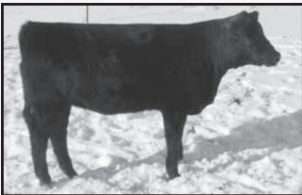
D F Blackbird 034 - She sells as Lot 9.

This high weaning heifer is a granddaughter of the noted carcass sire High Prime; note she ranks in the top 10% for WW EPD and has a $W value in the top 7% of non-parent females. Her dam, by Bushs Grand Design, offers a sound and solid pedigree for performance and predictability.