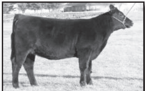
Shelby 901 - She sells as Lot 16.

A daughter of 758N, a high performance, high growth and high carcass sire from a great family line. Her dam adds the carcass performance of Stockman. Her figures are positive, her eye-appeal is there, and she will add volume and power to your program.