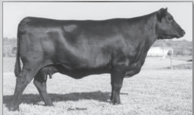
HARMONY HILL PEG 443 – Grandam of Lot 79.

Grandam Records: BR 7@98, WR 8@101, UREA 3@103. BEPD WEPD YEPD MILK S +4.1 .97 +53 .96 +101 .94 +29 .81 D +3.0 .40 +46 .29 +77 .25 +14 .29 MARB REA $B S +1.04 +.63 +72.01 D I+.0 I+.08 +26.43