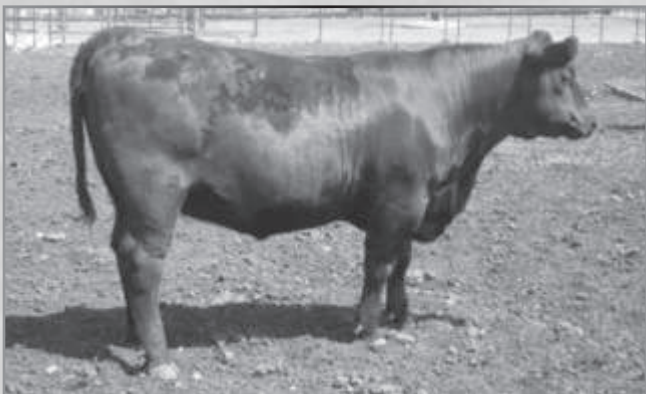
BR BLACKCAP 188 – She sells as Lot 44.

Bred to calve February 1, 2010, to OCC EMBLAZON 854E. BEPD WEPD YEPD MILK I+4.1 .05 I+50 .05