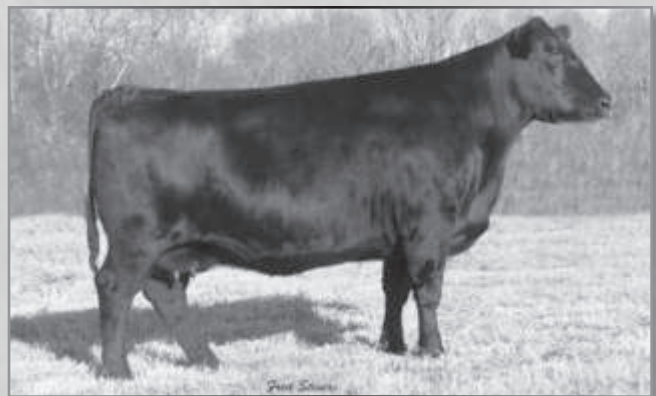
GDAR FOREVER LADY 27B - Great-grandam of Lot 52.