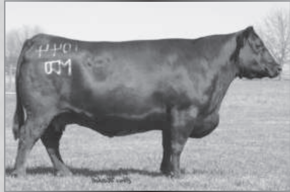
GAR EXT 1044 - Great-grandam of Lot 1.