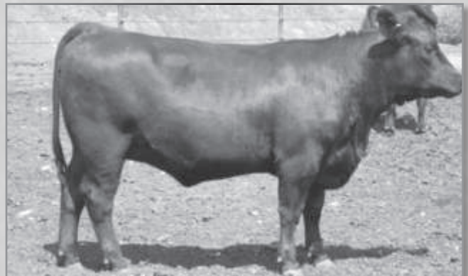
BR POLLY 138 – She sells as Lot 58.