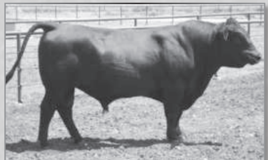
SVA IMAGING 7610 – He sells as Lot 33.