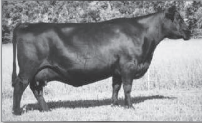
SAV ABIGAIL 8213 – Third dam of Lot 43.