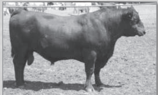
SVA NET WORTH 7119 – He sells as Lot 25.

Individual Records: BR 68, BEPD WEPD YEPD MILK U%IMF 106. +3.2 .05 +44 .05 +84 .05 +24 .05 Dam Records: BR 2@79, MARB REA $B U%IMF 4@105. +.28 +.13 +35.78