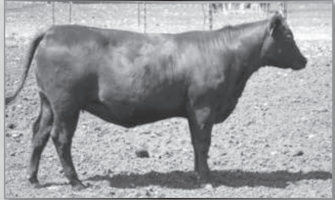
BR BLACKCAP 58 – She sells as Lot 49.