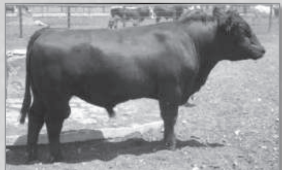
SVA MC 2500 7628 - He sells as Lot 40.