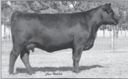
ISLA 261 OF WOODLAWN – Dam of Lot 18.