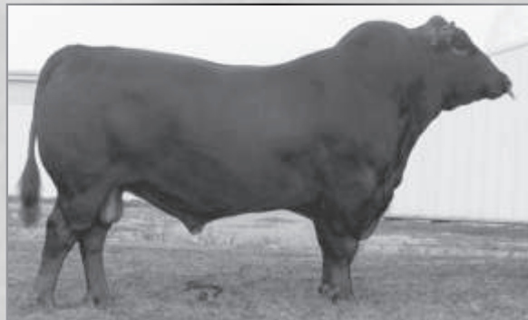
GAR GRID MAKER – Sire of Reference Sire C.