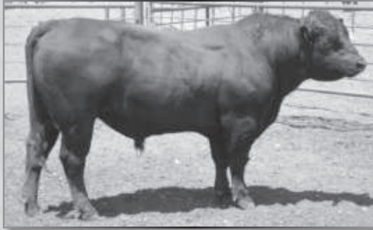
SVA BANDO 7568 – He sells as Lot 27.