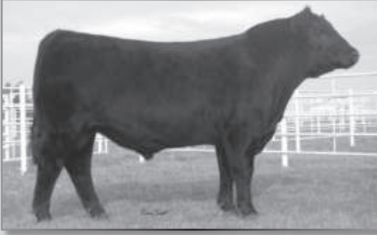
SCHURRTOP MC 2500 – His sons sell.