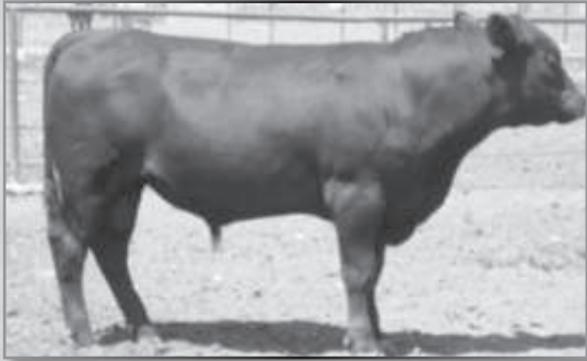
KINGTON LEAD ON 12A – He sells as Lot 14.