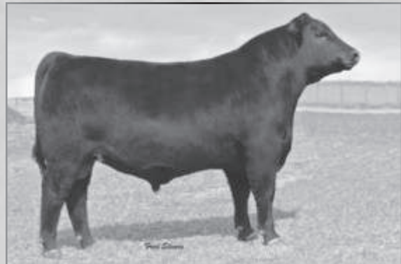
TC TOTAL 410 - His sons sell.