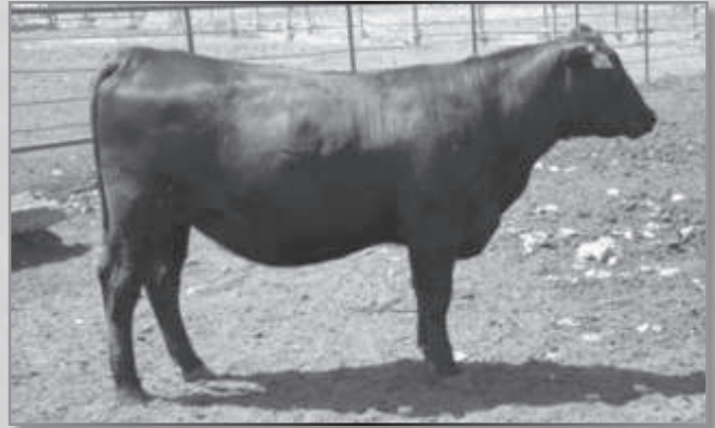
KINGTON TOTAL 25A - She sells as Lot 84B.

U%IMF 2@126, UREA 2@106 with one daughter in production with an average nursing ratio of 102. Bred to calve April 19, 2010 to WOODHILL FORESIGHT H141.