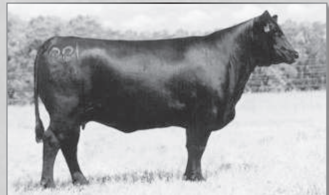
GAR SCOTCH CAP 199 – Great-grandam of Lot 91.

Dam Records: WR 2@117, YR 1@115, U%IMF 14@107.