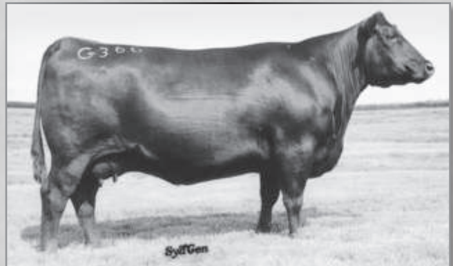
TEHAMA BLACKCAP G360 – Grandam of Lot 60.