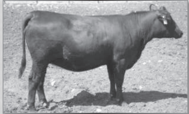
BR BEAUTTY 128 – She sells as Lot 59.