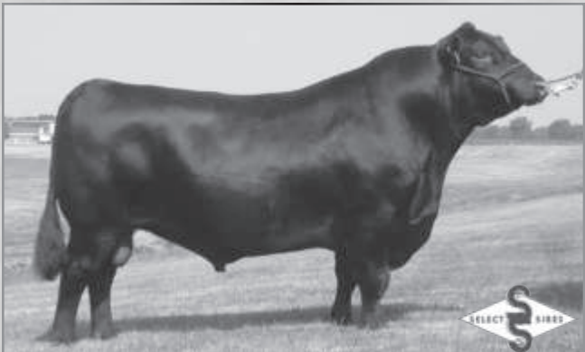
GAR PREDESTINED - His influence sells.