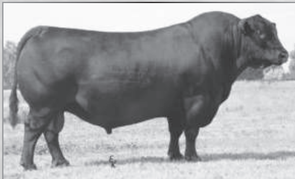
SAV FINAL ANSWER 0035 – Reference Sire A