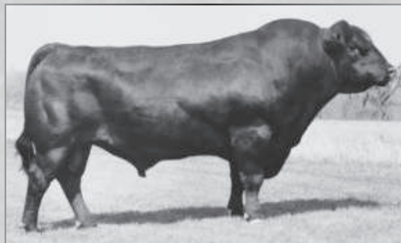
CONNELY LEAD ON – Sire of Reference Sire D

This elite calving-ease Kington herd sire ranks below breed average for Birth Weight EPD without sacrificing maternal and carcass genetics. He is a direct son of Connealy Lead On back to the Pathfinder Sire and balanced trait leader, Bon View New Design 1407. He has an individual birth ratio of 93, weaning ratio of 102, progeny production record of BR 11@94 and stems from a dam that records BR 1@93 and WR 1@102.