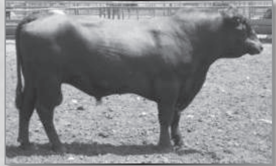
SVA SPECIAL DESIGN 7609 – He sells as Lot 31.