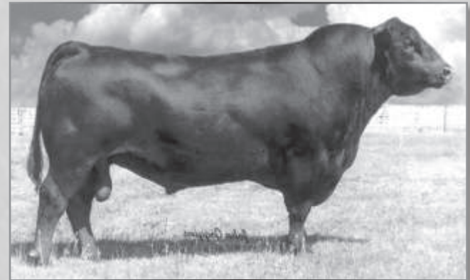
VERMILION DATELINE 7078 – Sire of Lot 90.