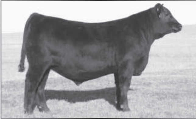
SAV DOMINANT 5405 – His daughters sell.