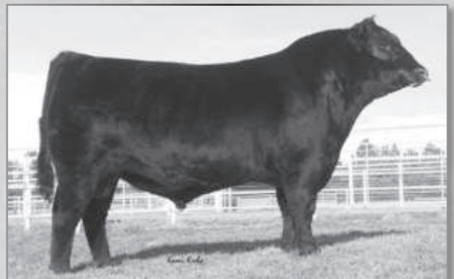
BR MIDLAND – Full brother to the dam of Lots 46 and 47.

Bred to calve February 1, 2010, to SAV FINAL ANSWER 0035.