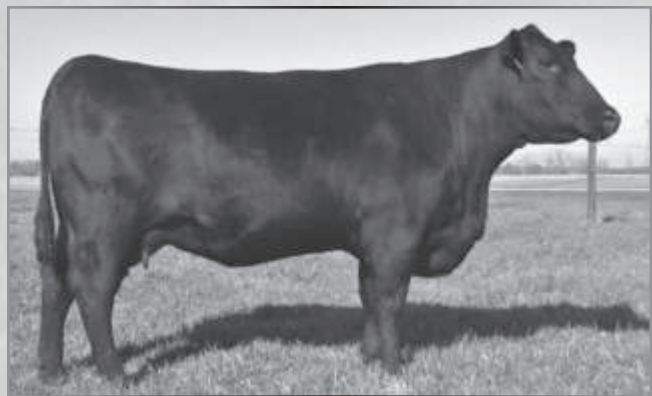
BR BLACKCAP 700-283 – Dam of Lots 50A and 50B and one of the high Weaning and Yearling Weight EPD cows of the breed.