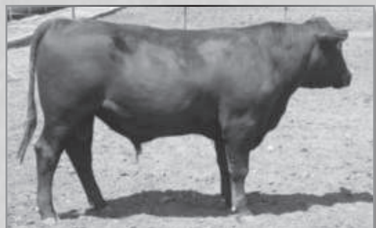
KINGTON LEAD ON 18A – He sells as Lot 15.