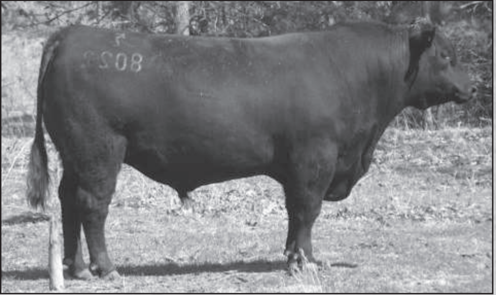
KLR OBJECTIVE 8022 - He sells as Lot 7.