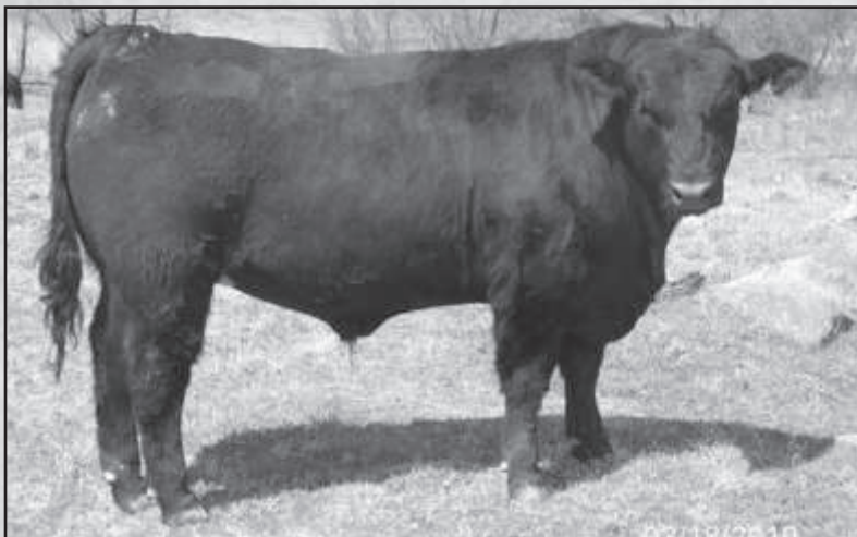
LONE OAKS TOTAL 9055 - He sells as Lot 30.