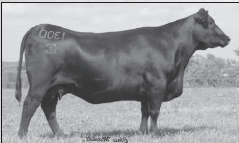
GAR NEW DESIGN 1300 - Maternal grandam of Lots 8, 9 and 10.