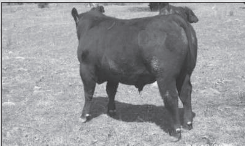
KLR NEW DESIGN 9047 - This son of Bon View New Design 878 sells as Lot 42.