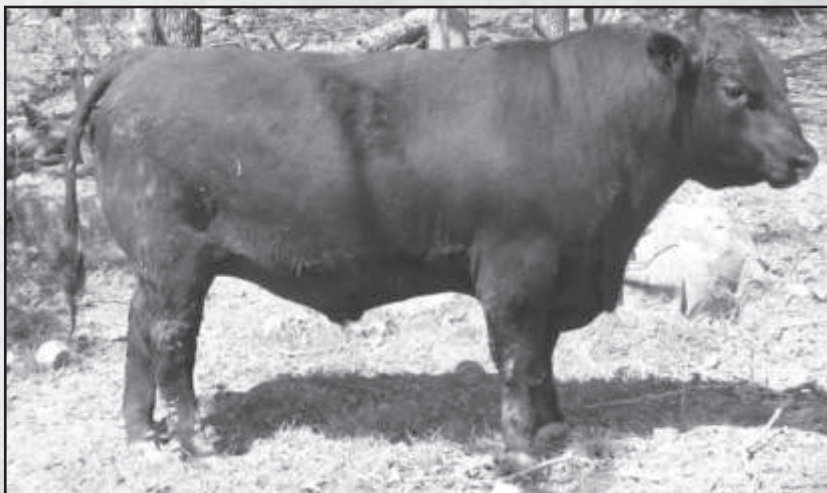
KLR 878 NEW DESIGN 8096 - He sells as Lot 22.