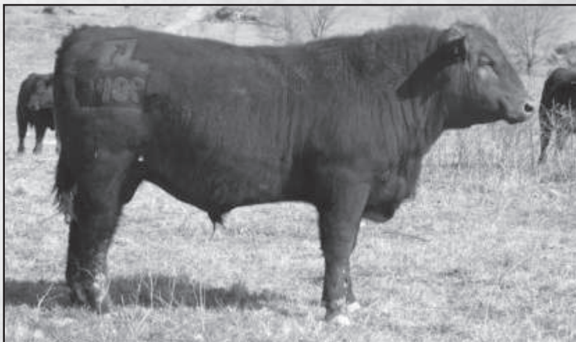
KLR BIG EYE 9014 - He sells as Lot 46.