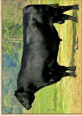
SS OBJECTIVE T510 0T26

PRSR FIRST CLASS U.S. POSTAGE PAID Minster, OH Permit #1