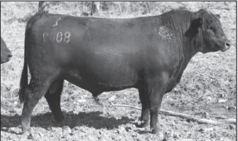
KLR RITO 2 878 of 2536 8009 - He sells as Lot 9.