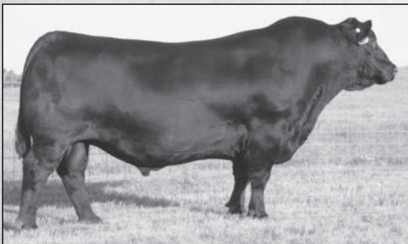
SAV 8180 TRAVELER 004 - Sons of this popular Genex/CRI sire sell.