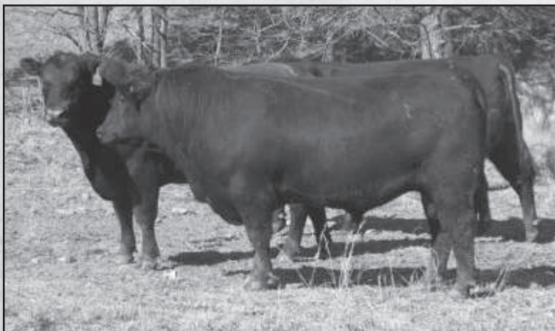
KLR 1407 NEW DESIGN 8084 - This tremendous GAR Predestined son sells as Lot 19.