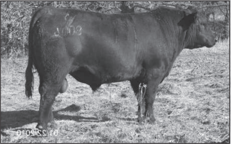
KLR RITO 2 878 OF 2536 8006 - He sells as Lot 8.