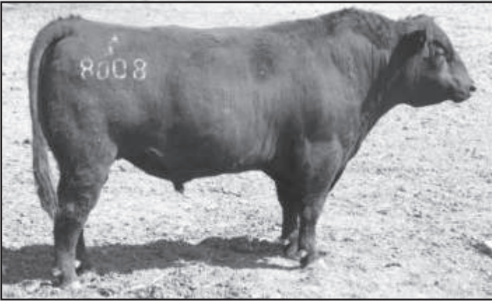
K L R OBJECTIVE 8008 - Lot 4