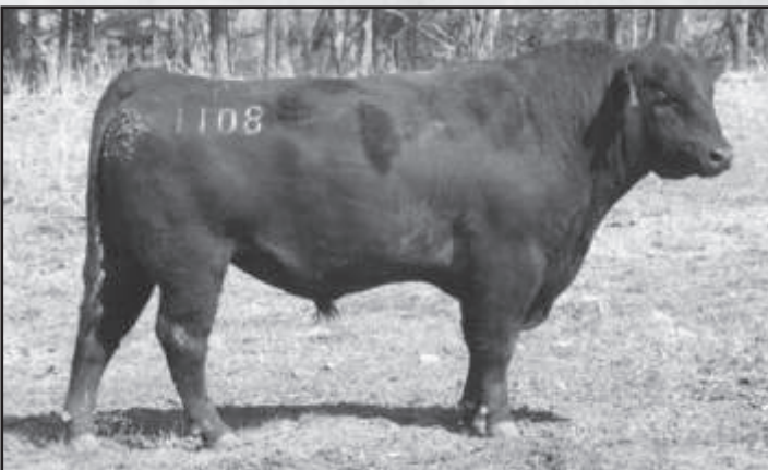
K L R OBJECTIVE 8011 - Lot 6