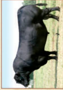
SAV FINAL ANSWER 0035