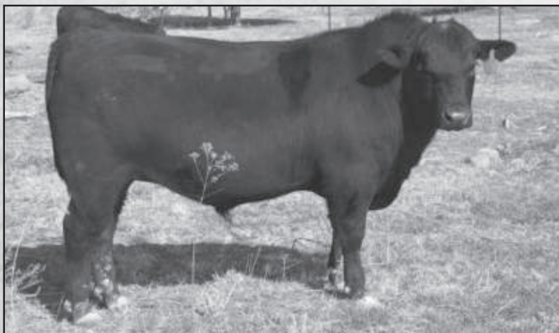
KLR 878 NEW DESIGN 9018 - He sells as Lot 43.