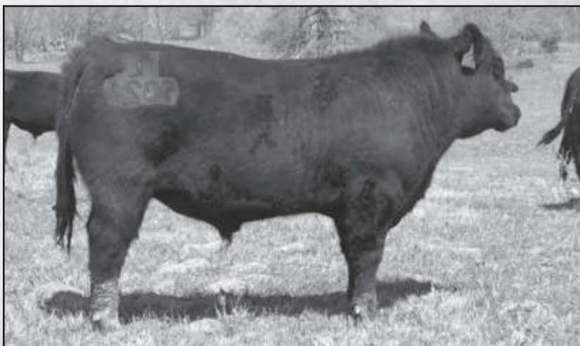
KLR PREDESTINED 9026 - He sells as Lot 61.