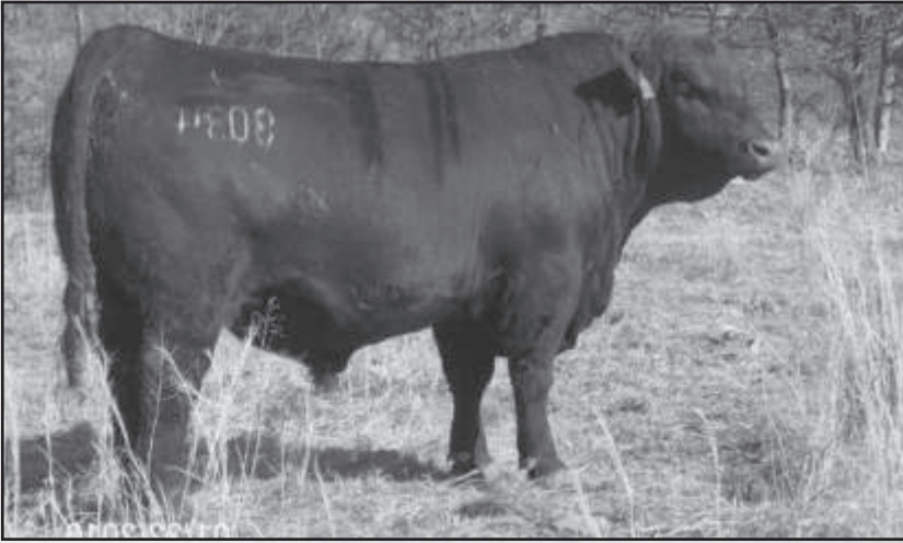
KLR FOREFRONT 8034 - This powerful two-year-old sells as Lot 14.