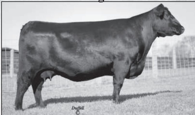
GAR EXT 2114 - The proven maternal grandam of Lot 33.