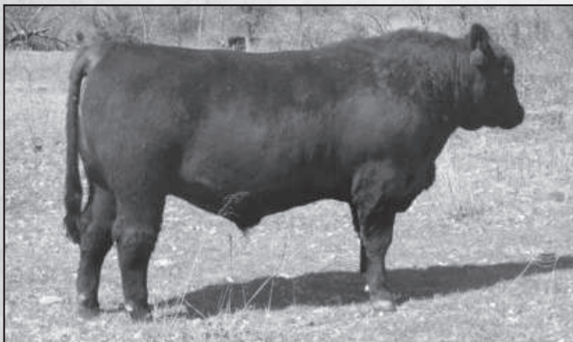
KLR BEXTOR 8089 - He sells as Lot 56.

Lots 51 through 61 represent bulls known to be carriers for either AM or NH. We recommend the use of these bulls to add pounds and performance to your calf crop and to be used in a crossbreeding and/or terminal breeding program. If you have any questions on how to use these bulls, please visit with us.