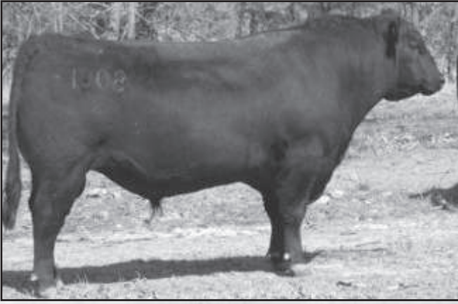
K L R OBJECTIVE 8001 - Lot 1