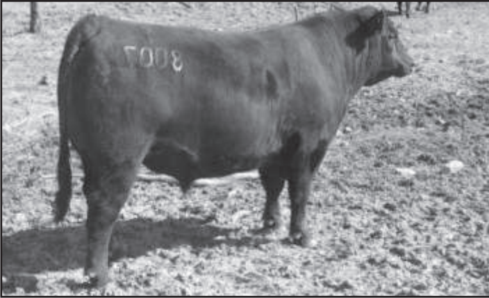
K L R OBJECTIVE 8007 - Lot 3