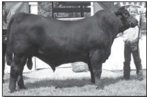
Kesslers CAK Billy Bob 8717 - Lot 105