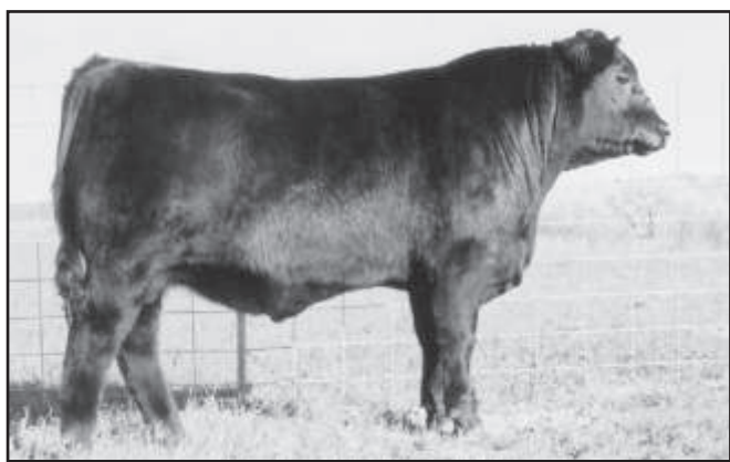
TC Boom Time 434