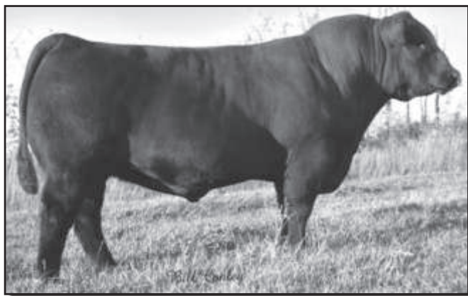
BC Marathon 7022