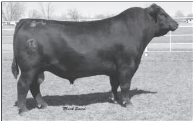
HARB Pendleton 765 JH