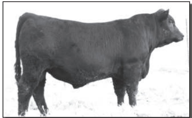
Kesslers Boom Time 9578 - Lot 44