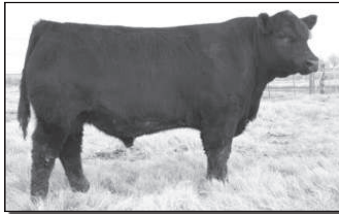
Kesslers Pendleton 9592 - Lot 22