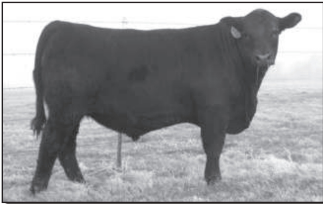
Kesslers Boom Time 9559 - Lot 42