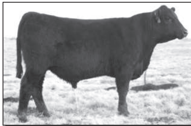
Kesslers Pendleton 9703 - Lot 27