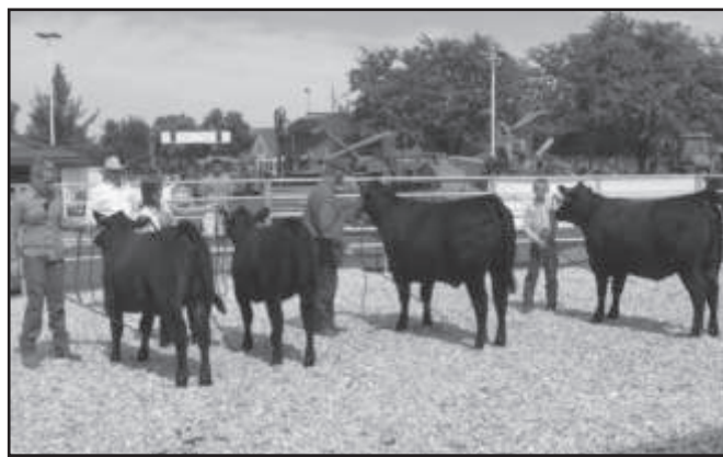
Kesslers and their cattle at Walla Walla fair.