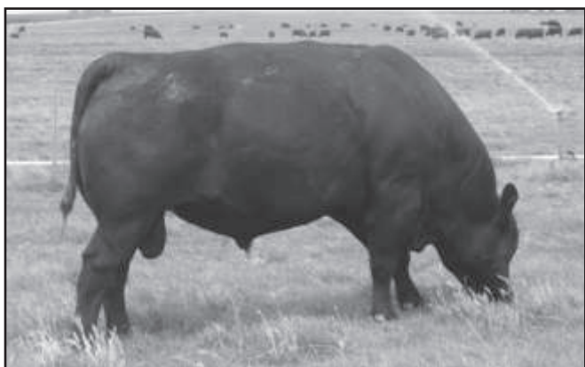
Mytty Alliance P105