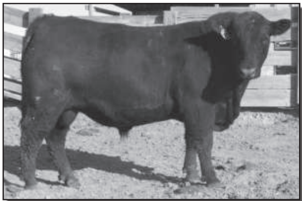
Kesslers July 8721 - Lot 104