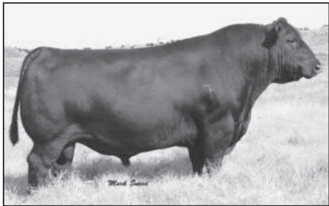
Kesslers Frontman R001