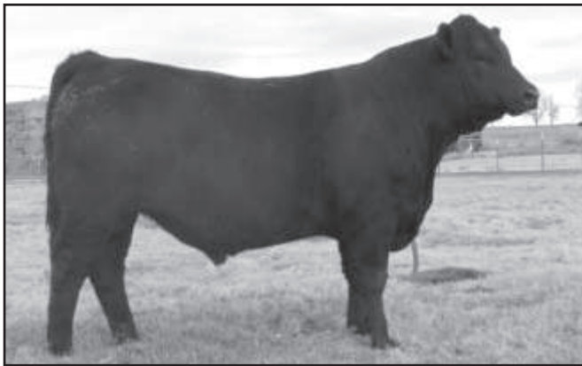
Kesslers Pendleton 9588 - Lot 16