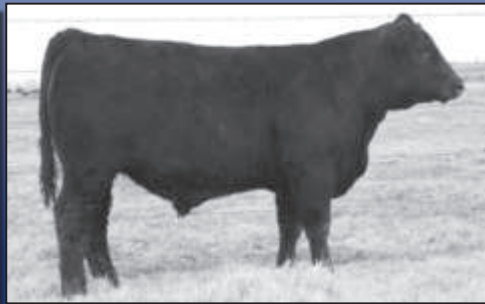
Kessler's Format 9723