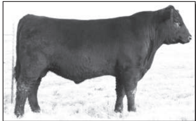
Kesslers Pendleton 9512 - Lot 13