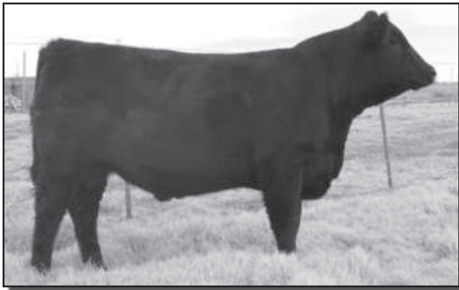
Kesslers Pendleton 9619 - Lot 19