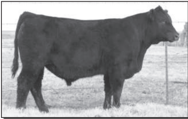
Kesslers Superman 9725 - Lot 11