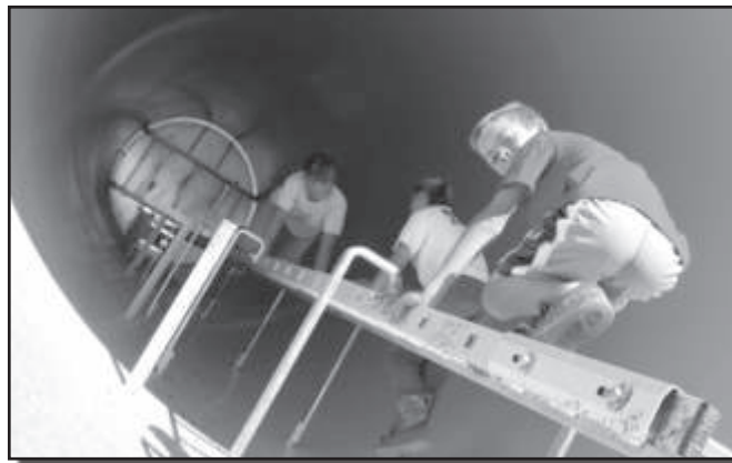
Our kids have gotten pretty good at climbing wind towers!