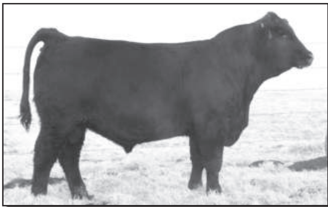
Kesslers Pendleton 9526 - Lot 51