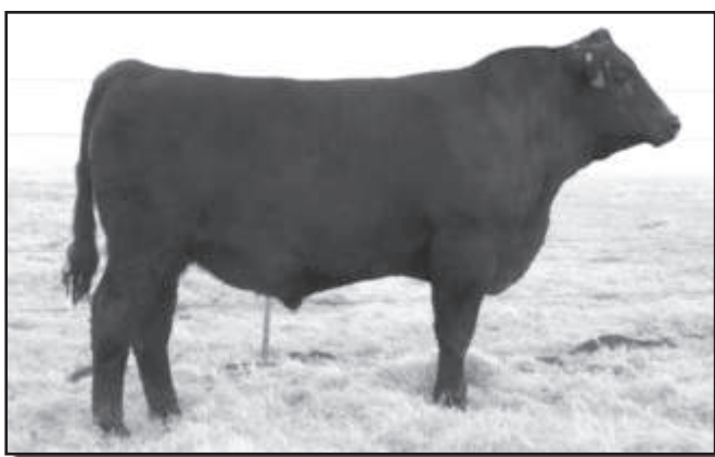
Kesslers Boom Time 9539 - Lot 40