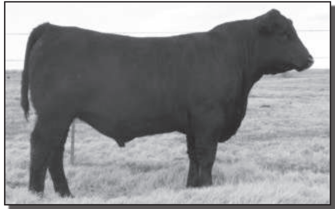
Kesslers Whiskey River 9607 - Lot 17