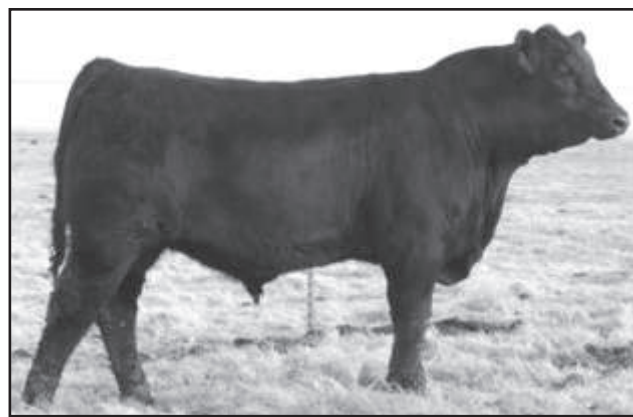
Kesslers Pendleton 9668 - Lot 26