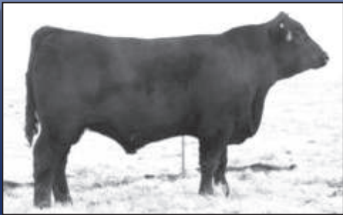
Kessler's Augustus 9649