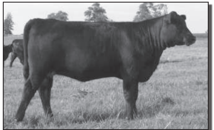
0024's 2009 heifer calf sired by HARB Pendleton JH 765.