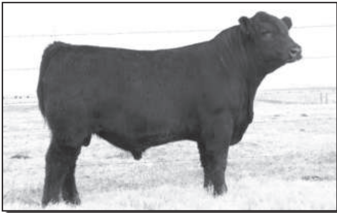
Kesslers Medicine Man 9697 - Lot 6