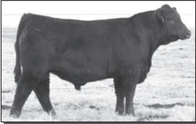
Kesslers Fireman 9675 - Lot 2