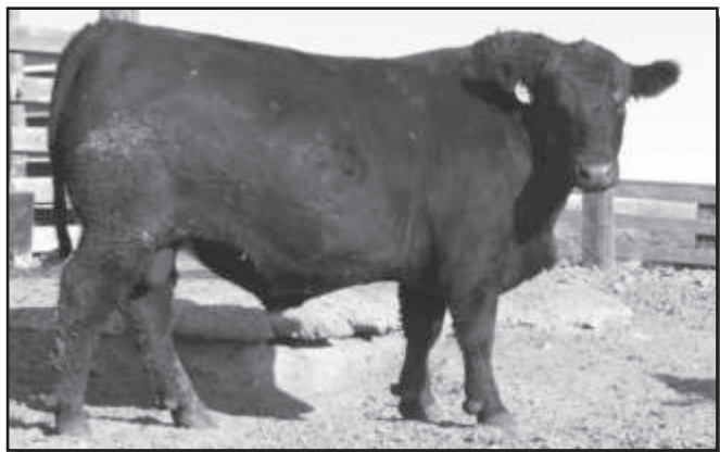
Kesslers Onward 466S 8701 - Lot 108