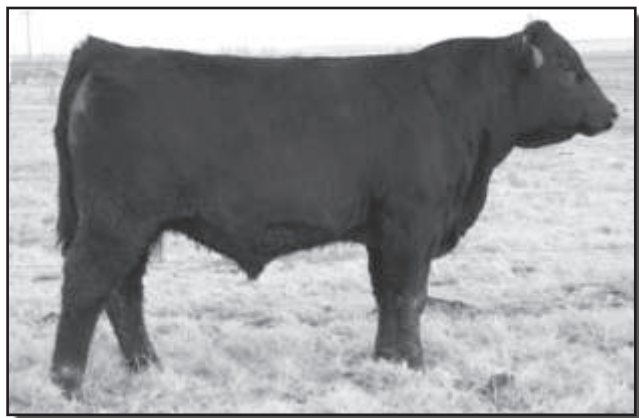
Kesslers Pendleton 9644 - Lot 25