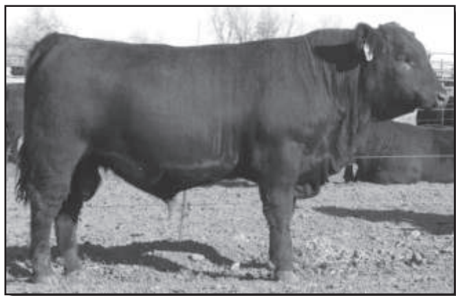
Kesslers Onward 517S 8755 - Lot 79