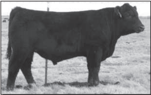
Kesslers Coach 9708 - Lot 3