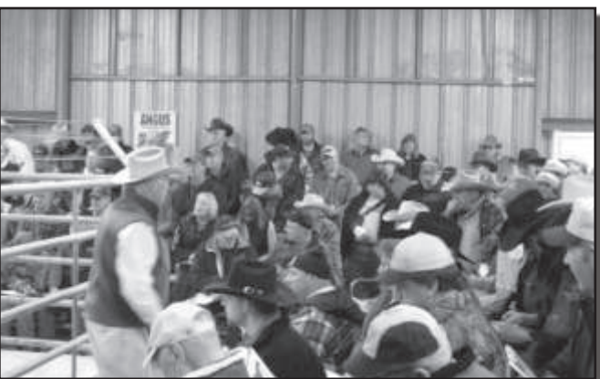
2009 sale crowd.