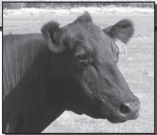
Kessler's Bell 0024