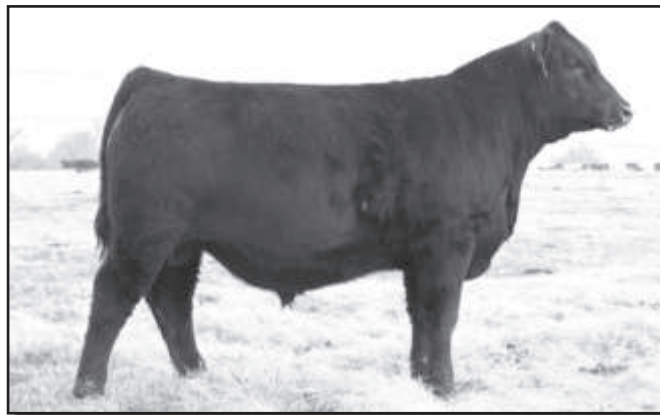
Kesslers Majestic 9724 - Lot 10