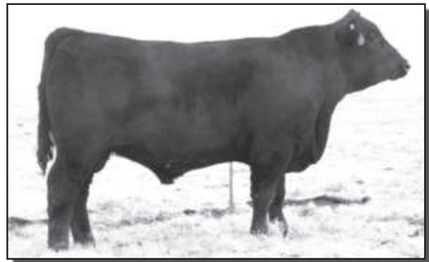
Kesslers Augustus 9649 - Lot 5