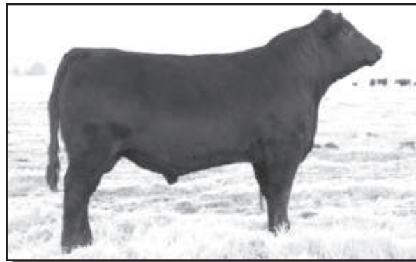
Kesslers Pendleton 9593 - Lot 14