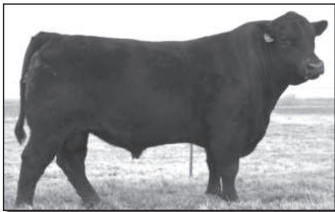
Sitz Onward 466S