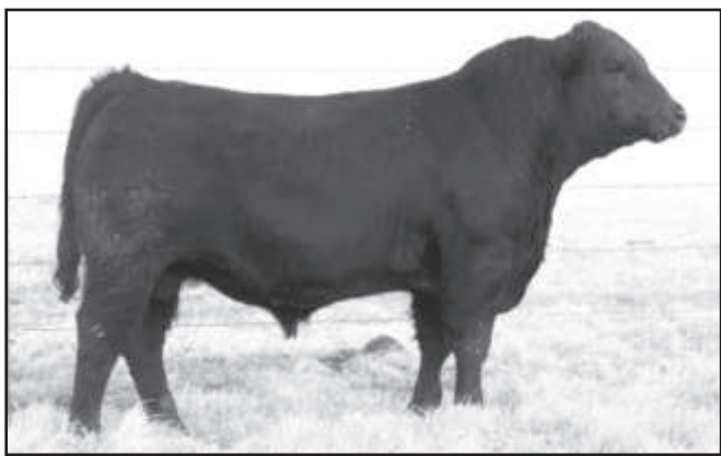
Kesslers Pendleton 9561 - Lot 52