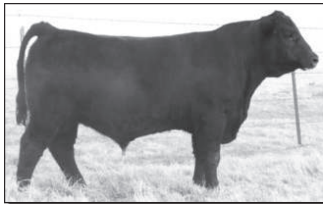
Kesslers Pendleton 9597 - Lot 53