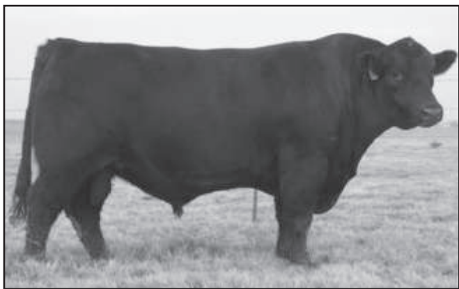
Sitz JLS Onward 517S