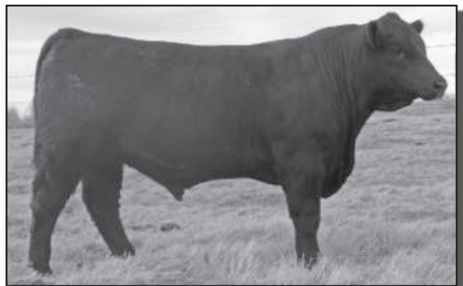
Kesslers Pendleton 9553 - Lot 18