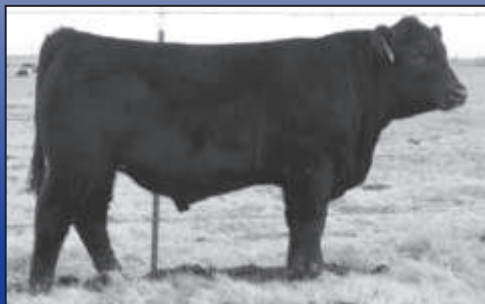
Kessler's Coach 9708