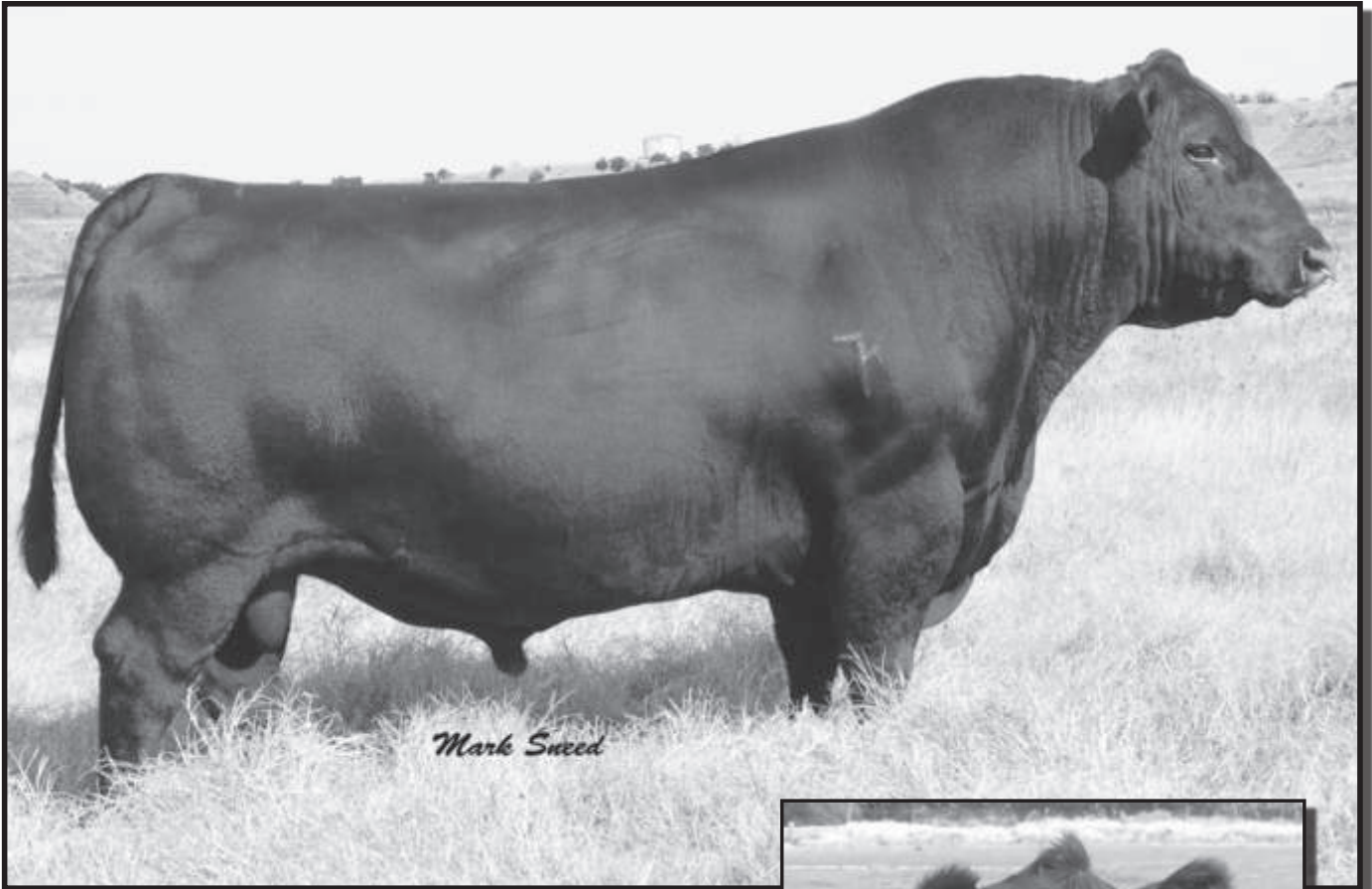
Kessler's Frontman R001