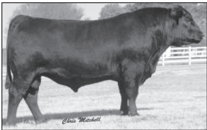
Dr J Analyst M250