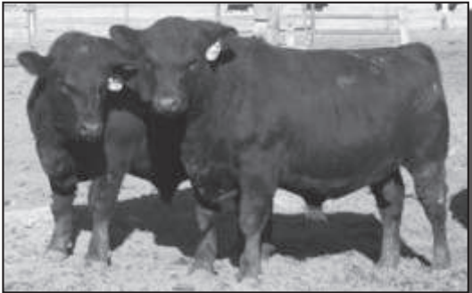
Kesslers Objective 8727 and Kesslers Forecast 8740 - Lot 70