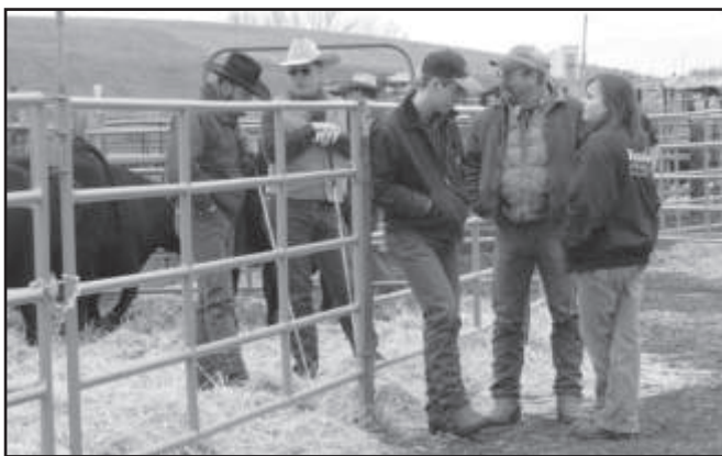
Part of the 2009 sale crew visits before the work starts.