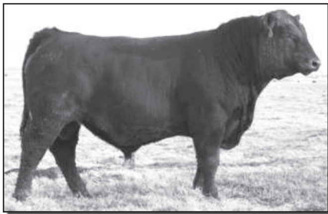
Kesslers Upward 8741 - Lot 75