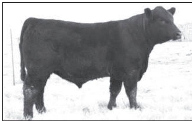
Kesslers Pendleton 9623 - Lot 23