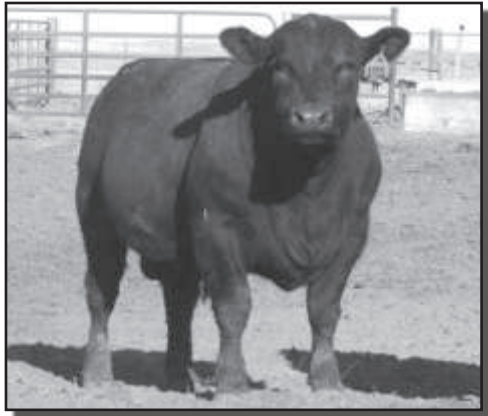
Kesslers TK George 8738 - Lot 95