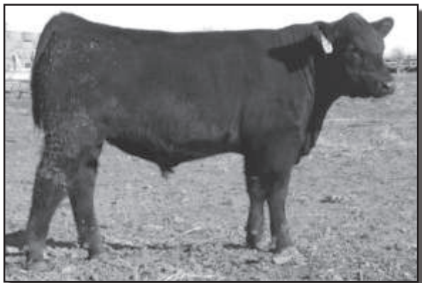
Kesslers Frontman 9674 - Lot 7