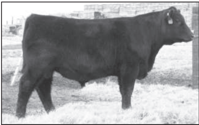
Kesslers Frontman 9670 - Lot 12