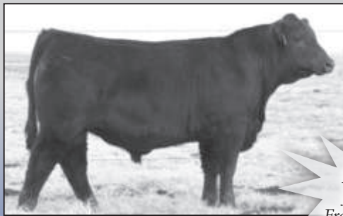
Kessler's Fireman 9675

Tuesday February 16, 2010 12:30 P.M. At the Ranch near Milton-Freewater, OR