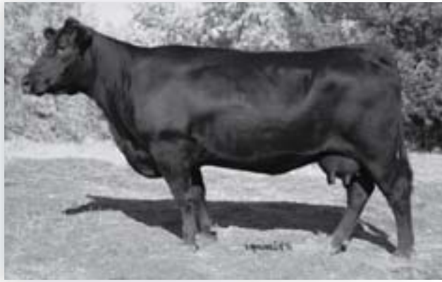
Ideal 1517 of 7451 6110 / The maternal grandam of 9520.