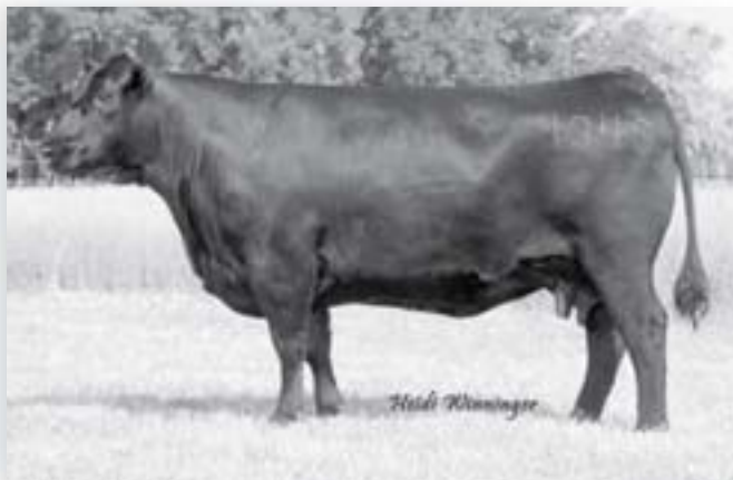
Ideal 1340 of 9404 828 / The dam of 9771 and 9775.