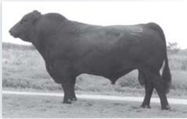
DHD Traveler 6807 / Reference Sire F