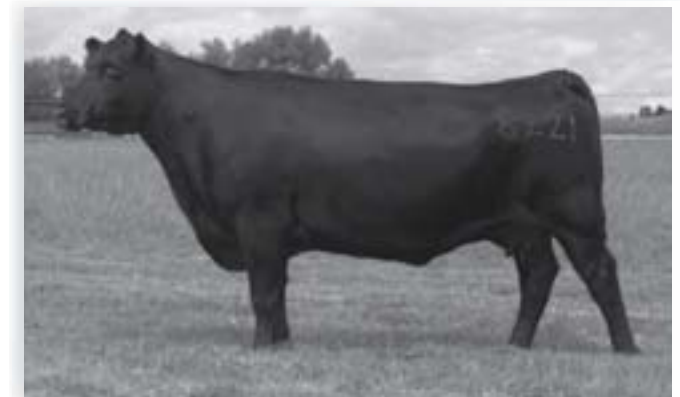
Ideal 8221 of 5439 4517 / The dam of Ideal 332.

Look for this bull to be used heavy in the future at JLC. The females put back by this bull are some of the best ever raised. This bulls numbers continue rising year after year.