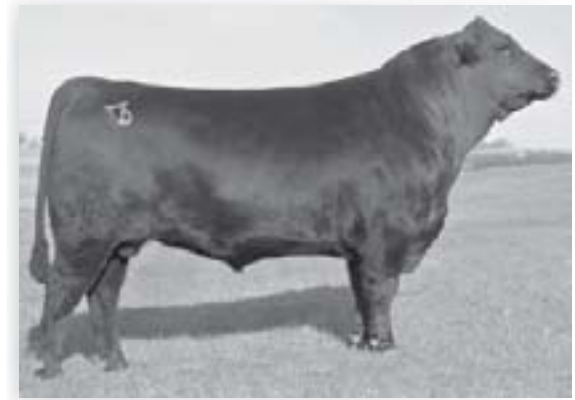
Sinclair Net Present Value / The sire of Reference Sire P.

Ideal 6442 of 8103 351 Ideal 4231 of 033 1467 #Ideal 5439 of 1418 2455 Ideal 9162 of 71 5234