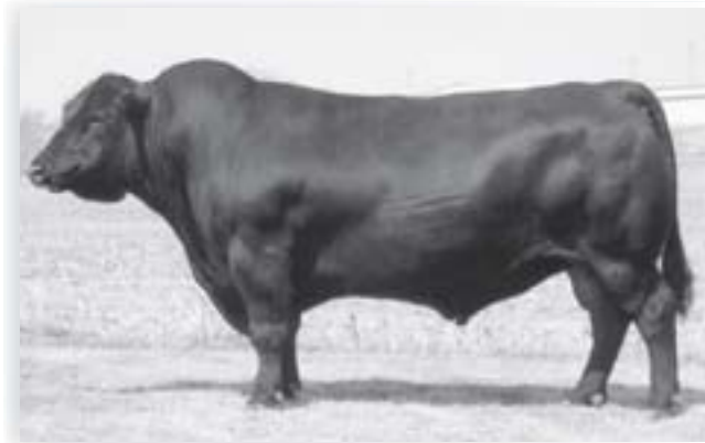
Ideal 7451 of 8103 4465 / Sire of Reference Sire K.