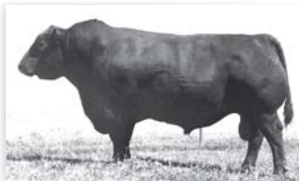
RR Rito 707 / Sire of Reference Sire C.