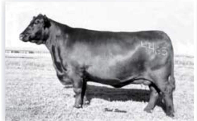
Ideal 4456 of 6807 6286 / Ideal 4456 traces through the same bloodlines as the feed efficiency queen.

Ideal 4456 is another top performing son of the famed "6807." Ideal 4456 is a prime example of the superior growth consistently transmitted by DHD Traveler 6807.