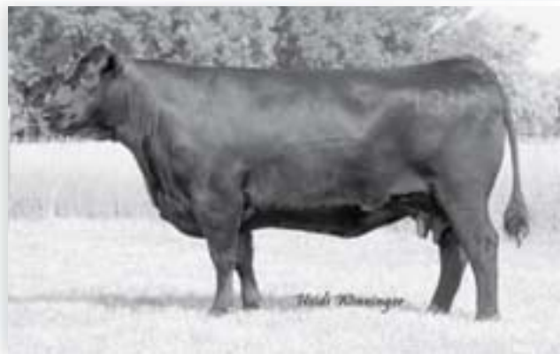
Ideal 1340 of 9404 828 / Dam of 9171 and 9177.