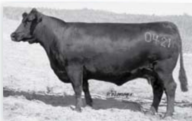
Ideal 0421 of 8103 5467 / Dam of 9167.