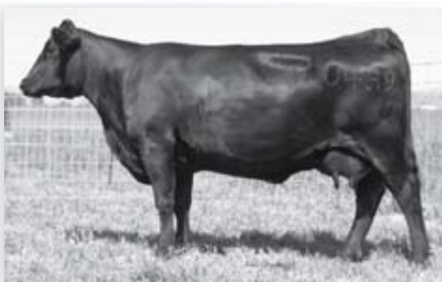
Ideal 0459 of 5439 5467 / The maternal grandam of 9524