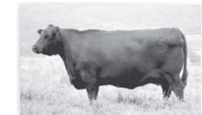
Ideal 4517 of EXT 7394 / The grandam of Ideal 332.