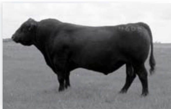
Ideal 4608 of 452 2257 / Reference Sire L