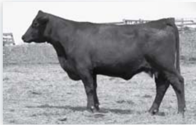
Ideal 1334 of 8273 8456 / The maternal grandam of 9786.