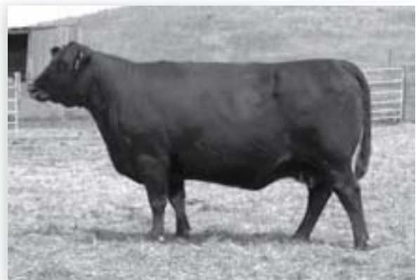
Ideal 6187 of 3452 3128 / The maternal grandam of 9792.