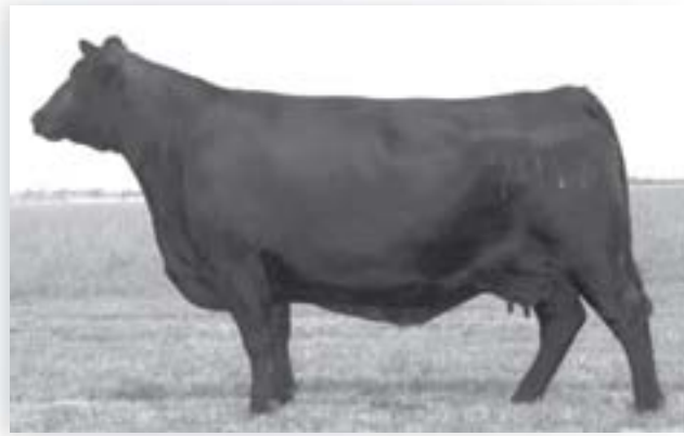
Ideal 7417 of 1418 4465 / Dam of Reference Sire A.