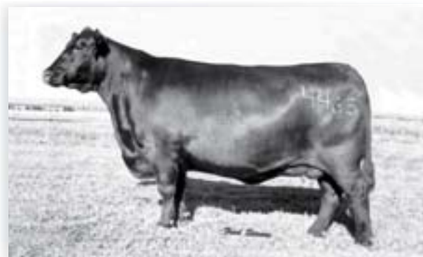
Ideal 4465 of 6807 4286 / Dam of Reference Sire C.

3R9 is a bull we are very excited about. The pedigree provides an unbelievable line breeding tool necessary for progress at JLC. The calves are very thick with good weaning to yearling acceleration.