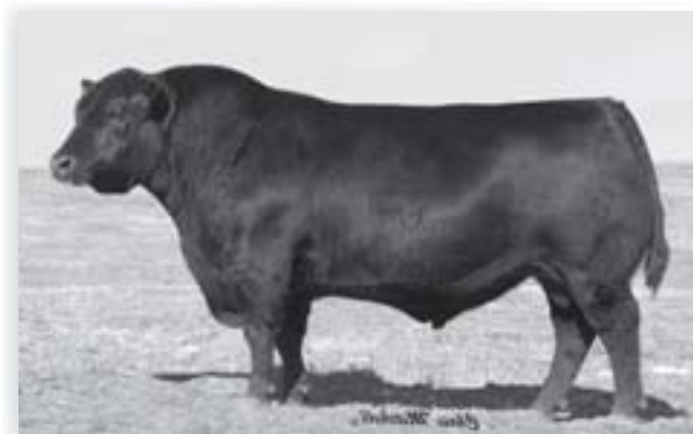
Sinclair Rito Legacy 3R9 / Reference Sire C.