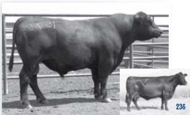
Ideal 1576 of 7451 6187 / The sire of Reference Sire M.