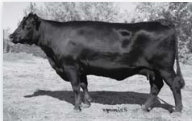
Ideal 02 of 820D 1430 / The maternal grandam of 9434.