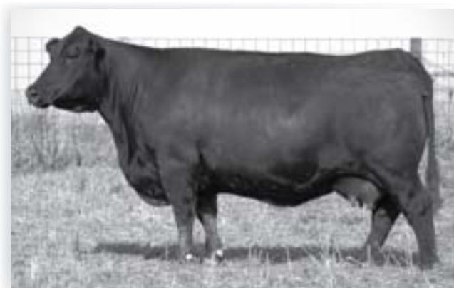
Ideal 7137 of 692 8375 / Grandam of 9331.