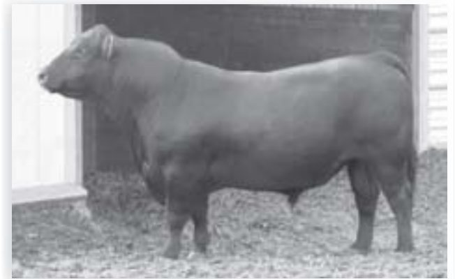
Sinclair Rito Impact 48X DGT / Reference Sire B

Rito Impact sires moderate and thick calves at yearling. His first 28 calved showed a YW ratio 101 and ultrasound on 16 calves resulted in an IMF ratio 108 , RE 99.