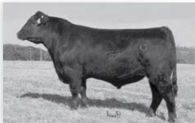
Quaker Hill Objective 3J15 / Reference Sire H

3J15 is a bull we had to try because of his strong set of numbers. 3J15 has an unbelievable birth to yearling spread.