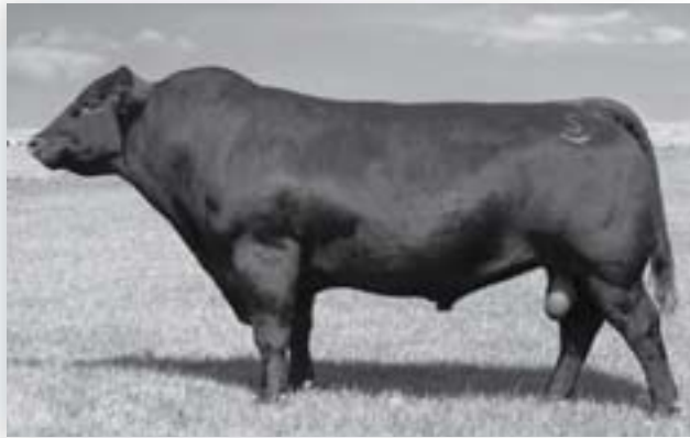
Woodhill Foresight / Reference Sire J.