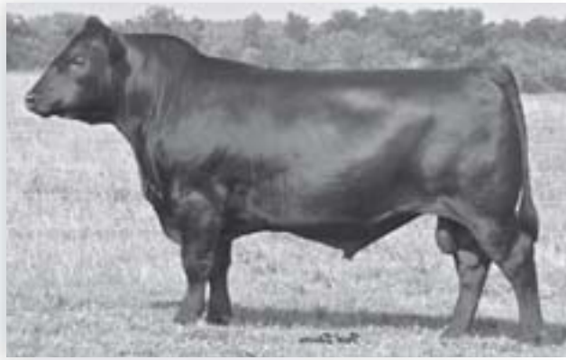
Ideal 4355 of OT26 2440 / Reference Sire G