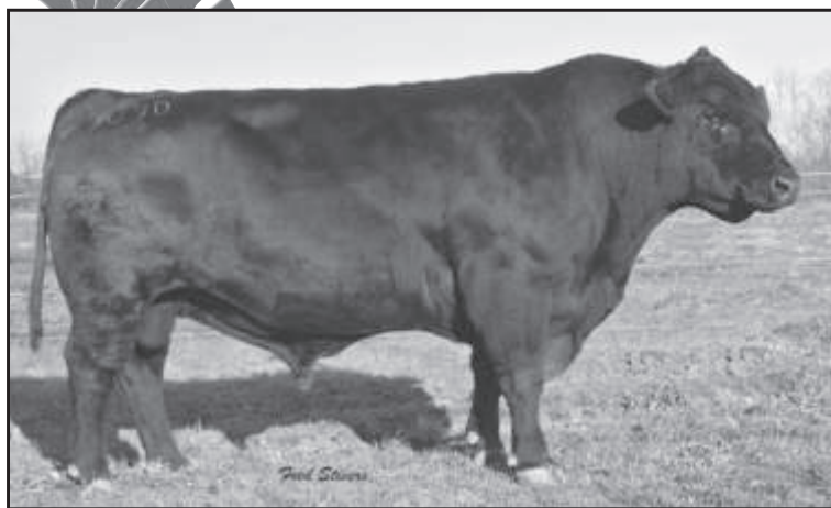
Holly Hill Max Rito 70902083