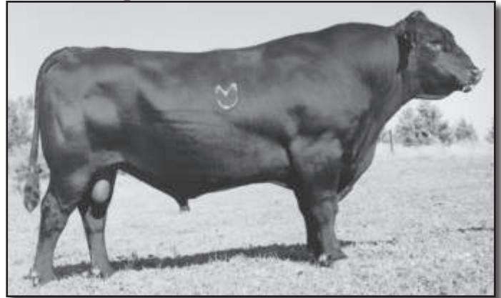
B/R New Design 036 - His descendants sell.