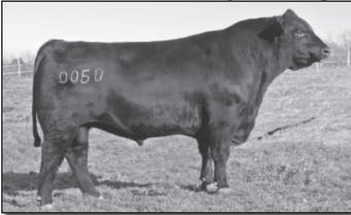
Holly Hill 2H05 0050 2215 - 2004 Circle A Sire Alliance Winner, his progeny sell.

1 Holly Hill Ginger 7002-7070 Birth Date: 3-9-2007 Cow 15905447 Tattoo: 7002