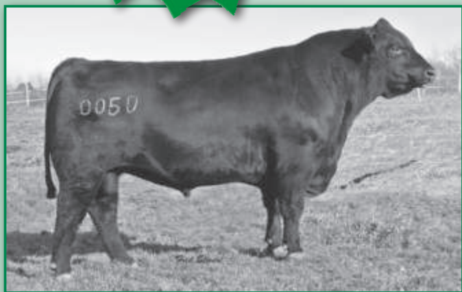
Holly Hill 2H05 0050 2215 - Reference Sire A

12 Spring-Calving Cows • 24 Fall-Calving Cows 4 Bred Heifers • 3 Open Heifers 9 Service Age Bulls