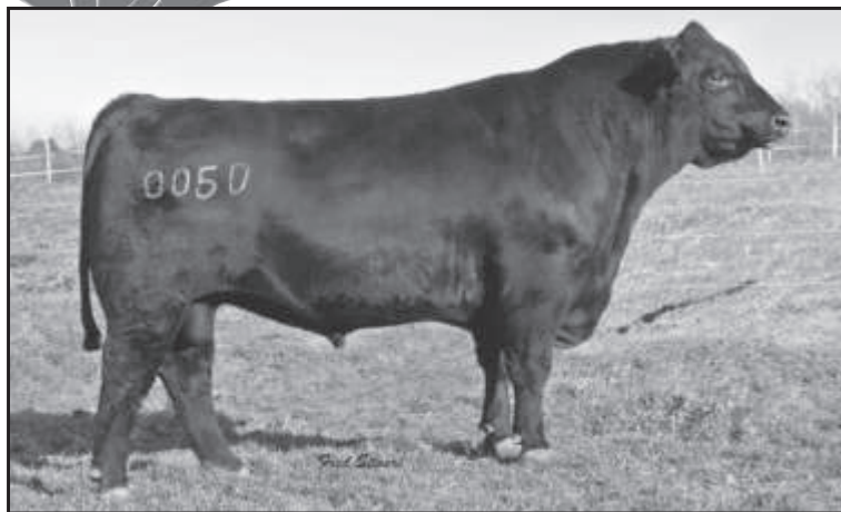
Holly Hill 2H05 0050 2215