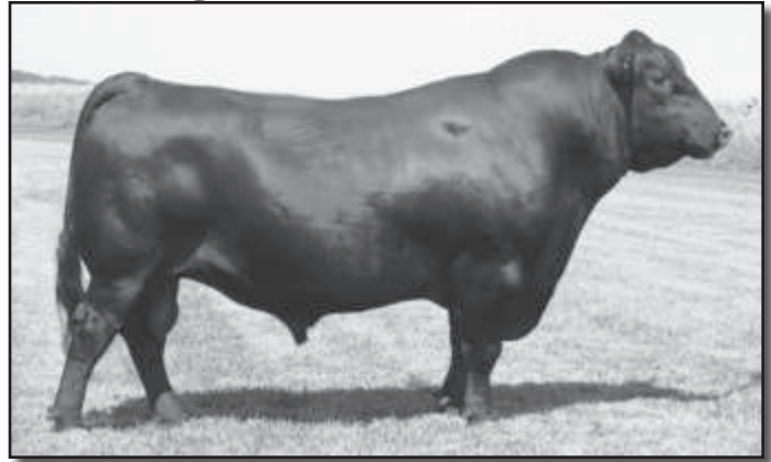
Bon View New Design 878 - His progeny sell.