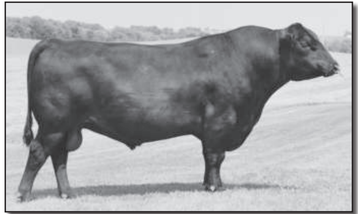
B/R Destination 727-928 - His sons sell.