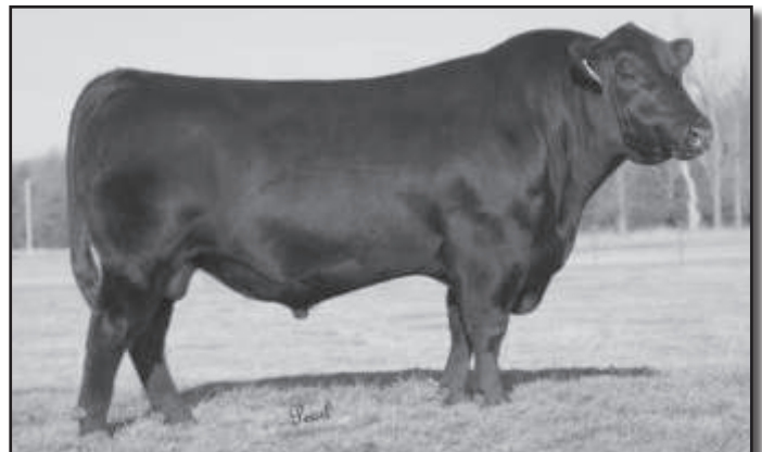
Boyd Beef Maker 3069 - His progeny sell.