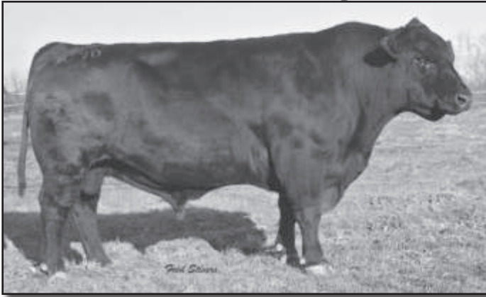
Holly Hill Max Rito 70902083 - His progeny sell.