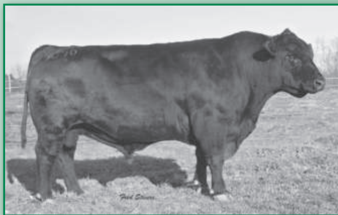
Holly Hill Max Rito 70902083 - Reference Sire B