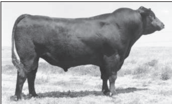
B/R New Design 323 - His descendants sell.