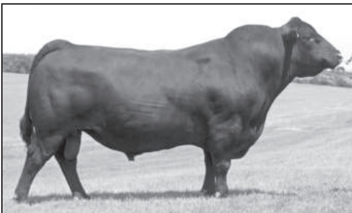
Ironwood New Level - A daughter sells as Lot 30.