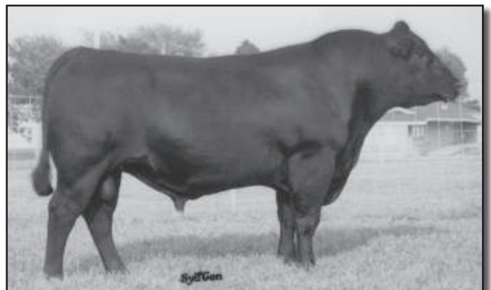
SydGen 1407 Corona 2016 - A daughter sells.