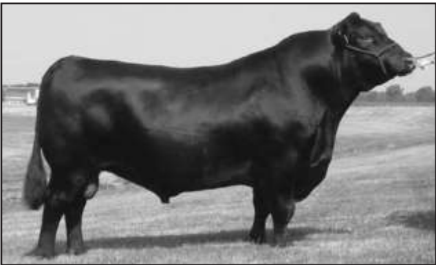
GAR Predestined - Reference Sire D

Kramers Survivor was added to our herd for eye appeal and carcass quality. His numbers are average in almost every category.