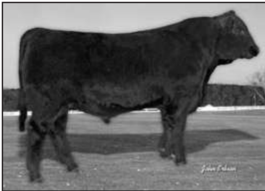
Hobbs 634 Total 20S-36W - Selling in the 2010 Illinois Performance-Tested Sale.

634 son. 104 weaning ratio, 705 lb. actual weaning wt.