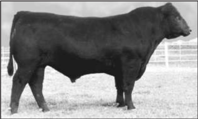
Connealy Danny Boy - Sire of Connealy Danny 4444.

Sired by TC Total 410. Continuing his sire's reputation for disposition, growth, carcass, maternal and good looks. Top 1% for WW, top 2% for YW, top 15% for Milk, top 60% for Marbling, top 10% for Ribeye, top 10% for $B, top 2% for $F and top 7% for $YG.