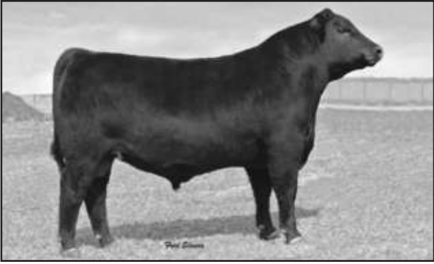
JC Total 410 - Sire of TC Total 634.