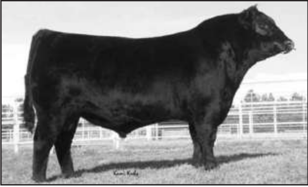
BR Midland - Sire of Kramers Survivor.