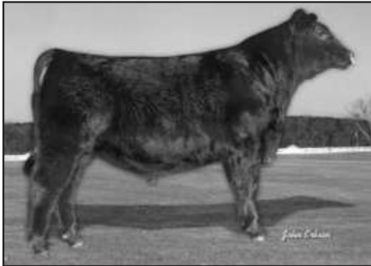
Eathington Pride 71U - Lot 20

Weaning ratio 112, actual 820 lb. weaning wt. Will add a lot of growth.