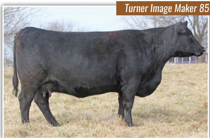
Turner Image Maker 85

A flawless heifer on paper with awesome Maternal indicators. In person she is deep and fleshy in the right frame for any breeder. Her dam posts 2 BW@97 2 WW@108 and 1 YW@103 in a 370 day calving interval. She is a grand daughter of our most influential donor who has impacted our sale and herd greatly. Dam will likely make Pathfinder this year as well as be in the donor pen. We wanted to offer one of our best for the sale!