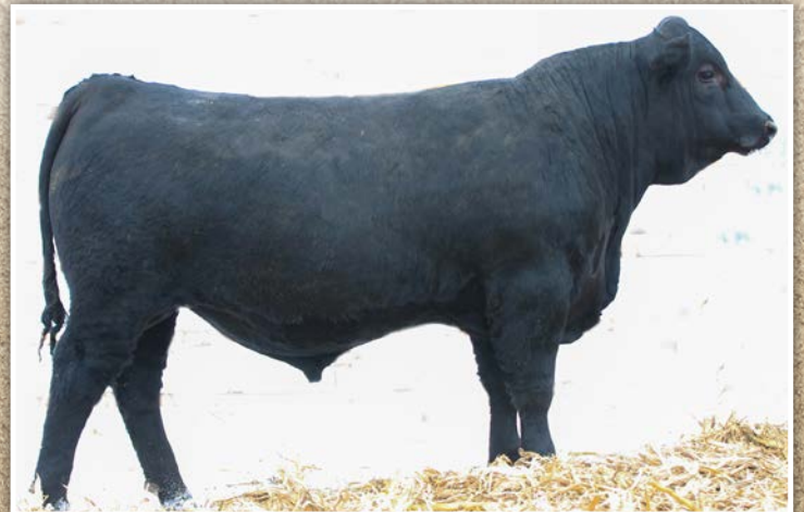
1 HF Southern Charm 9075 ANGUS CS BULL | REG: 19539298 | DOB: 02/01/19 | TAG: 9075