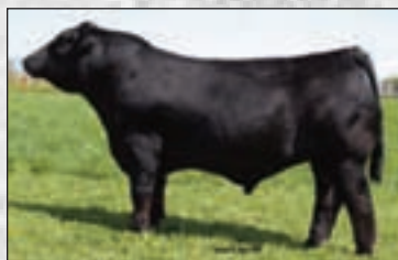
REFERENCE SIRE RANCH HAND