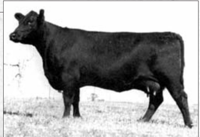
MISS WIX 903 OF MC CUMBER