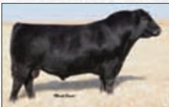
BC RAVEN SERVICE SIRE OF LOT 19