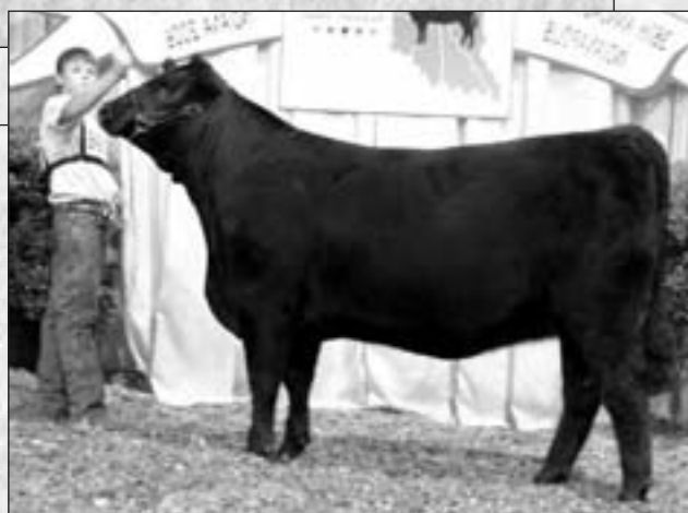
RCL BARB 5152 DAM OF LOT 1 AS BRED HEIFER