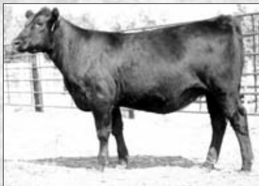
RCL DUCHESS 8410 SAME COW FAMILY AS LOTS 9 THRU 12