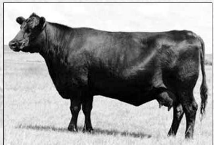
MISS WIX 365 OF MC CUMBER GRAND DAM OF LOT 38