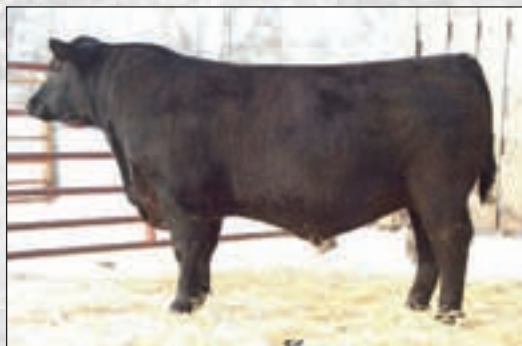
MC CUMBER 004 TRAVELER 6120 SIRE OF LOT 35A SERVICE SIRE OF LOT 38

• Pasture exposed 5/7/09- 7/20/09 to 6120 MC Cumber 004 Traveler 6120 • This cow gained pathfinder status with 6 calves at a 111 weaning ratio before entering our embryo program. Her dam is a full sister to the famous Miss Wix 903 of McCumber and her daughter by 004 weaned the heaviest heifer calf in my herd this year.