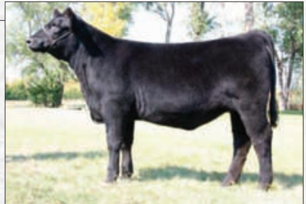
RCL QUEEN 7821 FULL SISTER TO LOT 3 HIGH SELLER IN 2007 FEMALE SALE