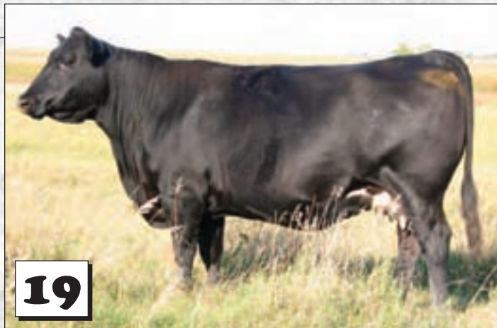
RCL BARB 0854 DAM OF LOT 19