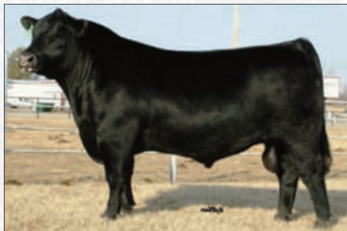
CC & 7 – SERVICE SIRE OF LOT 26