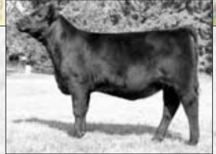
RCL BARB 8422 DAUGHTER OF LOT 13