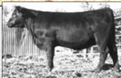
DAM OF LOT 8 AS A YEARLING