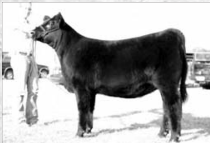
RCL DUCHESS 6410 DAM OF LOT 12 AS YEARLING