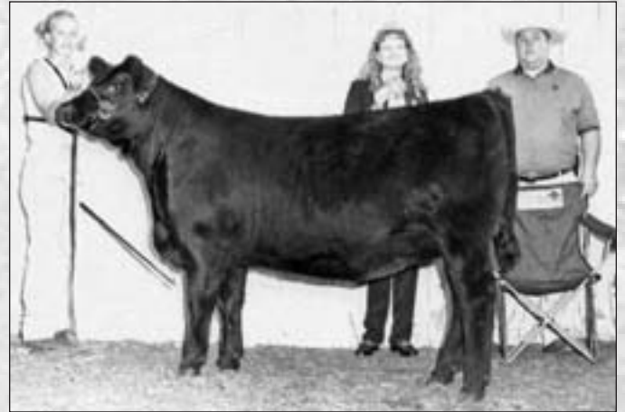
TR MS DUCHESS 1046L DAM OF LOTS 9A, 9B, 10 & 11