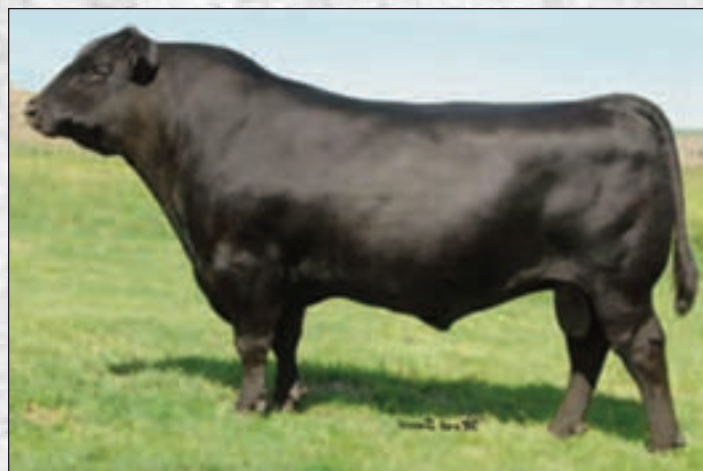
SAF CONNECTION – SERVICE SIRE OF LOT 26A