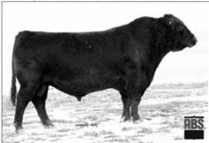
21AR COAL BANK C014 – SIRE OF LOT 32

• Pasture exposed 5/19/09 to 6/11/09 to 808, an Emulation 31 son; 6/11/09 -7/13/09 to 806, an FO203 son.