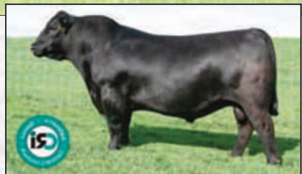
SAV BISMARCK 5682 SIRE OF LOTS 6A & 7