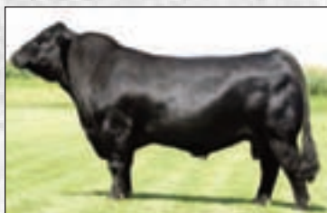
REFERENCE SIRE DREAM ON