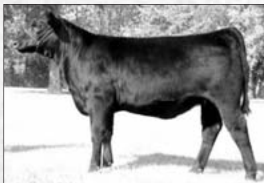
RCL DUCHESS 8641 MATERNAL SISTER TO LOT 12