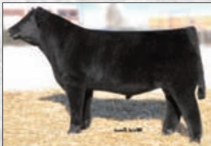
REFERENCE SIRE SHERIFF TAYLOR