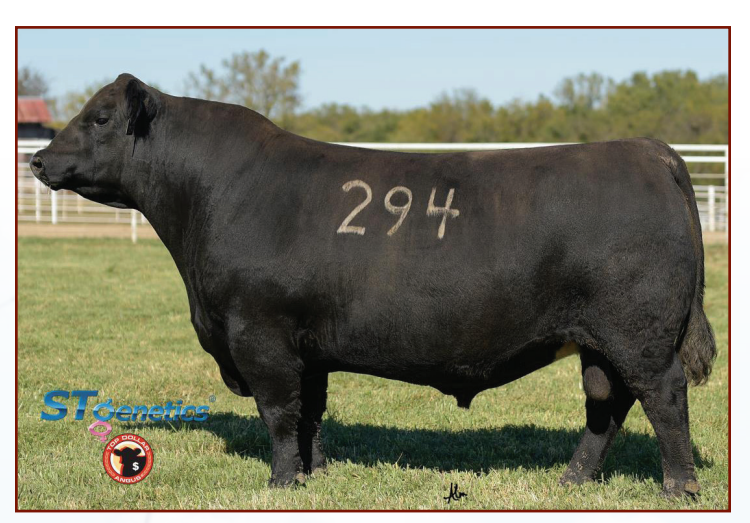
J&J WEIGH UP 294 - Sire of Lot 32

• If your operation prioritizes traits like performance, longevity, and structural integrity, this young cow should get you excited. This standout two-year old is by J&J Weigh UP 294, and out of an outstanding daughter of SAV Resource 1441, which explains the extra power and performance. Her mother, is off to a fantastic start, recording 2@104 WWR and 2@101 RE. This exceptional young female was bred Al on 3/38/20 to KG Justified, and sells safe in calf. She has been ultrasound and is carrying a heifer calf.