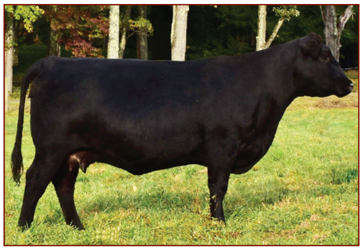
TVF FULL POWER CAROL 525 - Lot 43