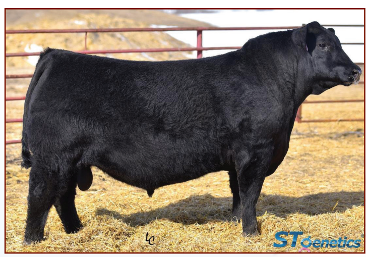
ELLINGSTON HOMESTEAD 6030 -