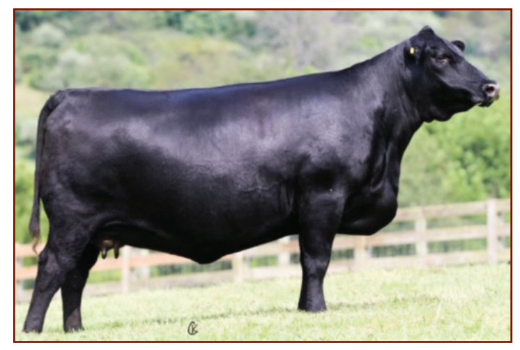
QCC BLACKCAP 706 - Donor dam of Lot 8

• 706 is a direct daughter of the now deceased and highly sought after Conneally Confidence Plus. 706 is a young female that is absolutely impressive in phenotype, being moderate in stature, powerful in her build, all while being ideal in her foot quality, udder structure, and structural integrity. This impressive 3 year old also boasts an impressive genomics profile that places her in the top 1% of the breed for $C. 2% for foot angle, $B, and $F, and top 3% for CE and RE. It's a rarity to find a female with this balance of phenotype and genetic potential. Take advantage, you are buying the right to flush this female to the bull of your choice, guaranteeing you a minimum of 6 high quality embryos, with a maximum of 10 embryos. The cow is due to calve October 8th, and should be available to flush in late November.