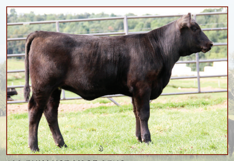
MA ENHANCE N985 OEH2 - Lot 14

Legendary show heifer sire that is not deceased. Semen is EXTREMELY LIMITED! Take advantage of this rare opportunity.