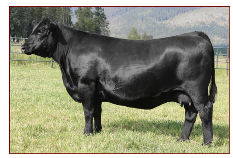
S A V EMBLYNETTE 8255 - Donor dam of Lot 5