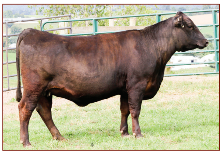
GLC MA ASHLAND 6TX1 8063 - She sells as Lot 31