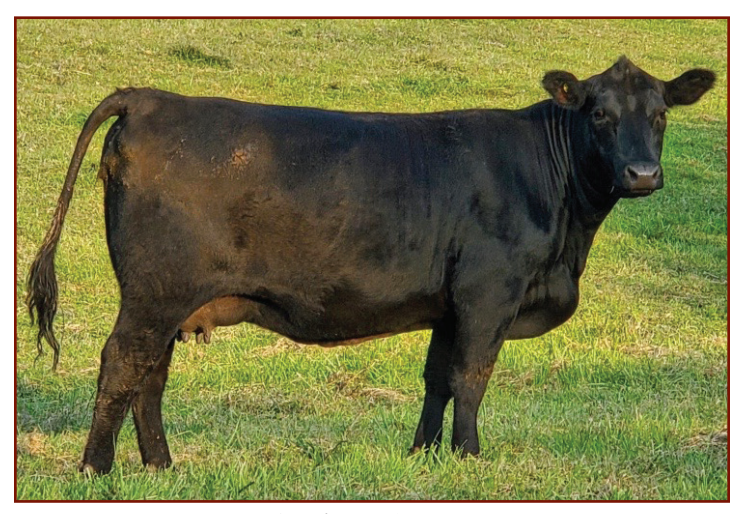
TURNING POINT LADY BELL 8627 - Lot 37