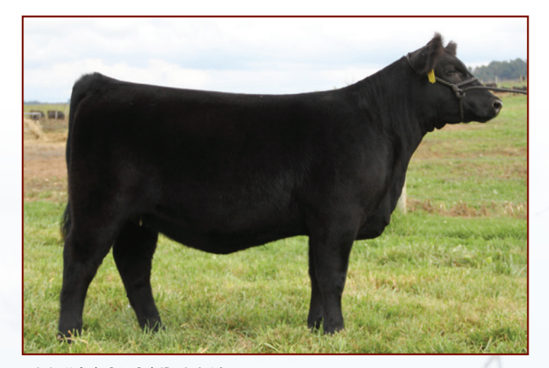
MC BLACKCAP 0011 - Lot 19