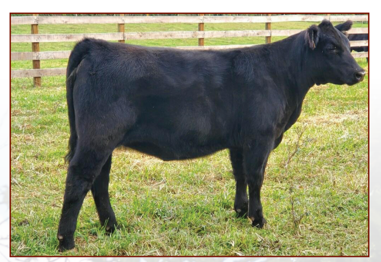
TURNING PT RITA EBONITA 0657 - Lot 29

• Turning Point Angus brings to you a fancy February show heifer prospect. A direct daughter of the banner producing First Impression, this elegant fronted, eye catching heifer was destined to be a show heifer, and is backed by a proven cow family that has generated numerous success stories, including a three guarter brother that earned Grand Champion honors in Virginia. A great disposition and a perfect fit for a younger showman.