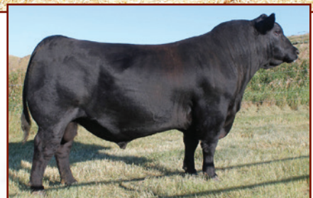
HOOVER NO DOUBT