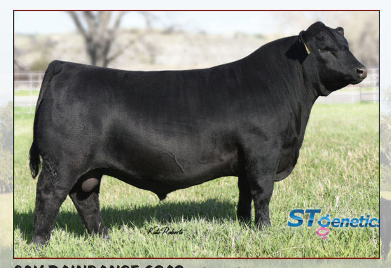
SAV RAINDANCE 6848 - Sire of Lot 39

• Here is your chance to own a direct daughter of the $750,000 record-selling bull of the 2017 SAV sale, SAV President. If power and performance is what you're seeking, look no further. This incredible young female stems from a $25,000 donor female that came from Boyd's in Kentucky, and packs a punch, ranking in the top 2% for Re and SC, 3% for WW, 4% for YW and DOC, top 5% for RADG and MW, and top 10% for $W. She sells with a heifer calf by the $B and $C powerhouse, Baldridge Alternative, born on 9/13/20, with a birthweight of 70 pounds.