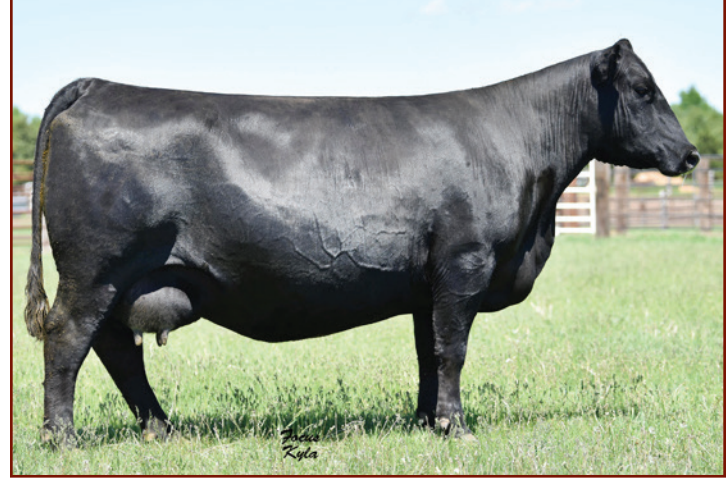
BLACK CEYLA OF CONANGA 0267 - Dam of Lot 15

• The Cowman's kind is represented in this sale feature. One of the most authentic and highly productive females in America, 0267, came to GMC Farms as the pick of the cows in the 2018 Connealy Angus Sale in Nebraska. This impressive female has produced two sons that have been featured at both Select Sires and ABS Global AI studs, garnering $45,000 and $32,500 each. Furthermore, she has earned progeny weaning and yearling ratios of 101 and 104, respectively on six natural calves, after earning individual ratios of 107 WWR, 118 YWR, and 118 IMF. This September heifer is sired by the wildly popular Confidence Plus, and is destined to be a foundation female for years to come.