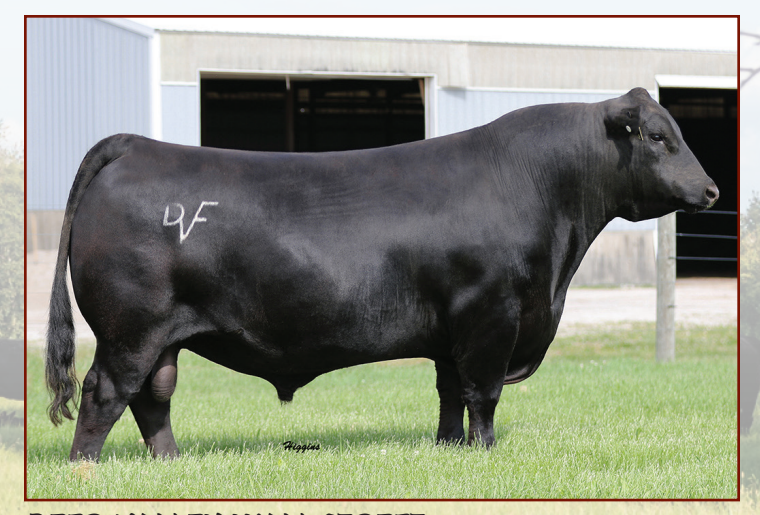
DEER VALLEY WALL STREET - Exciting young sire at Select Sires. A daughter is featured as Lot 41A.