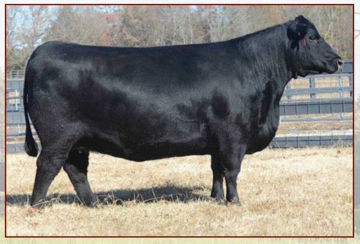
CRAZY K RITA 4291 -$130,000 valued donor dam of Lot 6