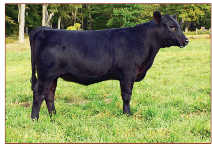
TVF FULL POWER REGIS 22 - Lot 43A