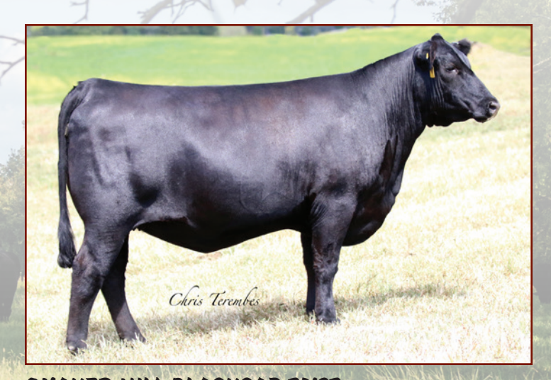
QUAKER HILL BLACKCAP 3N23 - Third dam of Lot 17

· Another high caliber heifer calf being offer by 6 Pastures Angus. H0632 is a direct daughter of GAR Quantum, the healing herd sire at Dalton's on the Sycamore and the proven donor 6V60. A dynamic combination and speed that she possess in her EPDs, supported by Marbling, Ribeye, and CW values that elevate her $B and $C indexes into the top 2% of the entire breed. This female represents the direction of the 6 pastures program, and has future donor potential.