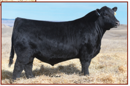
SQUARE B ATLANTIS 8060