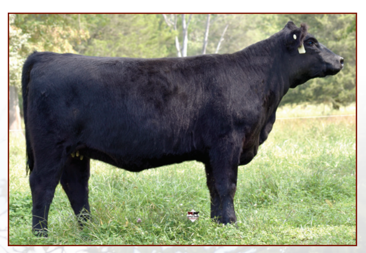
LOCUST HILL PRIMROSE G50 - Lot 24