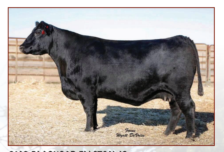
GMC BLACKCAP ELLSTON J2 - Dam of Lot 16

· Cutting edge genetics and a truly unique investment opportunity is being offered here, by GMC Farms. This young lady is a maternal sister to one of the hottest bulls in America, the now deceased Hoover No Doubt, and is sired by the legendary Confidence Plus. The $300,000 valued donor dam of this January heifer ranks in the top 25% for 15 different EPDs and dollar values, including the top 1% for docility, 4% $M, and $C. Additionally, in the 2018 Bases Loaded Sale, four frozen embryos sold for $40,000, while four pregnancies have sold at public auction, averaging $15,750 respectively. Hoover No Doubt bulls and females have been wildly popular, across the entire country, consistently bringing power and marketability to the forefront. This heifer brings a pedigree to the table that is not only dynamic, but extremely rare. A front pasture donor for many years to come.