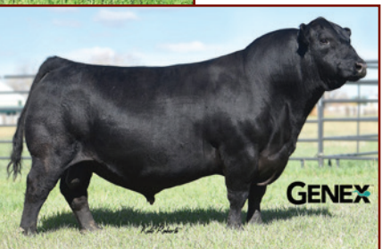
KG JUSTIFIED 3203