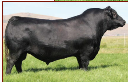
COLEMAN BRAVO 6313