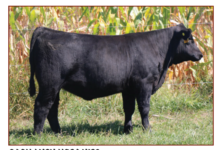
CASH LUCY HO24 Y122 - Lot 45A