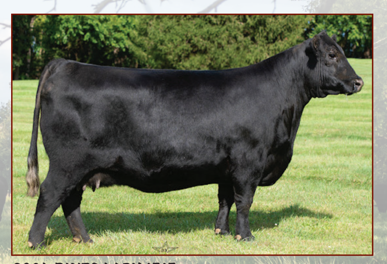
COOL PINES LADY 1515 - Donor dam of Lot 10

• 1515 is quickly proving herself to be an elite donor female for Cool Pines Farm and CJ Shelton, backing it up with an impressive resume, already generating nearly $70,000 in progeny and embryo sales. Sale topping offspring and banner winning females include Cool Pines GMC Lady 3159, a direct daughter that went on to be selected and the Grand Champion Bred and Owned female at the 2020 MAJAC show. As a show heifer. 1515 assembled a track record that includes Supreme Champion Female at the Maryland State Fair, and is out of Fancy Chance 65, the Grand Champion Female of the National Western Stock Show, in Denver, Colorado. Here is your opportunity to acquire show ring dominating and income producing genetics. You are bidding on a flush to the bull of your choice, that will guarantee you no less than five embryos, and a maximum of 10 embryos. The buyer assumes all costs associated with the flush.