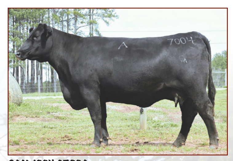
CAM 100X A7004 - Donor dam of Lot 9

• Cam 100X A7004 is a recent addition to the donor pen at GMC Farms, and represents a foundation building block for their future. This $25,000 female originates from the Gardiner Angus Ranch, and offers a balanced and powerful set of EPDs, uniquely combining growth and marbling, along with some of the industry's most elite. Selling 3 IVF embryos, guaranteeing 1 pregnancy.