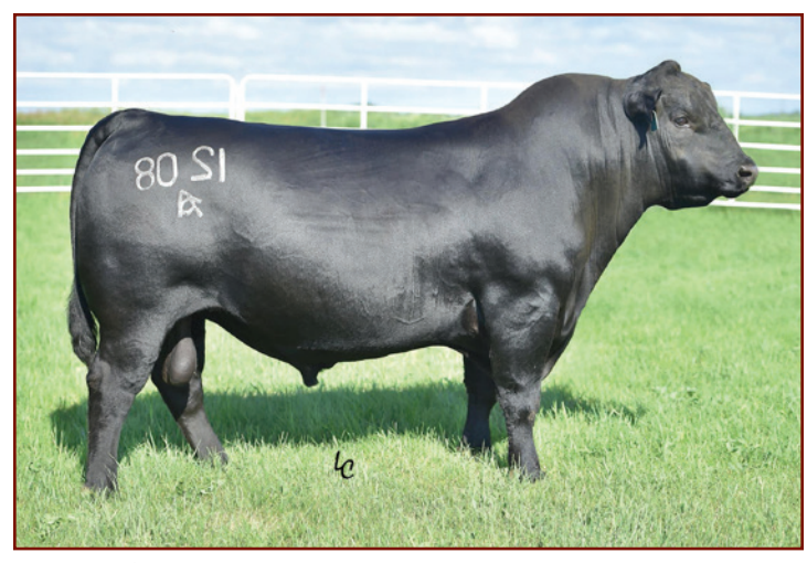
PA FULL POWER 1208 - Sire of Lot 41 & 43