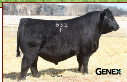
SITZ BARRICADE 632F