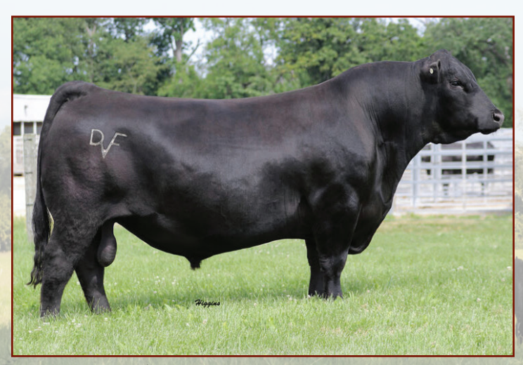
DEER VALLEY GROWTH FUND - Sire of Lot 27