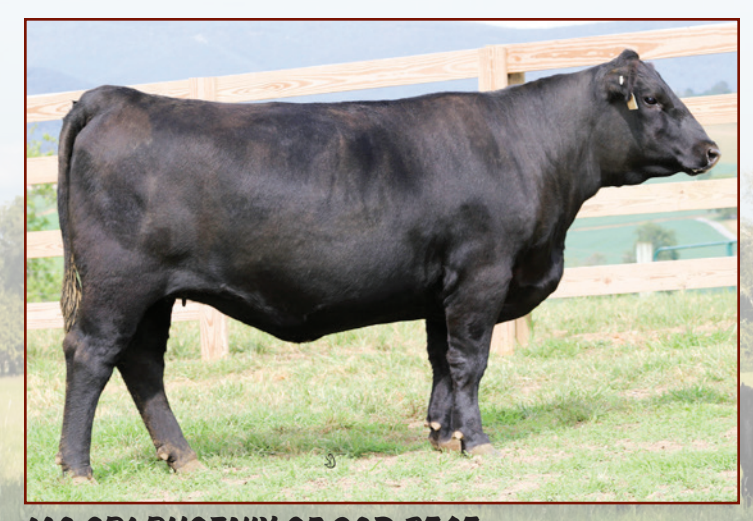
MA 9P1 PHOENIX OF GAR 3545 - Lot 33