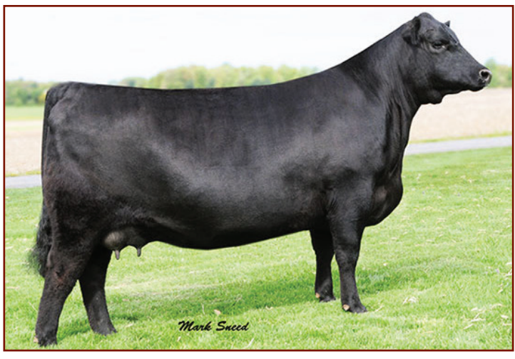
CHERRY KNOLL ELSA 8014 - Dam of Lot 42 and Grandam of Lot 44