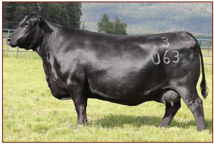
MILL BRAE FP JOANIE 3063 - Donor dam of Lot 4