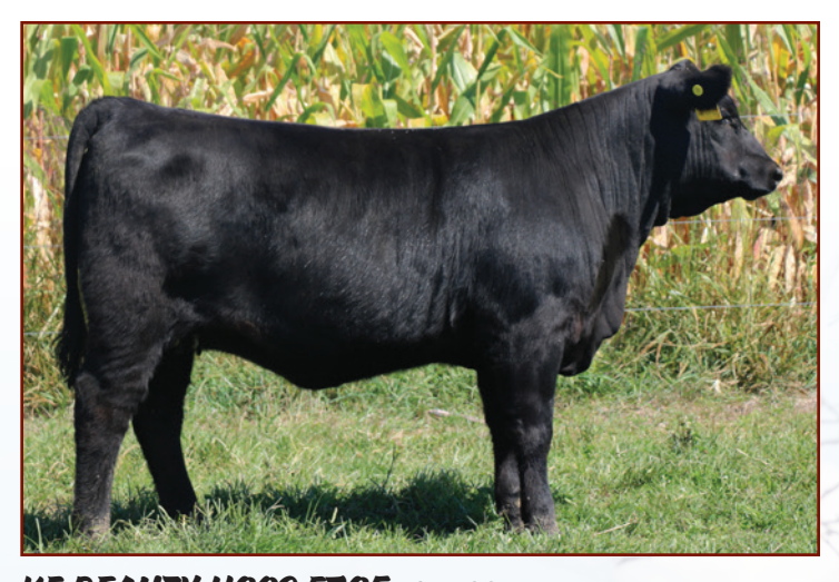
KF BEAUTY H002 E705 - Lot 22