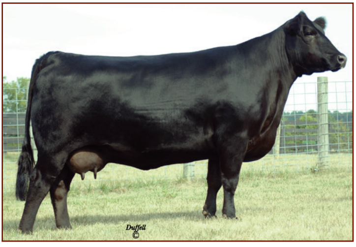
C Q S GEORGINA 4005 - Dam of Lot 40