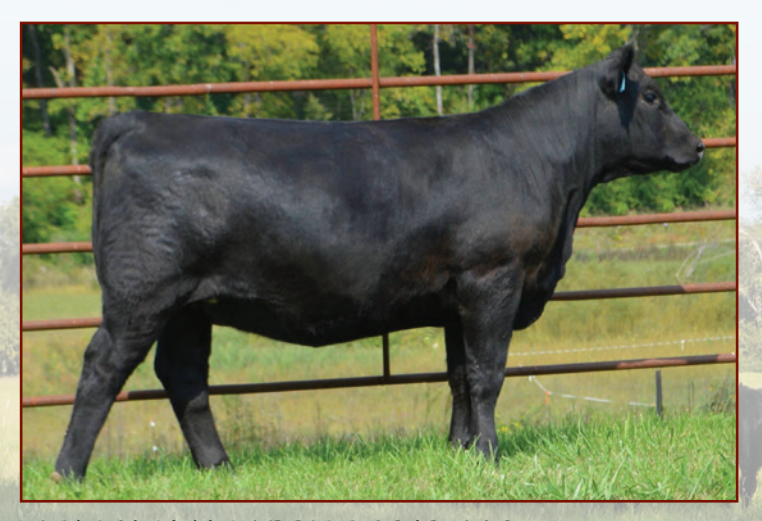
MEADOW LAWN PRIDE 6373-002 - Lot 20

• Another outstanding show heifer prospect her from Mc Livestock. This January daughter of C&C Priority is out of an SAV First Class daughter and offers an eye catching package that combines both femininity and power, in a sound and functional package. The mother of this female is a full sister to the Top Tok female that Mc Livestock sold to Prairie View Farms in Illinois, and has been an influential piece in the sustained success. Nationally recognized cow families and programs are highlighted throughout the pedigree of this exciting young prospect.