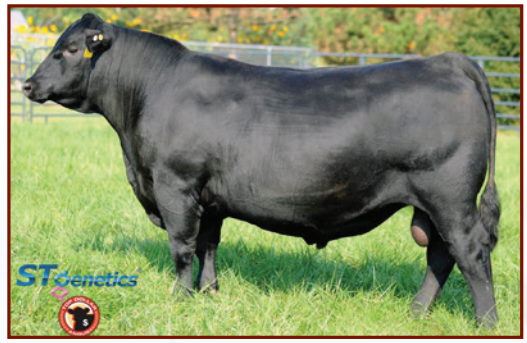
KCF BENNETT EXPONENTIAL-$119.000 lead off bull of the Spring 2020 Knoll Crest Sale going to ST Genetics!