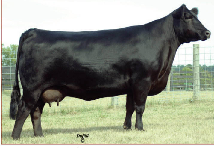
C 0 S GEORGINA 4005 - Grandam of Lot 28

• A super complete show heifer prospect from Buchanan Cattle Enterprises. This halter broke female has the structural integrity, style, and balance to compete with the very best, at the nation's toughest shows. A035 is a granddaughter of the dominating, and highly proven Georgina 4005, who has produced numerous champions at the NJSA Eastern Regionals, Virginia State Fair, Virginia Breeders Show, VCCP, and the Virginia Beef Expo.