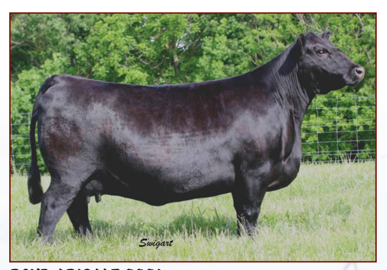
BOYD ABIGALE 0001 - Legendary grandam of Lot 38

One of the most powerful and impressive first calf heifers that you'll have an opportunity to purchase this fall. This Conversation daughter is gorgeous from the side and packs a powerful punch with muscle, spring of rib, and substance. This young cow is by one of the most impressive front pasture cows that you will ever see, and has a very bright future. She sells with a bull calf, sired by the SAV calling ease specialist, Rainfall, born on 9/4/20