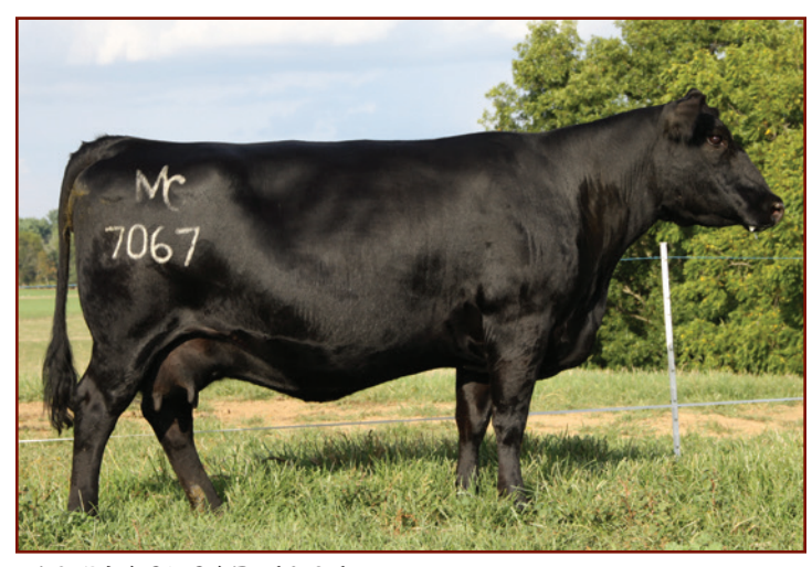
MC BLACKCAP 7067 - Grandam of Lot 34

• This daughter of the popular and now deceased trait leader Conneally Confidence Plus, comes to you from Mc Livestock. This eye catching two year old exemplifies phenotype, structural soundness, and longevity, while ranking amongst the breed's best for CED, BW, and $M. This tremendous pedigree offers versatility and marketability to the highest degree and comes in a package that is pleasing to look at. She sells with a heifer calf sired by Ellingson Homegrown, and was born on 9/18/20.