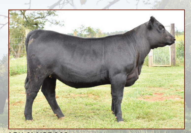
LPH CLAIRE 963 - Lot 30

• 963 is an outstanding yearling heifer and direct daughter of the $450,000 SAV Raindance, who haas dominated semen sale for ST Genetics. This long-spined, powerfully constructed female stems from a highly productive TC Total 410 daughter that has ratios of 97 for BW and 100 For YW, and posted individual ratios of 99 and 103 for BW and WW, respectively, all while maintaining 11 different performance traits that rank in the top 35% percent of the breed. This heifer was a little camera shy, you'll want to make sure you see her in person on sale day, she is impressive. 50K data will be available on sale day.