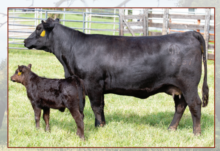
MYSTIC HILL 8057 - Lot 36

• If front pasture cows are the kind that you're looking for, then you'll love this photogenic first calf heifer that's sired by the maternal minded Regis, that derives from Coleman Angus in Montana. This sleek fronted female brings femininity to the forefront, is backed by a time tested pedigree and set of easy calving, maternally oriented traits, with CED, CEM, Claw, and $W values all ranking in the top 15% of the breed. She sells with a heifer calf sired by one of the nation's most popular calving ease and maternal sires, Basin Rainmaker 4404, and was born on 8/19, with a birthweight of 50 pounds.