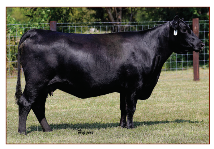
QUAKER HILL BLACKCAP 4EX1 -$50,000 dam of Lot 18