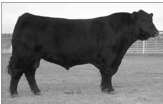
WCC SPECIAL DESIGN L309 - Sire of Lot 1.

Owned by Blackacre Cattle Co., Warsaw, MO.