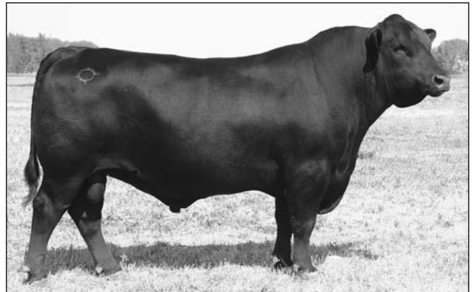
MYTTY IN FOCUS - Service sire to Lot 29.

Jordans Sara Belle 9607 is a really nice Mission daughter out of a WAR Alliance dam. She is bred to Jordans Alliance 12807 who has EPDs of +65 Weaning and +109 Yearling. This is a large but very feminine heifer. She is bred to perform.