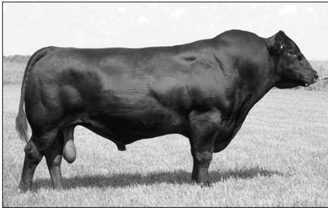
WOODHILL FORESIGHT - Sire of Lot 60.

Owned by Henson Angus, Bourbon, MO. This calf's sire is out of the Shetley Angus herd bull, SHAF Refocus, which is a 7-frame bull, so she should grow out to be a nice big cow. The dam is also a 7-frame cow that does well on fescue.