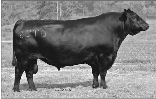
SS OBJECTIVE T510 OT26 - Service sire to Lot 80.