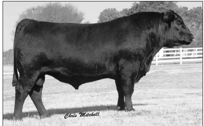
DR J ANALYST M250 - Service sire to Lot 86.

Owned by McBride Angus, Centralia, MO. This heifer is sired by Sydgen E161 Precision 3037 and is AI bred 6/14/08 to Dr. J Analyst and pasture bred to our junior herd sire, Sydgen Nobleman 7041. Will calve by sale day.