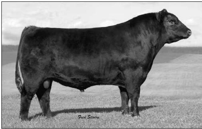
B/R NEW FRONTIER O95 - Sire of Lot 81.

Owned by Shawnee Winds Angus, Jefferson City, MO. Ranks in the top 10% YW and $F, top 15% CED, WW and Milk, and top 20% $W. AI bred to SydGen Turbo, the 2008 Missouri State Fair Grand Champion bull. Ultrasound pregnancy check indicates a heifer calf due 9/6/09.