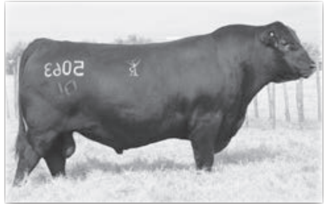
BAR R JET BLACK 5063 - Service Sire of Lot 40