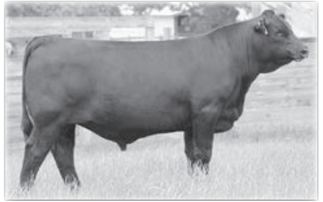
SPRINGFIELD RAMESSES 6124 - Service Sire of Lot 25