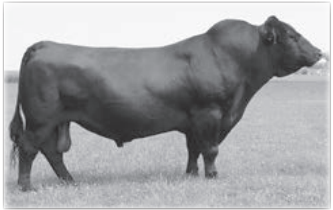
QUAKER HILL RAMPAGE 0A36 - Sire of Lot 15