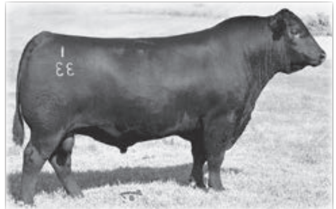
CONNELLY BLACK GRANITE - Sire of Lot 21

A first calf heifer sired by Mill Bar Hickok 7242. I did not plan to offer this female and she does not yet have EPDs. She should have genomic enhanced EPDs by sale day. She has a 1/29/20 bull calf (BW: 82#) at side sired by VAR Reserve 1111.