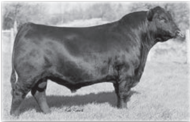
WERNER FLAT TOP 4136 - Sire of Lot 20A