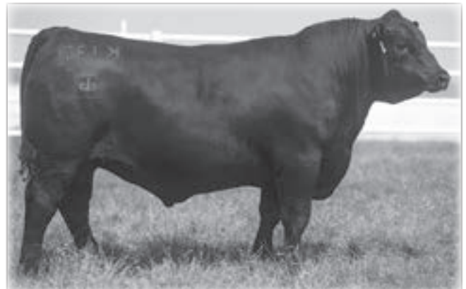
GAR BONFIRE - Service Sire of Lots 38 & 39

A thick made daughter of Bankroll out of a Final Answer daughter. She was bred to G A R Bonfire on 12/11/19.