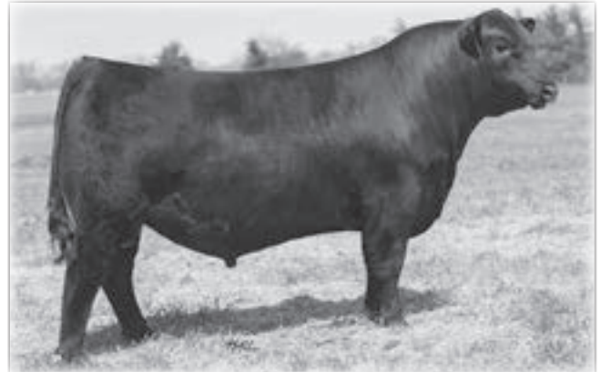
BARSTOW BANKROLL B73 - Sire of Lots 38 & 39

A really good Bankroll daughter from a 12-year-old 1407 daughter. She was bred to G A R Bonfire on 1/3/20.