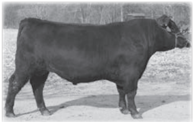
TAF PATRIOT T638 - Lot 5

A big spread, very attractive Patriot son. This double-digit calving-ease bull offers plenty of growth. Recording top 15% or better for CED, WW, YW, YH, Milk, RE, Fat and $W. T638 sells Halter Broke, BVD-PI negative, and HD50K'd.