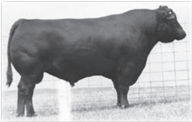
QAS TRAVELER 23-4 - Sire of Lot 41