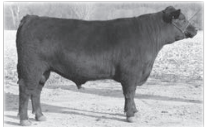
T A F TEN X T1238 - Lot 9

A stout, thick Ten X grandson out of the popular Blackcap cow family. T1238 ranks in the top 15% or higher of the breed in WW, YW, RADG, SC, HP, Marb, $G, & $B. He sells Halter Broke, BVD - PI negative, and HD50k'd.