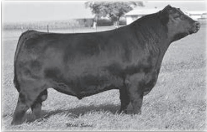
EATHINGTON SUB-ZERO - Sire of Lot 37