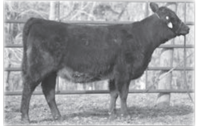
TWOF IRIS 9827 - Lot 52