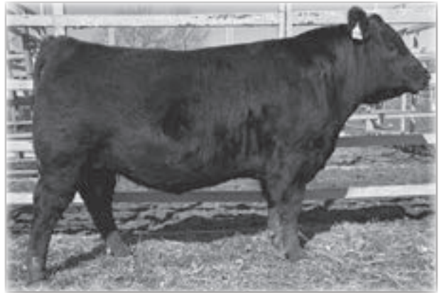
HA JET BLACK 905 - Lot 10

This Fortress son ranks in the top 25% or better for CED, BW, WW, YW, RADG, Milk & $W. T738 is a calving ease bull that offers plenty of growth and can be a great addition to anyone's herd. He sells Halter Broke, BVD-PI negative and HD50k'd.