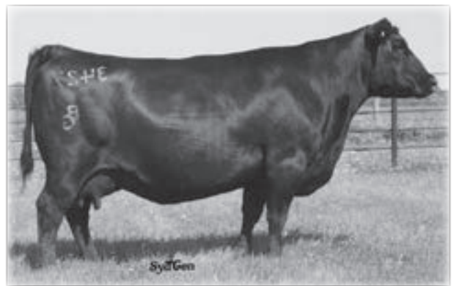
BIRKGEN ERICA 3427 - Dam of Lot 34

Black Onyx is full of performance and has a docility EPD of 31. This calf has all kinds of thickness and should make a great breeding bull.