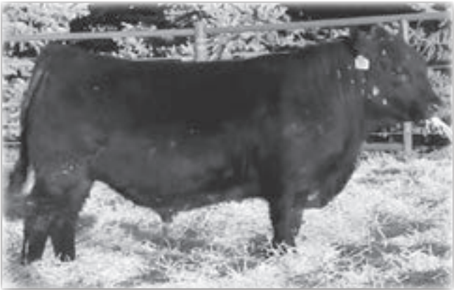
CARLSON COWBOY UP 7093 - Lot 1