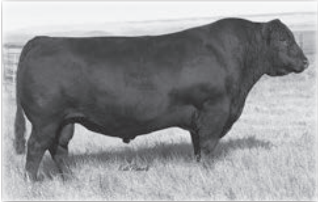
SYDGEN ENHANCE - Sire of Lot 13

A first calf heifer sired by S A V Renown 3439. Her dam was a productive female for Don Schoene where she posted an average weaning ratio of 108 on 4 calves. She is a moderate made female that should have an exceptional udder. Sells with a 3/3/20 bull calf (BW 70#) sired by B/R New Frontier 095.