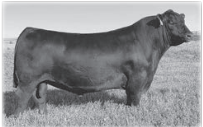
S A V RAINDANCE 6848 - Sire of Lot 14A

Her dam posts ratios of 106 for WW and 117 for YW, this female will make a good productive cow. Sells with a 3/25/20 heifer calf at side sired by Butchs Insight D301.