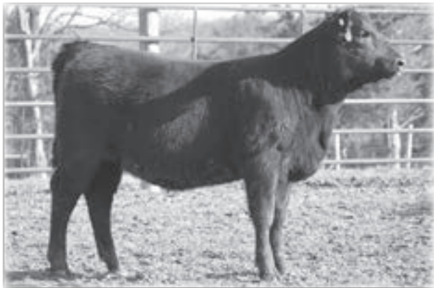
TWOF FOREVER LADY 9918 - Lot 53