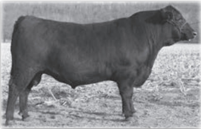
T A F FORTRESS T738 - Lot 7