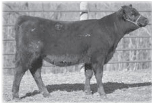
TWOF SARAH 9101 - Lot 54