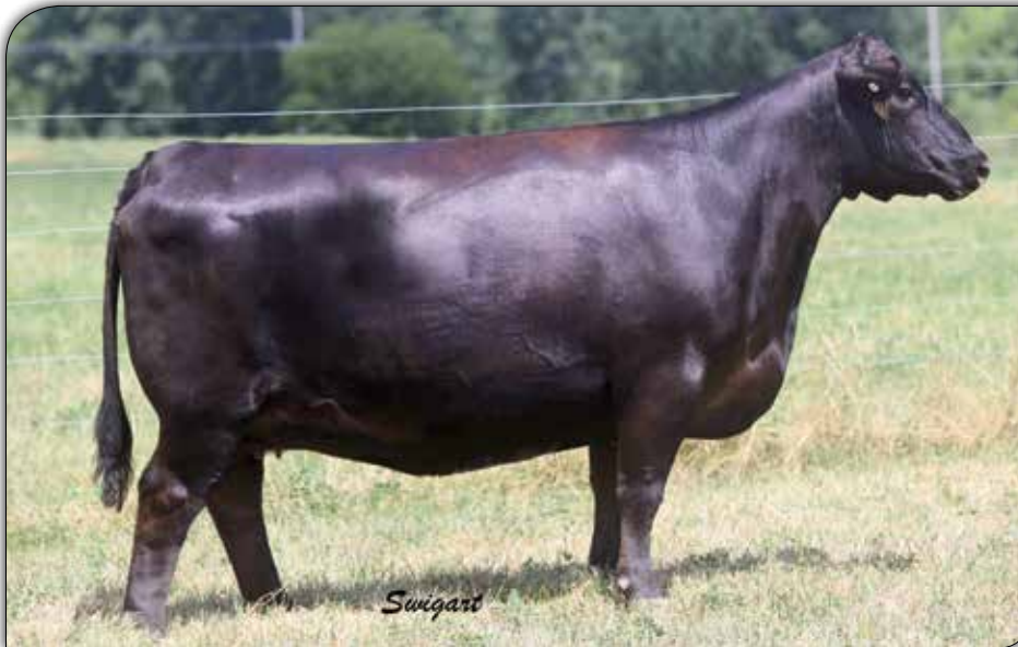
DOUBLE R BAR LADY X104 - Dam of Lot 26.