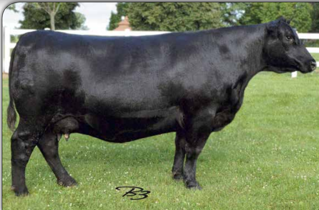
R B LADY STANDARD 305-0790 - The $55,000 dam of Lot 3.