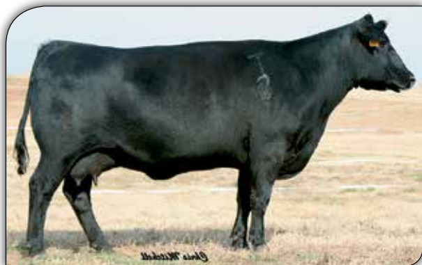
BT EVERELDA ENTENSE 55D - Grandam of Lot 30.