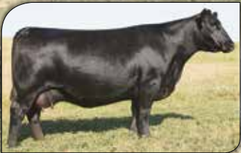
SAV BLACKCAP MAY 5530 - A full sister to the dam of Lot 13.

This genetic gem is a direct daughter of SAV Bismarck 5682 back to the featured Champion Hill May 4255, who is a full sister to SAV Blackcap May 5530, a leading donor female in the Schaff Angus Valley program that has tallied $1.7 million in receipts on 64 direct progeny and has multiple AI sons on her resume including the $180,000 SAV Regard 4863, the $260,000 SAV Cutting Edge 4857 and the GENEX Beef AI sire, SAV Priority 7283. Donor dam has a progeny production record of WR 4@107, UREA 12@101. Bred to calve December 23, 2018 to SAV Final Answer 0035. Examined Safe.