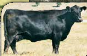
N BAR PRIMROSE 2424 - The $100,000 fourth-generation dam of Lot 31.

BLACK GOLD PRIMROSE 5004 She sells as Lot 31.