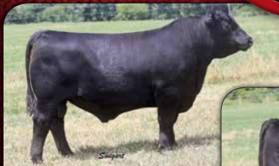
DOUBLE R BAR RAMPAGE E247 He sells as Lot 1.