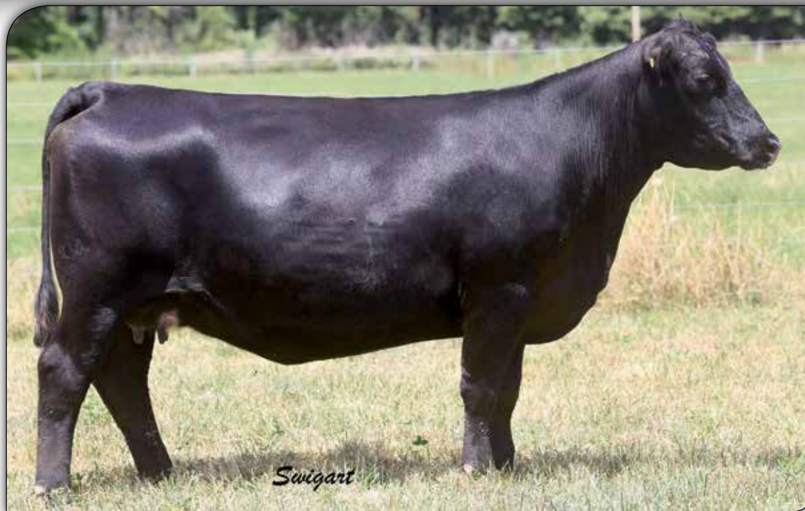
LAWSONS ELBA C683 - She sells as Lot 16.