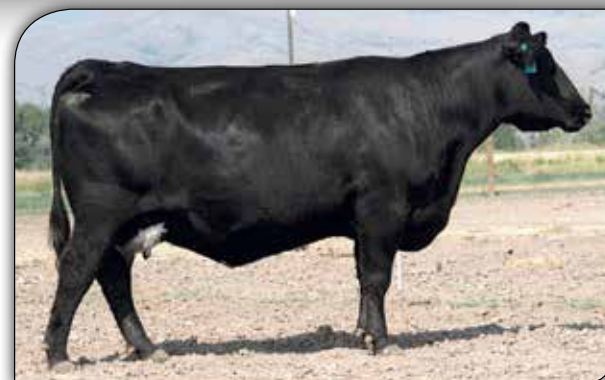
SITZ MISS BURGESS 1591 - Dam of Lot 37.