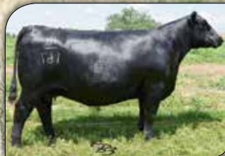
RB LADY PARTY 167-305 - The $300,000 valued grandam of Lot 2.