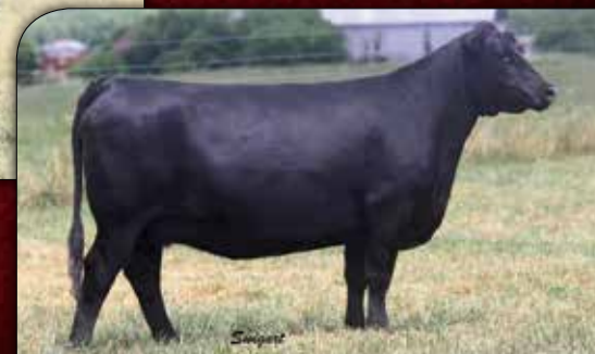
DOUBLE R BAR RITA C300 - She sells as Lot 19.