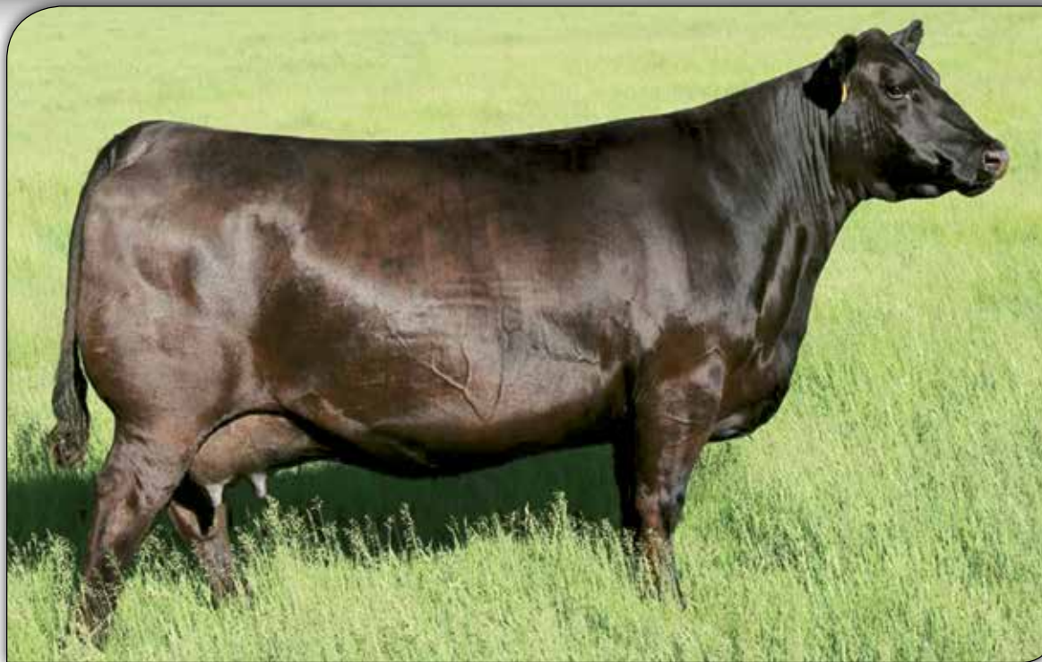
SAV ABIGALE 5650 - The $375,000 full sister to the dam of Lot 10.