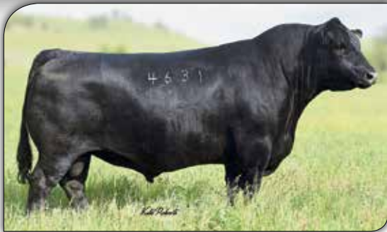
3F EPIC 4631 - Reference Sire B.