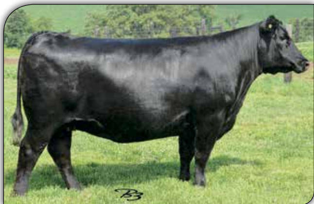
RB LADY STANDARD 7125-890-2170 - The $64,000 full sister to the dam of Lots 1-1D.