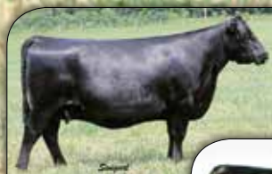
SAV ABIGALE 7001 - Dam of Lot 8.