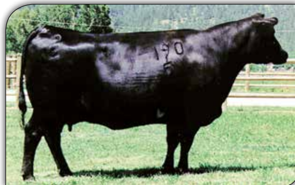
SITZ EVERELDA ENTENSE 1905 - Third-generation dam of Lot 30.