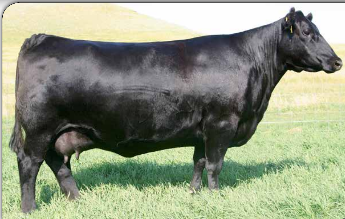
SAV BLACKCAP MAY 5403 - Dam of Lot 14.