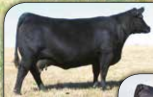
SAV ELBA 4436 - The $20,000 grandam of Lot 15.