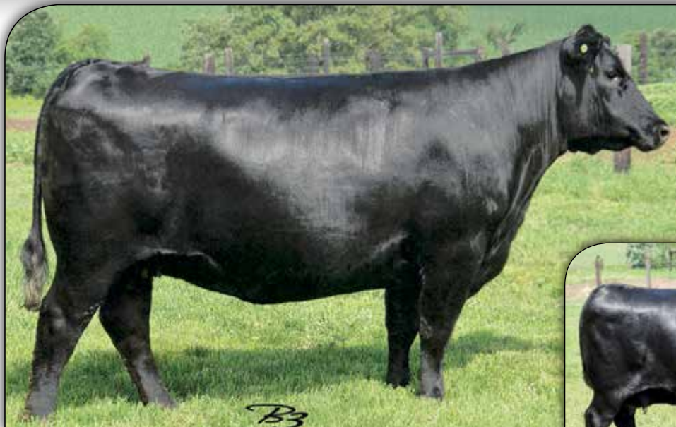
RB LADY 890-116 - The $80,000 full sister to the dam of Lots 1 through 1D.