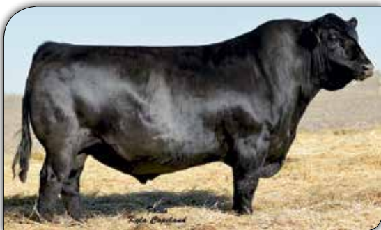
BASIN PAYWEIGHT 1682 - Reference Sire C.