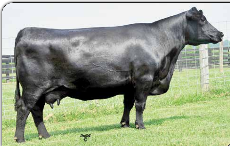
SINCLAIR LADY 2P61 4465 - The $110,000 grandam of Lot 28.