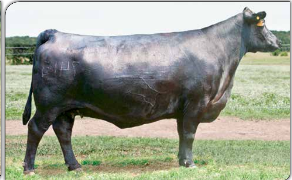
IDEAL 7415 OF 1418 4465 - The $60,000 grandam of Lots 26 and 27.