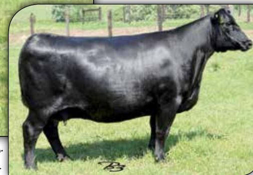
RB LADY 7125-890-2170 - The $64,000 valued dam of Lots 1 through 1D.