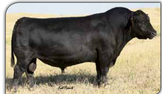
QUAKER HILL FIRESTORM 3PT1 - Reference Sire G.