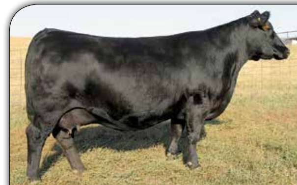
SAV BLACKCAP MAY 2611 - A maternal sister to Lot 14.