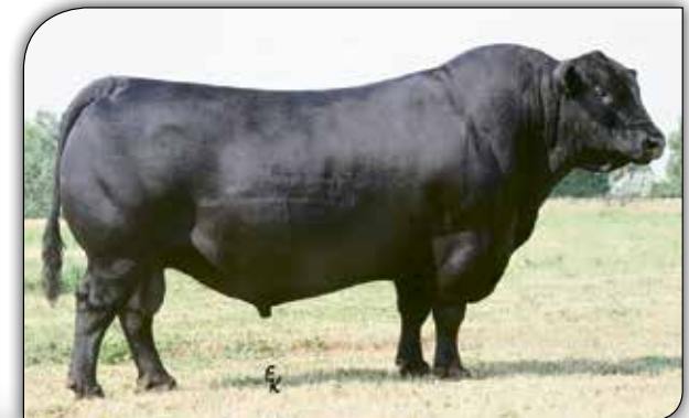
SAV FINAL ANSWER 0035 - A maternal brother to the grandam of Lot 24.