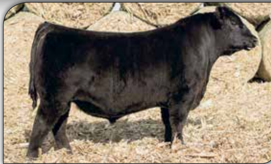
JINDRA ACCLAIM - Reference Sire D.