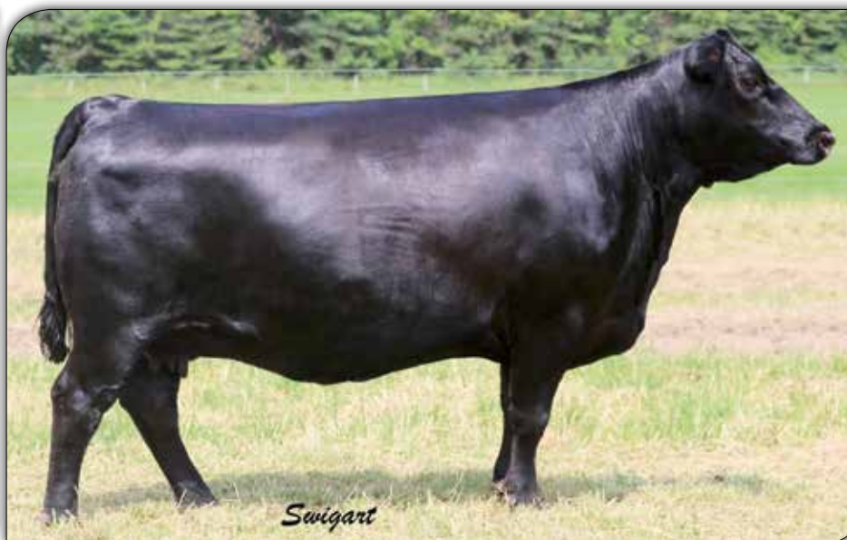
SDCC LADY 100U - She sells as Lot 29.