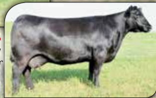
SAV BLACKCAP MAY 4136 - Full sister to the dam of Lot 11 and grandam of Lot 12.

DBL R BAR BLACKCAP MAY E328 She sells as Lot 12.