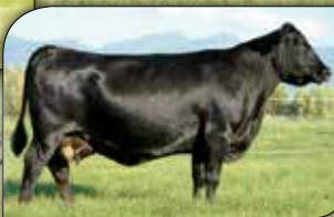
SINCLAIR ERISKAY 2N1 7883 - The $23,000 full sister to the grandam of Lot 18.

DOUBLE R BAR ERISKAY Z194 Dam of Lot 18.