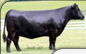
QUAKER HILL BLACKCAP 0A32 - The $500,000 maternal sister to the dam of Lots 4 and 4A.