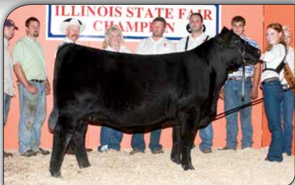
CF TOP LINE LADY 814 - Third-generation dam of Lot 34.