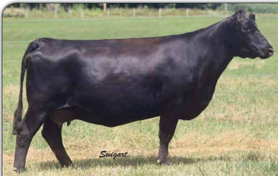
SEVEN T RITA 3041 - She sells as Lot 20.