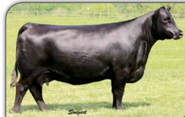
SAV ELBA 910 - The $40,000 maternal sister to the dam of Lot 16.