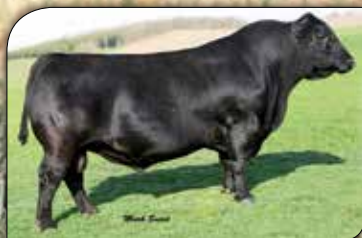
SAV THUNDERBIRD 9061 - Sire of Lot 19.