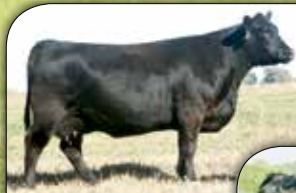
SITZ HENRIETTA PRIDE 1510 - The $105,000 record-selling grandam of Lot 17.