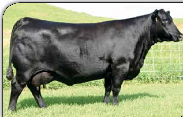
SAV ELBA 1094 - The $100,000 grandam of Lot 16.