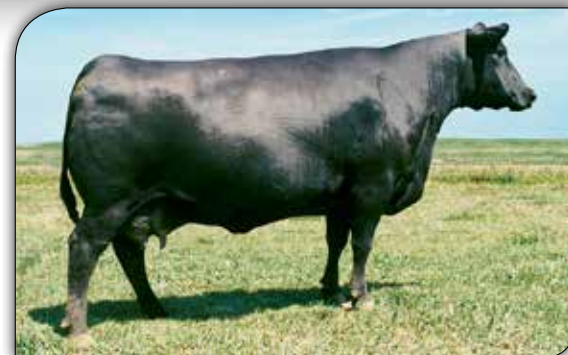
BT EVERELDA ENTENSE 57D - Maternal sister to the grandam of Lot 30.

30 TANNER EVERELDA 2753 [OSF] Birth Date: 10-27-2012 Cow 17477487 Tattoo: 2753