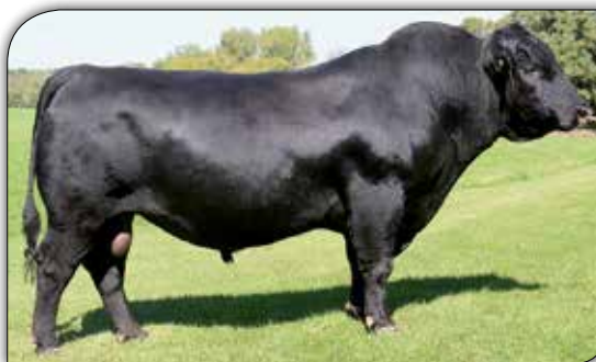
QUAKER HILL RAMPAGE 0A36 - Reference Sire E.