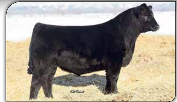
STEVENSON TURNING POINT - Reference Sire F.