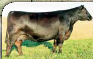
SAV ABIGALE 7006 - A full sister to the dam of Lot 8.