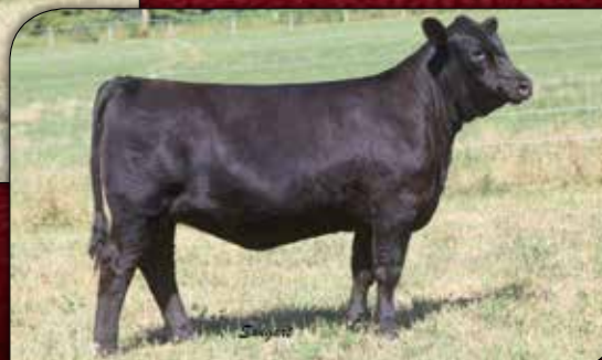
DOUBLE R BAR BLACKCAP MAY E345 - She sells as Lot 11.