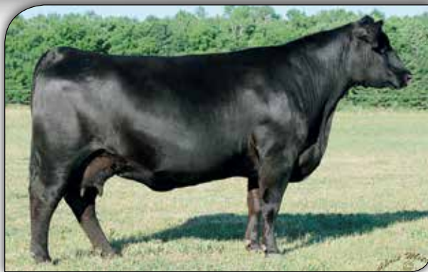
SAV ABIGALE 4317 - Dam of Lot 9.