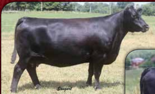
CHAMPION HILL MAY 8011 She sells as Lot 13.