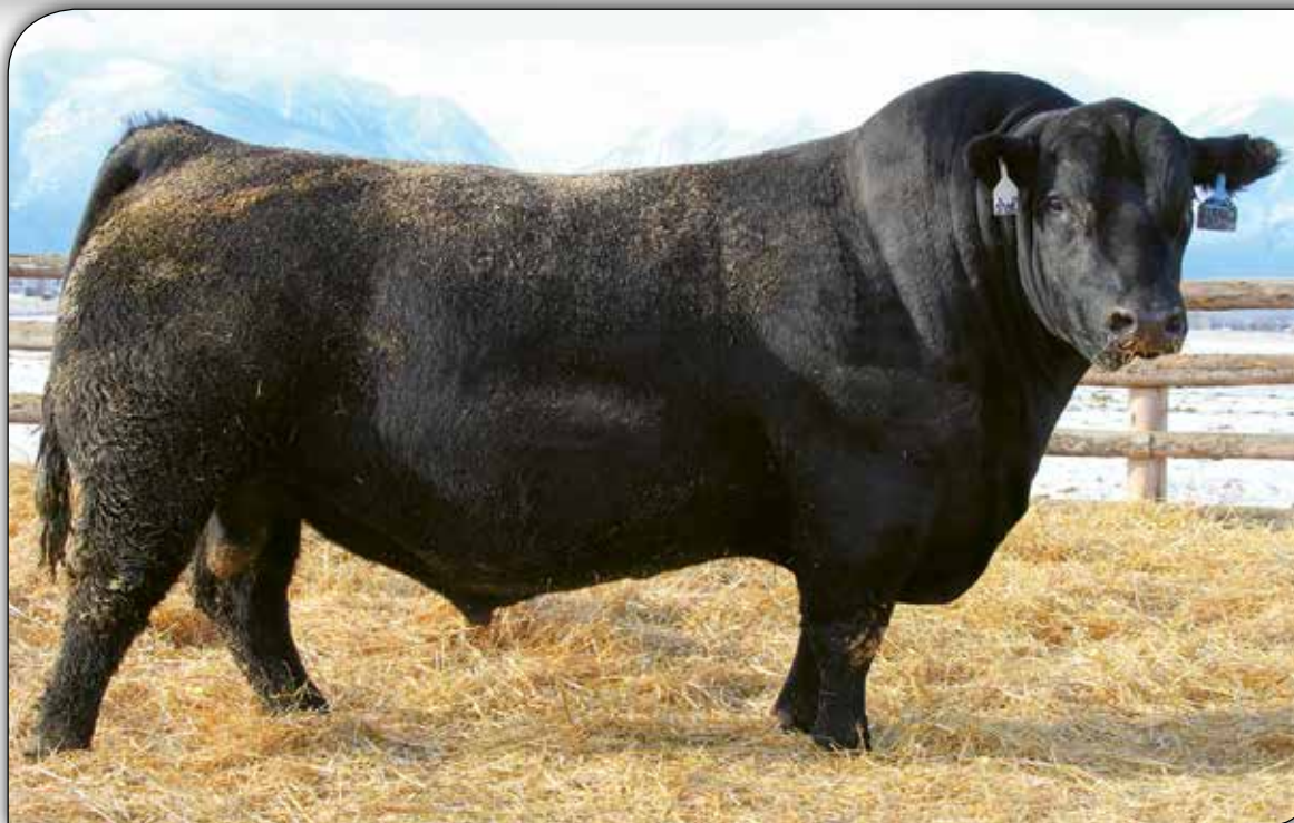
COLEMAN CHARLO 0256 - Maternal brother to Lots 6 through 7.