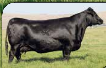
COLEMAN ABIGALE 0277 - Maternal sister to Lots 6 through 7.

SELLING CHOICE OF LOT 6 OR 6A. • Unique combination of two herd sire producing females in this pedigree: Bohi Abigale 6014, who is the mother of the Accelerated Genetics AI sire, Coleman Charlo 0256, and QHF Blackcap 3E2 of4V16 4355 blend for powerful genetics. • Dam has a progeny production record of %IMF 13@102, UREA 13@104 and stems back to the legendary SAV Abigale 6062 who has produced over $2.4 million in progeny sales to date and on 14 sons has averaged $175,785. • Whitestone Abigale 814A, a maternal sister, was the $16,000 feature through a past Whitestone Farm sale going to Long Lane Farm of Tennessee.