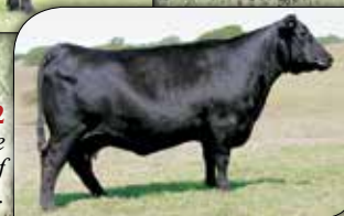
QH BLACKCAP 6E2 OF4V16 4355 - The $150,000 grandam of Lots 4 and 4A.