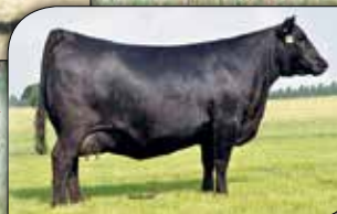
BUFORD ELBA 9000 - The $60,000 full sister to the dam of Lot 15.