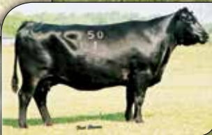
SITZ HENRIETTA PRIDE 501 - The $250,000 third-generation dam of Lot 17.