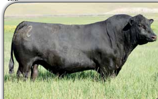
SITZ RAINMAKER 9723 - Maternal brother to Lot 37.