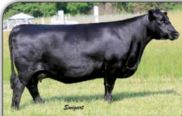
DOUBLE R BAR LUCY X212 - Dam of Lot 24.