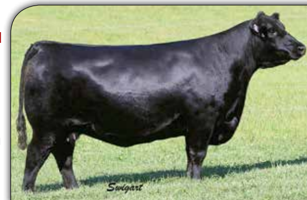
R B LADY STANDARD 305-02 - The $120,000 full sister to the dam of Lot 3.