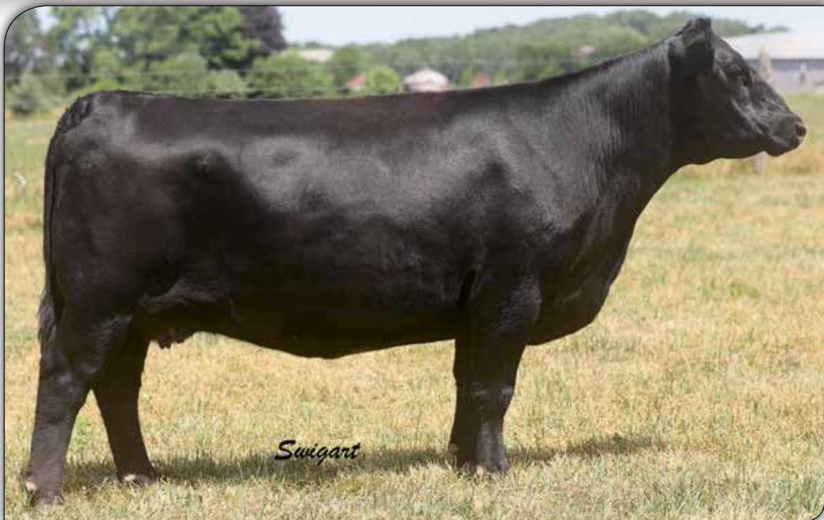
TANNER EVERELDA 2753 - She sells as Lot 30.