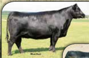
W C C PRIMROSE J237 - The $160,000 valued third-generation dam of Lot 31.