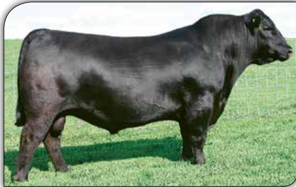
SAV BISMARCK 5682 - A maternal brother to the dam of Lot 10.