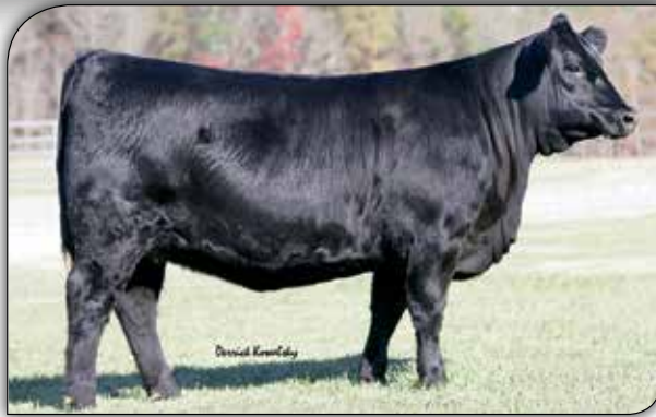
SH LUCY 7323 N747 - Dam of Lot 22 and 23.