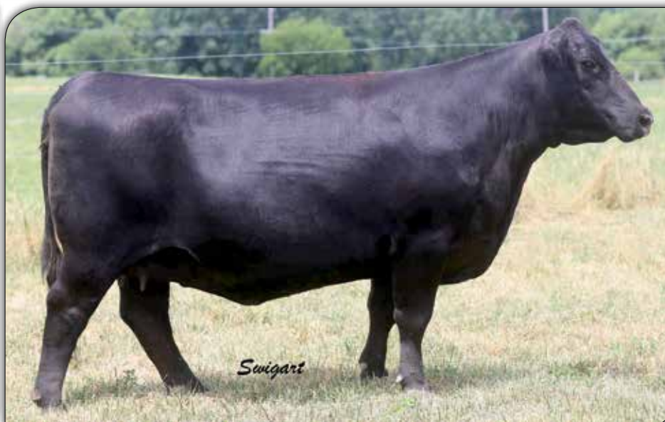
SHADY BROOK RITA 1042 - She sells as Lot 21.