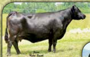
SINCLAIR ERISKAY 2C11 7883 - Grandam of Lot 18.