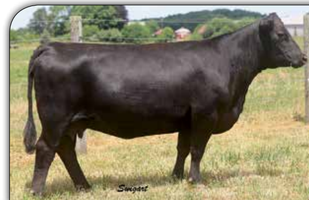
DOUBLE R BAR ABIGALE B107 - She sells as Lot 7.