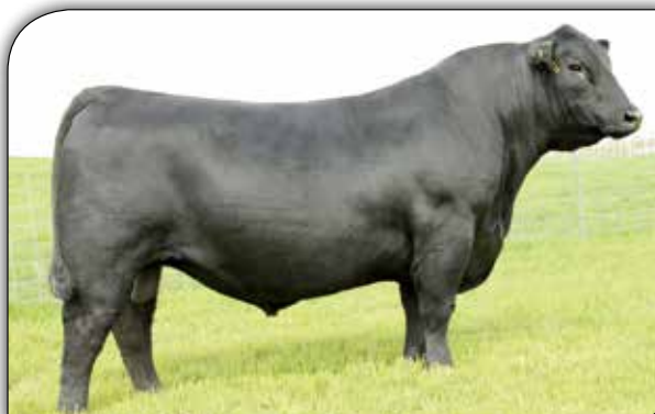
SAV BRAND NAME 9115 - The $156,000 full brother to the dam of Lot 13B.