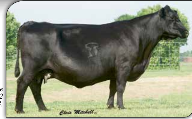
BASIN LUCY 178E - The $410,000 third dam of Lot 22 and 23.