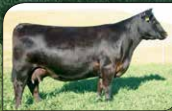
SAV EMBLYNETTE 7411 - The $150,000 dam of Reference Sire A.