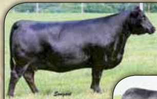
DBL R BAR BLACKCAP MAY Z118 The $45,000 dam of Lot 12.