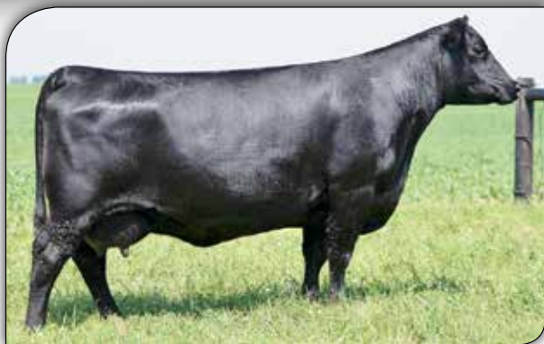
SAV ELBA 918 - Dam of Lot 16.