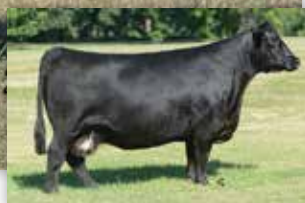
SILVEIRAS S SIS SANDY 2355 Dam of Lot 10.