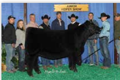
CMFM TIME TO SHINE 99D Grand Champion Female, '17 NAILE Simmental Show