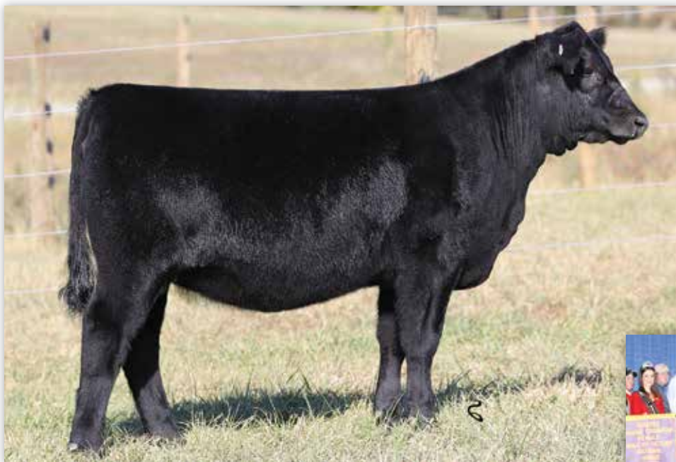
LOT 17 | DIECKMANN GEORGINA 9881