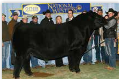
SC PAY THE PRICE C11 Sire of Lot 25.