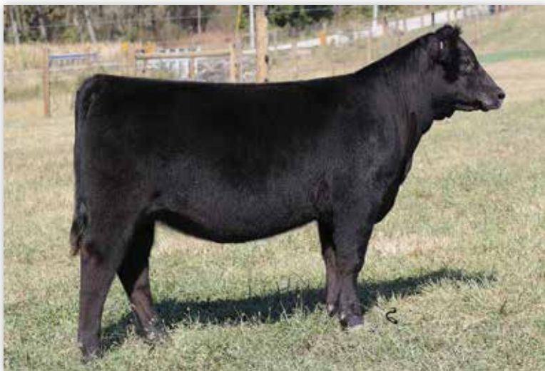
LOT 22 | DIECKMANN BLACKCAP 9713