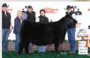
SANKEY'S ARKDALE PRIDE 606 Dam of Lot 18.