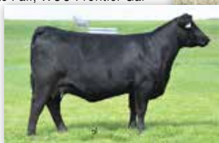
CONLEY WCC FRONTIER GAL 7776 Dam of Lot 19.

LOT 19 calved 3/3/19 cow 19544677 tattoo 9776 ANGUS