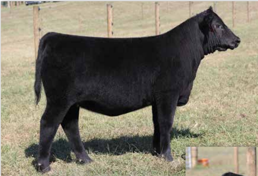
LOT 23 | DIECKMANN/BCR QUEEN 9024