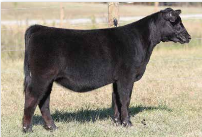
LOT 21 | DIECKMANN LADY JAYE 9614