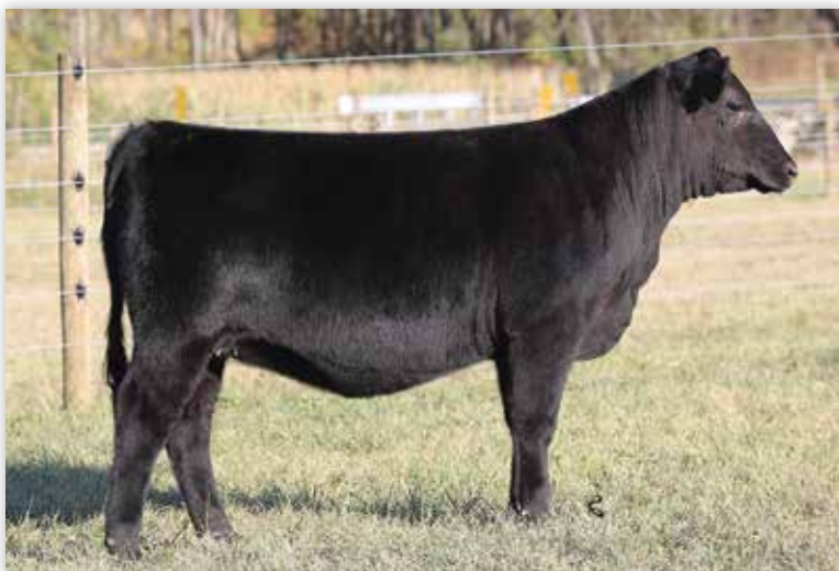
LOT 20 | DIECKMANN CHEYENNE 9320