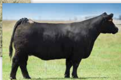
NMR WHISKEY KELLY ET Dam of Lot 29.