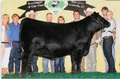
EXAR FOREVER LADY 1414 The 2012 NJAS Res. Grand Champion Female