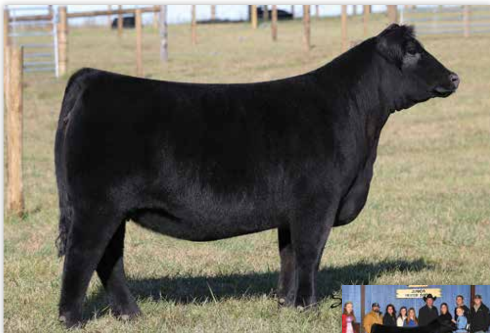
LOT 11 | CONLEY SANDY 8520