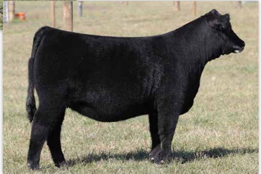
LOT 24 | DIECKMANN PROVEN QUEEN 9357