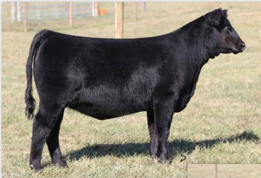
LOT 8 | DIECKMANN SANDY 9591