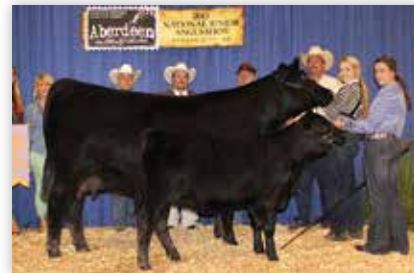
EXAR FOREVER LADY 1414 – The 2013 Res. Grand Champion Cow-Calf Pair of the NJAS and granddam of Lots 1-6.