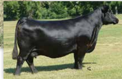
WOMACK MISS LUCY 011 Graddam of Lot 16.

LOT 16 calved 1/21/19 cow 19538733 tattoo 9888 ANGUS