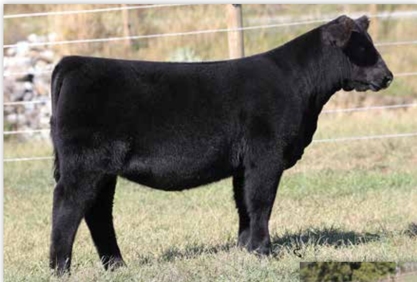
LOT 26 | DIECKMANN AMELIA 043G