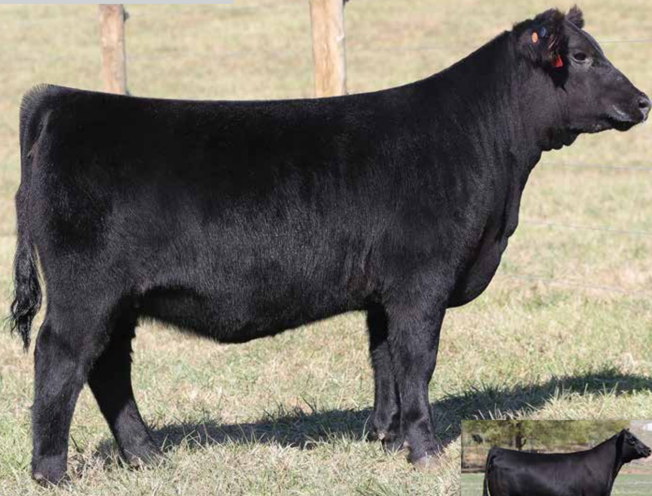
LOT 7 | DIECKMANN SANDY 9400