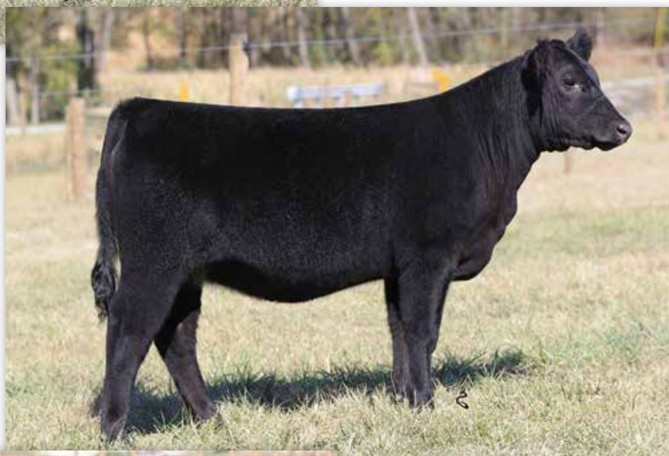
LOT 3 | DIECKMANN FOREVER LADY 9078