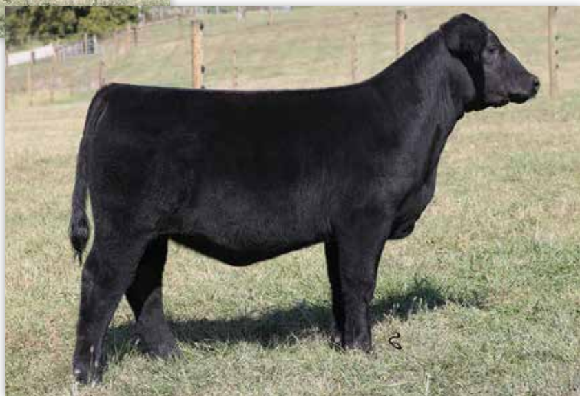
LOT 27 | DIECKMANN AMELIA 269G