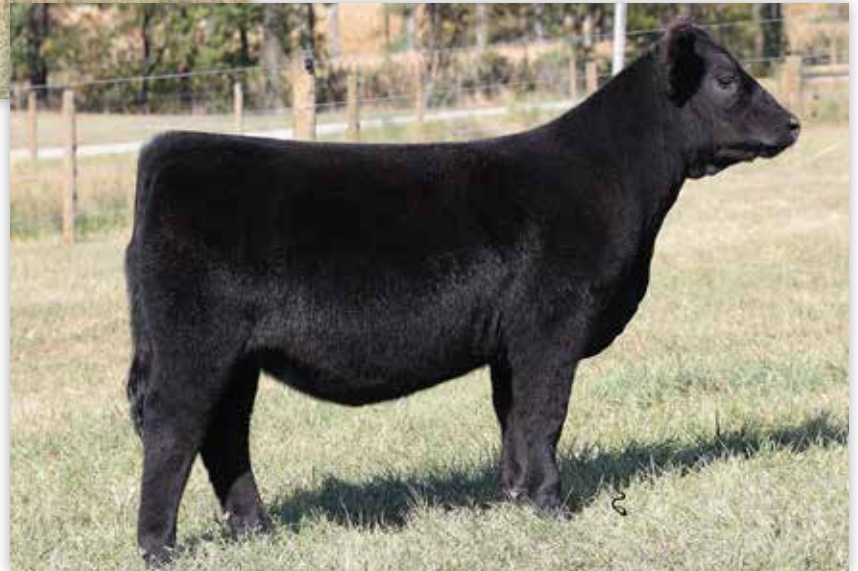
LOT 15 | DIECKMANN AMELIA 9791