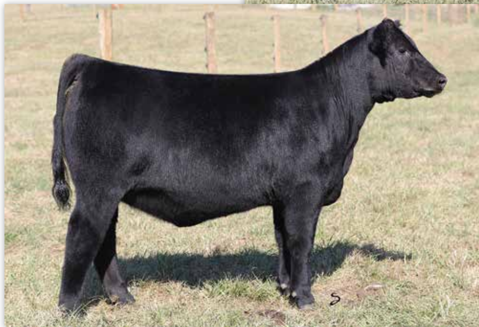
LOT 4 | DIECKMANN FOREVER LADY 9200