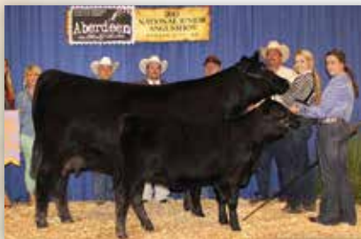
EXAR FOREVER LADY 1414 – The 2013 Res. Grand Champion Cow-Calf Pair of the NJAS and granddam of Lot 1.