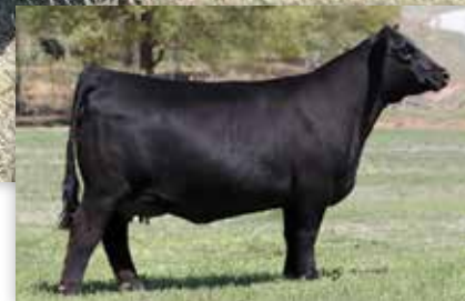
CONLEY SANDY 7271 Full sister to the Dam of Lots 7-9.

LOT 7 ANGUS calved 1/26/19 cow +*19537621 tattoo 9400