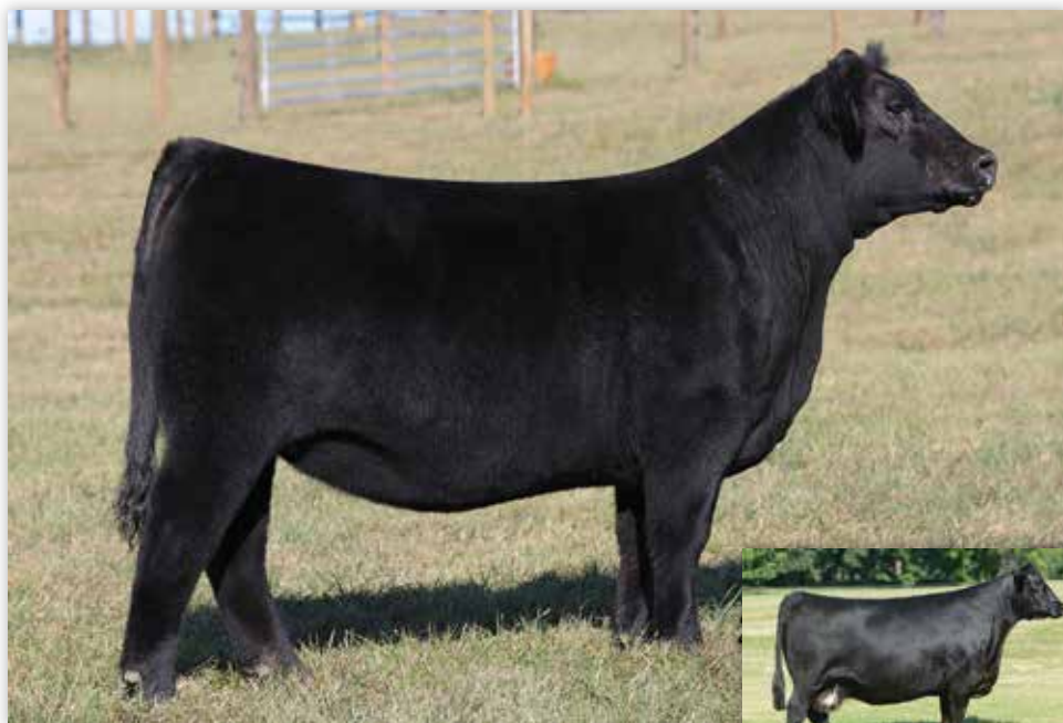
LOT 10 | CONLEY SANDY 8412