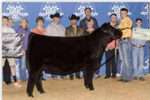
PF FIRST CLASS DOLLAY A351 Full sister to the grandam of Lot 13.