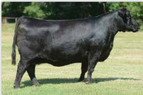
PR LADY 909 4200-587 Dam of Lot 12.