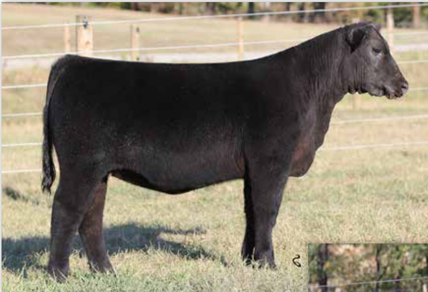
LOT 14 | DIECKMANN AMELIA 9155