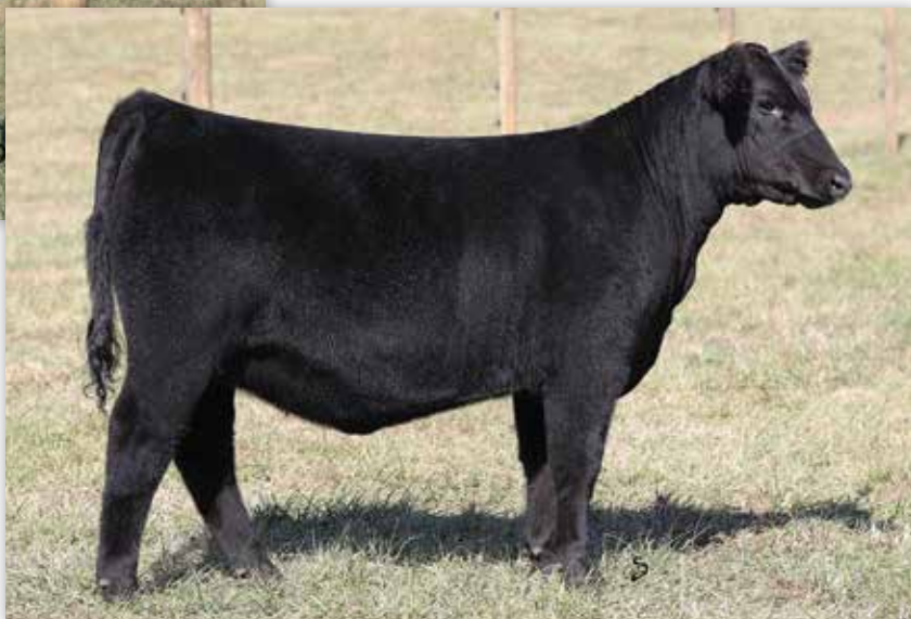
LOT 6 | DIECKMANN FOREVER LADY 9326

LOT 2 calved 4/22/19 cow +*19537627 tattoo 9429 ANGUS