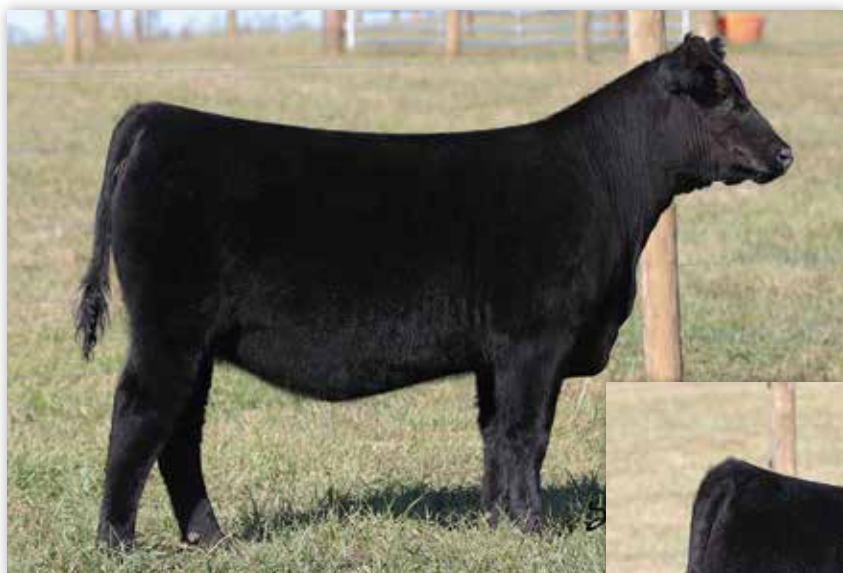
LOT 5 | DIECKMANN FOREVER LADY 9211