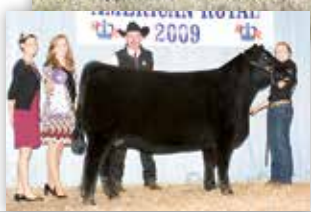
KNC CABIN CREEK SANDY 804 Dam of Lot 31.