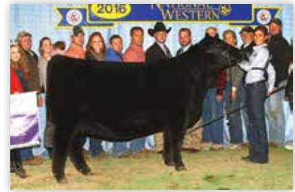
FCF PROVEN QUEEN 419 Maternal sister to the dam of Lots 23 & 24.