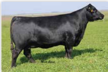
FCF SCC PVF Proven Queen 615 Granddam of Lots 23 & 24.