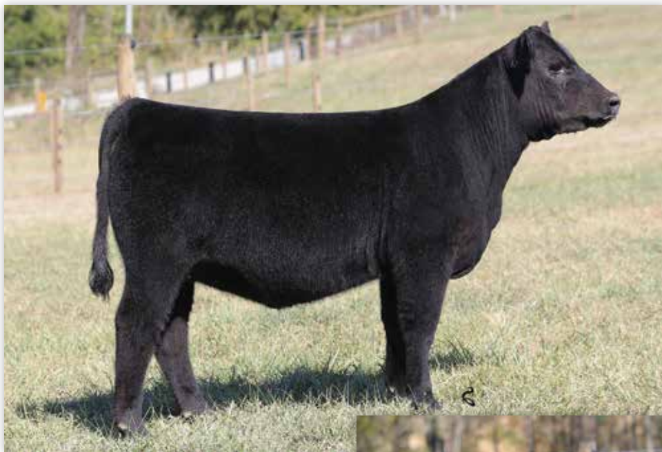
LOT 2 | DIECKMANN FOREVER LADY 9429