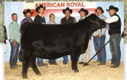
PR 3921 BF 909 The $113,500 American Royal Grand Champion 2014 Female and maternal sister to Lot 12.