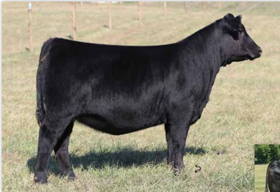
LOT 16 | DIECKMANN LUCY 9888