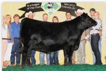
EXAR FOREVER LADY 1414 – The 2012 Res. Grand Champion owned female of the NJAS and granddam of Lots 1-6.