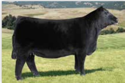
DPL SANDY 3040 Granddam of Lots 7, 8 & 9.