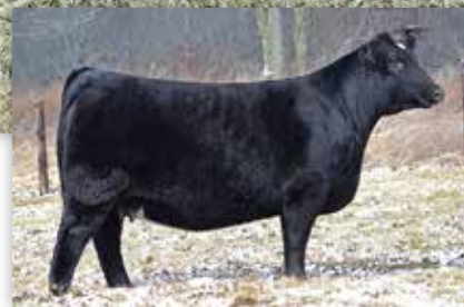
CMFM TIME TO SHINE 99D Dam of Lot 25.

LOT 25 calved 5/2/19 cow 3631664 tattoo 781G PB SIM