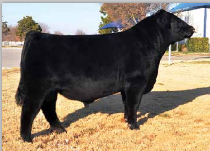
REF. D | EXAR BLUE CHIP 1877B