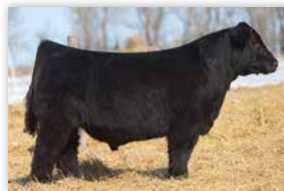
NMR MATERNAL MADE Sire of Lots 26 & 27.