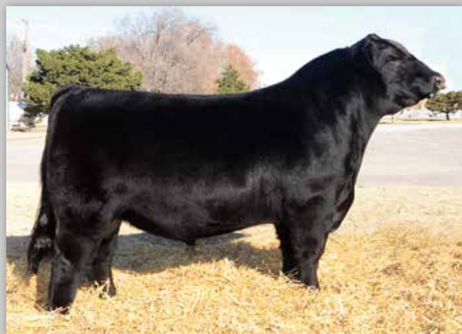
REF. E | S&R ROUND TABLE J328