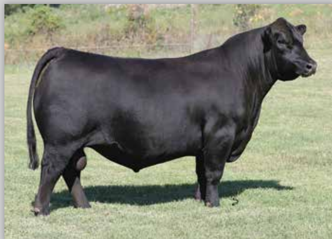
REF. C | STEVENSON TURNING POINT

REF C calved 1/21/16 bull 18434747 tattoo 60558 ANGUS PLATTEMERE WEIGH UP K360 *16692552 Sitz Upward 307R Barbara of Plattermere 337 SAV Bismarck 5682 FSHK Pride 180 Connealy Onward Sitz Henrietta Pride 81M GAR Retail Product Barbara of Plattermere 311 GAR Grid Maker SAV Abigale 0451 Sitz Alliance 6595 FSHK Pride 725