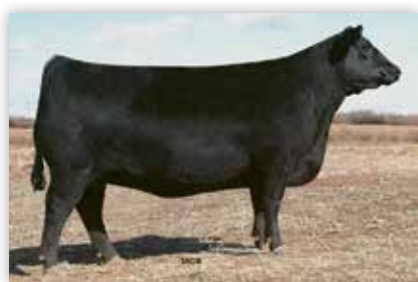
J&J Queen 414 Dam of Lots 26 & 27 stem from this cow family.