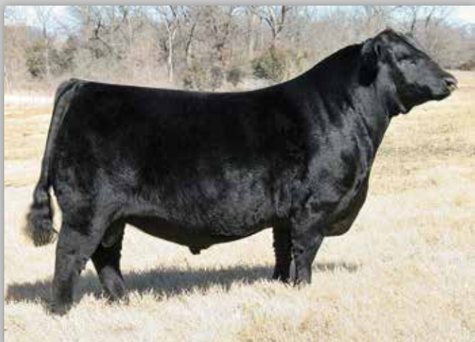
REF. B | 5T POWER CHIP 4790

REF B calved 2/13/14 bull 17956297 tattoo 4790 ANGUS 5T MISS WIX 8002 *16215091 BC Matrix 4132 Circle Oak Miss Wix 4014 EXG RS First Rate S903 R3 Dameron Northern Miss 3114 Greens Premium 7578 Greens Princess 7418 OCC Emblazon 854E CAF Pure Pride Ext.99 BR Midland Circle Oak Miss Wix 2050