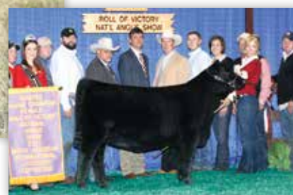
CHAMPION HILL GEORGINA 7945 A full sister to the dam of Lot 17.