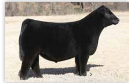
CONLEY EXPRESS 7211 Full brother to dam of Lots 7, 8 & 9.