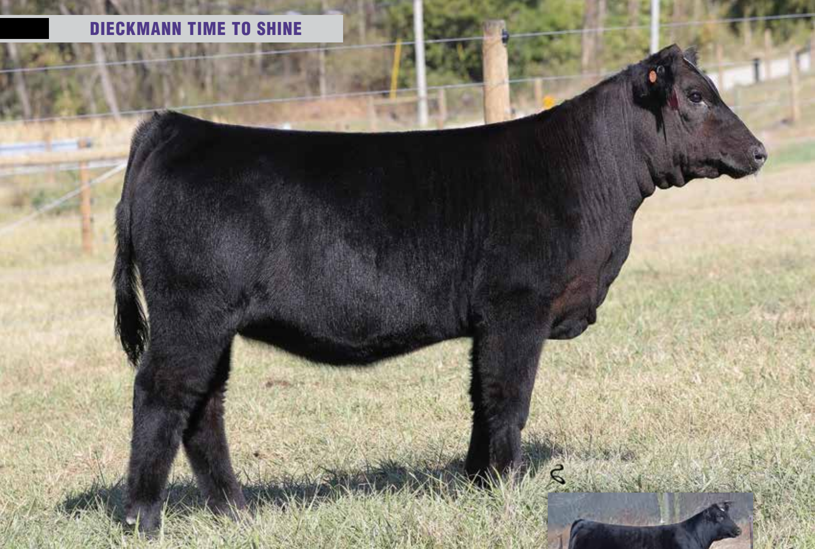
LOT 25 | DIECKMANN TIME TO SHINE 781G