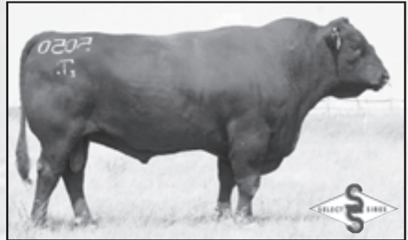
GAR New Design 5050 - His service sells.

Will sell with a fall 2009 calf by GAR New Design 5050. Excellent made moderate female. Her cow family was developed in one of the great herds in the country.