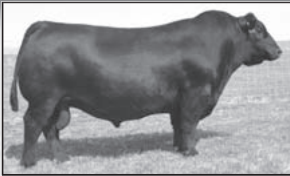
SAV Net Worth 4200 - His service sells.