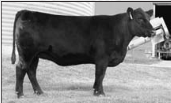
T B A Forever Lady 669 - Lot 73

Due 4/24/10, sired by Connealy Thunder. Ranks in the top 10% for $B and 15% for YW and RE. 669 records one calf at 105 for WW and 107 for YW. A strong, young Forever Lady that has an excellent EPD set and phenotype.