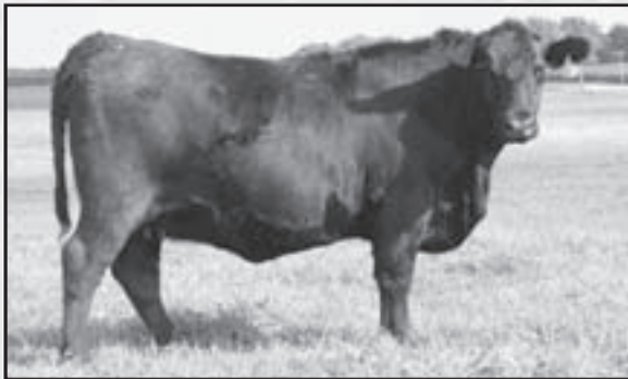
Awesome Beauty T009 - Lot 20

Exposed to SVF Rito R515 from 4/1/09 to 6/15/09, confirmed bred.