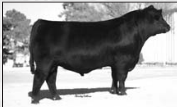
EXAR New Look 2971 - Sire of Lot 55.

Due 3/18/10, sired by GT Shear Force 555. Ranks in the top 1% for $B, 4% for Marbling and 10% for RE. 3938 records one calf at 128 for marbling and 107 for WW and YW.