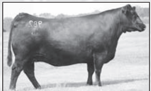
GAR 1407 New Design 982 - Full sister of Lot 22.

Exposed to SVF Rito R515 from 4/1/09 to 6/15/09, confirmed bred. Ranks in the top 20% for Marbling. One of the all-time great matings that has performed at every level. U064's dam was a featured $60,000 donor at SVF and her full sister, GAR 1407 New Design 982 is one of the elite performers for Limestone Cattle Co.