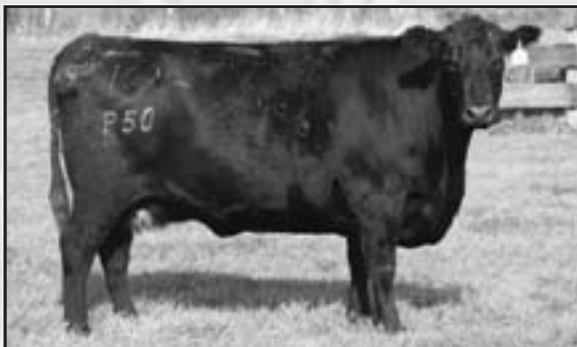
Pine Coulee Blackbird P50 - Lot 17

Will sell with a fall 2009 calf at side by GAR Objective 7125. A long made daughter of a sire that stamps his progeny. Long, powerful and full of meat. Excellent genetic combination backed by one of the great maternal cow families.