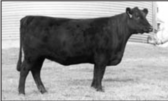
T B A Ruby of Tiffany 751 - Lot 66

449 N. Elizabeth-Scales Mound Rd. Elizabeth, IL 61028 (815) 281-0045