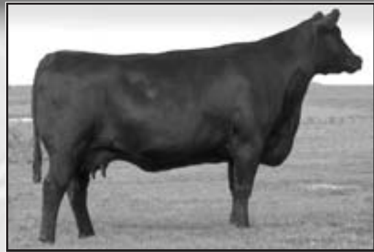
SVF Primrose Lady 194H - Dam of Lot 42.