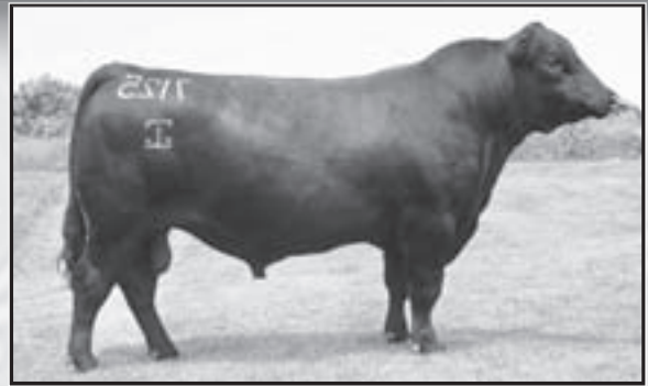
GAR Objective 7125 - His service sells.