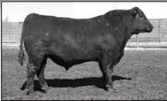
SVF Rito R515 - His service sells.