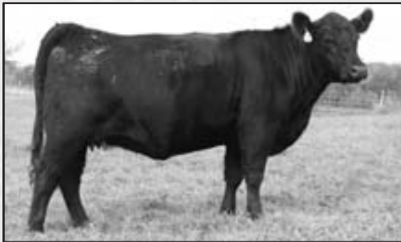
Awesome Miss Wix T003 - Lot 13

Exposed to SVF Rito R515 from 4/1/09 to 6/15/09, confirmed bred. Recorded an outstanding 142 marbling ratio. 660 sire is one of the great sires in the history of the breed for his ability to produce pounds.