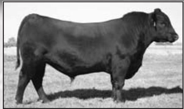
SVF New Design T012 - His service sells.