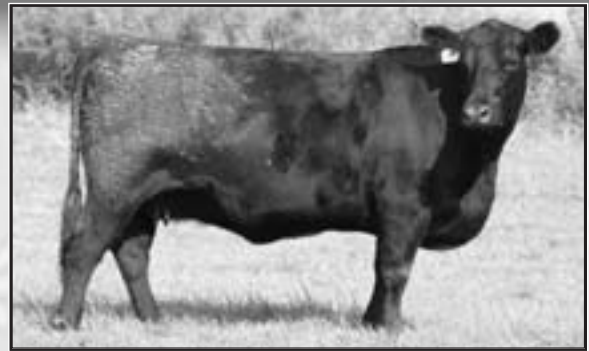
S V F Forever Lady R113 - Lot 3

Exposed to SVF Rito R515 from 4/1/09 to 6/15/09, confirmed bred. P127 records one calf at 120 ratio for marbling and 104 for RE. A powerful Forever Lady that traces to the great GDAR SVF Forever Lady 214D, who is a combination of maternal strength and muscle. Across the country the Integrity daughters are meeting the needs of the commercial based programs.