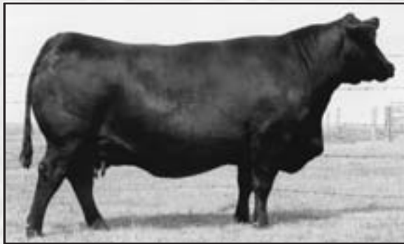
GDAR SVF Forever Lady 214D - Grandam of Lot 61.