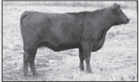
Gaffney Miss Empress 052 73 - Lot 37

Sells open with a bull calf at side sired by GAR New Design 5050 born 8/23/09. Ranks in the top 205 for Marbling. Recorded individual ratios of 107 for marbling and 108 for RE. Maternal sister to Lot 33. Deceased dam was a featured donor at Gaffney family cattle.