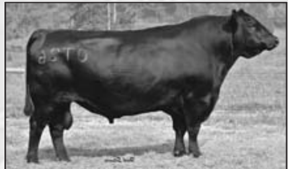
SS Objective T510 0T26 - His service sells.

Sells open with fall 2009 bull calf born 10/4/09, (Lot 75A) BW 86 lbs., sired by TBA Traveler 662 9064.