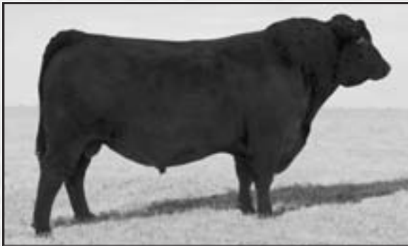
Baldridge Kaboom K243 KCF - Sire of Lot 24.