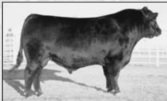
Bon View New Design 1407 - Sire of Lot 57.

Due 5/17/10, sired by GT Shear Force 555. Ranks in the top 20% for $B.