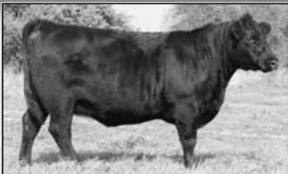
Awesome Everelda Entense T011 - Lot 5