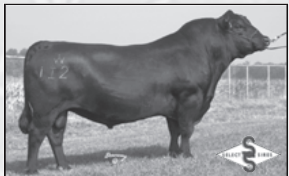
Rito 112 of 2536 Rito 616 - Sire of Lot 38.

Sells open with a bull calf at side sired by Bon View New Design 878 born 9/3/09. 7118 ranks in the top 3% for YW, 4% for $B, 10% for WW, 15% for Marbling and 20% for RE. Her dam records 3 calves at 108 for marbling. An all-around genetic package here backed by a program and cow family that has performed. Excellent donor potential in this female that traces to the great GAR Precision 1559.