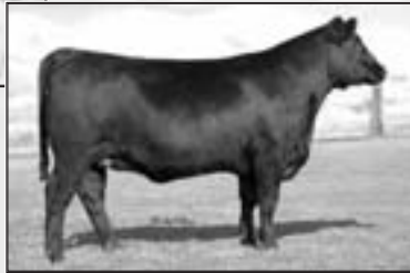
Murphy's SVF Erroline 6M - Dam of Lot 39.