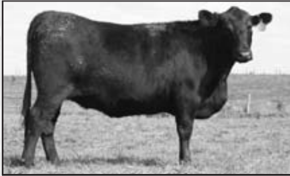
Awesome Forever Lady T010 - Lot 1