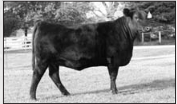
T B A Evergreen 840 - Lot 69

Due 4/12/10, sexed as a heifer, sired by TBA Traveler 004 662. Ranking in the top 5% for Marbling, $B and 10% for RE. Elite carcass merit.