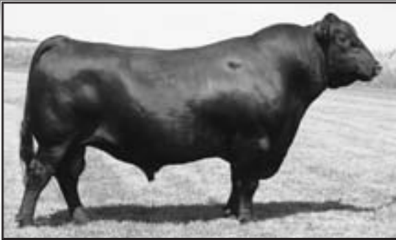
Bon View New Design 878 - His influence sells.