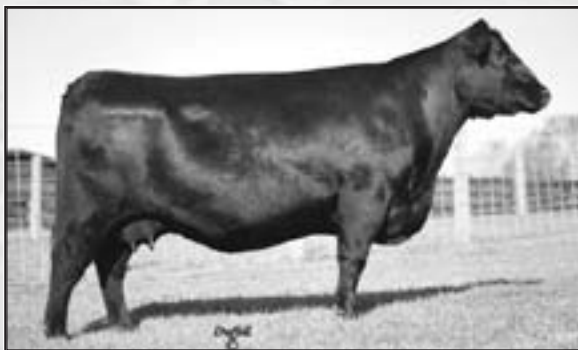
GAR EXT 2114 - Lot 54 is a descendant of this great female.

Due 3/1/10, sired by GT Shear Force 555. 9135 ranks in the top 10% for RE and top 20% for Marbling. She records 4 calves at 104 for marbling and 106 for RE.