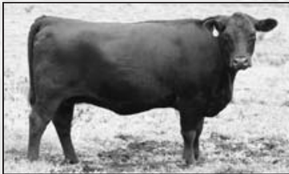
G T Evergreen 651 - Lot 41

Due 4/9/10, sired by Gaffney New Design 7155.