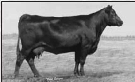
Forever Lady 163 GDAR - Great-grandam of Lot 33.

Sells bred to SVF Future Direction R622. Exposed 6/1/09 to 7/30/09. Confirmed bred.