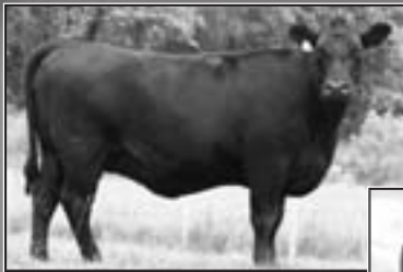
OTG Erroline 6M 757 - Lot 39