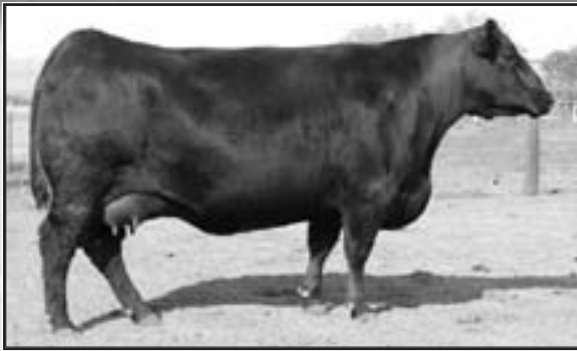
SVF Rita 53N - Dam of Lot 23.