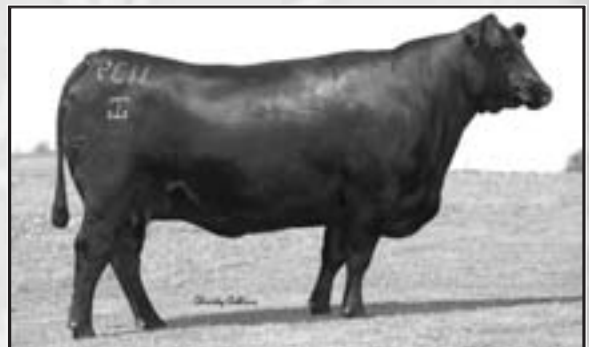
GAR New Design 1139 - Dam of Lot 62.

Due 5/22/10, sired by TLA Cutler U068. Ranks in the top 20% for WW, YW and $B. Dam was a past $110,000 one-half interest featured lot of a past SVF sale. Another powerful heifer from a proven family. The Woodhill Foresight daughters across the country are proving themselves to be awesome producers.