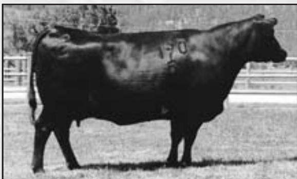
Sitz Everelda Entense 1905 - Great-grandam of Lot 6.

Exposed to SVF New Design T012 from 6/25/09 to 7/30/09, confirmed bred. Excellent moderate made Everelda Entense that traces to the $55,000 BT Everelda Entense 567H.