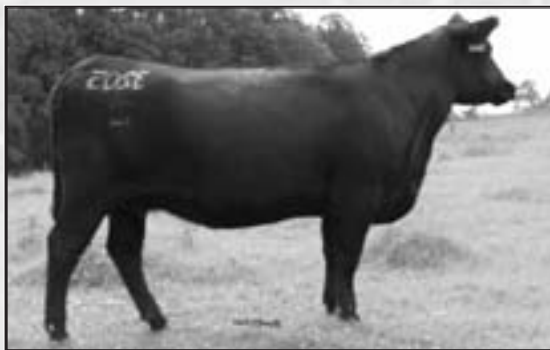
G A R Retail Product 3205 - Donor dam of Lot 50 embryos.

Due 4/23/10, sexed as a bull, sired by OTG Future Direction 743. Ranks in the top 15% for Marbling. Generated from a cow family known for power and maternal strength.