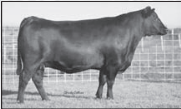
GAR Precision 1559 - Great-grandam of Lot 35.