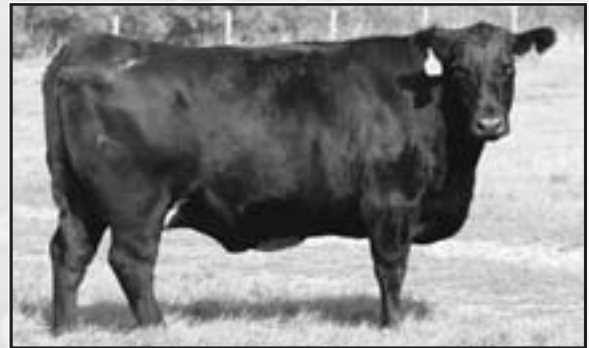
S V F Everelda Entense P402 - Lot 4

Exposed to SVF Rito R515 from 4/1/09 to 6/15/09, confirmed bred. Ranks in the top 20% for Marbling. R113 had individual ratios of 125 for marbling and 113 for RE, power that traces to the maternal grandam of R113. Another progressively bred Forever Lady.