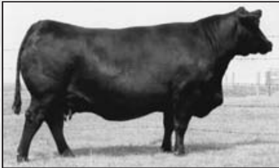
GDAR SVF Forever Lady 214D - Grandam of Lot 2.

Exposed to SVF New Design T012 from 6/25/09 to 7/30/09, confirmed bred. T010 ranks in the top 10% for YW and 15% for $B. A new generation Forever Lady that has the power of the family and the progressive growth and carcass merit of here sire. Excellent donor potential for the future.