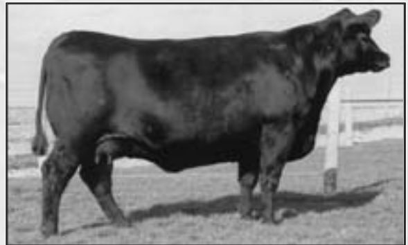
BT Everelda Entense 567H - Grandam of Lot 26.