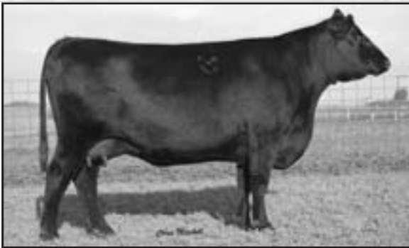
B/R Ruby of Tiffany 5113 - Grandam of Lot 67.

Due 4/17/10, sired by Connealy Thunder. 751 ranks in the top 2% for RE and top 15% for WW. 751 recorded ratios of 107 for WW, 102 for YW and 113 for RE. Her dam records 2 calves at 102 for marbling, 2@108 for RE and 2@110 for WW. This famed cow family has made its name by performing in the commercial cattle business. Multiple nationally used sires have been bred from this family.