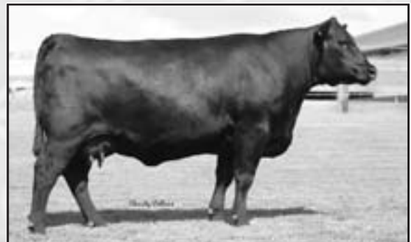
S V F Everelda Entense 28L - Dam of Lot 4.

Will sell with fall 2009 calf at side by SVF New Design T012. P402 has individual ratios of 112 for marbling and 113 for RE. She records three calves at 106 for RE. Her dam is one of the all-time greats from the SVF program where she sold for $33,000 for one-half interest.