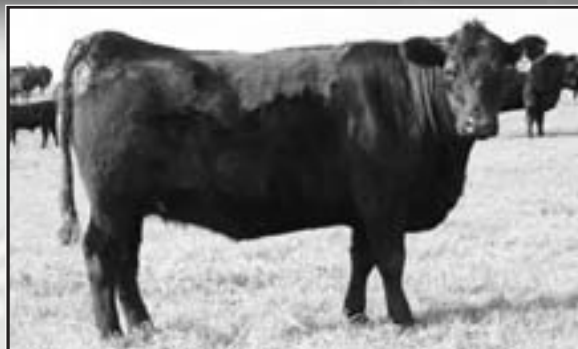
Awesome Dixie Erica T001 - Lot 8

Exposed to SVF Rito R515 From 4/1/09 to 6/15/09. Excellent combination of a great family and a sire that works in any management system.