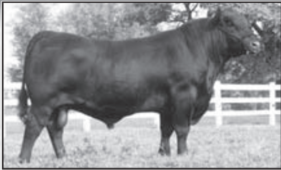
Dreamy 280 Rito 112 704 - Service sire of Lot 34.