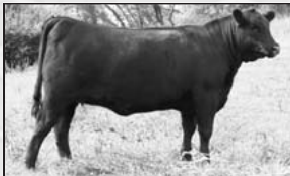
Dreamy 280 Erroline 817 - Lot 32

Dennis and Patrick Schlimgen 2792 Cave of the Mounds Rd. Blue Mounds, WI 53517 Dennis (608) 575-6848 Patrick (608) 575-7101