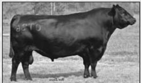
SS Objective T510 OT26 - Sire of Lot 27.