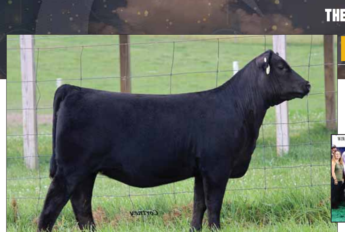
Third Overall, '19 National Juniro Angus Show shown by Ben Nikkel. A full sister to Lot 46.