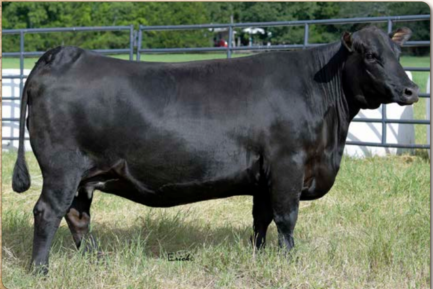
Pine View Susanna D417 - Lot 7