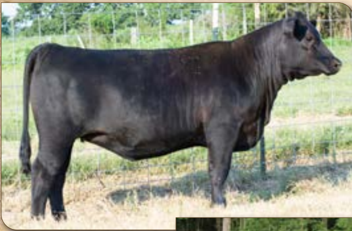
CA Lady Prophet 570 - Lot 26