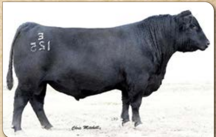
Baldrige Alternative E125 - His service sells in Lot 29B.