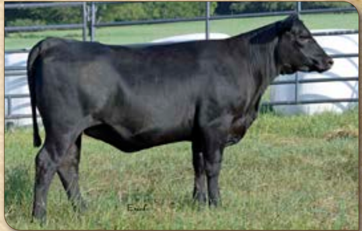
CA First Lady 534 - Lot 29A

29B CA First Lady Progress 504 Birth Date: 1-26-2019 Cow #19394885 Tattoo: 504 +*Quaker Hill Manning 4EX9 #*EXAR Denver 2002B EWA Peyton 642 +*Quaker Hill Blackcap 0A32 *18675107 #+*EWA 444 of 968 Progress #+*GAR Progress #*Edgewood Lady 968 #*AAR Ten X 7008 SA #*Deer Valley All In +*Deer Valley Rita 0274 CA First Lady 341 #*Connealy Consensus 7229 +*18465719 +*McKellar Breesha Bell 2350 *Breesha of Conanga 1251