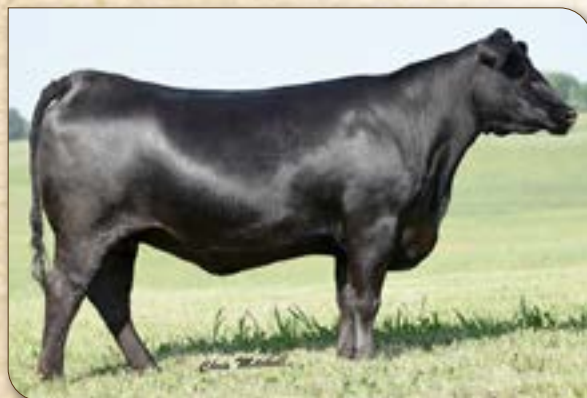
Woodside Rita 5M25 of 3P22 - Dam of Lots 3, 3A & 3B.