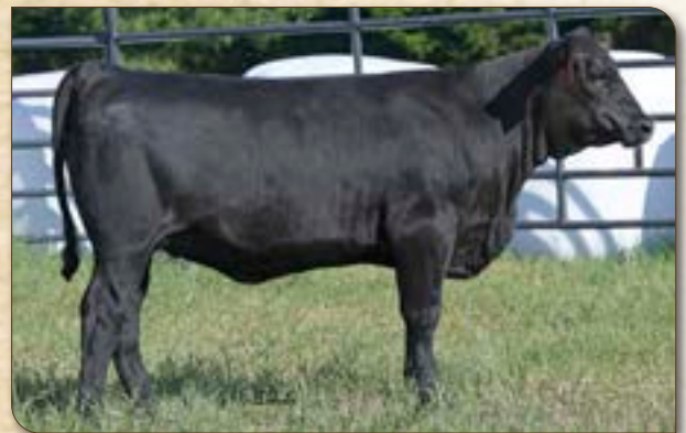
CA Objective 579 - Lot 7A