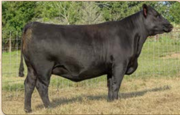
CA Rita 532 - Lot 8A