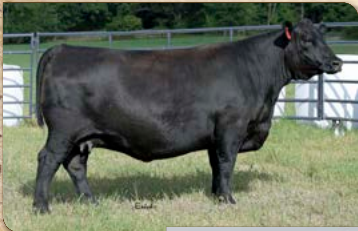
DSA Prophet 1209 1456 - Lot 9