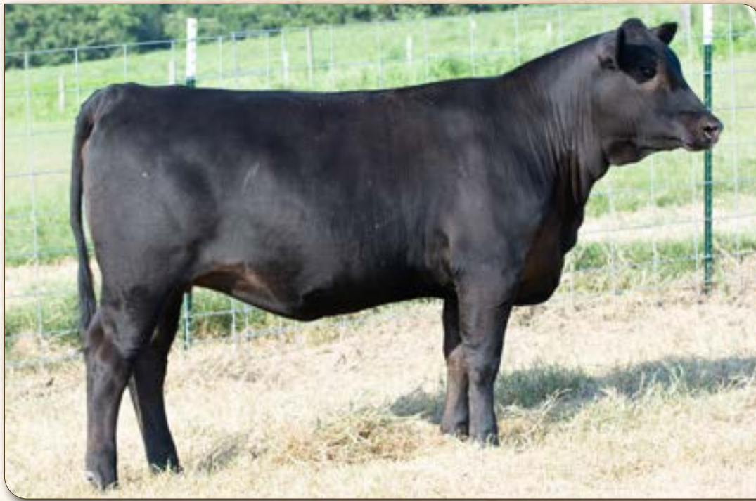
CA Rita 573 - Lot 3B