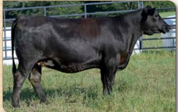
CA Saylor Rae Sunrise 482 - Lot 19A