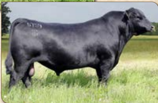
G A R Ingenuity - His dam is also the granddam of Lots 33, 33A, and 33B.