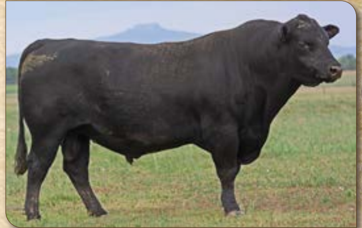
G A R Compadre - His service sells.