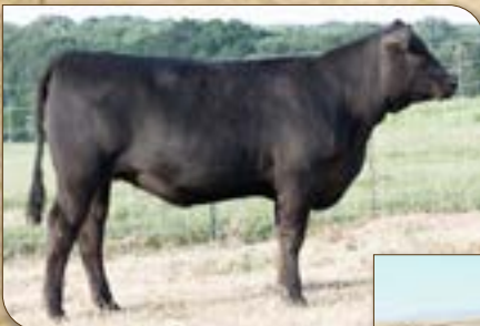
CA Rita 588 - Lot 3A