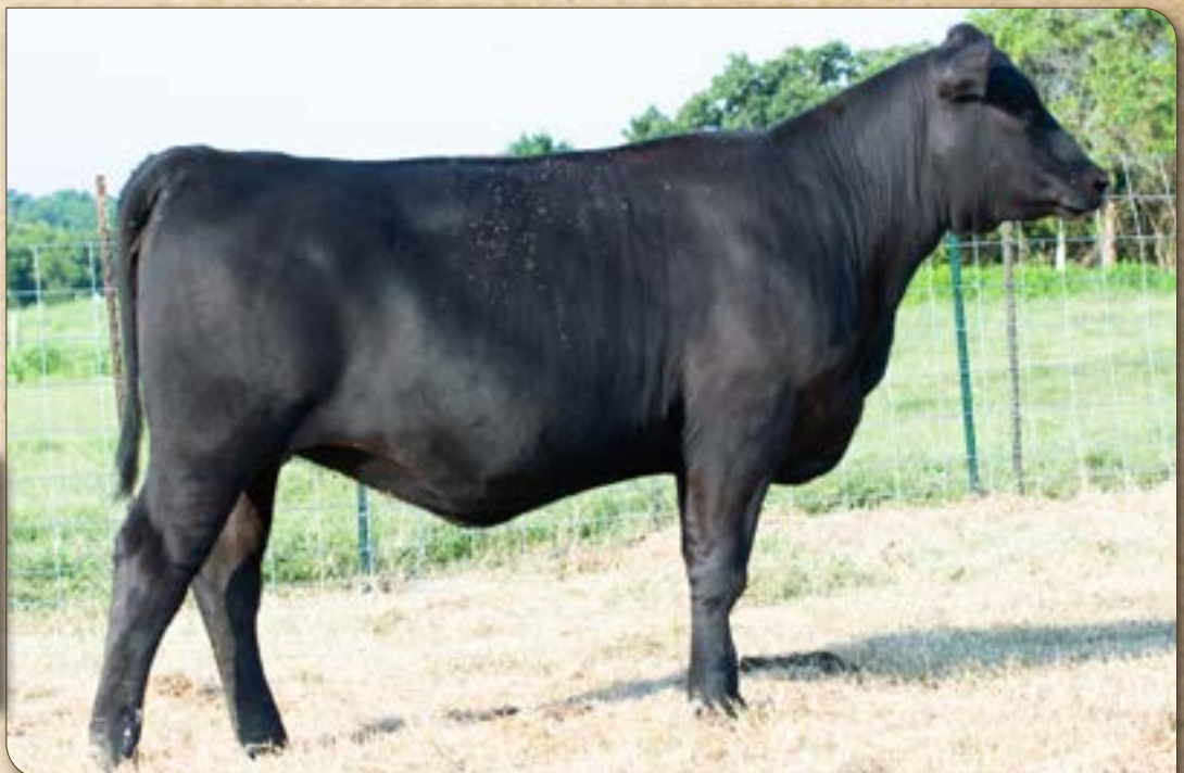
CA Karma 572 - Lot 4