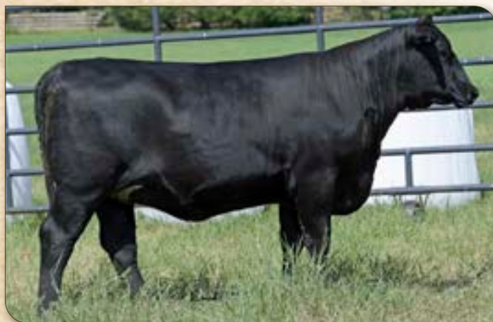
CA Saylor Rae Iris 500 - Lot 32B