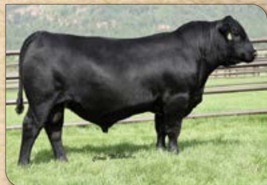
SS Enforcer E812 - Sire of the Lot 6A pregnancy.