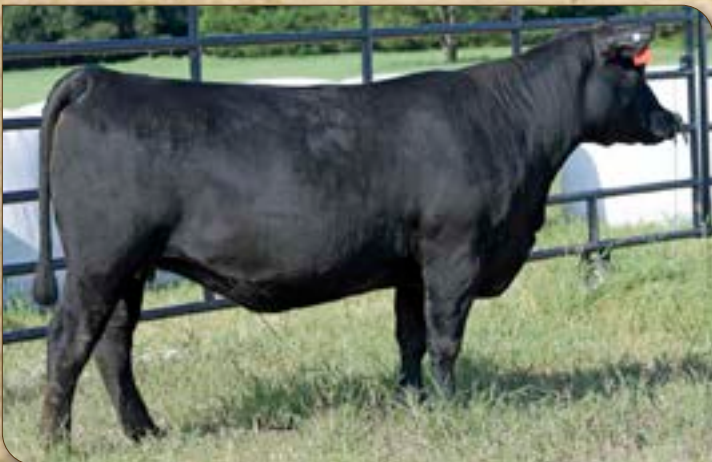
CA Dorthy Marie 429 - Lot 41