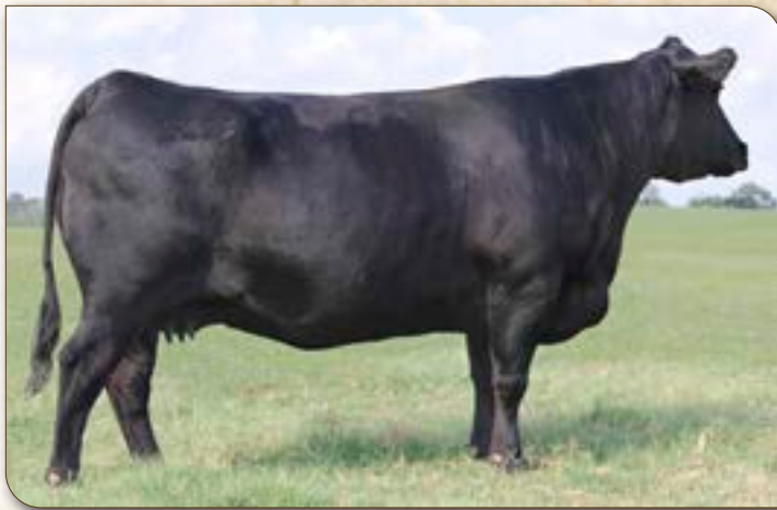
Breesha of Conanga 1251 - Maternal great-granddam of Lot 29.

29 CA First Lady 549 Birth Date: 2-13-2019 Cow #19460880 Tattoo: 549 +*Quaker Hill Manning 4EX9 #*EXAR Denver 2002B EWA Peyton 642 +*Quaker Hill Blackcap 0A32 *18675107 #+*EWA 444 of 968 Progress #+*GAR Progress #*Edgewood Lady 968 #*AAR Ten X 7008 SA #*Deer Valley All In +*Deer Valley Rita 0274 CA First Lady 341 #*Connealy Consensus 7229 +*18465719 +*McKellar Breesha Bell 2350 *Breesha of Conanga 1251