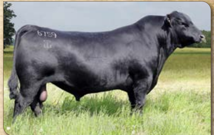
G A R Ingenuity - His dam is the granddam of Lots 50, 51, and 52.