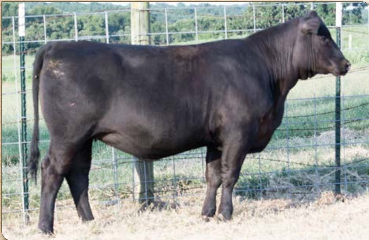
CA Rita 589 - Lot 3