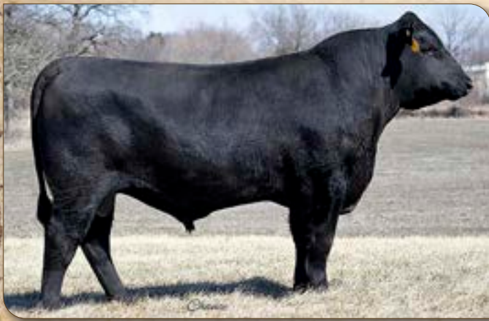
E W A Peyton 642 - Sire of Lots 45 and 46.