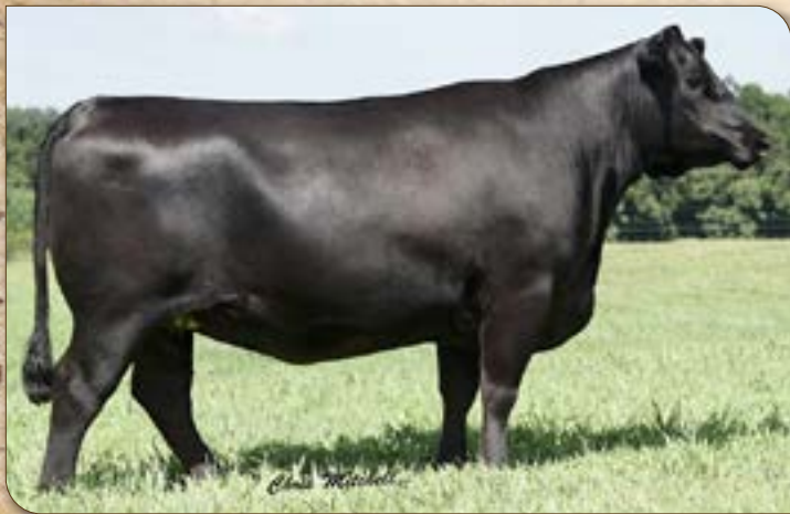
Williams Prop Erica 255-895 - Dam of Lot 14.