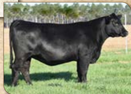
CAM Ashland A834 - A maternal sister to the Lot 6A pregnancy.