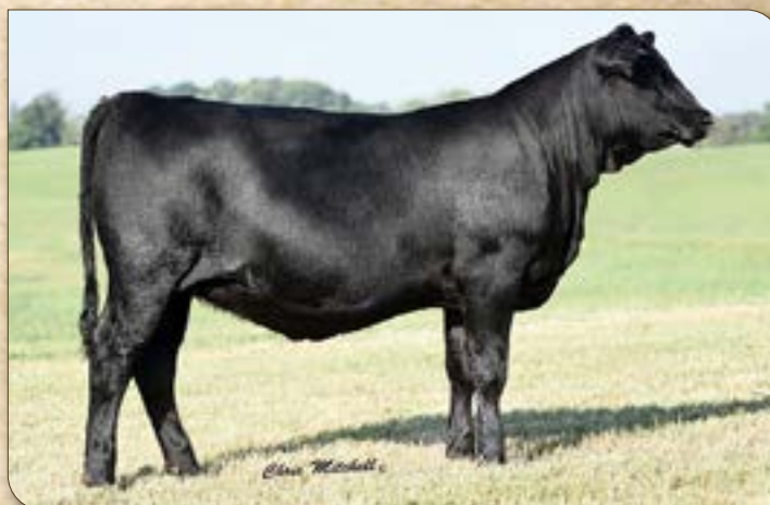
Powell Erica 8043 - Lot 37