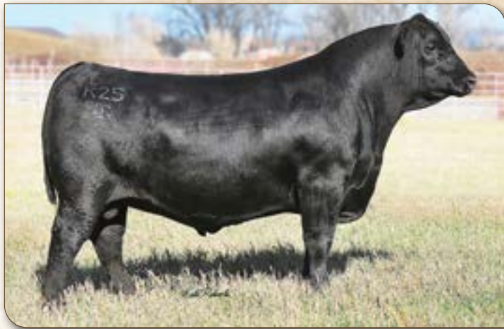
G A R Ashland - Sire of Lot 17.