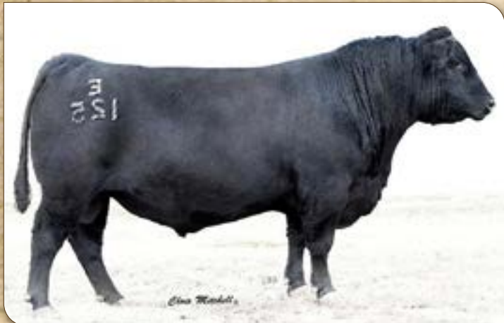
Baldrige Alternative E125 - Sire of Lot 10 pregnancy.