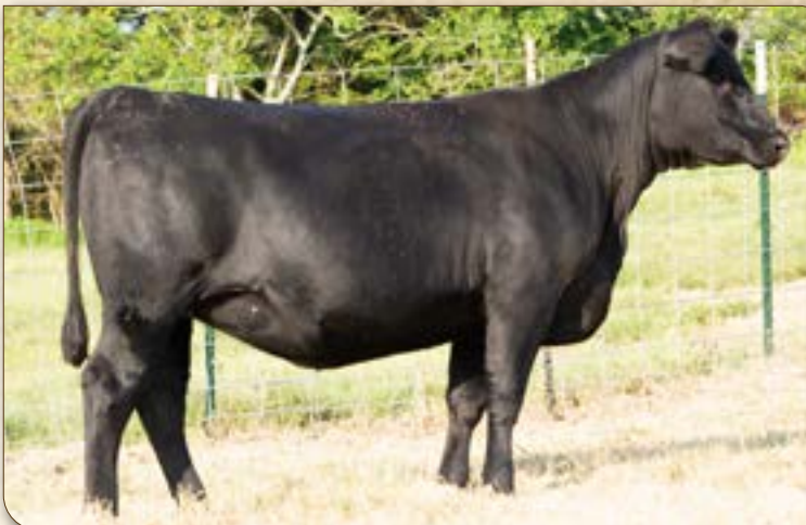
CA Erica Dianna 545 - Lot 2