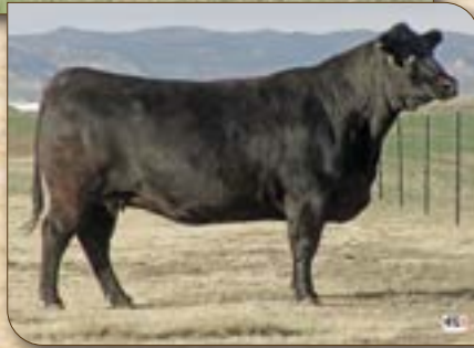
DSA New Direction 1022 - Maternal granddam of Lot 9.