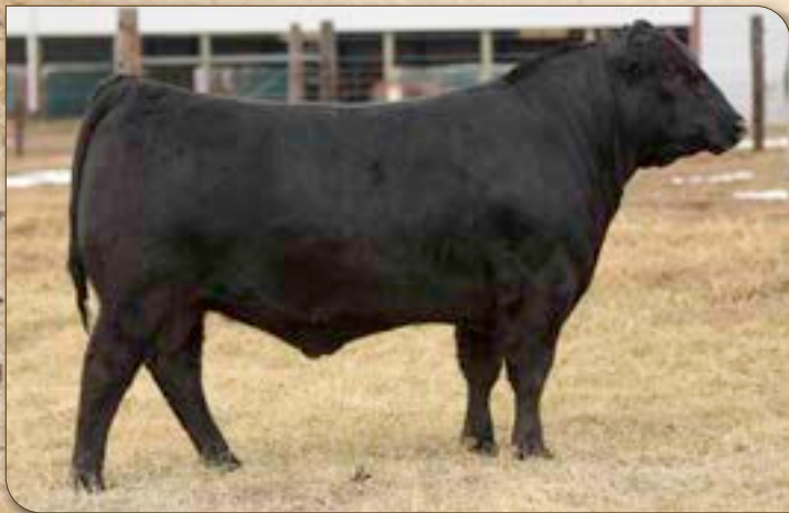
Pine View Boomtime - Sire of Lot 30.