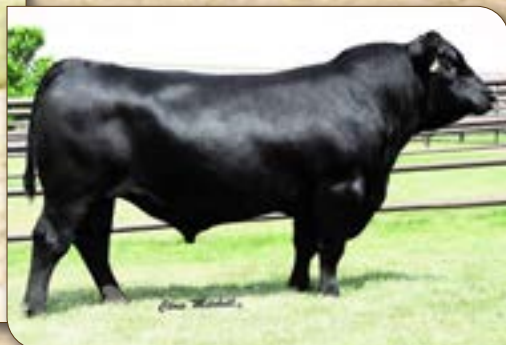
Diablo Deluxe 1104 - Maternal brother to Lot 2.