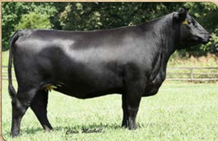
Williams Prop Erica 255 654 - Dam of Lot 16.