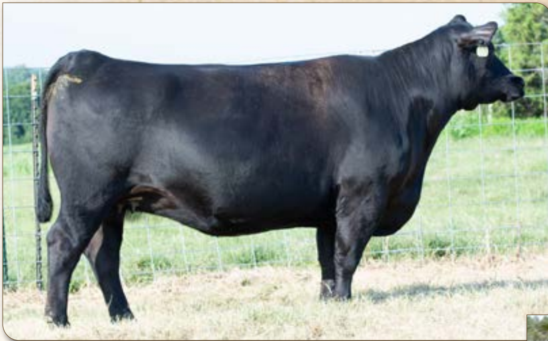
CAM Sunrise A6052 - Lot 6