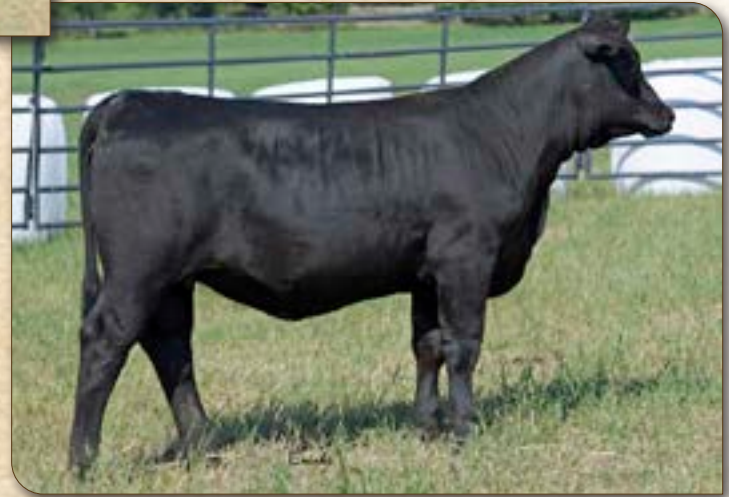
CA Lady Prophet 569 - Lot 27