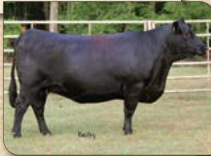
G A R Prophet A222 - Dam of Lots 26 and 27.