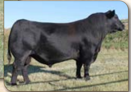
Hoover No Doubt - Sire of Lot 5 pregnancy.