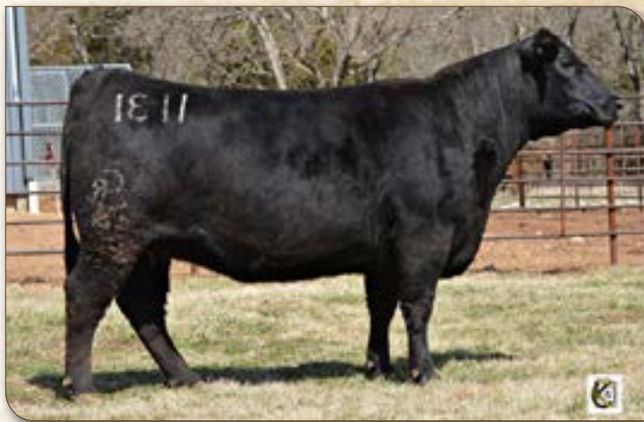
Chair Rock 5050 G A R 1131 - Maternal granddam of Lots 18 and 18A.