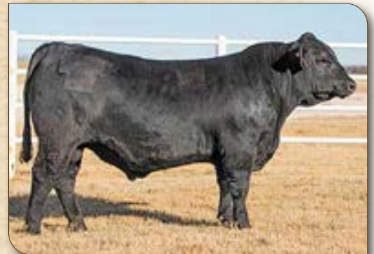
G A R Vengeance - Maternal brother to Lot 5A.