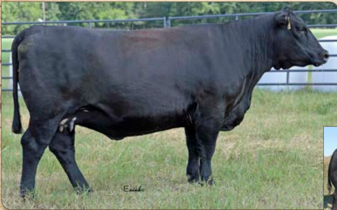
E W A 678 of 3128 Sure Fire - Dam of Lot 5 pregnancy.