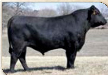
EWA Peyton 642 - Sire of Lot 4.