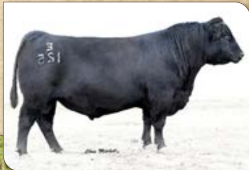
Baldridge Alternative E125 - Sire of Lot 2.