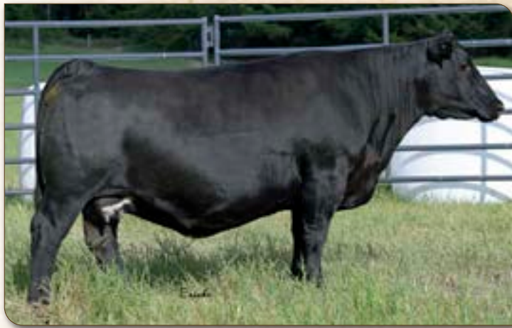
Pine View Rita C066 - Lot 8