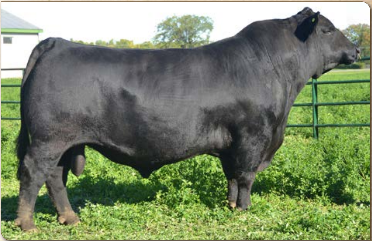
Freys Opportunity 148A - Sire of Lots 50, 51, and 52.