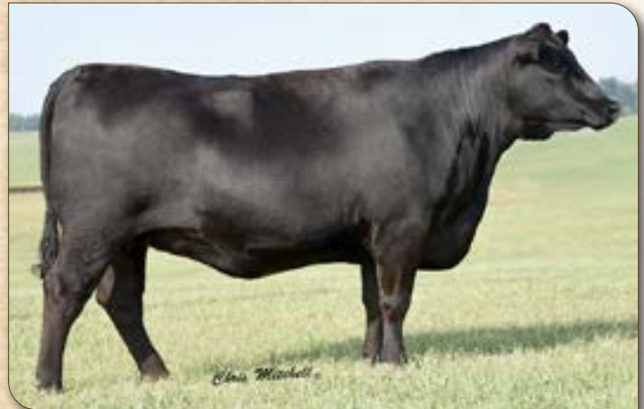
Williams Prop Karama 200-117 - Dam of Lot 15.