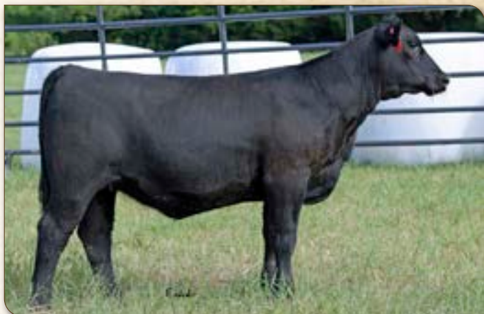
CA Rita 648 - Lot 8B