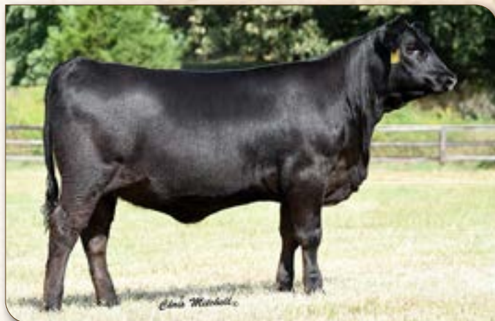
Powell Erica 8012 - Lot 36