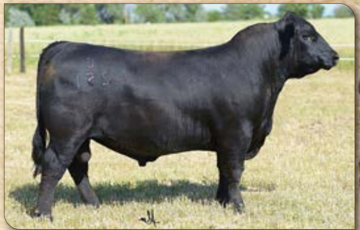
Baldrige Colonel C251 - Sire of Lots 18 and 18A.