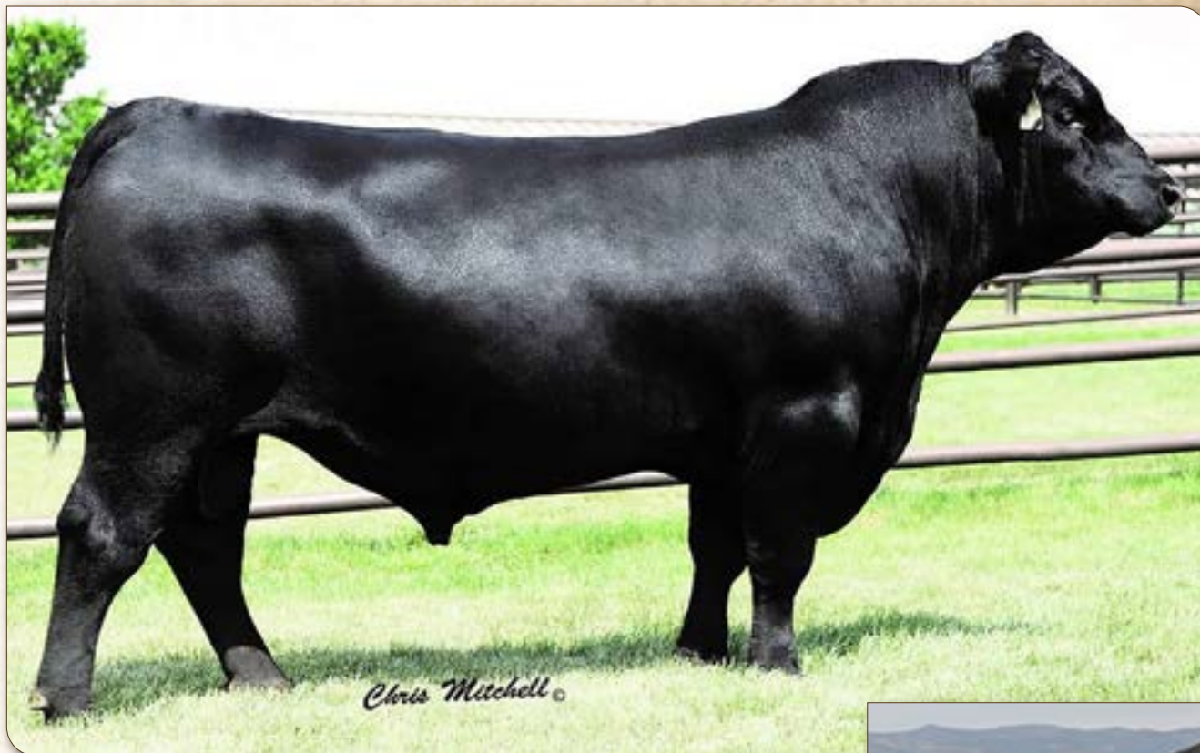
Diablo Deluxe 1104 - Sire of Lots 42, 43, and 44.