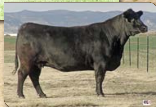
DSA New Direction 1022 - Maternal granddam of Lots 42, 43, and 44.