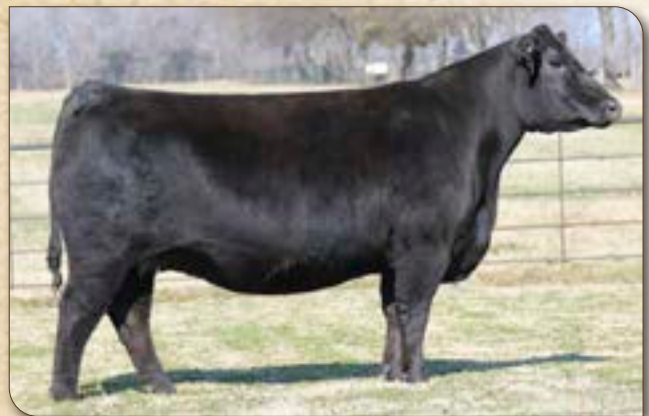
DSA Ten X 1022 1433 - Full sister to the dam of Lot 10.