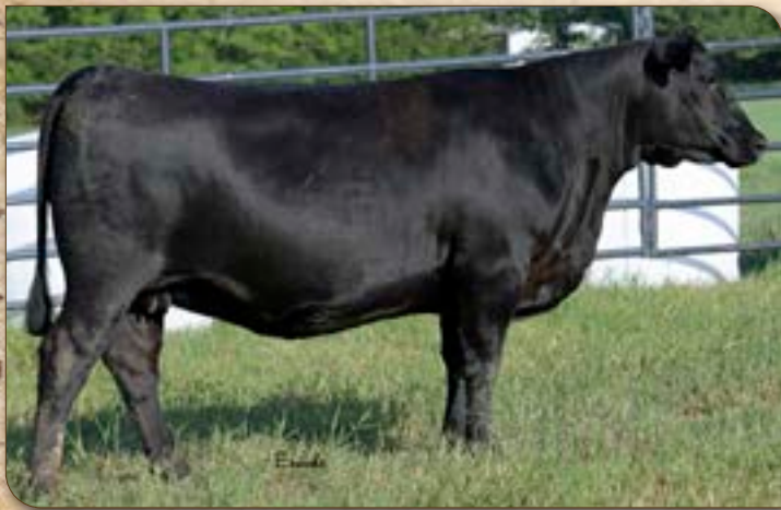
CA Saylor Rae Sunrise 461 - Lot 19