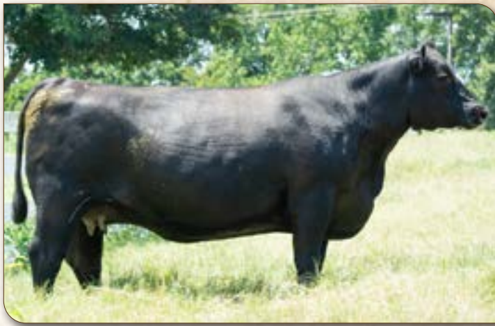
Sammy P 368 - Lot 11