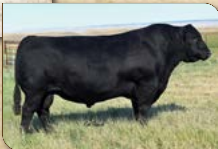
SydGen Enhance - Sire of Lots 3 and 3A.