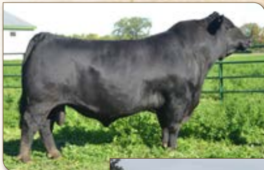
Freys Opportunity 148A - Sire of Lots 33, 33A, and 33B.