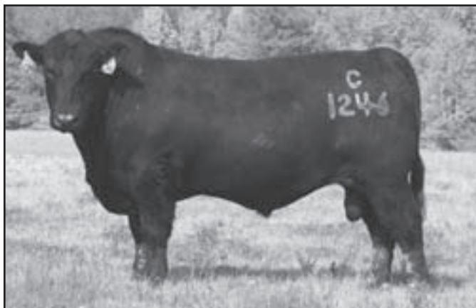
Lot 2 - Callaways USPB 1246