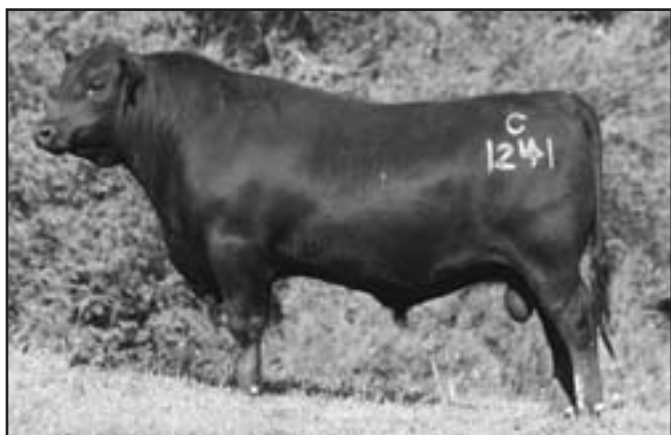
Lot 90 - Callaways Preeminent 1241