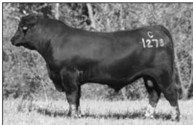
Lot 100 - Callaways New Design 1273