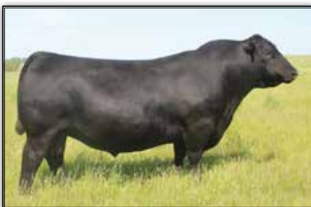
S A V Rainfall 6846 / Reference Sire K