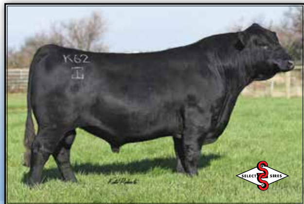
G A R Sure Fire / Sire of Lot 9

Due 12/8/20 to Bridges Rare Air. NUMBER 1 for $Weaned calf value index, Number 2 for Docility score EPD and percent Heifer Pregnancy EPD, Number 5 for Yearling Weight EPD and maternal Milk EPD and top 10 for $Combined value index, Weaning Weight EPD and hot Carcass Weight EPD.