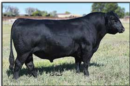
K C F Bennett Boulder / Reference Sire G