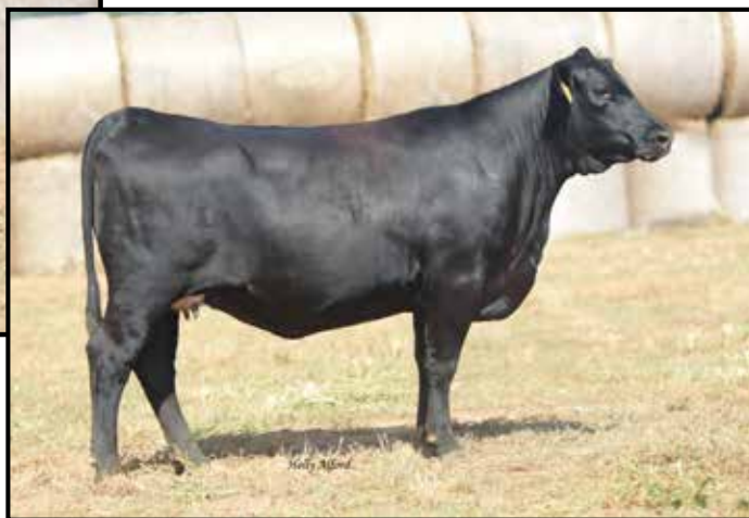
Bridges Fortress 8573 / Lot 11B