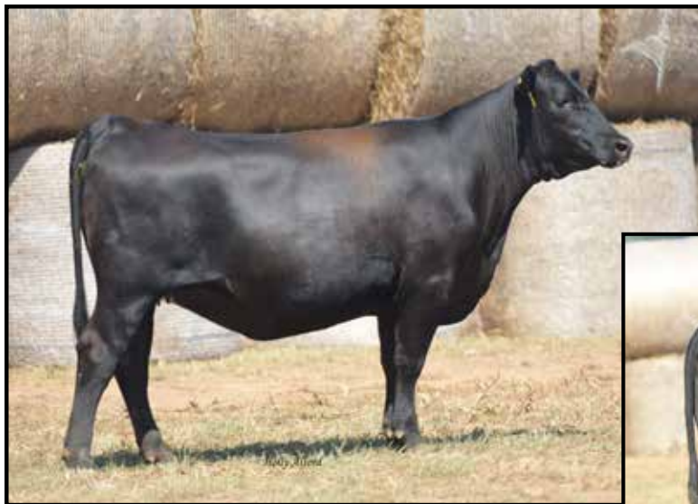
Bridges Fortress 8532 / Lot 11A