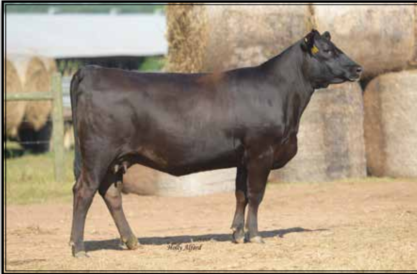
Bridges Scale House 8441 / Lot 14A