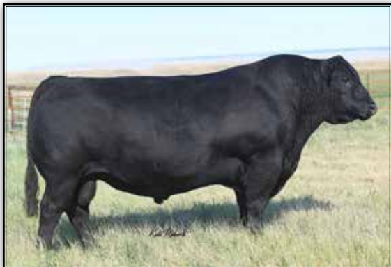
SydGen Enhance / Sire of Lot 53-59