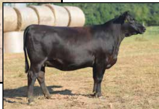
Bridges Fortress 8561 / Lot 28