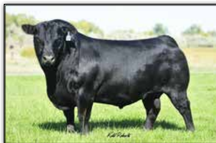
LD Capitalist 316 / Reference Sire L