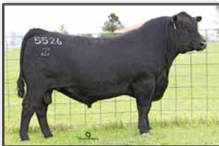
G A R Quantum / Reference Sire H