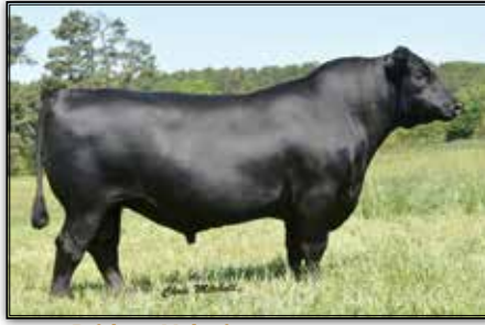
Bridges Velocity / Reference Sire D