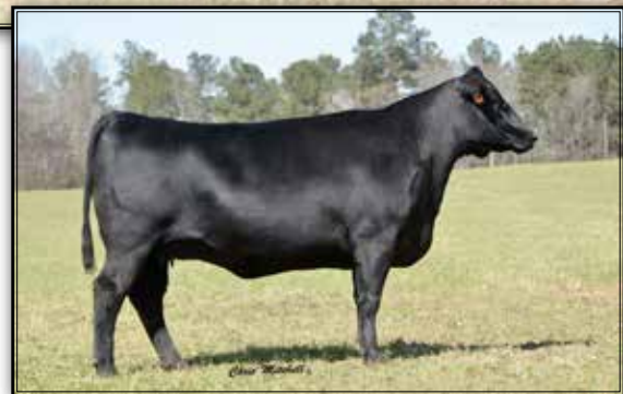
Bridges Daybreak 297 / Dam of Lot 8