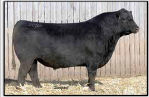
G A R Scale House / Sire of Lots 20A - 20E

Flushmates Lots 20A thru 20F G A R Scale House X Bridges Prophet 663