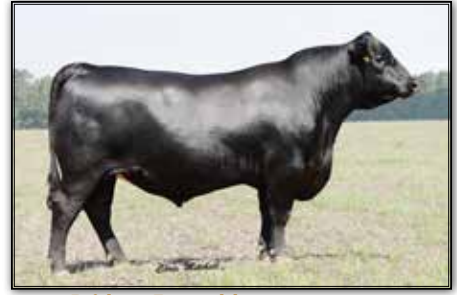
Bridges Foretold / Reference Sire F