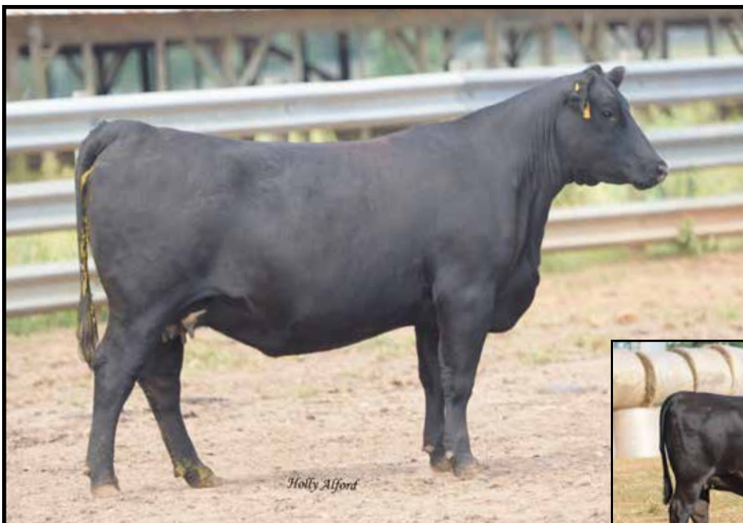
Bridges Fortress 8559 / Lot 27