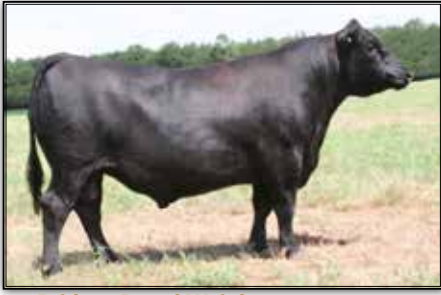
Bridges Broad Weigh / Reference Sire C