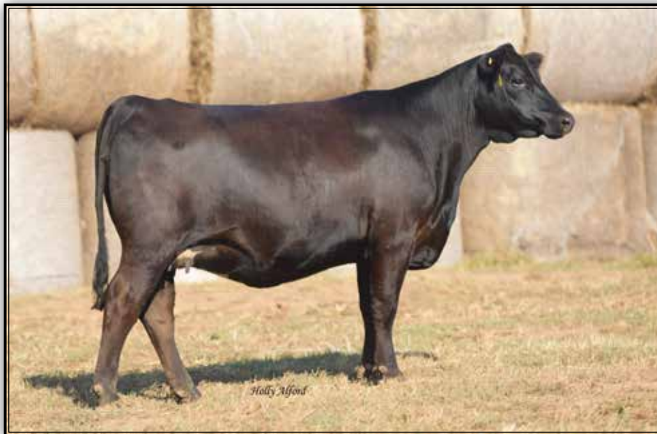
Bridges Ashland 8548 / Lot 15