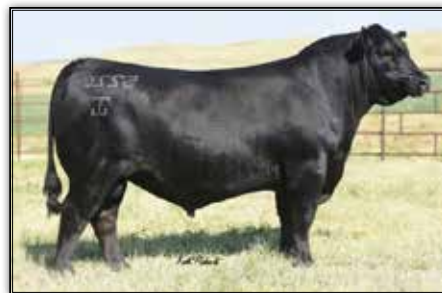
G A R Inertia / Reference Sire I