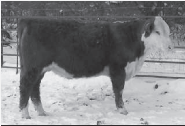
Blacktop TS Agent 9753 - Lot 54