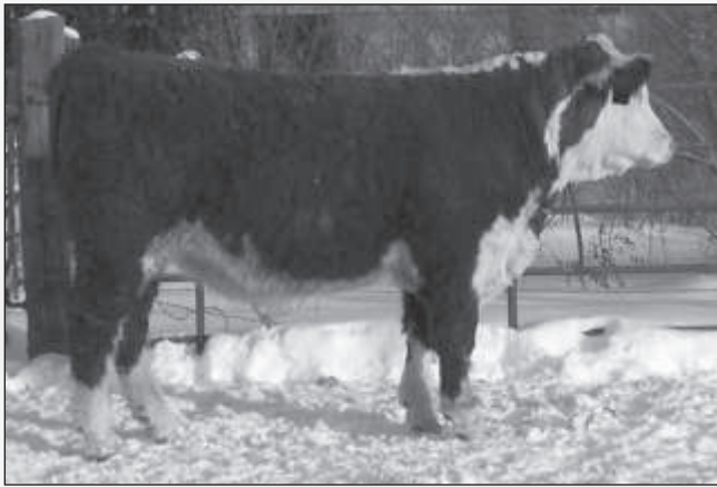
Blacktop Online 79 - Lot 16