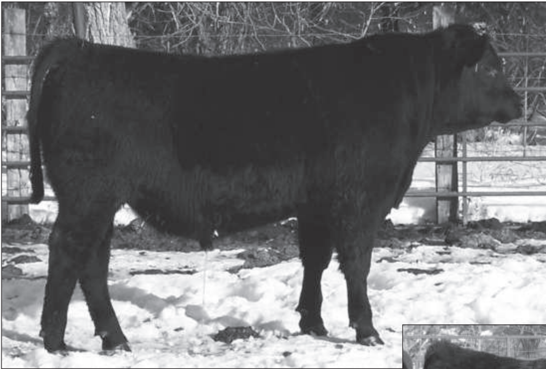
Blacktop Alliance 9078 - Lot 59