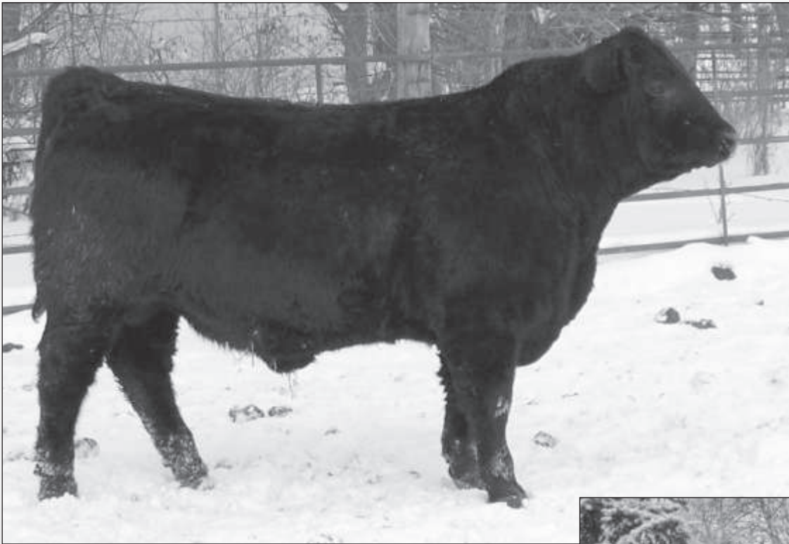
Blacktop Final Answer 9742 - Lot 11