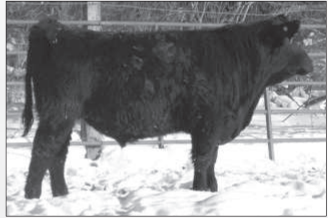
Blacktop Matrix 9124 - Lot 38

* Stylish, bold ribbed calf, easy-fleshing. Dam is first calf heifer with WWR 105.