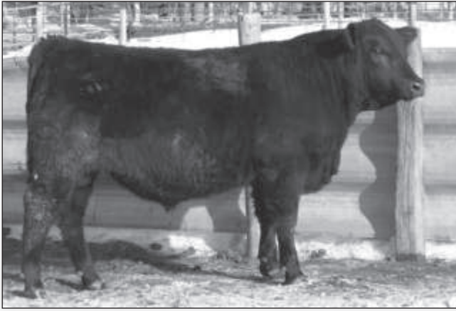
Blacktop Protégé 9641 - Lot 47