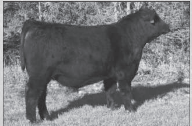
Blacktop Final Answer 9405 - Lot 2

*A favorite with unlimited potential. Unbelievable cow records, 4 BWR 99, 4 WWR 107, 3 YWR 104, 3 IMF 123, 3 RE 105. Very closely related to Lot 11. Both trace back to our donor, 233. Heifer bull potential.