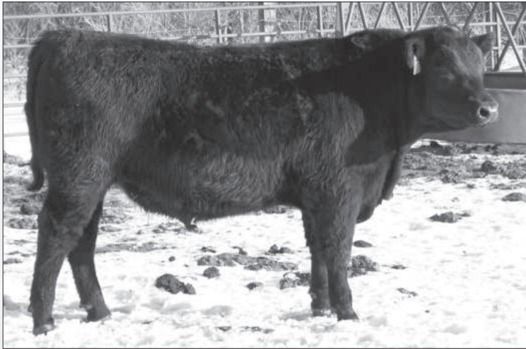
Blacktop Packer 762 - Lot 23