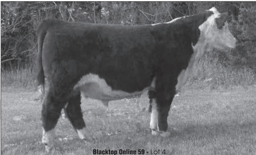
Blacktop Online 59 - Lot 4