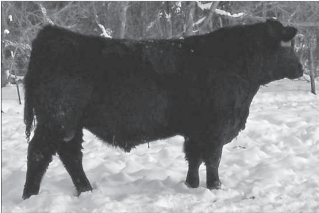
Blacktop Legend 9600 - Lot 8