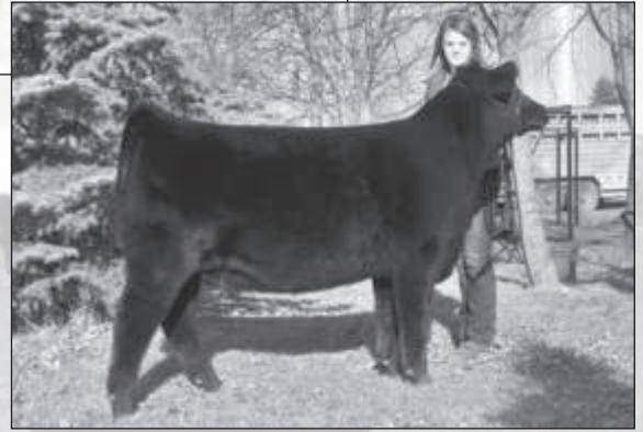
Blacktop Misty 904 - Full sister to Lot 11.

* ET calf. Grandam is Lot 2's dam. Her records include 4 WWR 107. As stout as they can be, moderate and thick. Potential heifer bull for larger framed heifers.