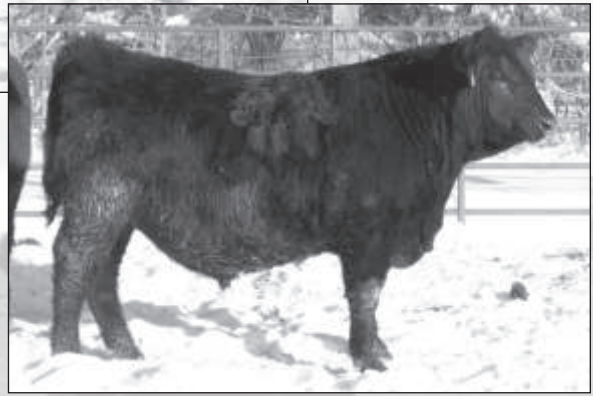
Blacktop Final Answer 9415 - Lot 62

* Great birth to weaning spread. A farm favorite heifer bull. Cow has 3 BWR 91, 3 WWR 104.