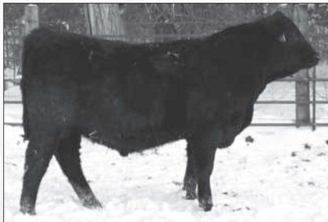
Blacktop Windy 9643 - Lot 44