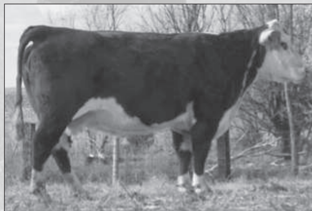
LeGrand Hannah 10N - Dam of Lots 3-7. 2007 heifer was named Champion at the Spotlight Show and SD State Fair Hereford Special. 2009 Milsap heifer named champion at Davison Winter Calf Show.

* These five brothers are good. Online has sired many great cows. These bulls will be the beginning of many great herds. 10N has never let us down. 4 BWR 100.5, 4 WWR 110, 3 RE 104.7.