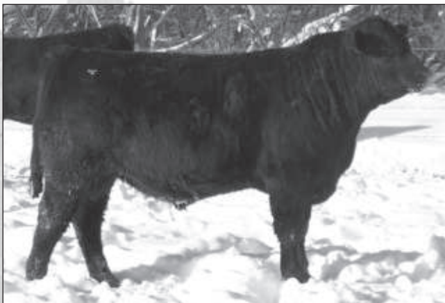
Blacktop Final Answer 9790 - Lot 9

* Crowd favorite, extremely stout bull. Young dam traces back to Bon View Farms. She has 2 BWR 100, 2 WWR 111, 1 YWR 101, IMF 117, RE 112. Deceased sire's progeny are growthy and thick. Top adj. weaning weight. Guaranteed to please.