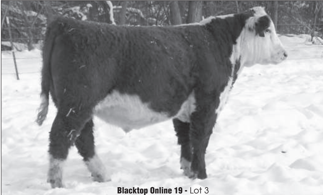
Blacktop Online 19 - Lot 3