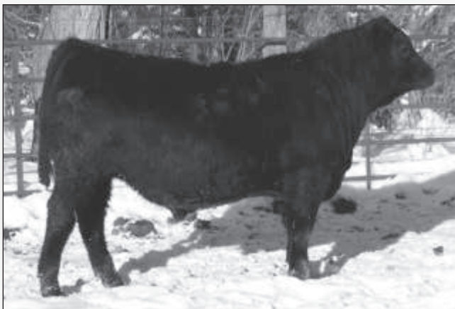
Blacktop Matrix 9774 - Lot 30