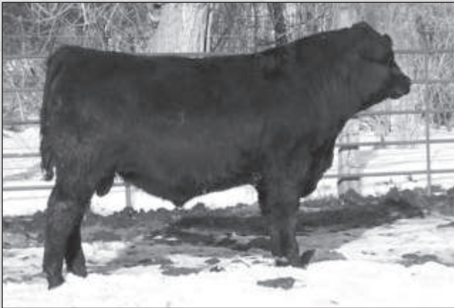
Blacktop Protégé 9408 - Lot 48

* Dam has 2 WWR 109, 1 YWR 105, 1 IMF 104, 1 RE 104. Bull is in top 2% WW EPD. Another top weaning bull out of Protégé which combines the power of 112 and the maternal of 6807.