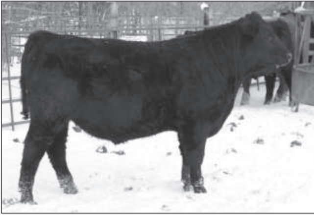
Blacktop Matrix 9778 - Lot 36