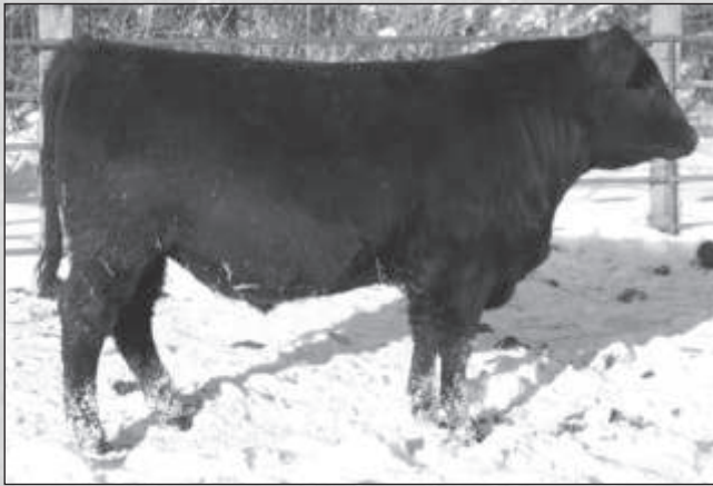
Blacktop Final Answer 9788 - Lot 10

* Soggy, deep ribbed bull. WWR 107. Top 2% WW. Top 4% YW. Heifer bull. * Great calf out of first calf heifer.