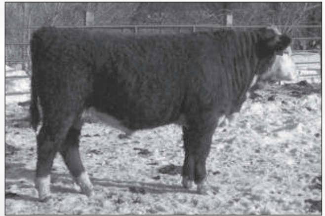
Blacktop Addition 9055 - Lot 57