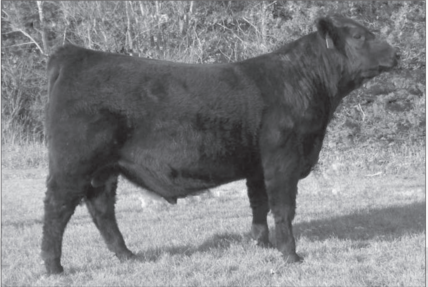
Blacktop Windy 9618 - Lot 1