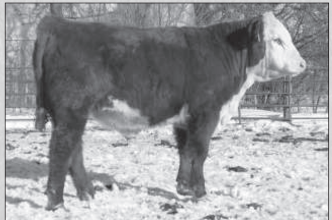
Blacktop Milsap 9243 - Lot 56

* Stout, easy-moving Milsap son. A favorite dam with 5 BWR 96, WWR 105.5, YWR 104.