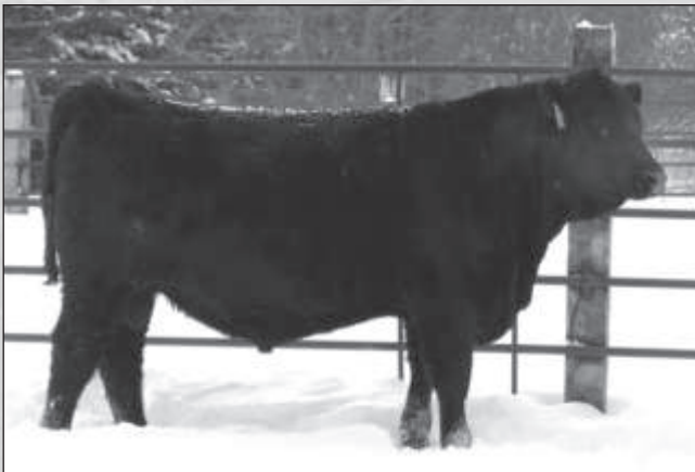
Blacktop Matrix 9773 - Lot 37

* Dam has 7 WWR 98 with 4 IMF 101 and 4 RE 105. Maternal great-grandmother of high-selling bull in 2009. Very deep-sided with eye appeal.