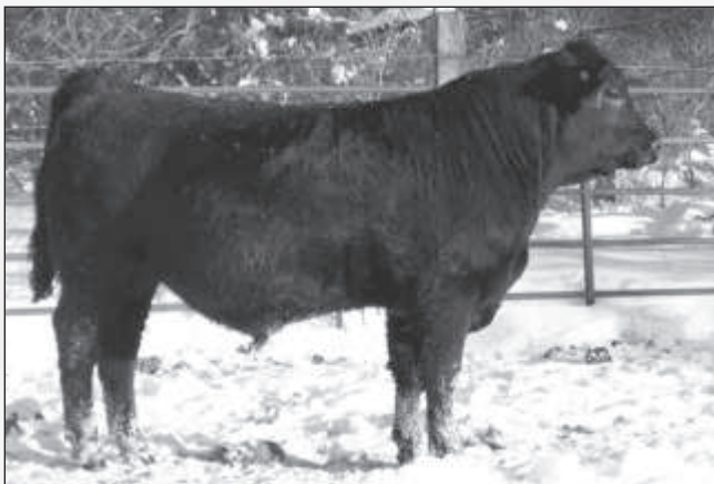
Blacktop Thunder 9508 - Lot 41