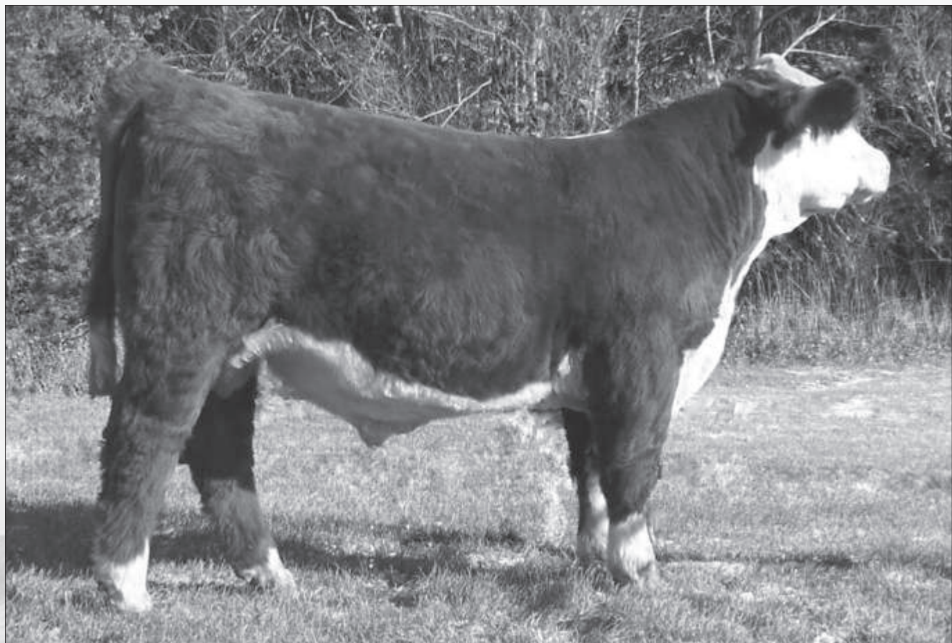
Blacktop Online 49 - Lot 6

3 BLACKTOP ONLINE 19 HEREFORD Birth Date: 2-26-2009 Bull P43017921 Tattoo: 19 * Tag #501.