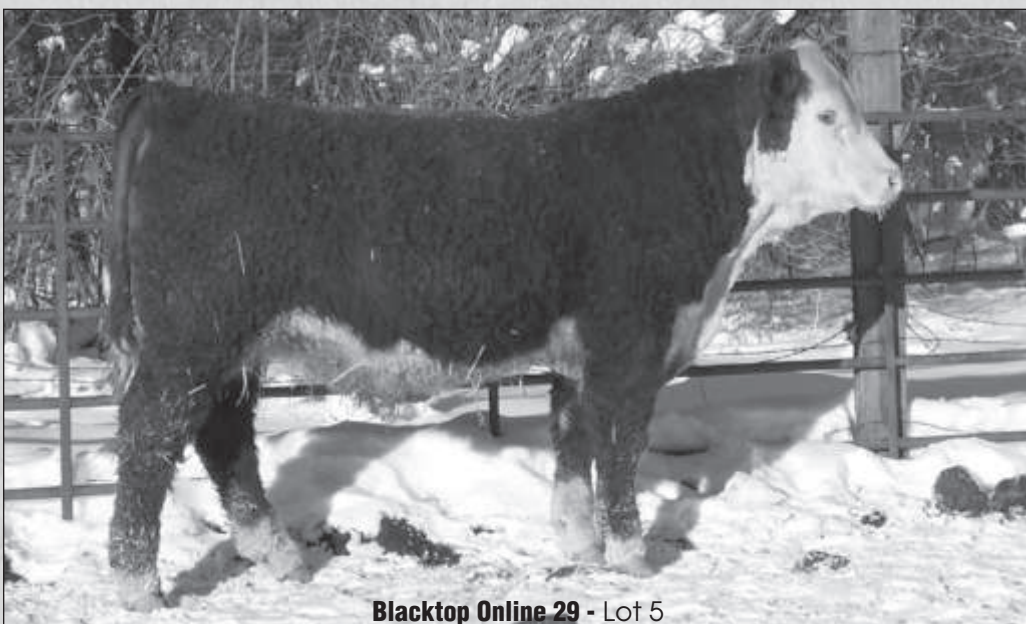
Blacktop Online 29 - Lot 5