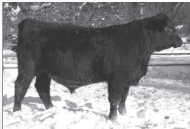
Blacktop Moneymaker 9073 - Lot 33