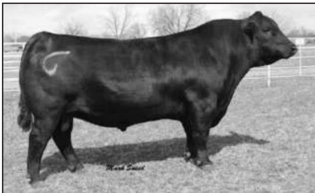
Connealy Thunder - Sire of Lot 15A.