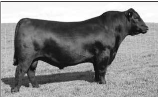
SAV Bismarck 5682 - Sire of the calf that sells with Lot 10.

From the heart of our spring herd. Here is a chance to get in on the front side with all the demand for SAV Bismarck 5682 offspring. Top sellers at the recent SAV sale were by Bismarck. Cow due to calve at end of March 2010 to Bismarck. Here is a cow that is bred right with a calf that will be outstanding.