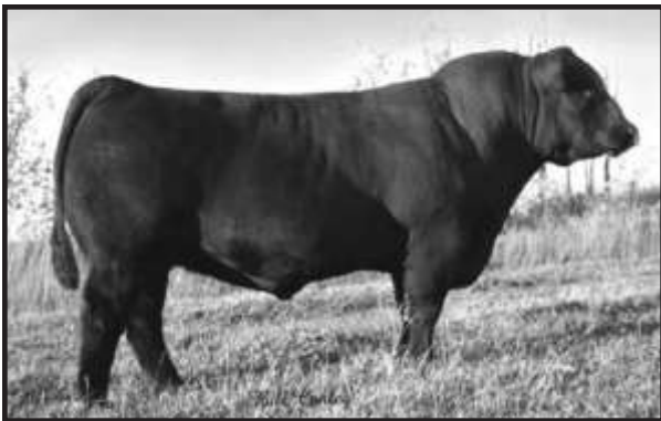
BC Marathon 7022 - Sire of Lots 7 and 8.