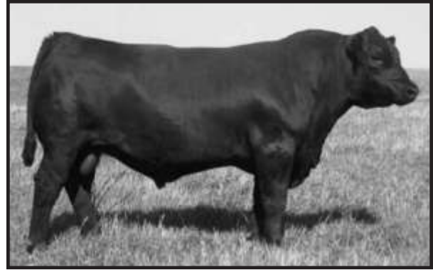
GT Shear Force - Sire of Lots 34 and 35.

This cow family traces to the dam of EXT, New Design 323 and the powerful Wendy 508. GT Shear Force is part of the ABS sire lineup.