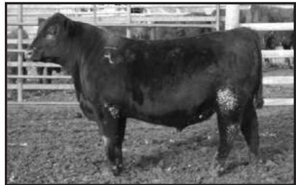
Ayres i BULL 239 - Lot 58