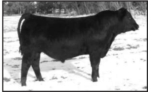
K Bar D K-Nine 9W - Lot 52

Top 15% WW, top 25% YW, top 25% $G, top 25% $B.