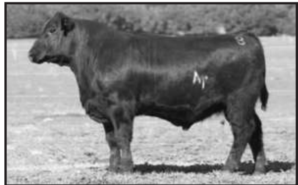
Tex Beau 4259U - Lot 12

VAR Unique Pride 5118 was a foundation donor female for Holiday Ranch who also won championship honors at the Senior Cow Palace. 5118 is the base of the Pride cow family. Heifer bull candidate. NH test results pending.