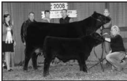
Gohr Blackcap 6177 - Dam of Lot 28 in Louisville, KY.