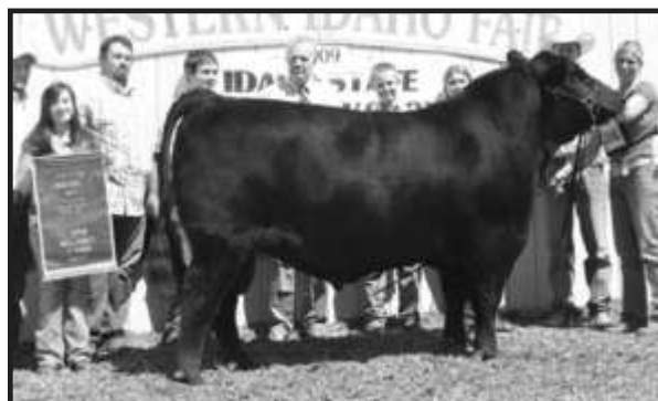
Gohr Super Sport 0771

Top 10% WW, top 4% Milk, top 15% $G, top 25% $B. Another Maximus son out of an awesome maternal cow. Two full brothers to the dam of this bull were the Champion Pen of Bulls at the Oregon Select Bull Sale in Hermiston, Oregon.