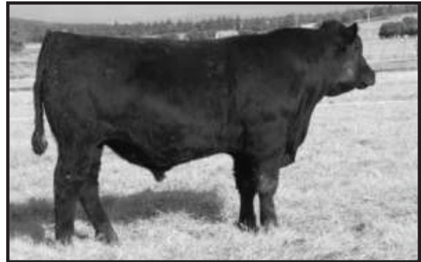
Ankonian Deluxe 9382 - Lot 78