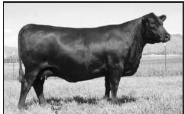
Roth Forever Lady 2631 - Dam of Lots 79-81 and the high-selling bull in the 2007 Holiday Ranch Bull Sale.