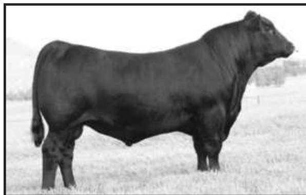
Ankonian Hal 7070 - Sire of Lots 84 and 85.