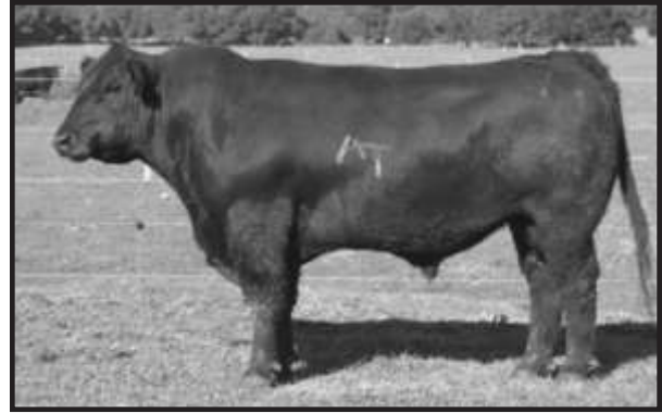
Tex Truth - Lot 46