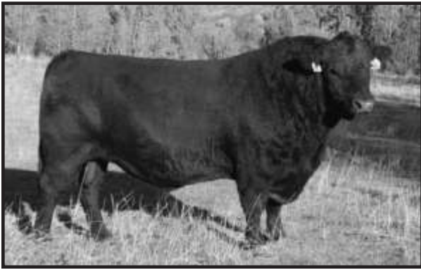
LCC New Design G054L - Grandsire of Lots 7 and 9.