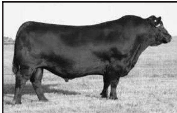
SAV 8180 Traveler 004 - Grandsire of Lot 76.