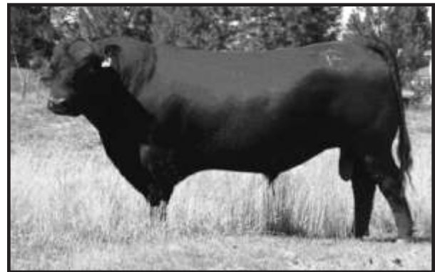
Holiday Improver 3033 - Sire of Lots 1-5 and Lots 66-70, and grandsire of Lots 71-75.