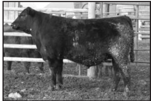
Ayres Power Transition 619 - Lot 63

Top 5% WW, top 10% YW, top 10% Milk, top 25% RE, top 10% $F.