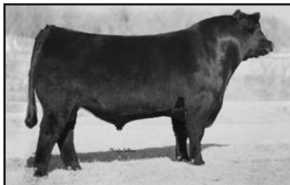
Northern Improvement 4480 GF - Sire of Lot 77. A deceased Holiday Ranch herd sire.