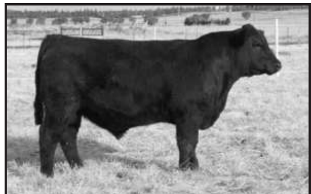
Ankonian Pendleton 9472 - Lot 81