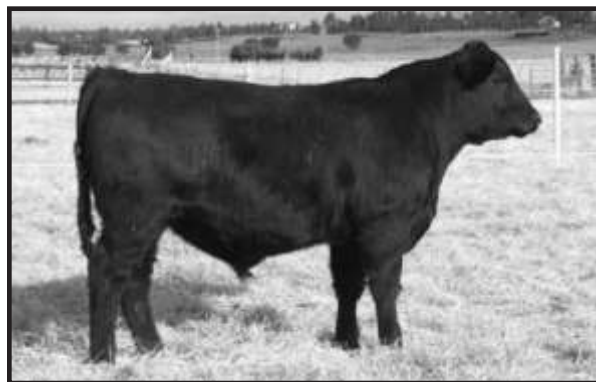
Ankony 9467 - Lot 82

Son of the elite $B sire Holiday Destination 5216, the high-selling bull in the 2007 Holiday Ranch Performance Plus Bull Sale.