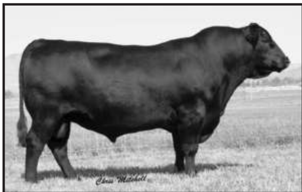
Holiday Destination 5216 - Sire of Lots 82 and 83.

Heifer bull candidate. Great combination of Rishel and Holiday genetics, sired by Ankonian Hal, the high-selling bull in the 2008 Holiday-Ankony Bull Sale.