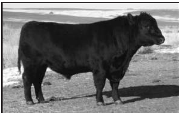
Holiday Midland 6198 - Second high-selling bull in the 2006 Holiday Ranch Bull Sale. Sire of Lots 71-75.

Top 15% WW, top 30% YW. Dam is a first calf heifer.