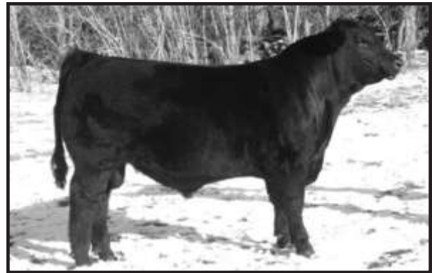
K Bar D Strut 5W - Lot 51