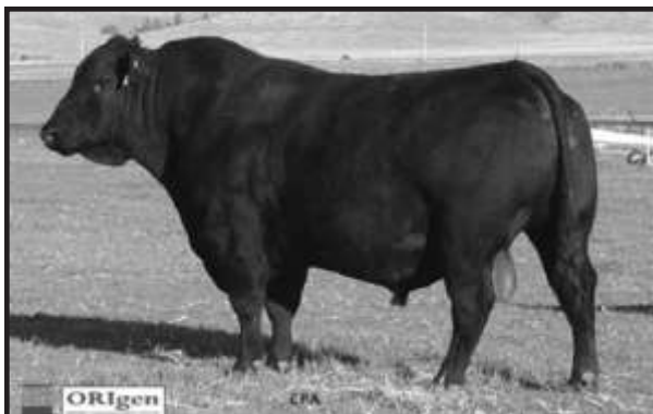
Pascalar Ayres New View P310 - Member of the ABS/ORigen sire line-up and sire of Lots 54-56.

Top 25% RE. Yes, a herd bull candidate from Ayres Angus.