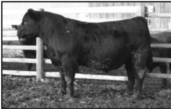
Ayres Huey Lewis 38 - Lot 62