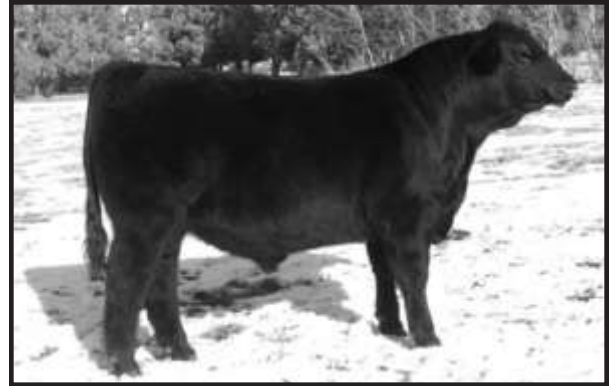
K Bar D Onset 6W - Lot 50