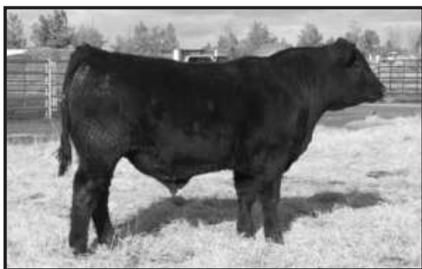
Ankony Destination 9469 - Lot 83

B-R New Design 323 genetics will add value to all segments of the beef cattle industry. BW 88 lbs., WW 602 lbs., weaned on 9-4-09.