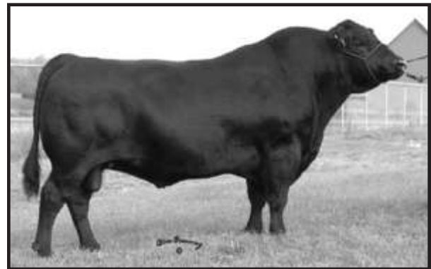
GAR Yield Grade - Sire of Lots 22 and 23.