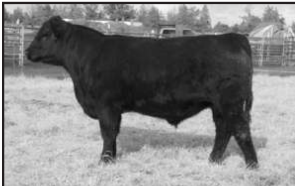
Ankonian Pendleton 9461 - Lot 79