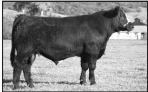
Tex Macho 179 - Lot 47