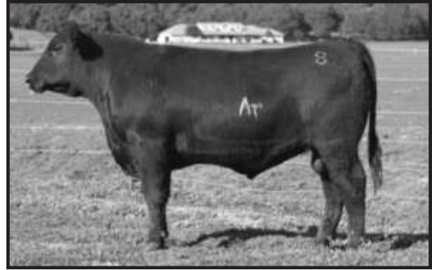
Teixeira 6187 - Lot 10

290J was the top-selling bred heifer in the 2003 Beartooth Ranch production sale selling to Hal Schudel and LaGrand Angus.