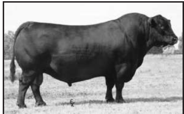
SAV Final Answer 0035 - Sire of Lot 37.

Final Answer is increasing in popularity as a sire who puts shape and muscle into his offspring.