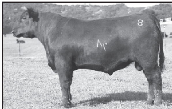
Tex Future Direction 309 24 - Lot 20

Two families of powerful Rishel genetics, 095 and 722. No wonder the carcass genetics are so strong. Heifer bull candidate. NH test results pending.