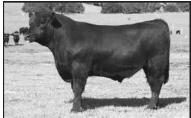
TEX Sid 2061U - Lot 13