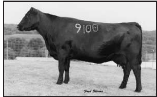
TC Peg 9100 - Grandam of Lot 44.