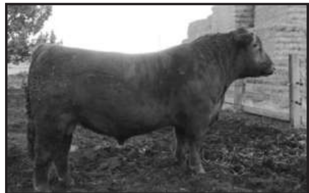
NCAR General Lee 816U - Lot 42

A high volume, big footed, big boned bull with lots of rib. He has excellent carcass numbers, yearling wt. 1,324 lbs. Red Angus two-year-old.