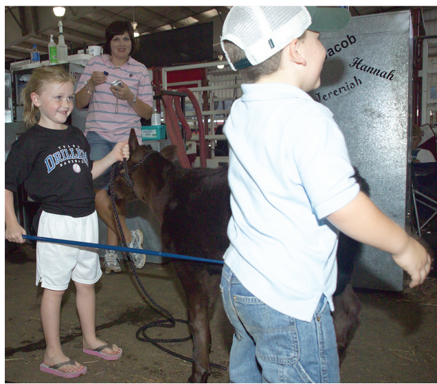
Slapping the champion