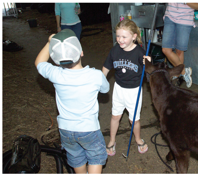
The winning handshake