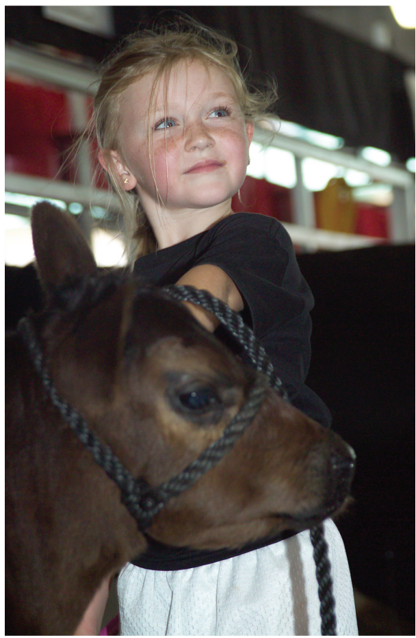
All eyes on the judge