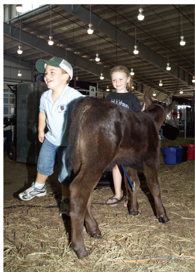
The judge moves around the calf.