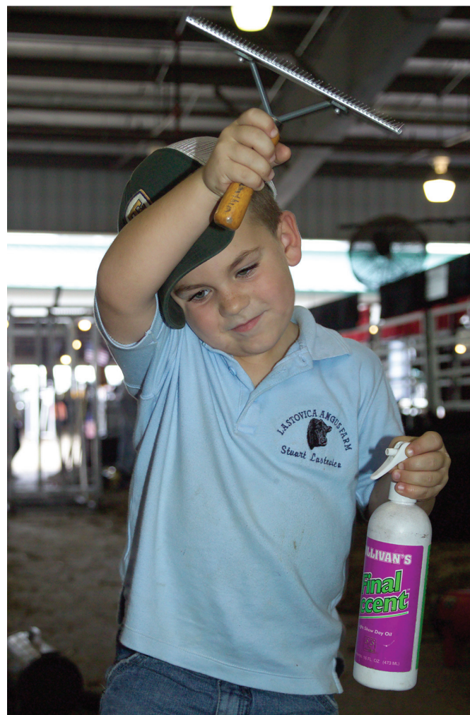
After a hard day's work