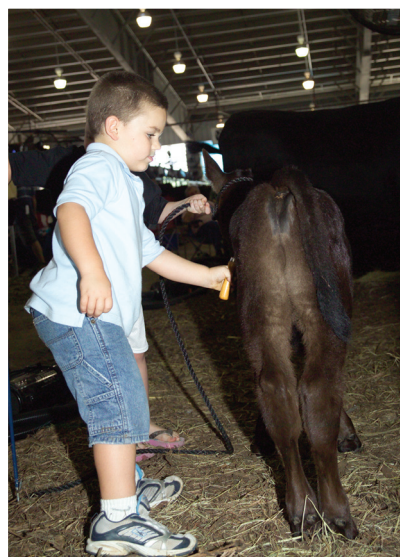
Missed a spot