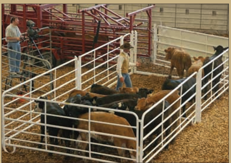
► Curt Pate says the biggest obstacle to low-stress handling is a time-starved handler trying to make things happen too fast.

"Working cattle shouldn't be something you dread," Pate admonishes. "Why can't it be fun? It should be."