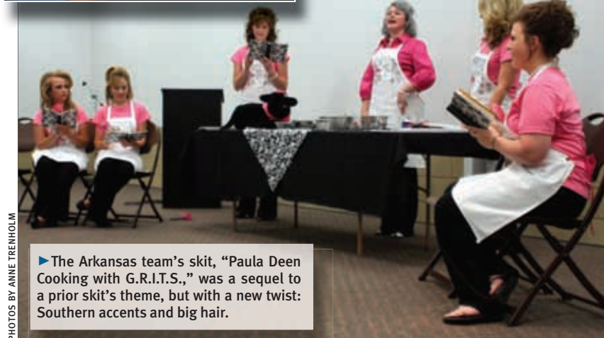
▶ The Arkansas team’s skit, “Paula Deen Cooking with G.R.I.T.S.,” was a sequel to a prior skit’s theme, but with a new twist: Southern accents and big hair.