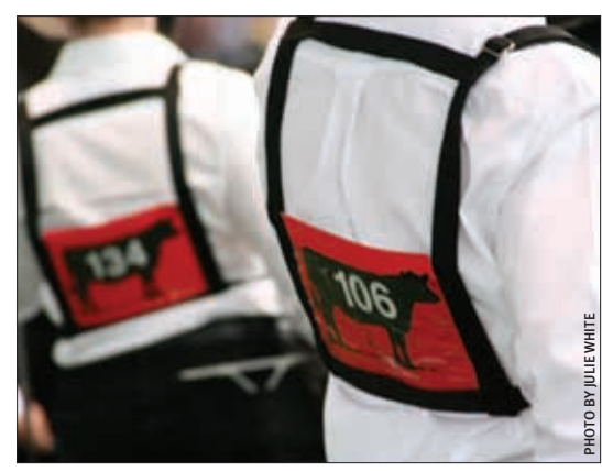
► Forty-six competitors were judged on skill, ability to follow instructions, use of equipment, courtesy, sportsmanship and general appearance.