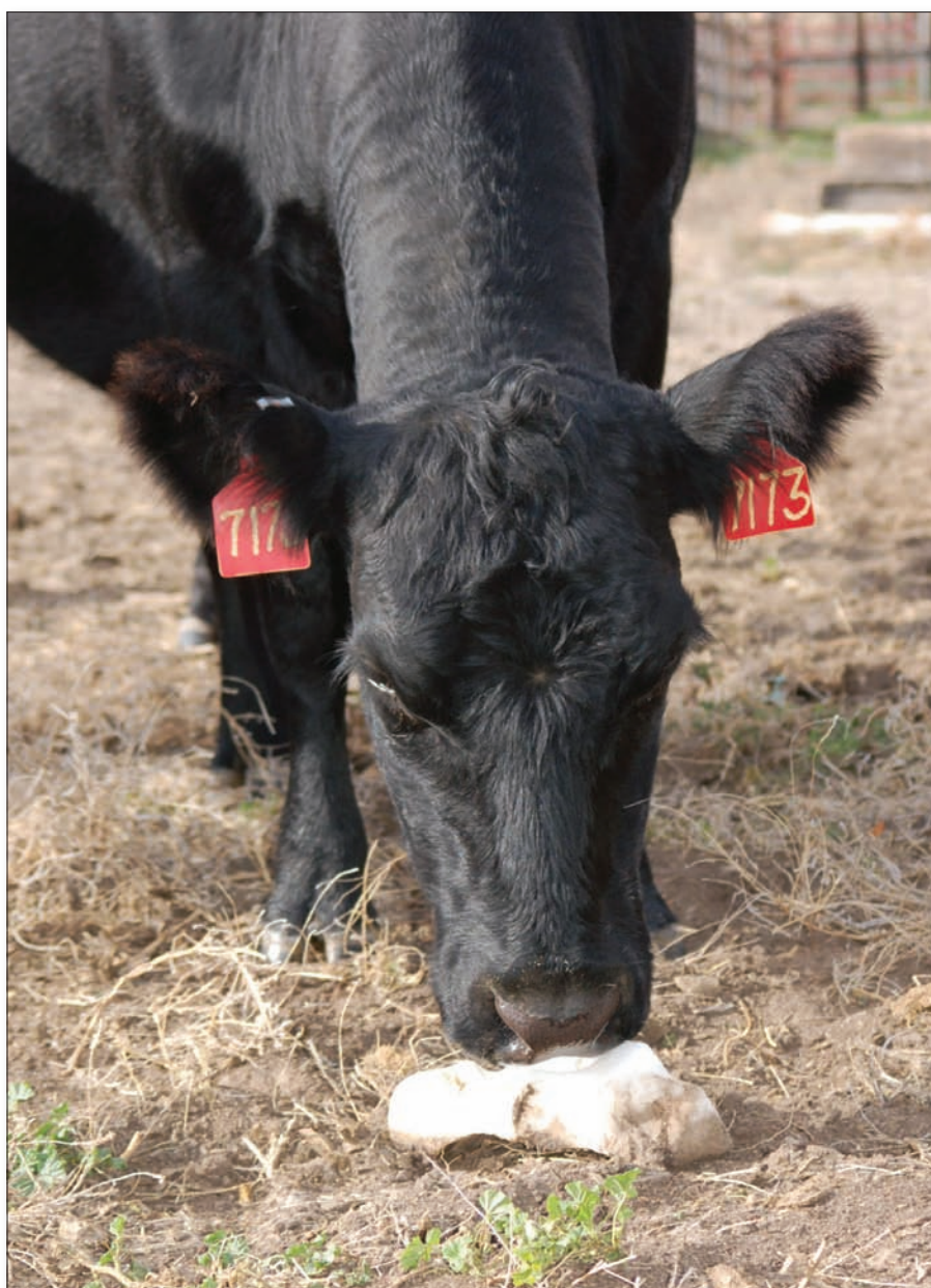
► Studies have shown that diets containing as much as 10% salt have not hampered digestion, as long as ample drinking water was available. However, salt toxicity can be a real danger if cattle do not have access to ample water or if the water contains minerals that inhibit consumption.