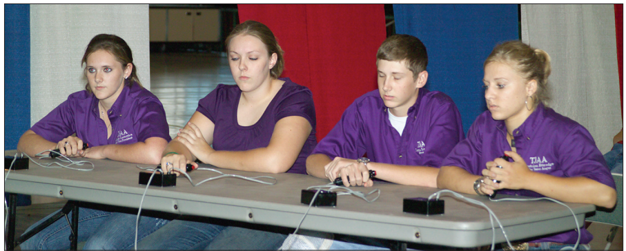
► Below: The four Texas teens listen intently to a question being asked by the moderator.