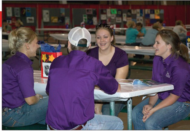
► Left: The team talks while waiting to be called for their first quiz bowl round.