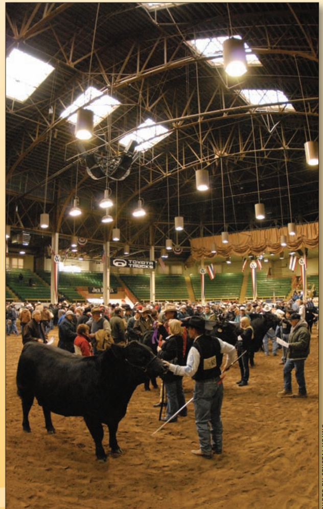
► After Thursday's Bull Sale Show, everyone had an opportunity to get a closer look at the bulls and visit with consignors.