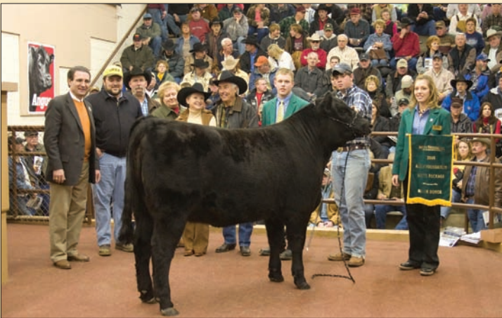
► MJB Ranch, Weatherford, Texas, purchased the 2008 Angus Foundation Heifer Package.