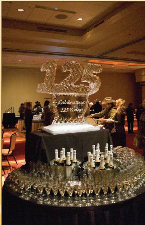
► The Angus Reception celebrated 125 years of the American Angus Association's involvement in the U.S. cattle industry.