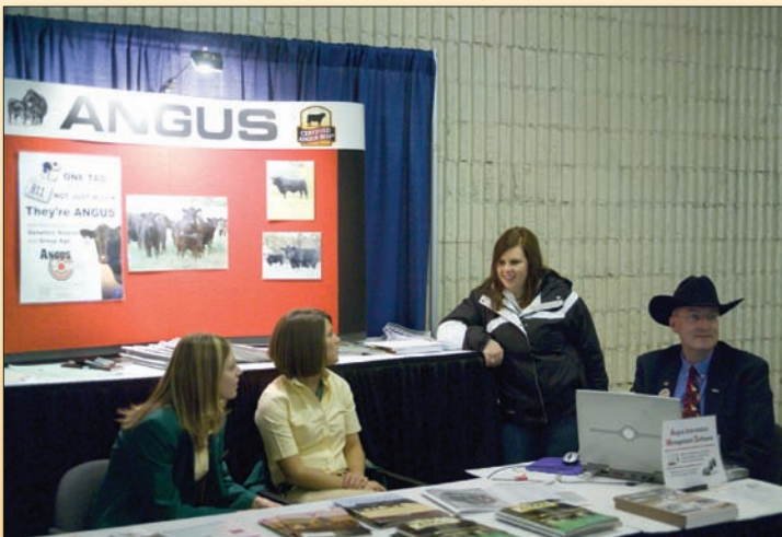
► Saturday was the first day for the Angus booth on the Hill. From the booth, American Angus Association staff distributed literature and answered questions.