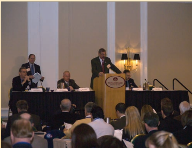
► Presenters from around the world spoke at the International Livestock Congress-USA Tuesday, Jan. 14.