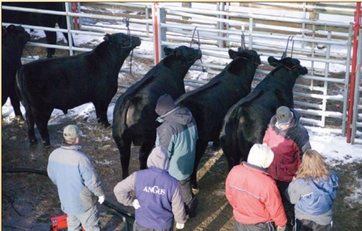
► Cold temperatures didn't stop cattlemen from enjoying the competition in the Yards.