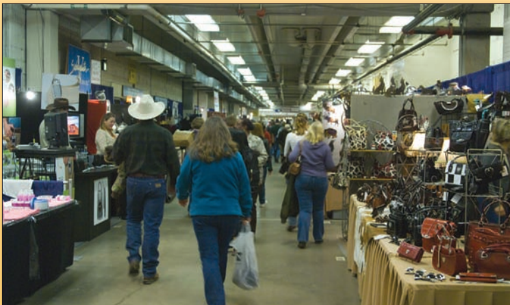
► From handbags to hats, there was something for everyone at the NWSS Trade Show.