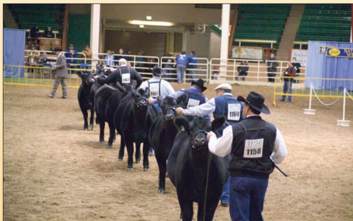
► The super-point ROV show began on Wednesday with the female show.